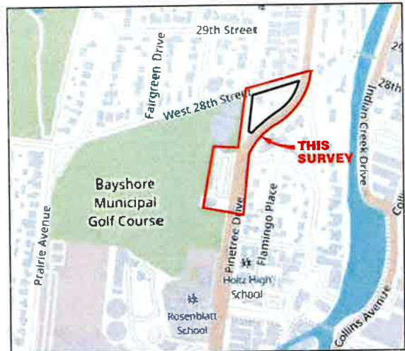
LOCATION MAP CITY OF MIAMI BEACH MIAMI-DADE COUNTY, FLORIDA NOT TO SCALE