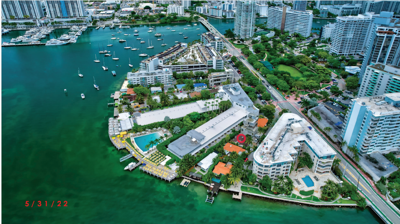
SOUTHWEST AERIAL VIEW OF BELLE ISLE & VENETIAN CROSSWAY