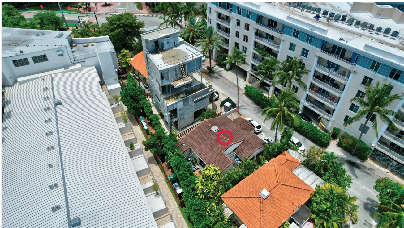
AERIAL SITE VIEW 02