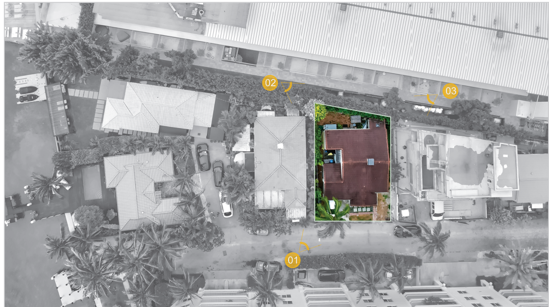
KEY DIRECTIONAL PLAN