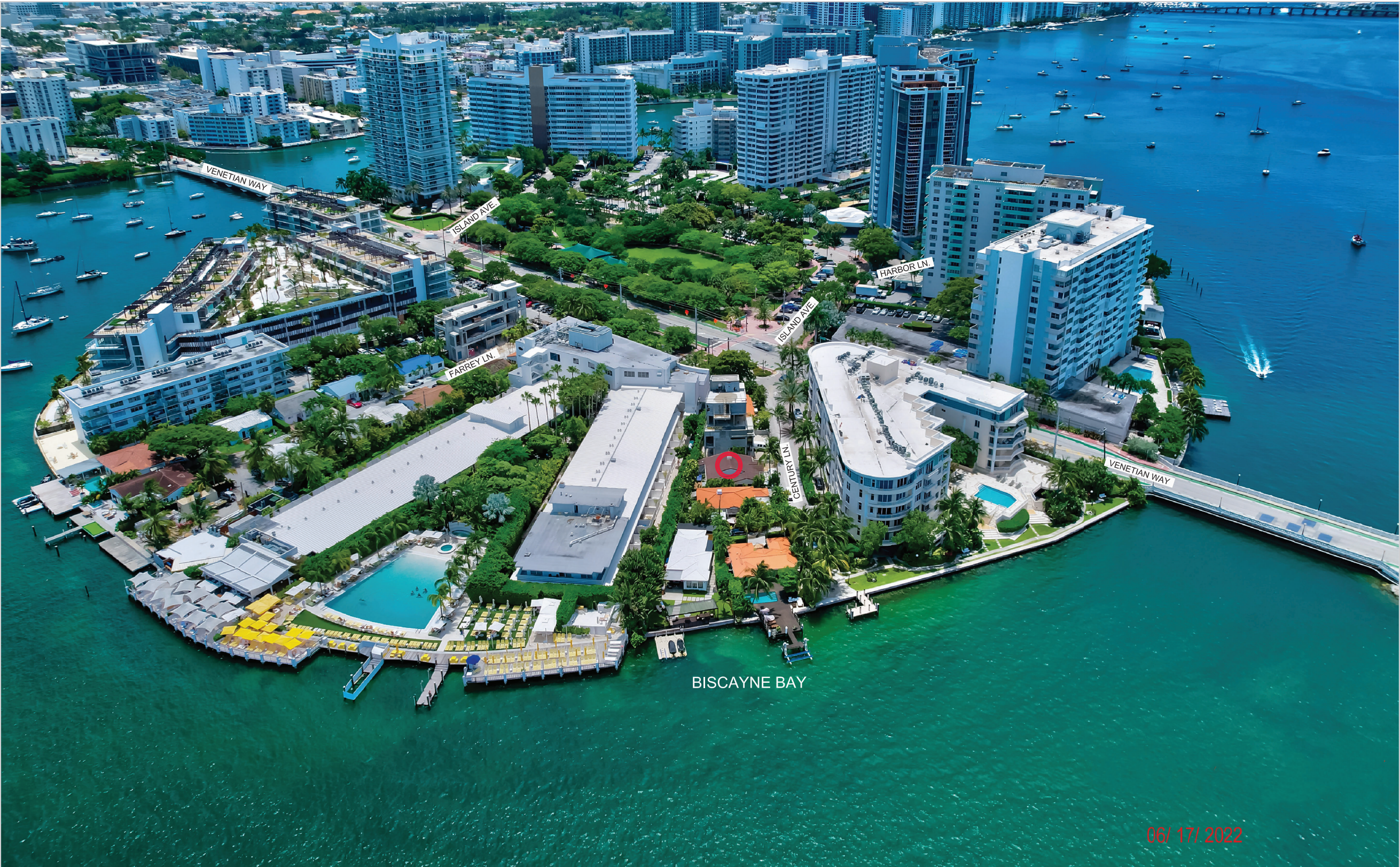
AERIAL VIEW OF BELLE ISLE & VENETIAN CROSSWAY