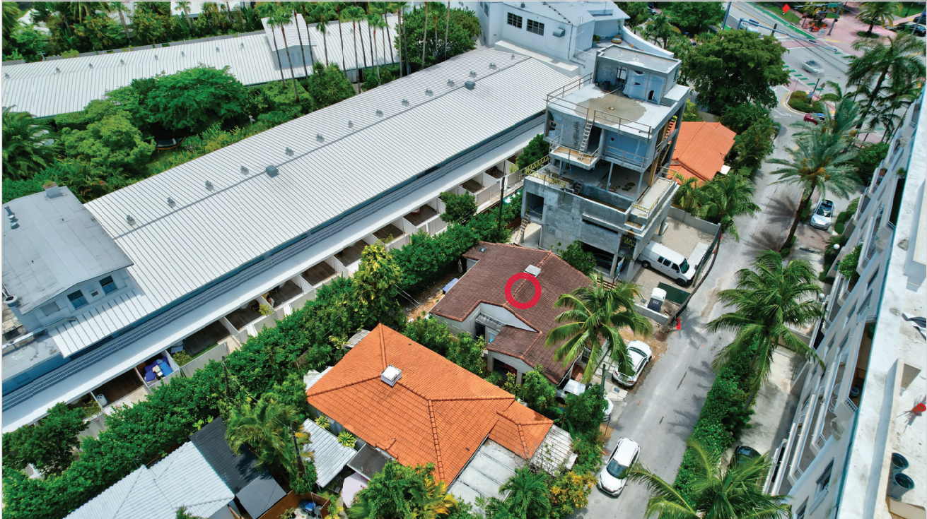
AERIAL VIEW OF SITE & SURROUNDINGS