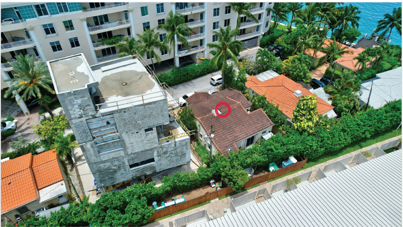
AERIAL SITE VIEW 03