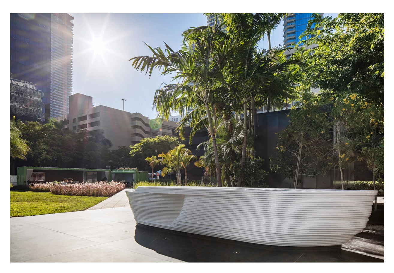
(5) Five custom made solid benches, 3 with planter addition and two entire benches.