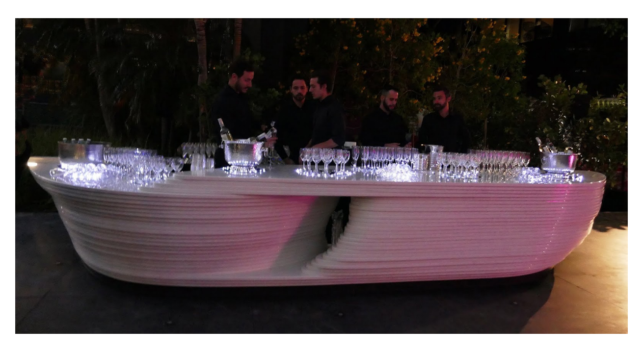
(1) One solid Marble bar/table