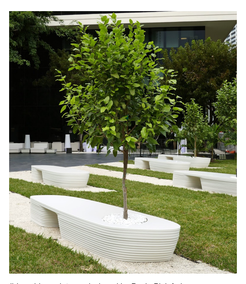
(3) Three solid marble sculptures designed by Paolo Pininfarina.