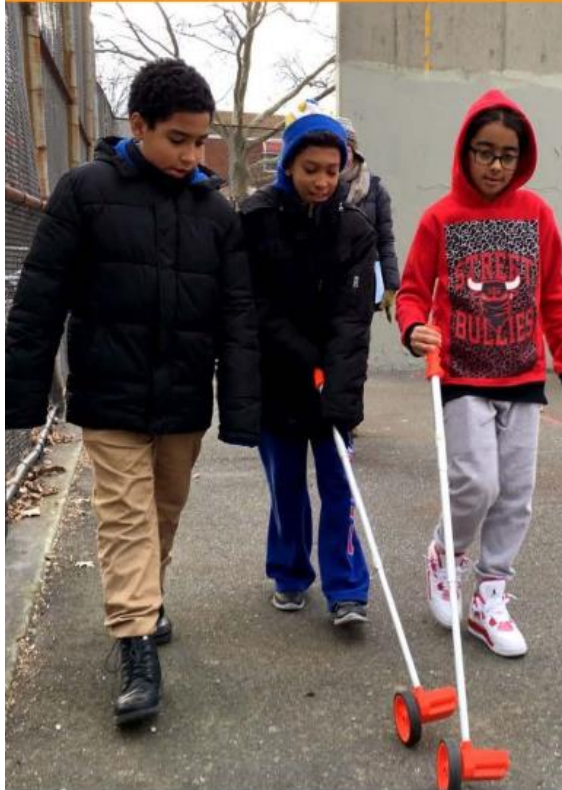
Students are at the Center of Change