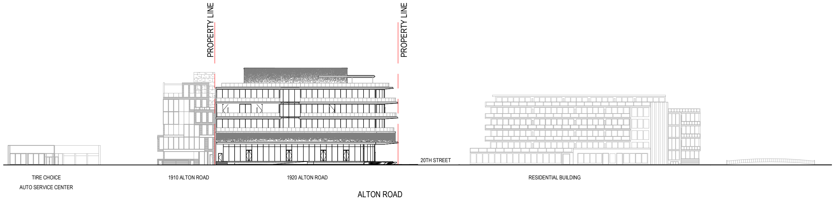
1 Context Elevation - East SCALE: 1" = 50'-0"