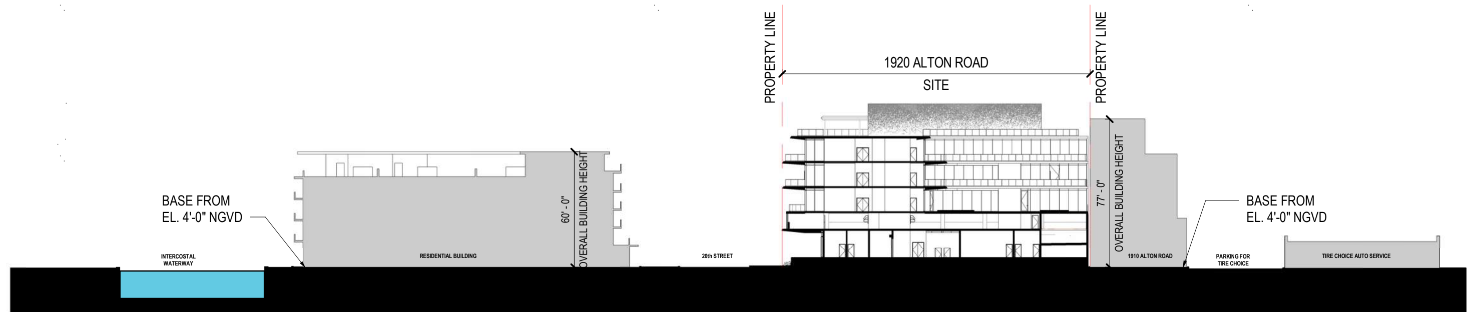
1 Context Section SCALE: 1" = 50'-0"