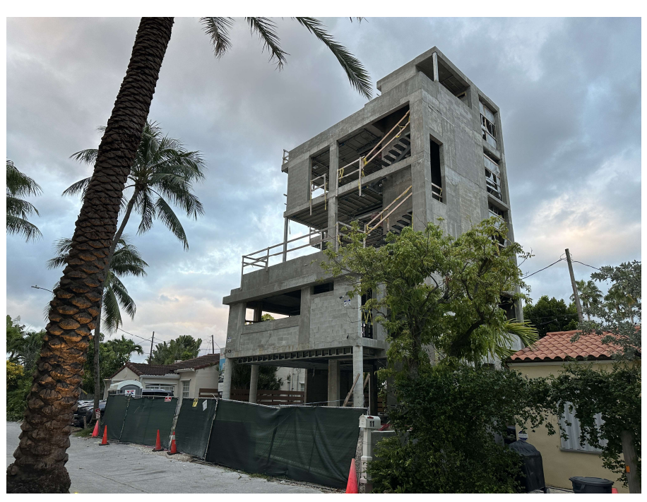
After more than 2 years of construction....