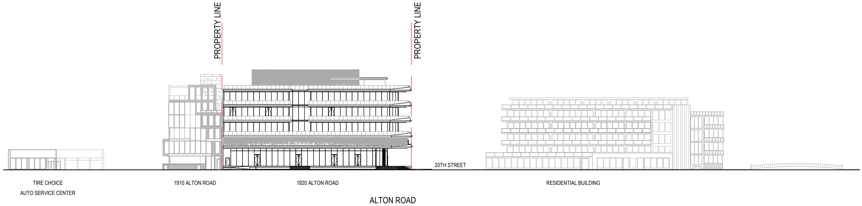
1 Context Elevation - East SCALE: 1" = 50'-0"