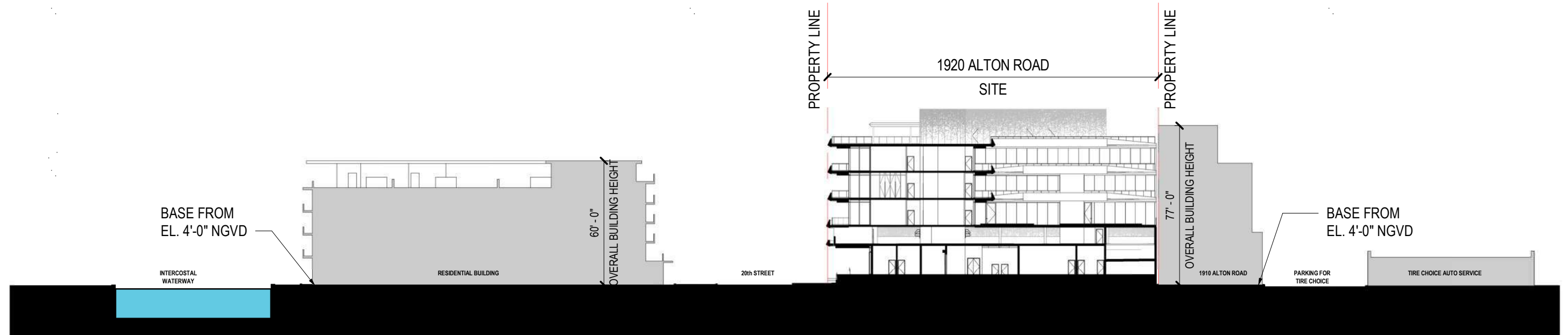
1 Context Section SCALE: 1" = 50'-0"