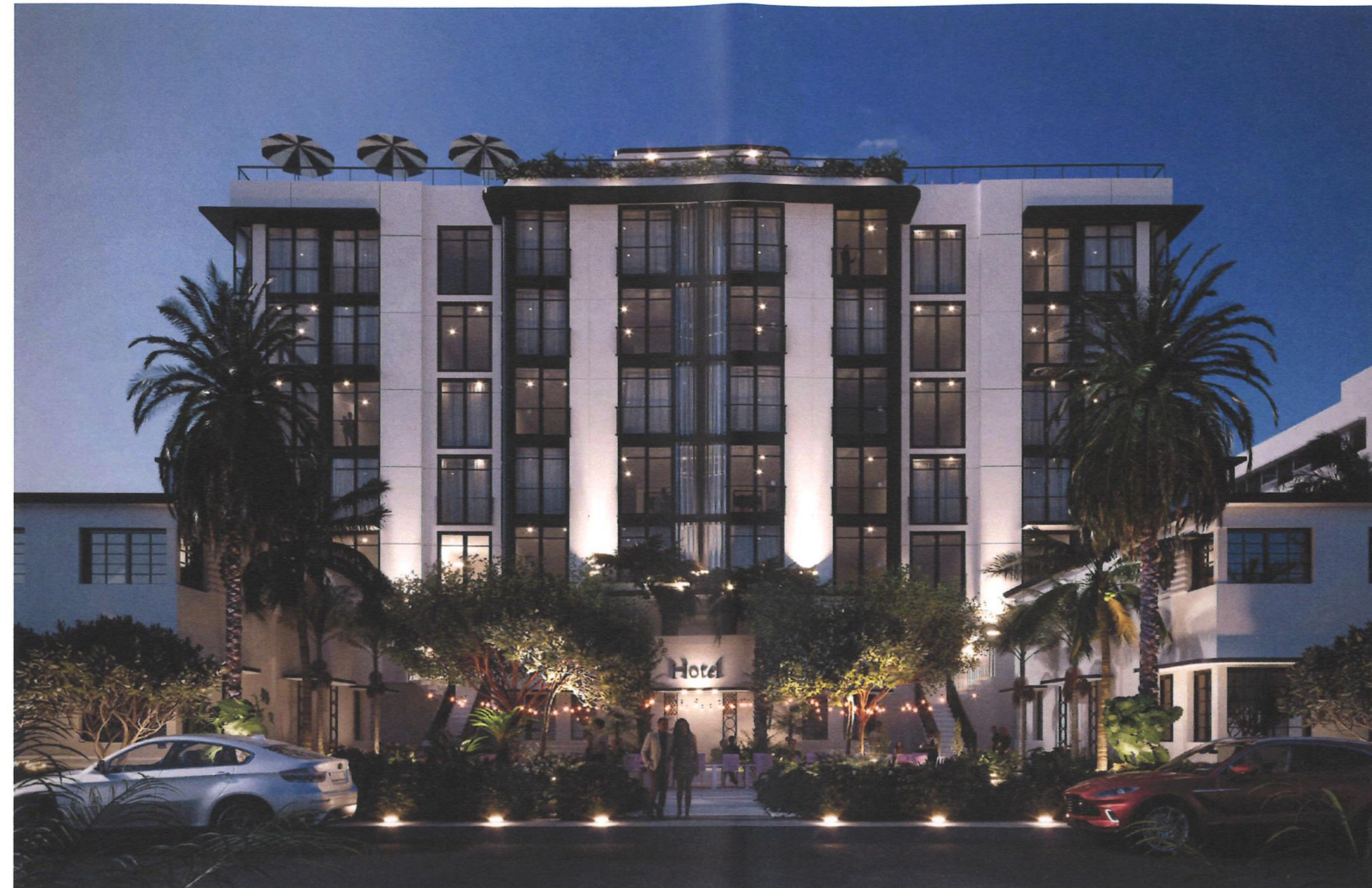
VIEW FACING SOUTH ON 6TH STREET-PROPOSED