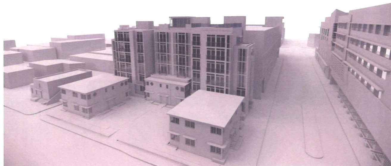
BUILDING MASSING VIEW FACING SOUTHEAST