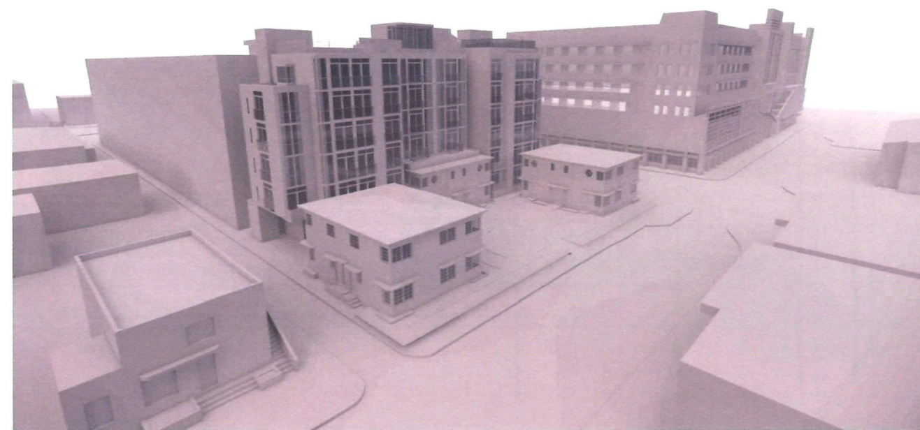
BUILDING MASSING VIEW FACING SOUTHWEST