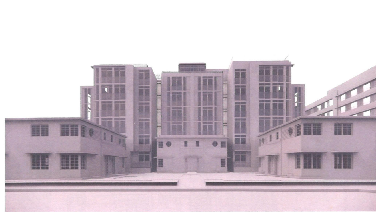
BUILDING MASSING VIEW FACING SOUTH