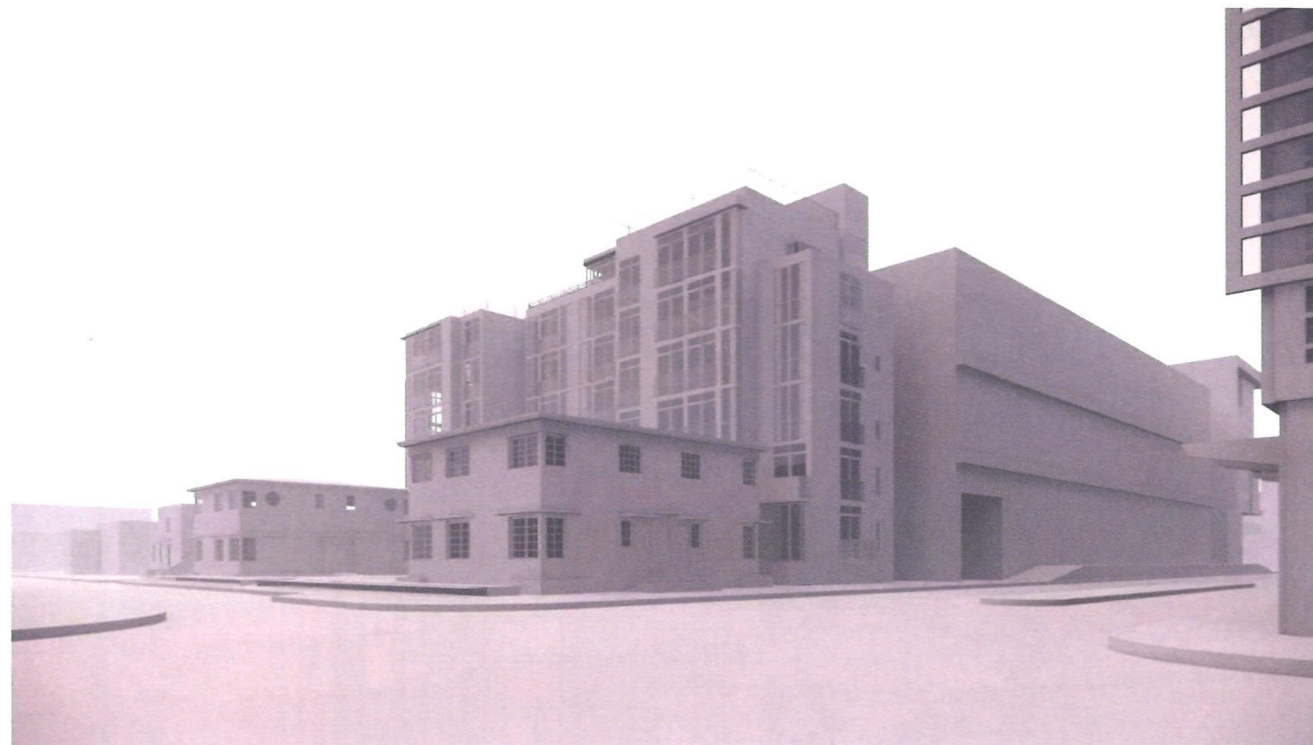
BUILDING MASSING VIEW FACING SOUTHEAST