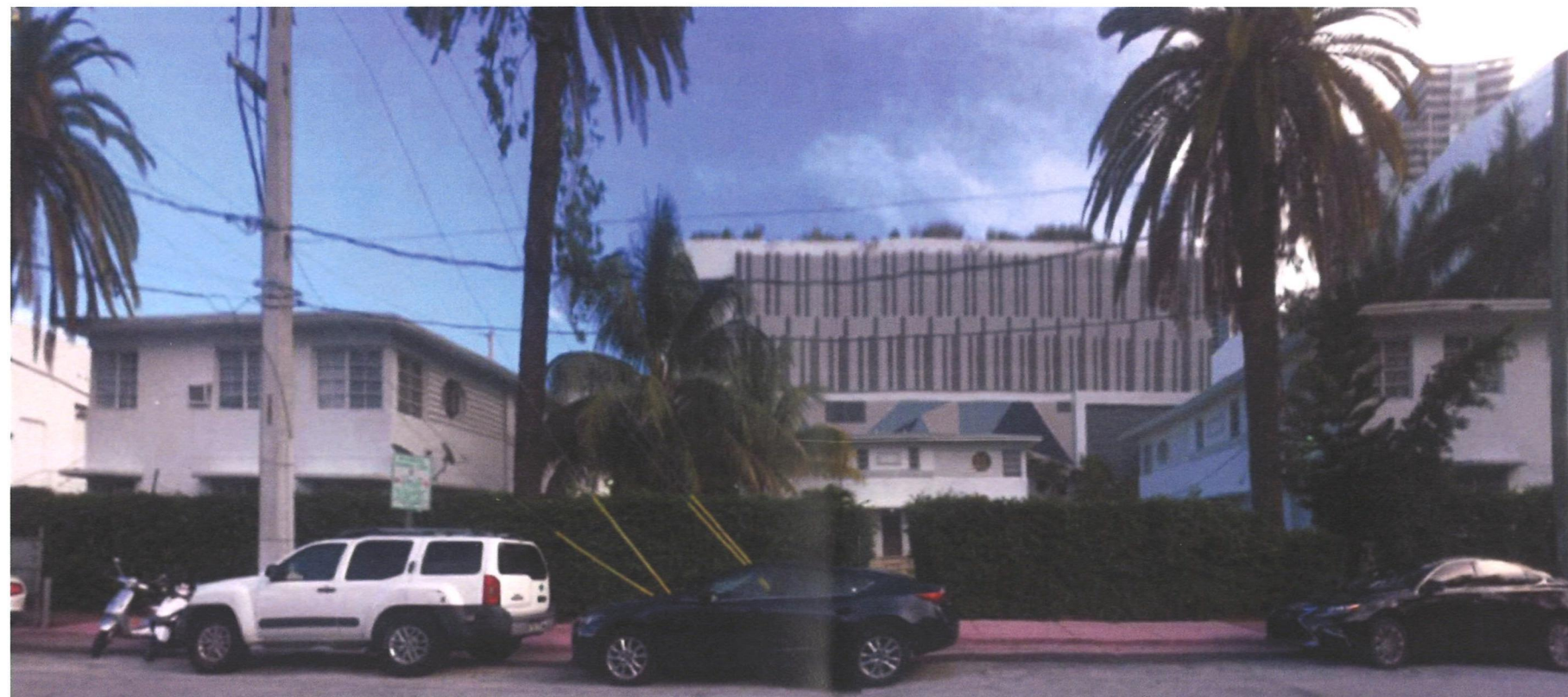
VIEW FACING SOUTH ON 6TH STREET-EXISTING