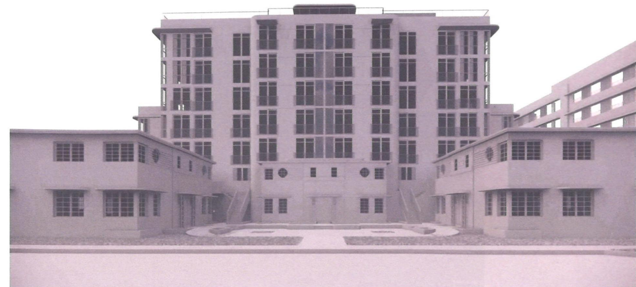
BUILDING MASSING VIEW FACING SOUTH