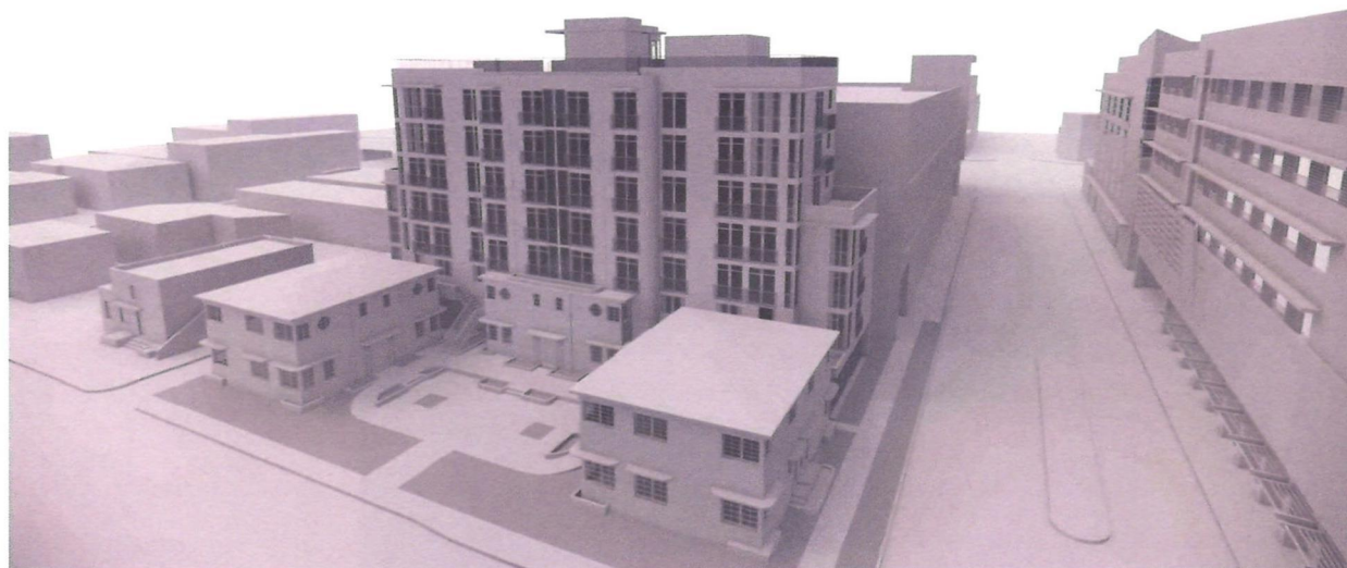
BUILDING MASSING VIEW FACING SOUTHEAST