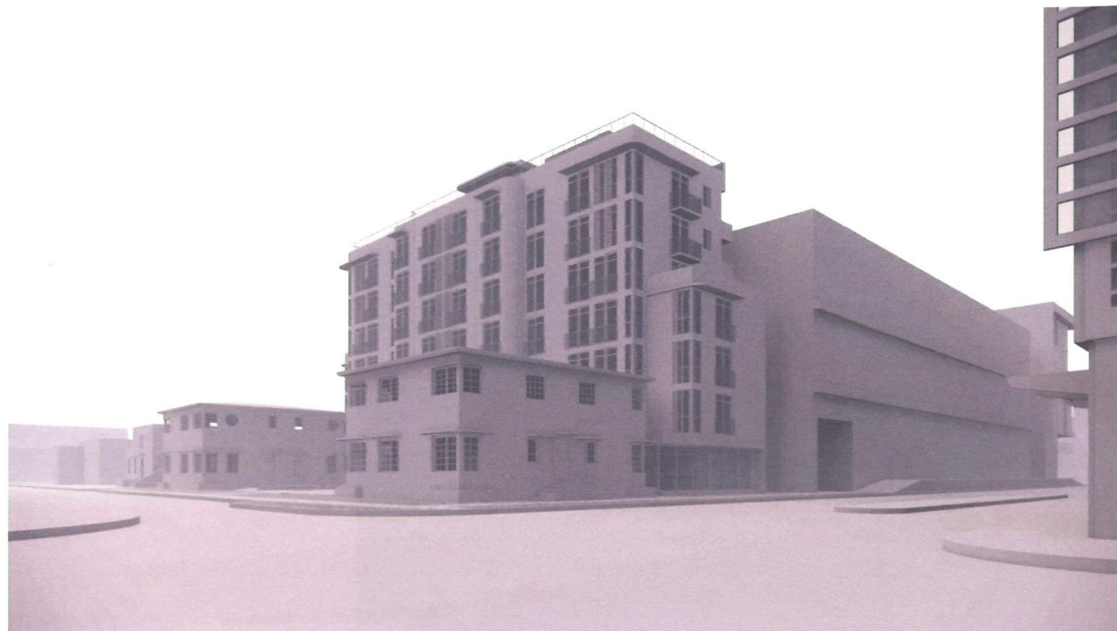
BUILDING MASSING VIEW FACING SOUTHEAST