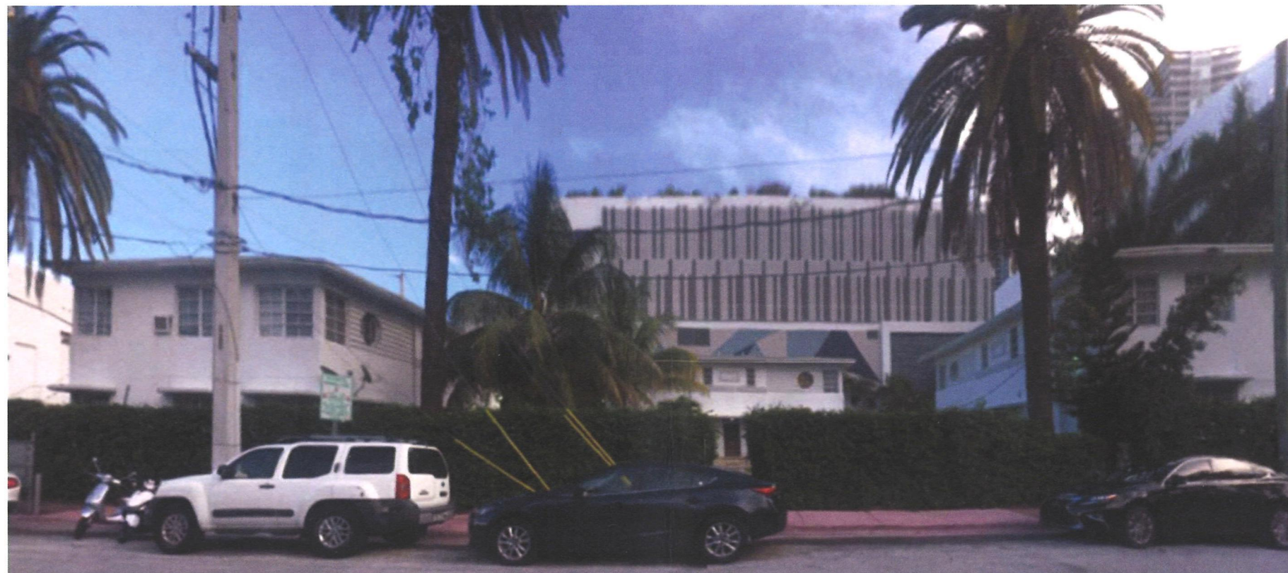
VIEW FACING SOUTH ON 6TH STREET-EXISTING