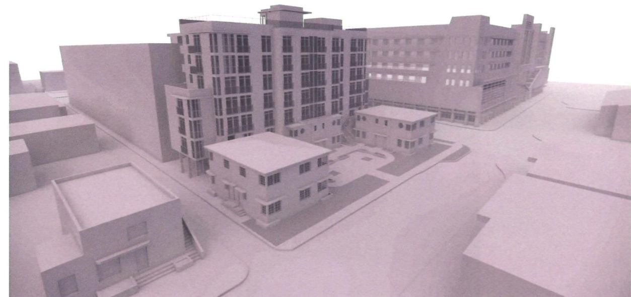
BUILDING MASSING VIEW FACING SOUTHWEST