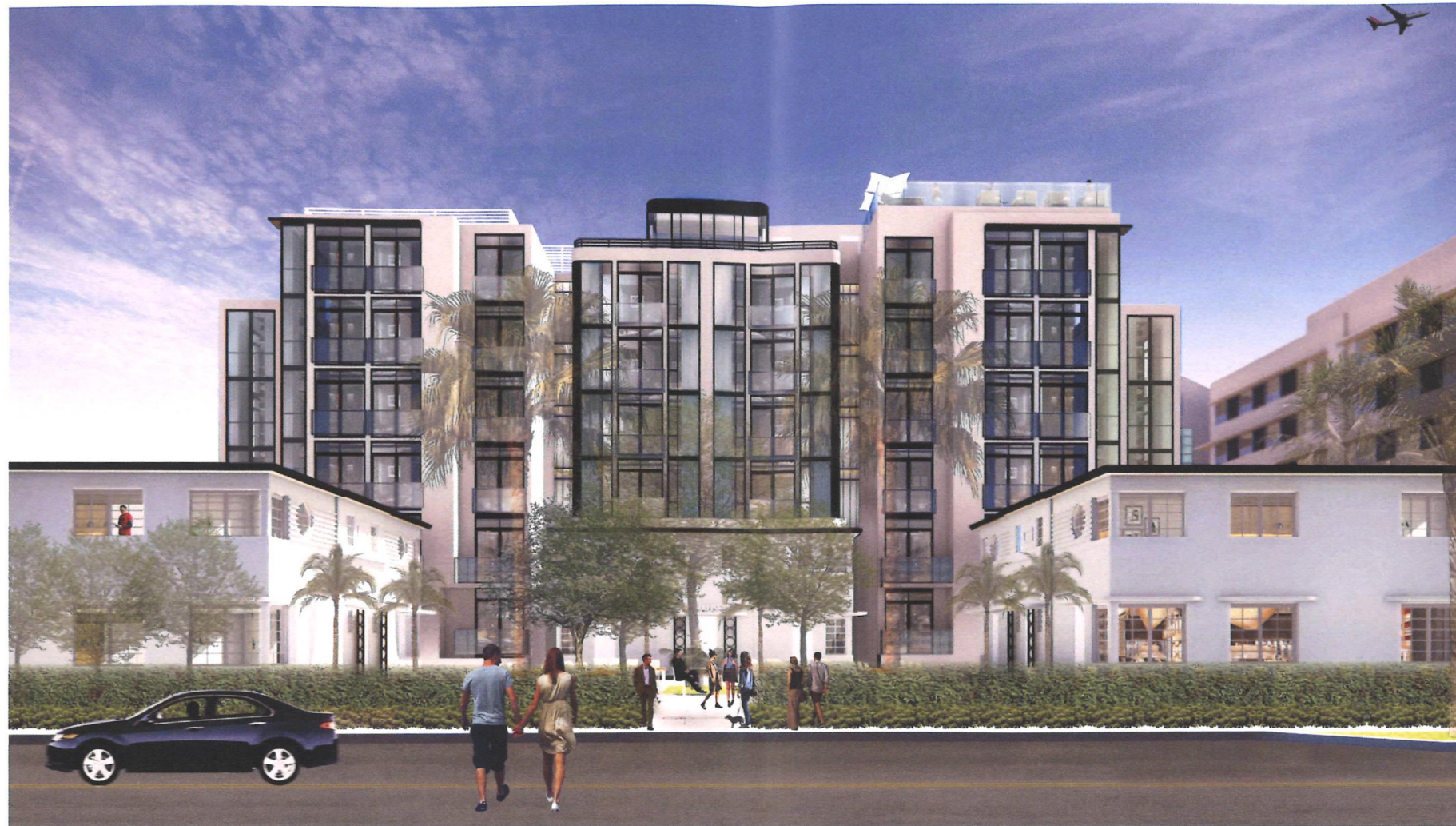
VIEW FACING SOUTH ON 6TH STREET-PROPOSED