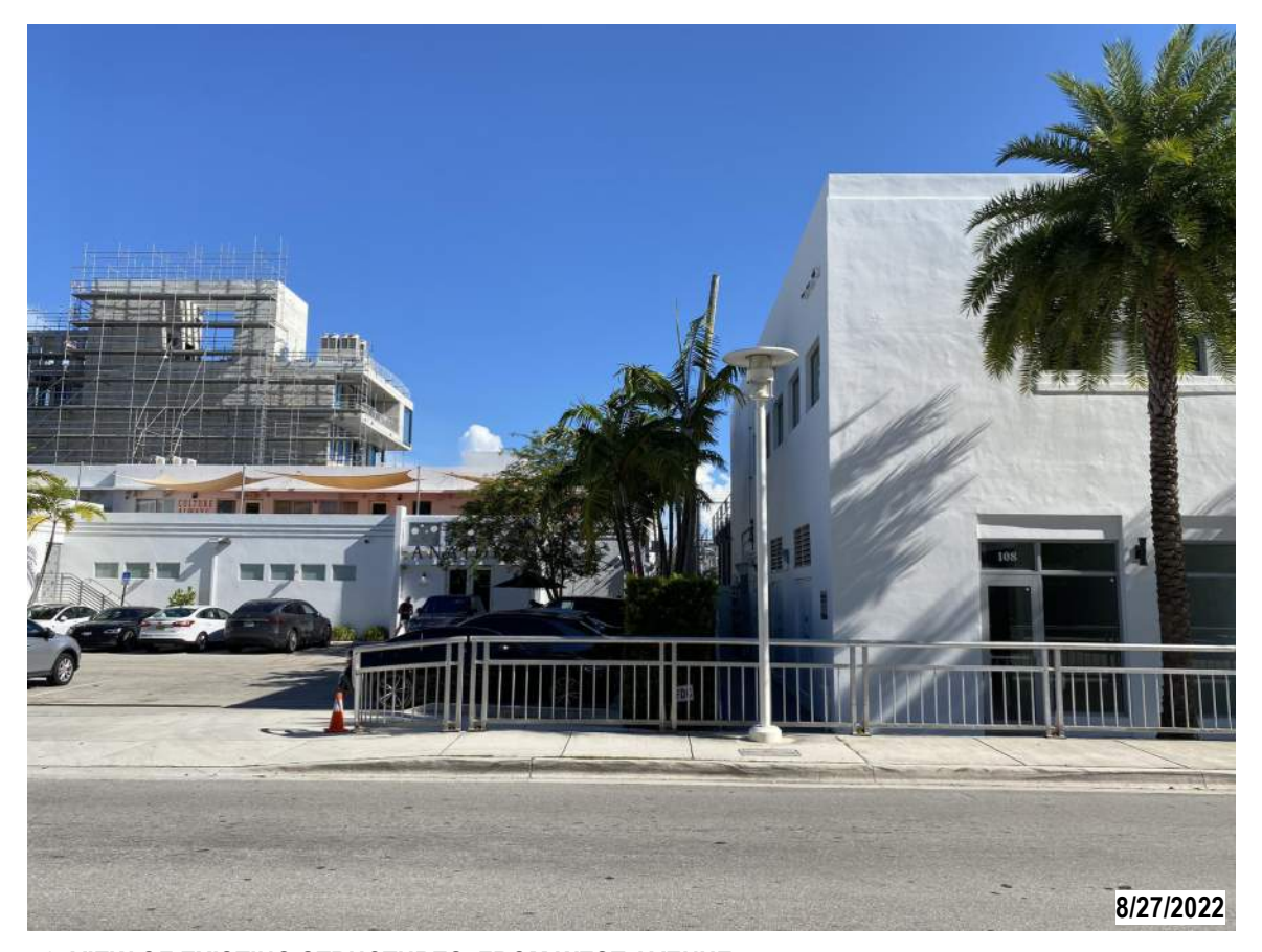
3. VIEW OF EXISTING STRUCTURES FROM WEST AVENUE

1. VIEW OF EXISTING STRUCTURES FROM ALTON ROAD