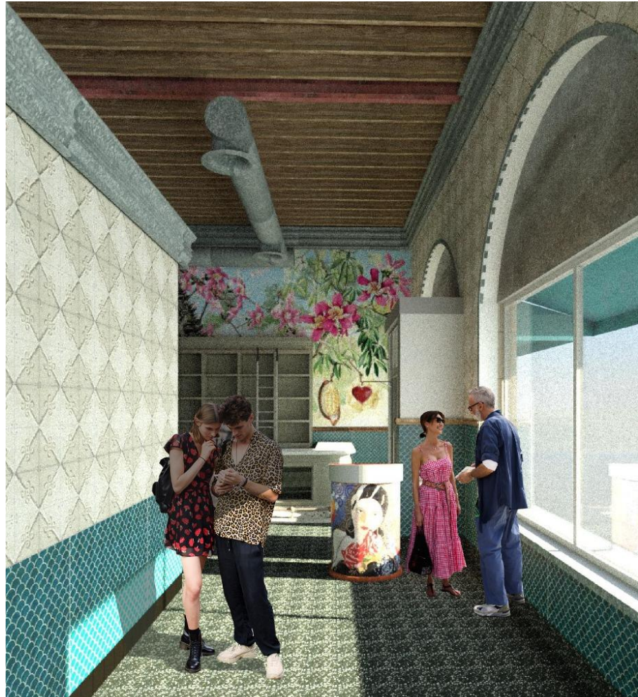
(D) PROPOSED RESTAURANT NOT TO SCALE