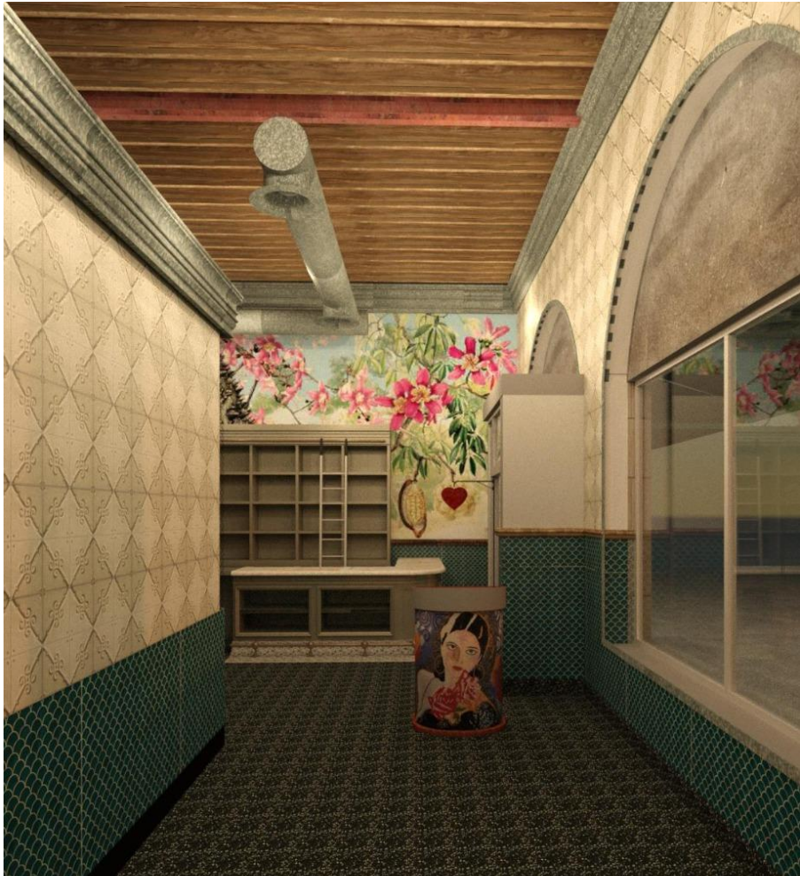
(F) PROPOSED RESTAURANT NOT TO SCALE