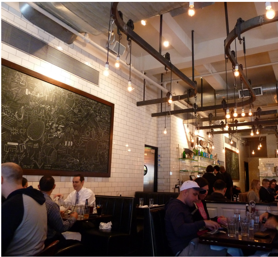
(C) EXISTING RESTAURANT NOT TO SCALE