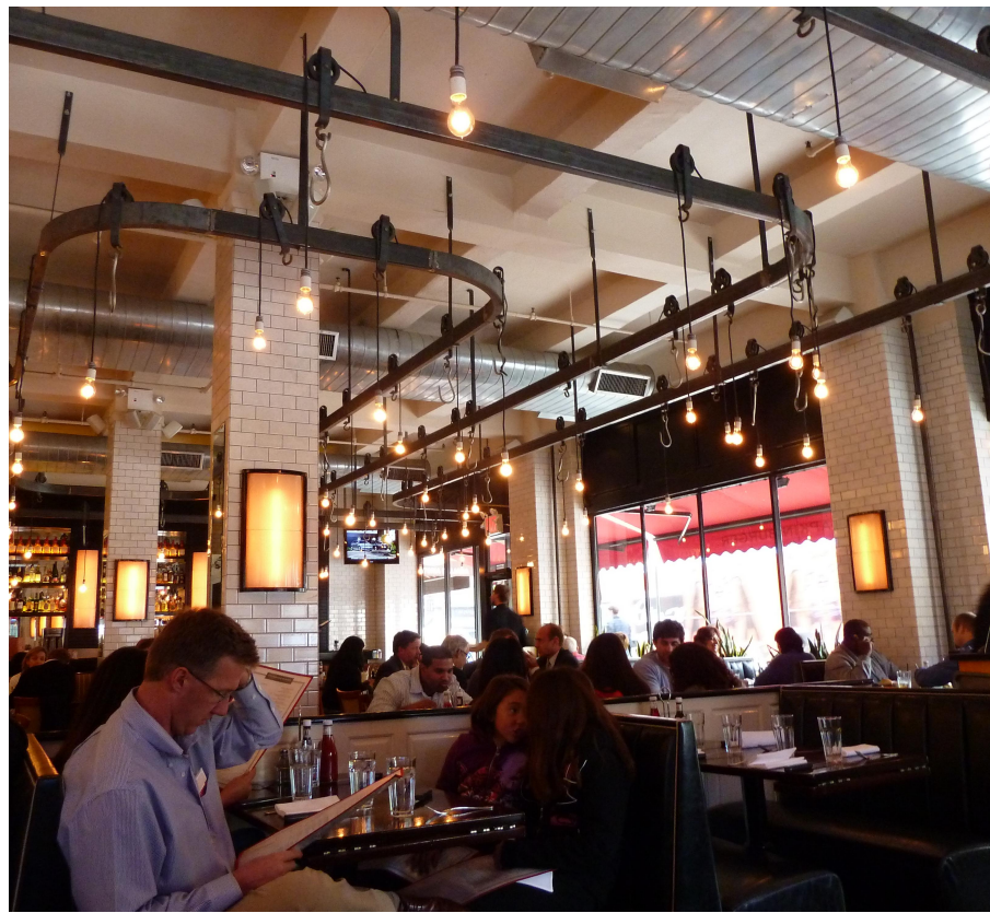
(A) EXISTING RESTAURANT NOT TO SCALE