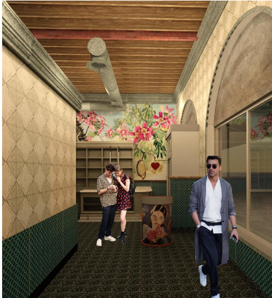
(E) PROPOSED RESTAURANT NOT TO SCALE