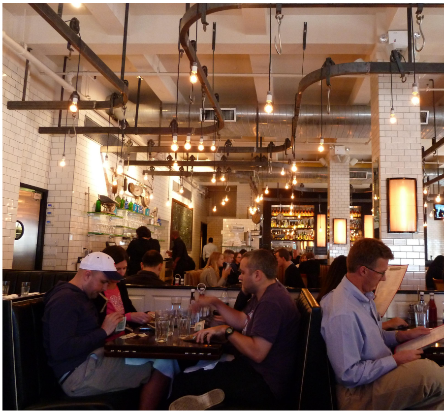
(B) EXISTING RESTAURANT NOT TO SCALE