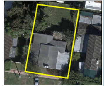
AERIAL PHOTOGRAPH (MAY NOT SHOW LATEST IMPROVEMENTS) (NOT-TO-SCALE)

NONE. RECORD INFORMATION RELIANT UPON ANGULAR DATA ONLY. ALL ANGULAR DATA SHOWN HEREON REFERENCED THERETO.