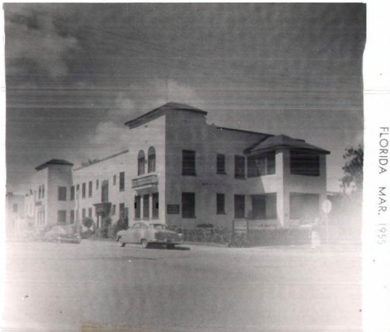
Property in 1955