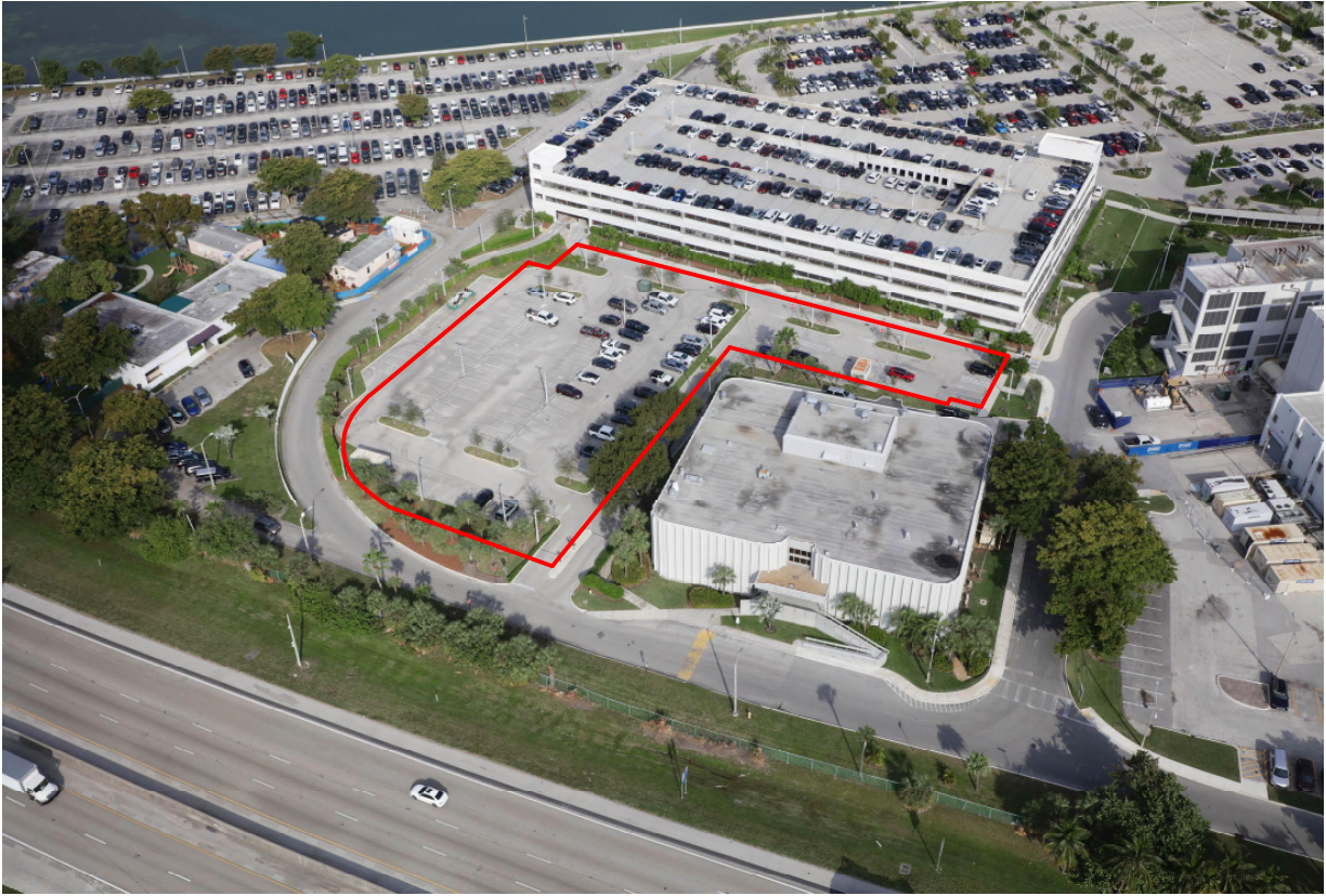
SITE VIEW FROM SOUTH