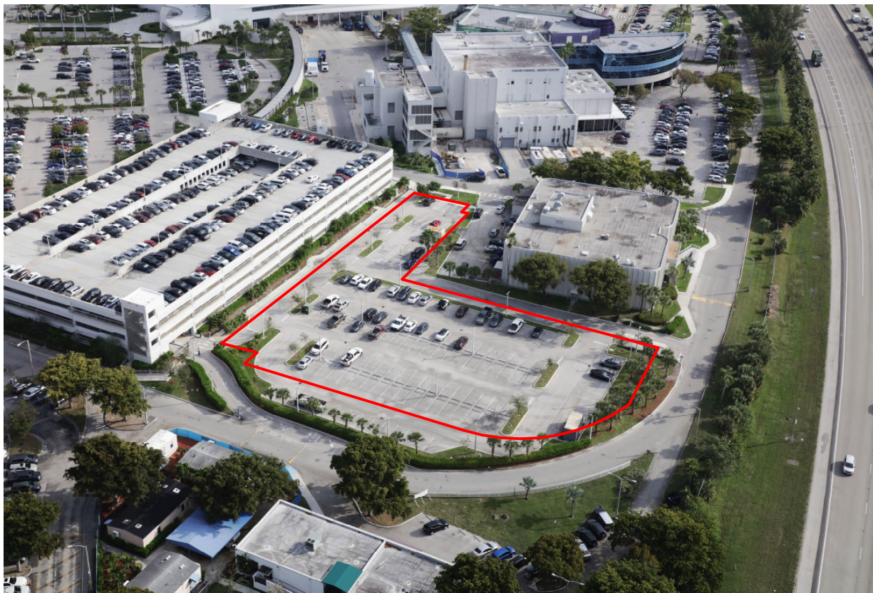
SITE VIEW FROM WEST