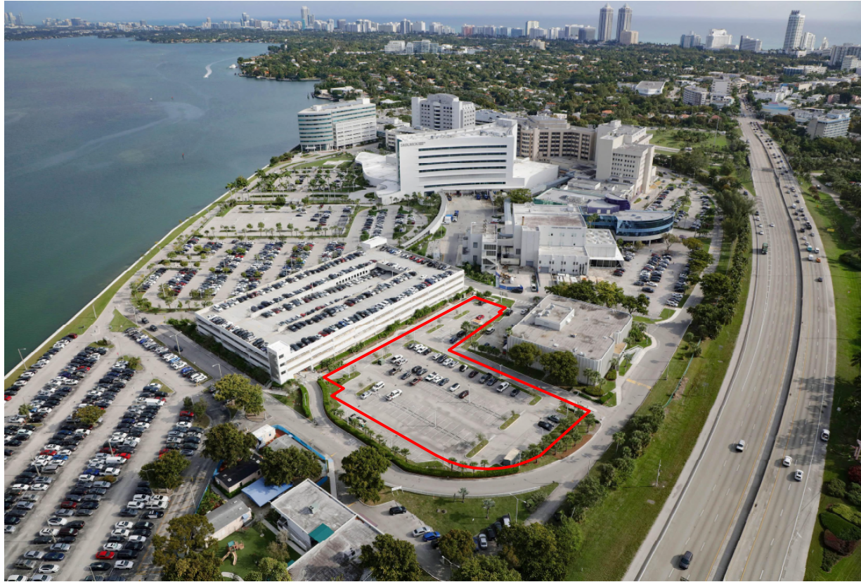
SITE VIEW FROM SOUTHWEST