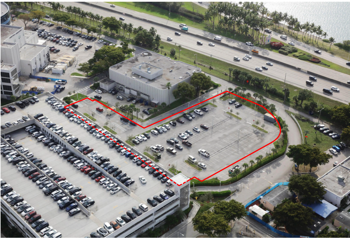
SITE VIEW FROM NORTH WEST