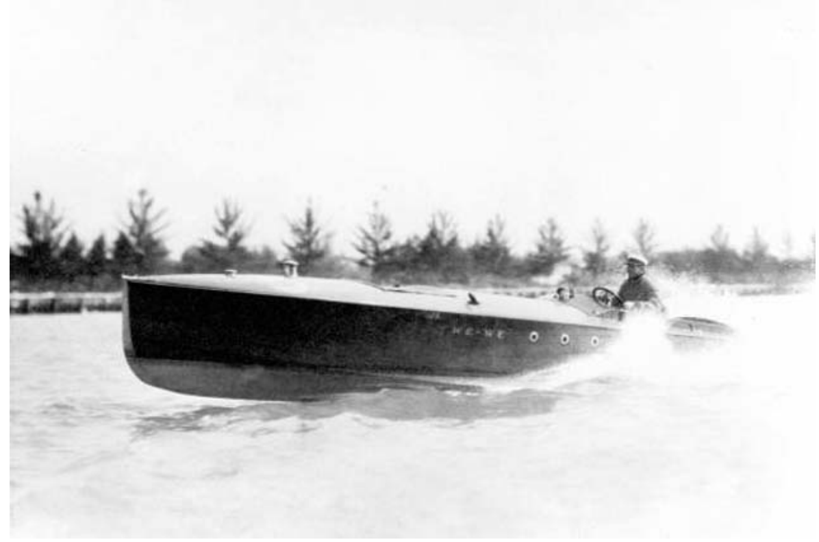
CARL FISHER ON HIS BOAT

CARL FISHER DISCOVERED THE ONCE MANGROVE BARRIER ISLAND OF MIAMI BEACH. THE PATTERN FOR THE FENCE IS THE ABSTRACTION OF MANGROVE ROOT. WE DEVELOPED ON COMPUTER PAYS HOMAGE TO MR. FISHER AND THAT THE VISION HE HAD TO DEVELOP THE ISLAND (IT WILL BE CNC MACHINE CUT) AND THE ABSTRACT WAVES ON THE CAST CONCRETE CRASH BARRIER REPRESENT THE WATER AROUND THE ISLAND.