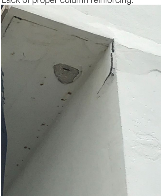
Reinforcing and extensive damage to eyebrows