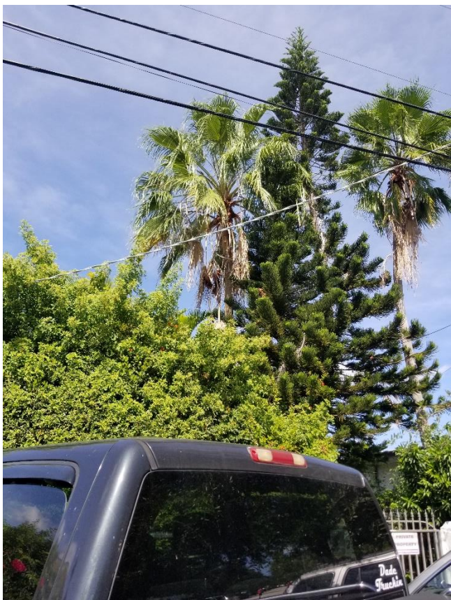
#5- Washingtonia robusta