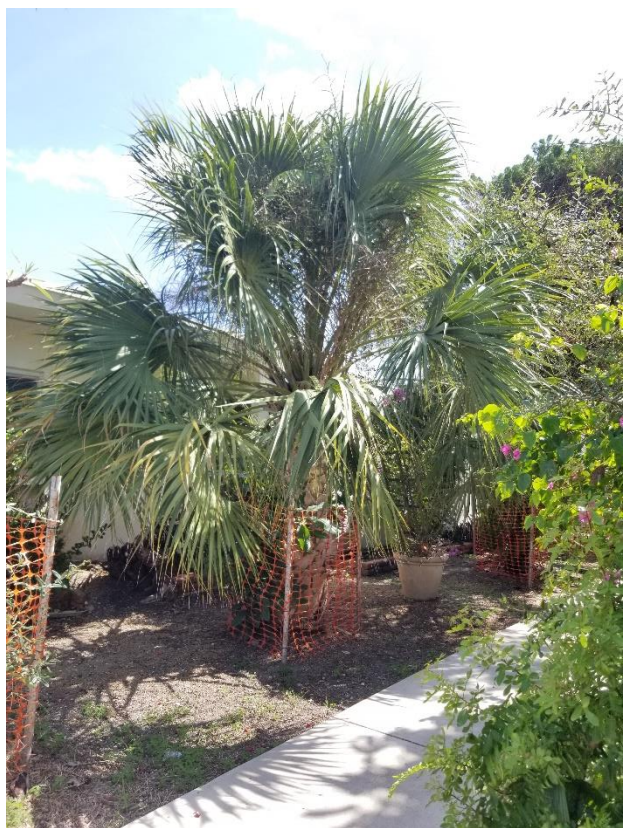
#11- Sabal palmetto