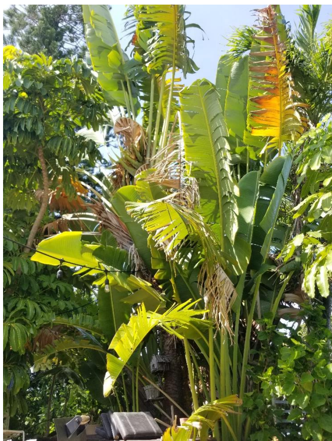
#17- Ravenala madagascariensis