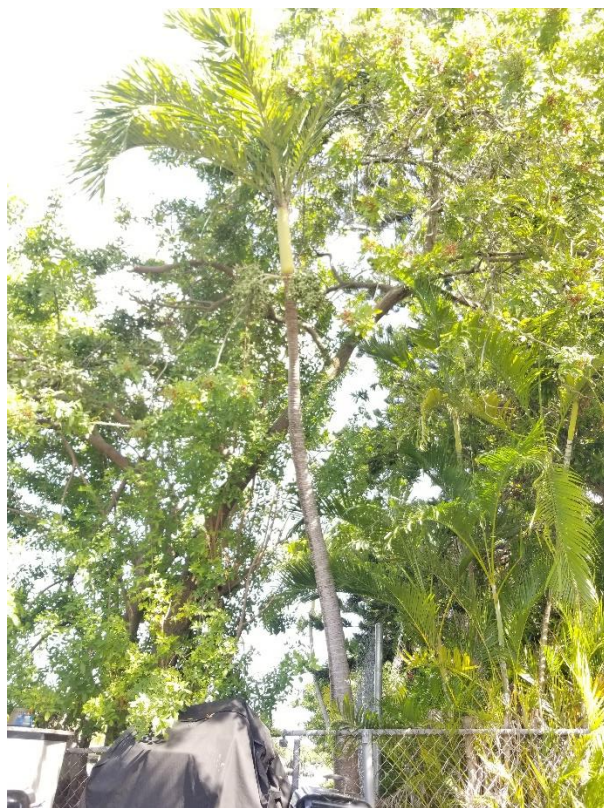
#14- Veitchia merrillii