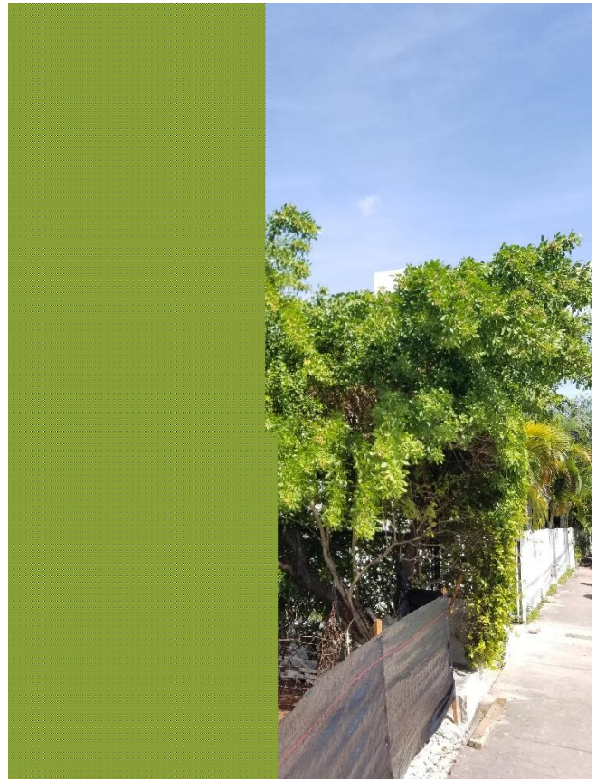
#2- Schinus terebinthifolia