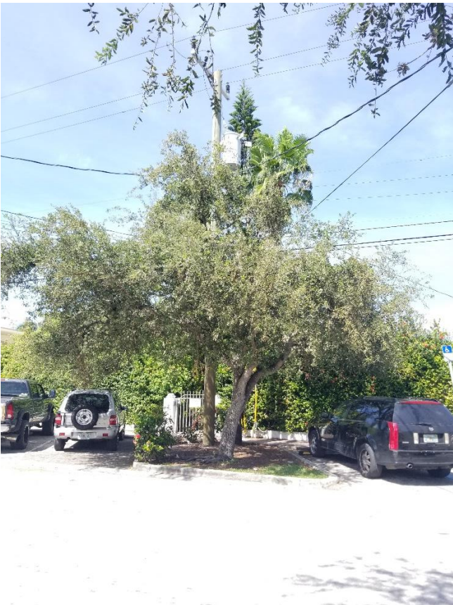
#1- Quercus virginiana