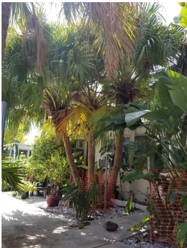
#7- Livistonia chinensis