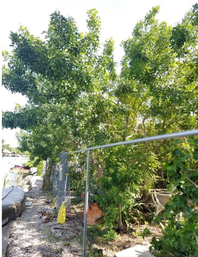
# 19- Schinus terebinthifolia