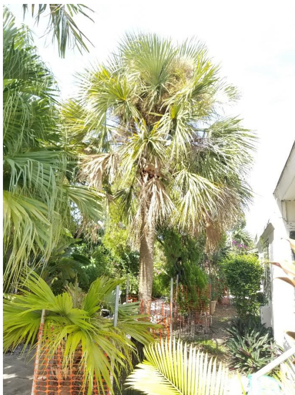
#8- Sable palmetto