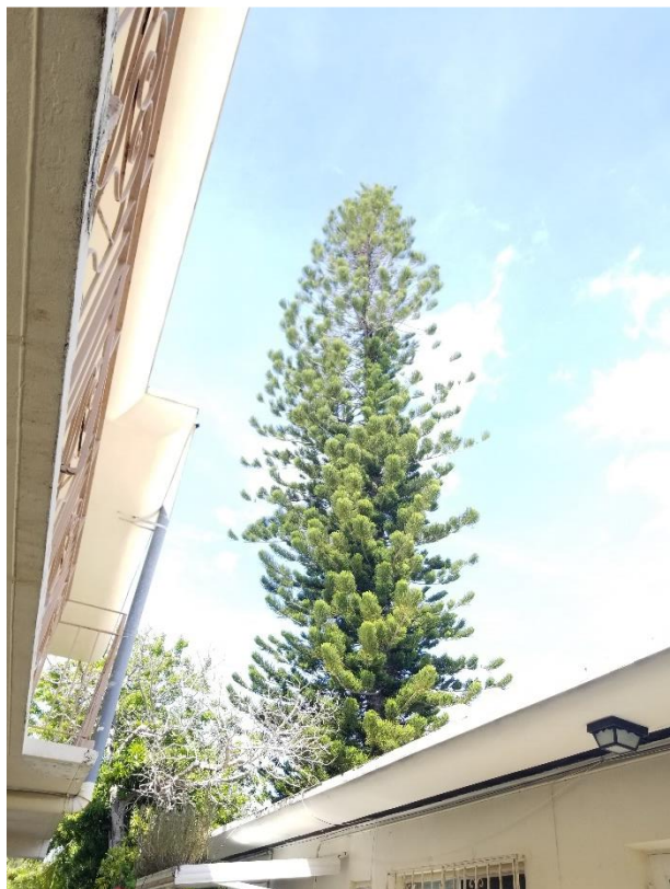
#13- Araucaria heterophylla