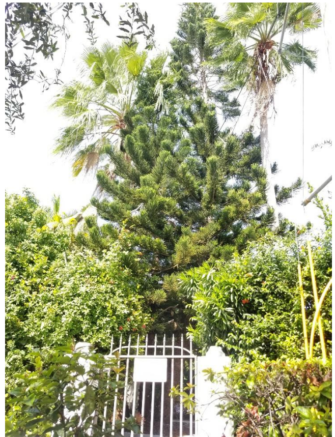
#4- Araucaria heterophylla