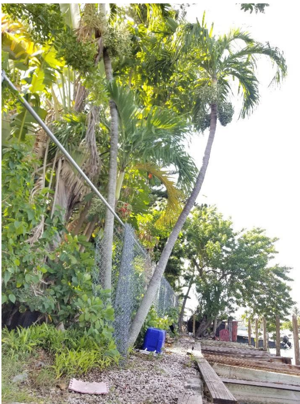
#16- Veitchia merrillii