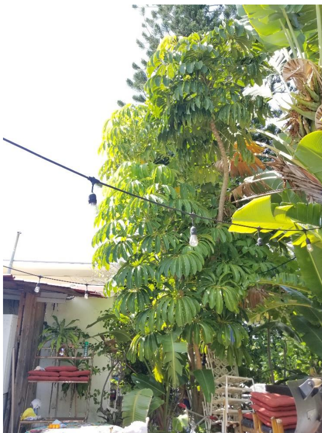
#18- Schefflera actinophylla