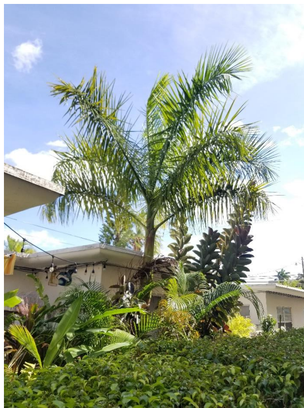
#12- Roystonea regia