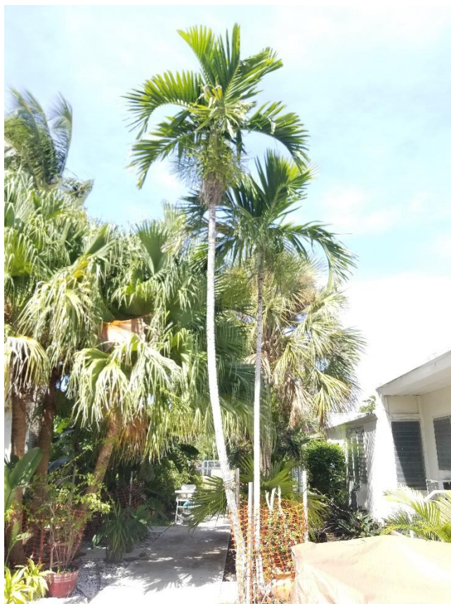
#6- Ptychosperma elegans