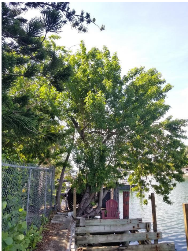
# 15- Schinus terebinthifolia