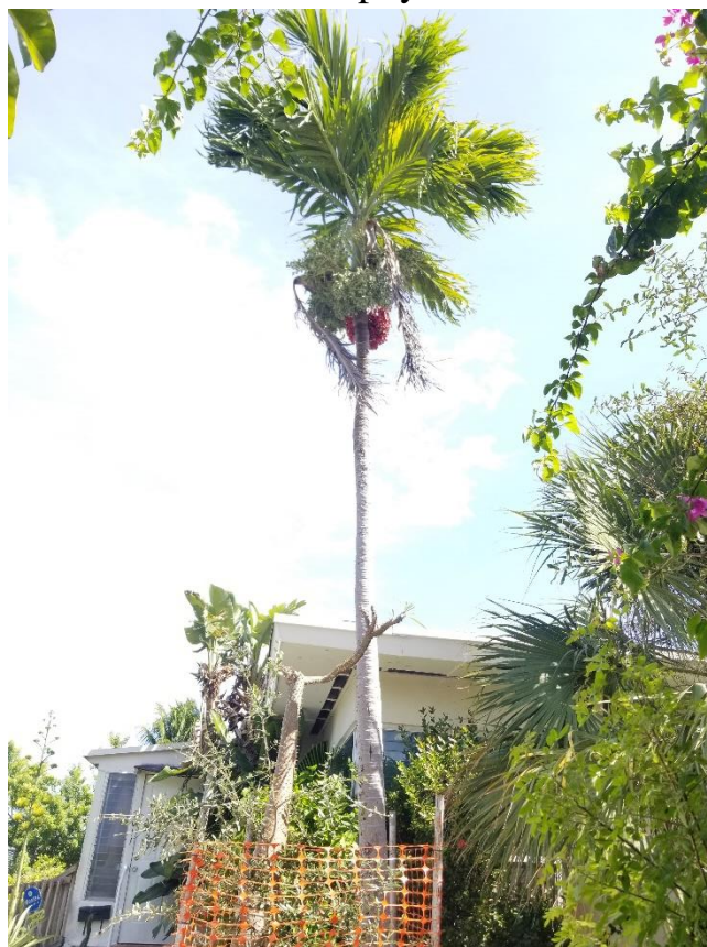
#20- Veitchia merrillii