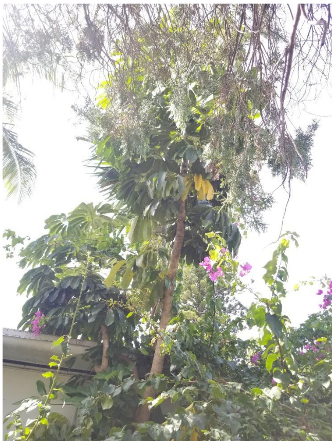
#21- Schefflera actinophylla