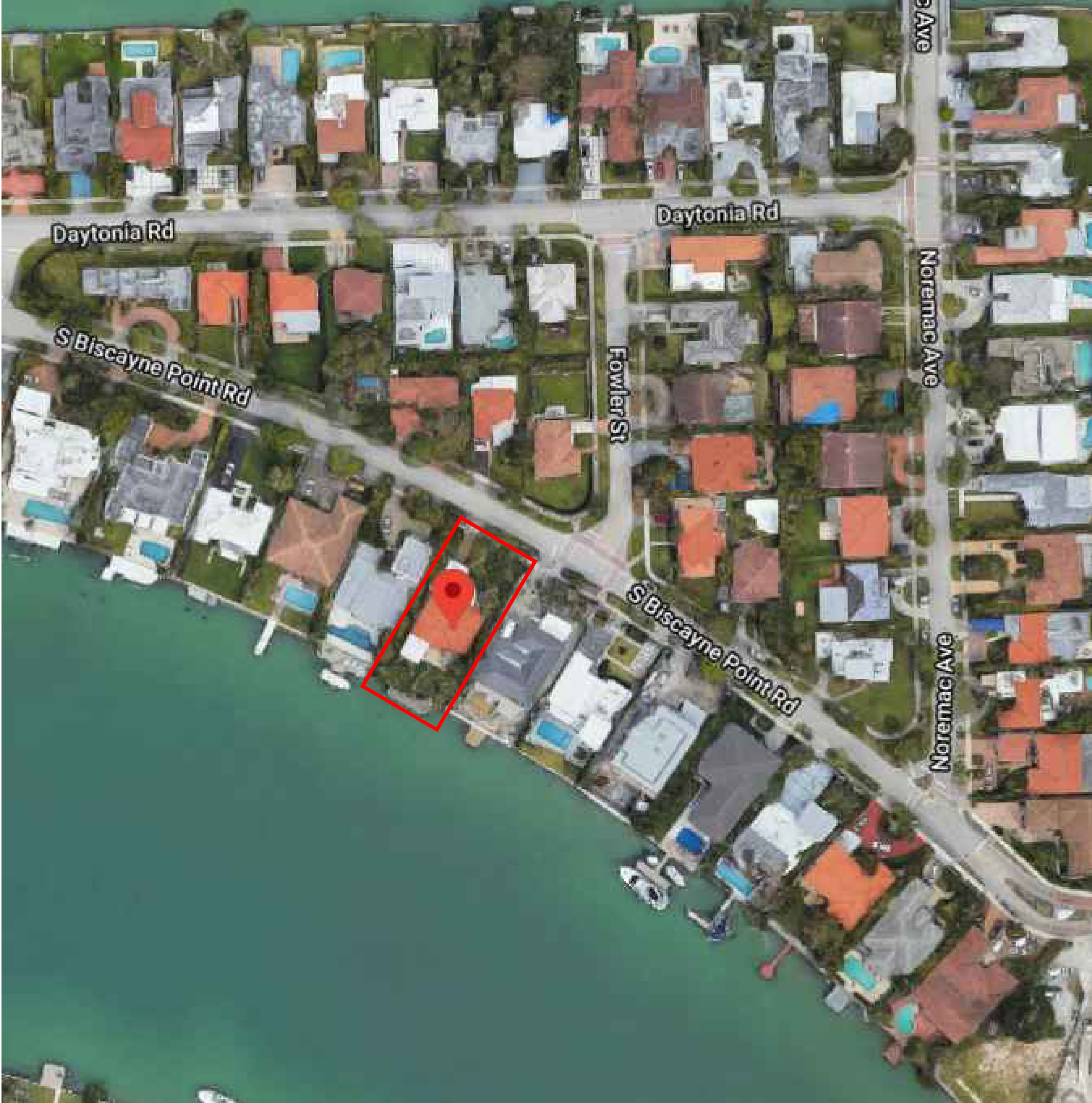
1 LOCATION MAPS A-001 Scale: N.T.S.