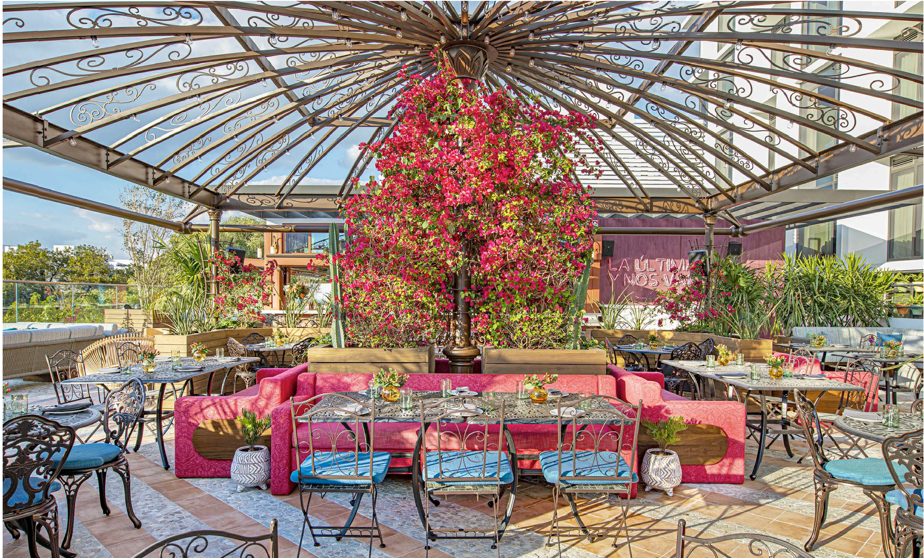
1 PHOTO EXISTING CONDITIONS SCALE: N.T.S.