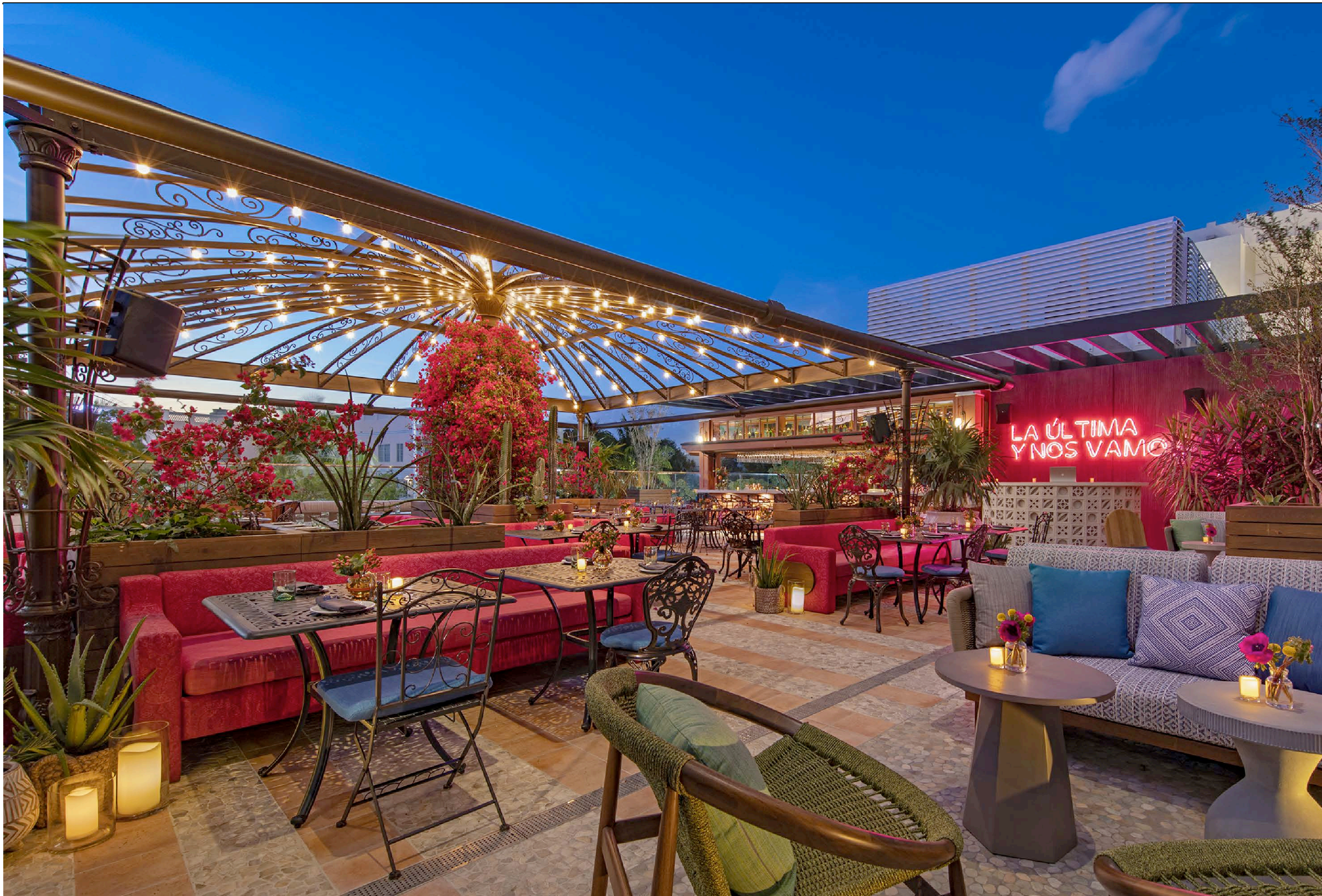
2 PHOTO EXISTING CONDITIONS SCALE: N.T.S.