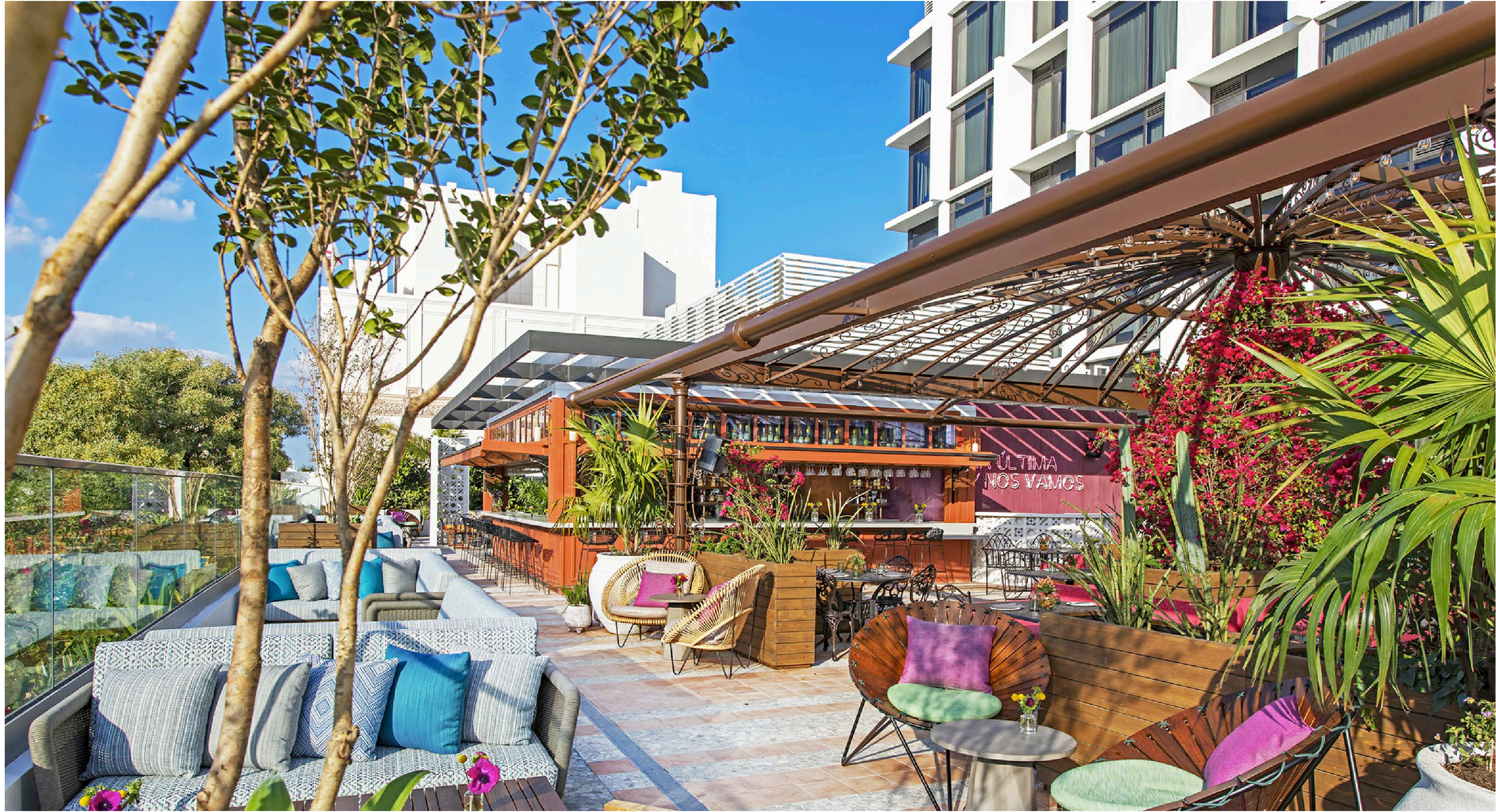
2 PHOTO EXISTING CONDITIONS SCALE: N.T.S.