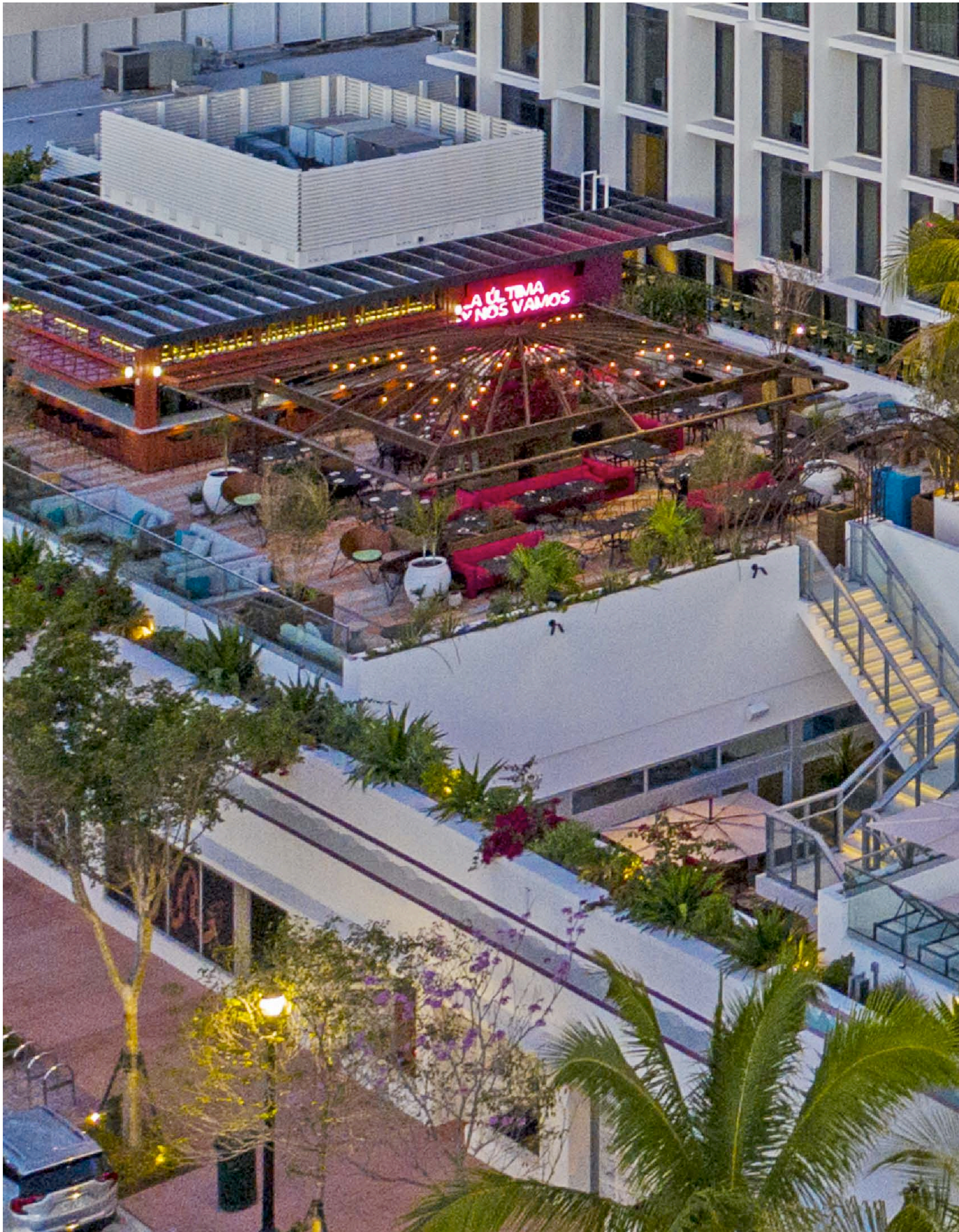
1 PHOTO EXISTING CONDITIONS SCALE: N.T.S.