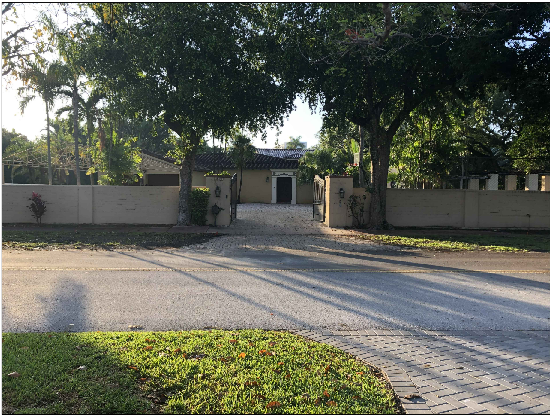
N5 - 5005 LAKEVIEW