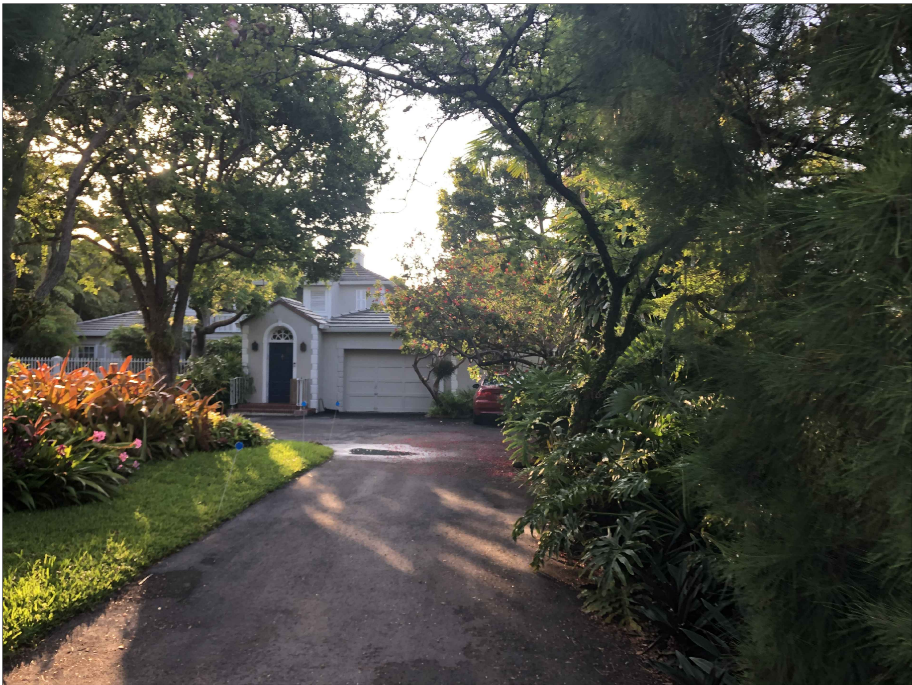
N6 - 4985 LAKEVIEW