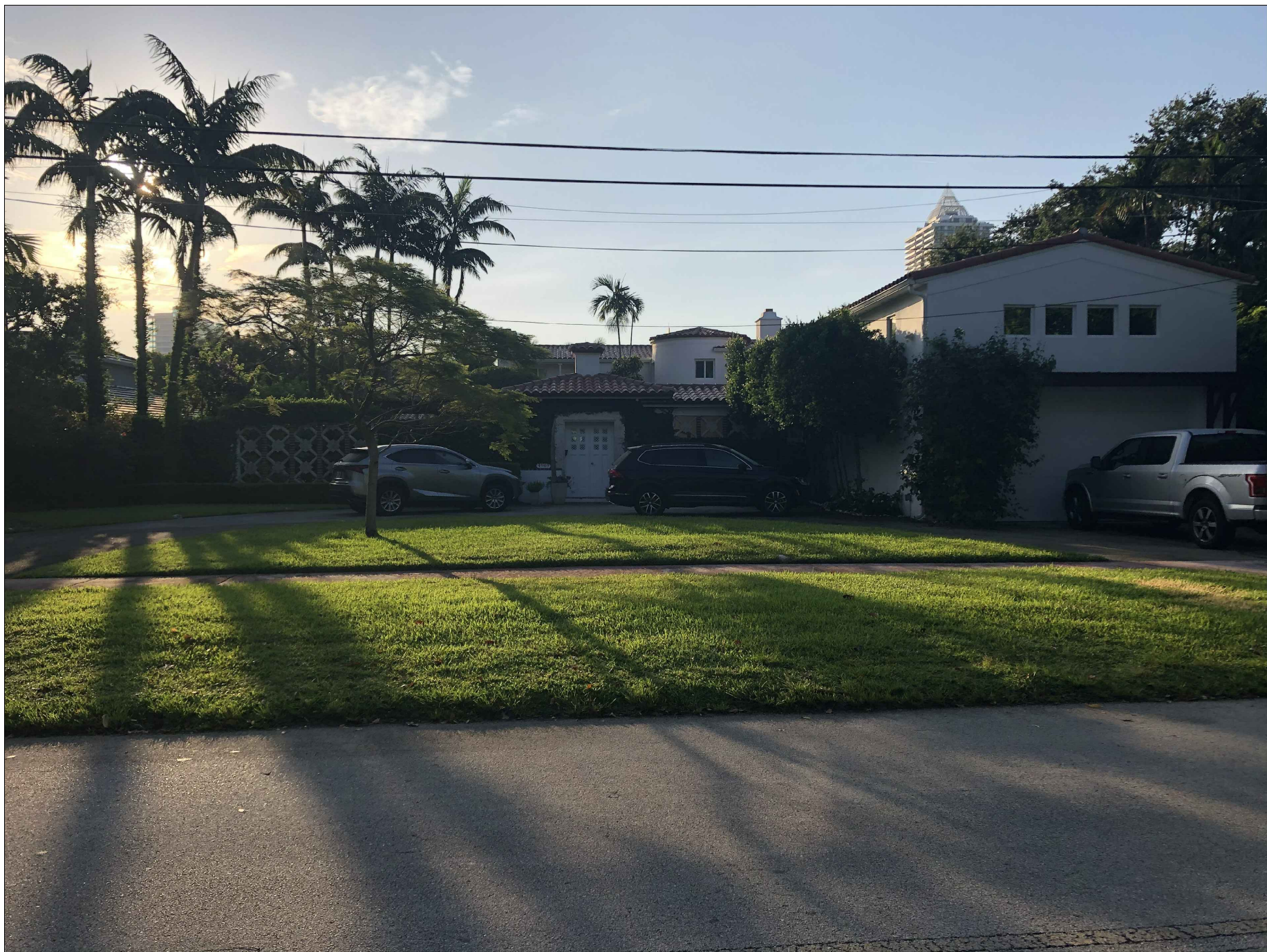
N7 - 4969 LAKEVIEW