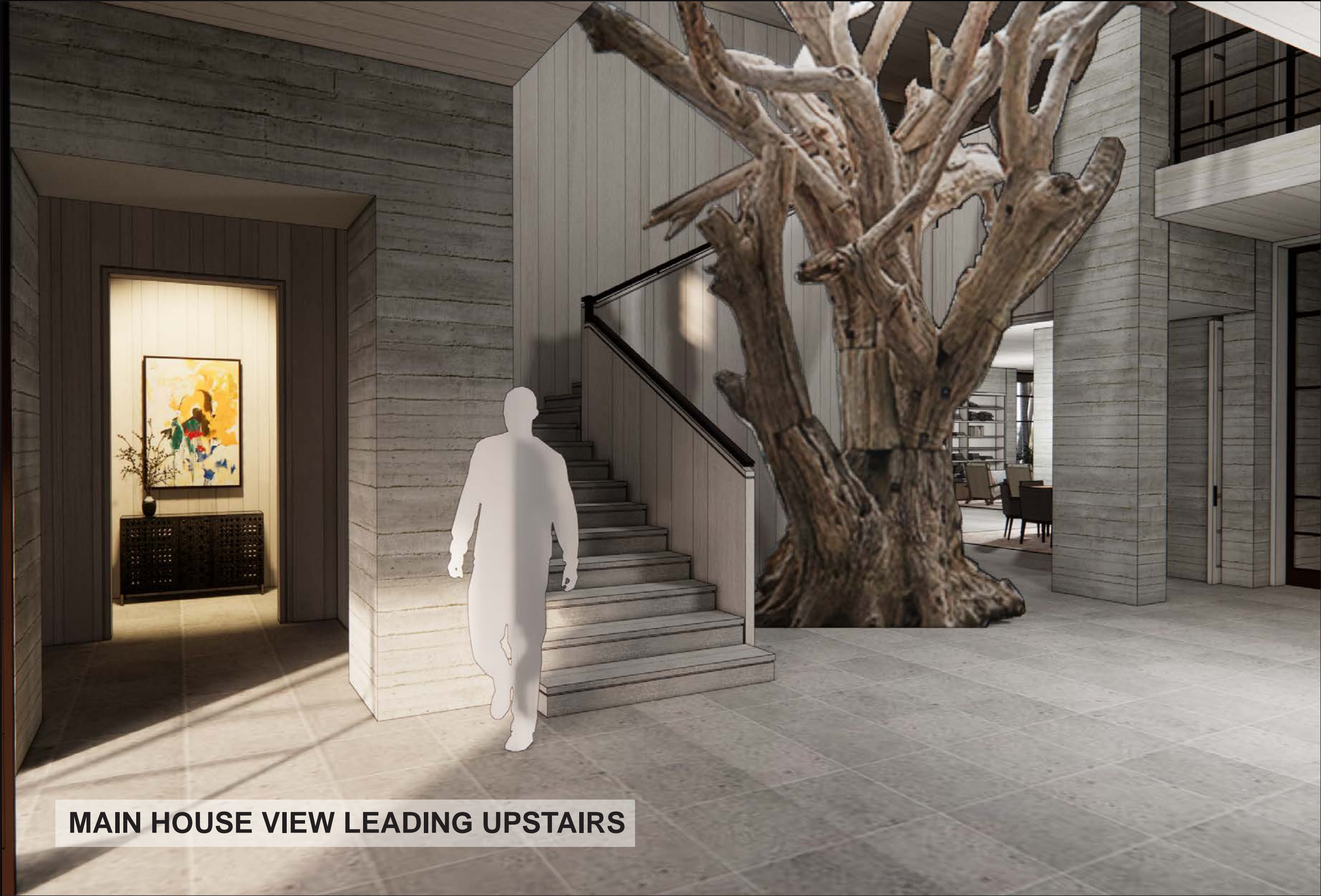
MAIN HOUSE VIEW LEADING UPSTAIRS