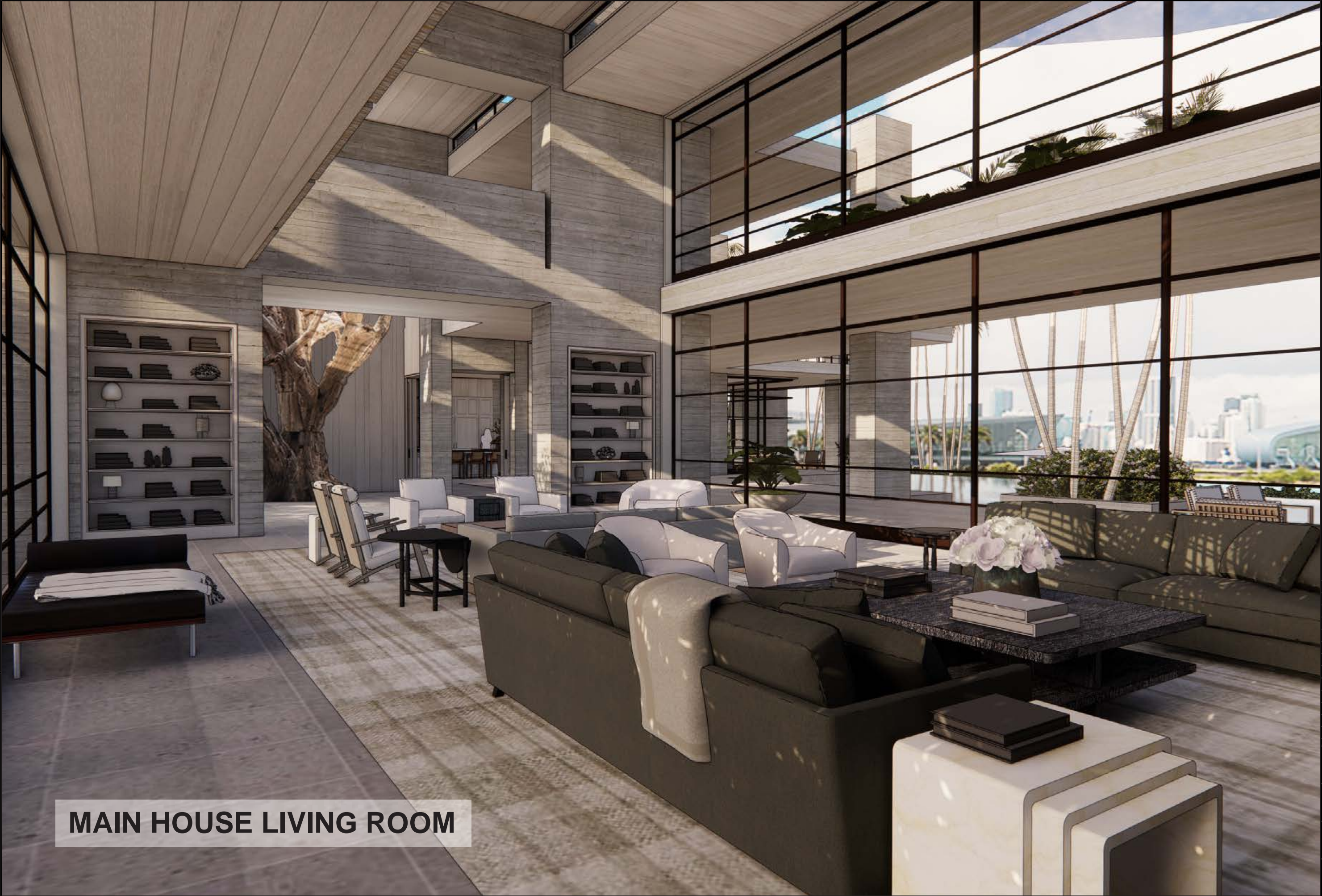
MAIN HOUSE LIVING ROOM