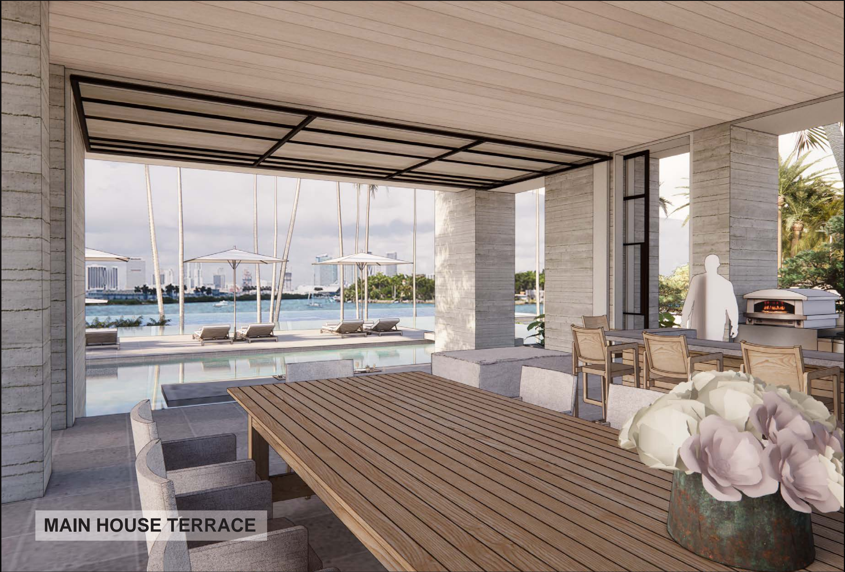
MAIN HOUSE TERRACE