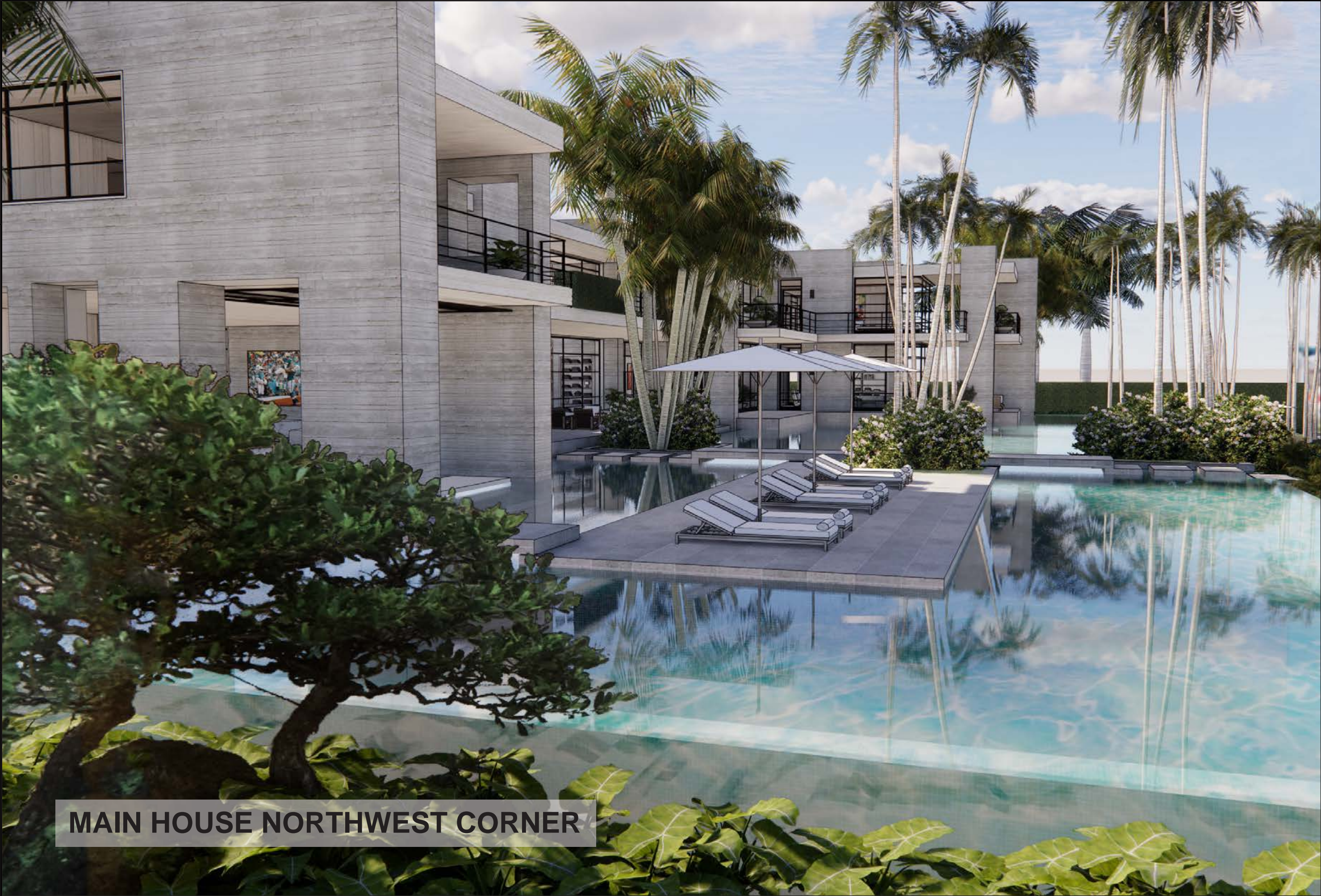
MAIN HOUSE NORTHWEST CORNER