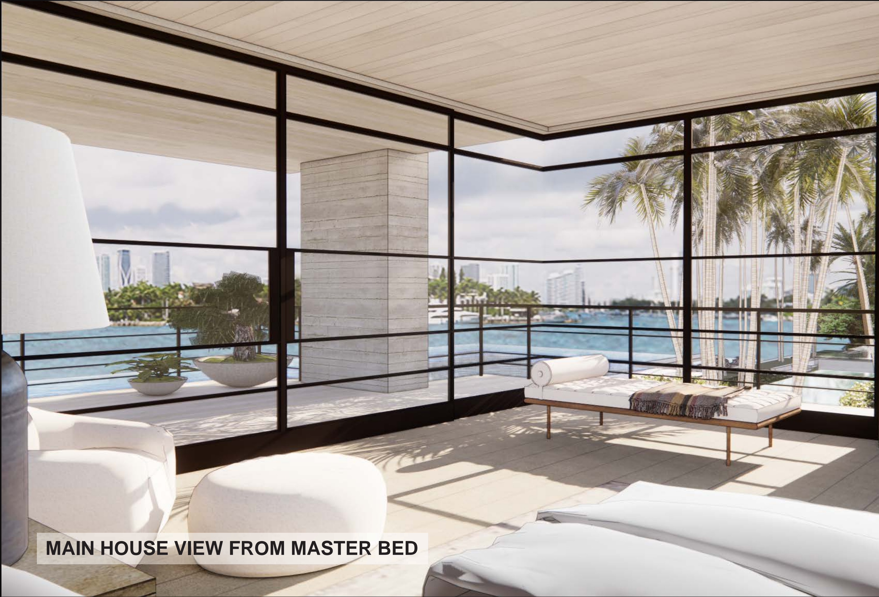
MAIN HOUSE VIEW FROM MASTER BED