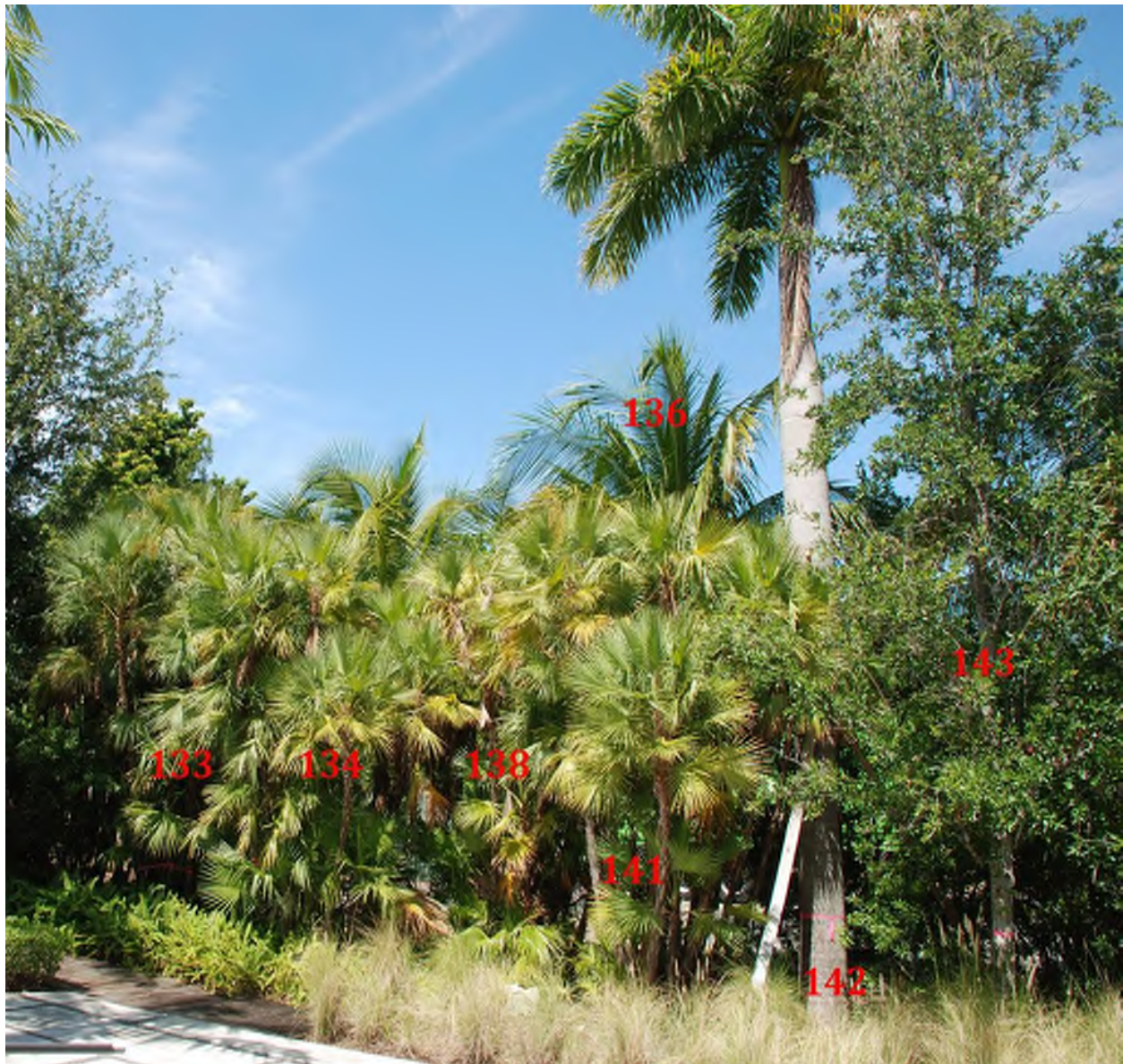
Photo 77 above is palms 133, 134, 136, 138 & 141 and tree 143.