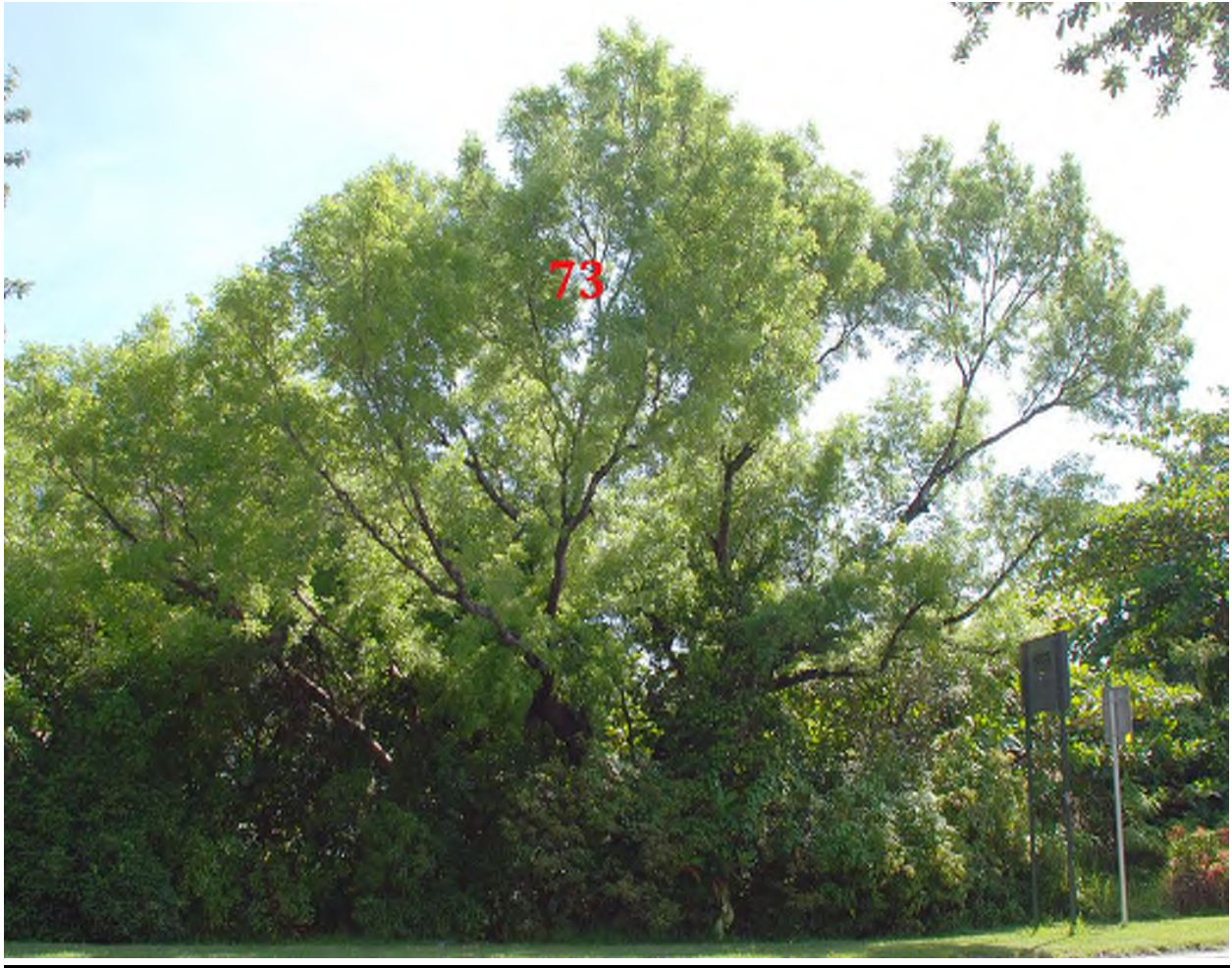
Photo 42 above is tree 73 viewed from the south.