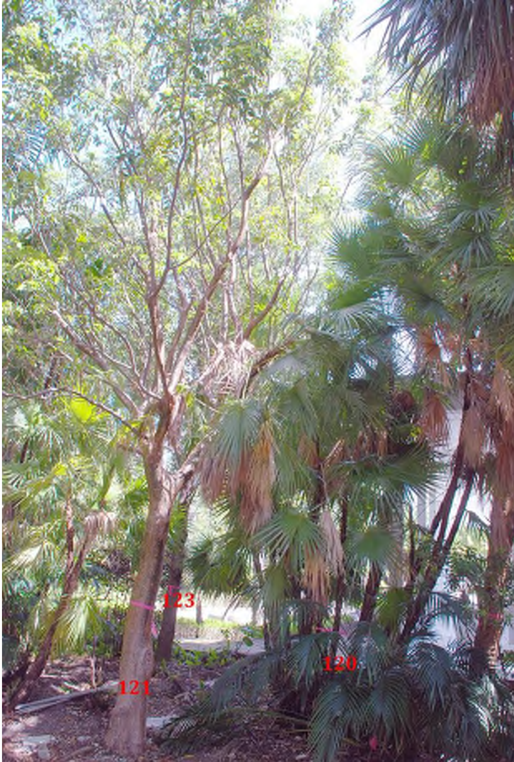
Photo 71 above is palm 120 & tree 121.