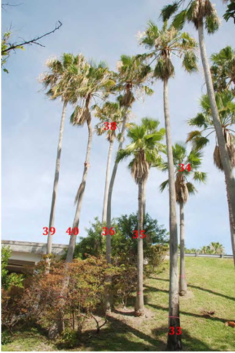
Photo 17 above is palms 33, 34, 35, 36, 39 & 40.