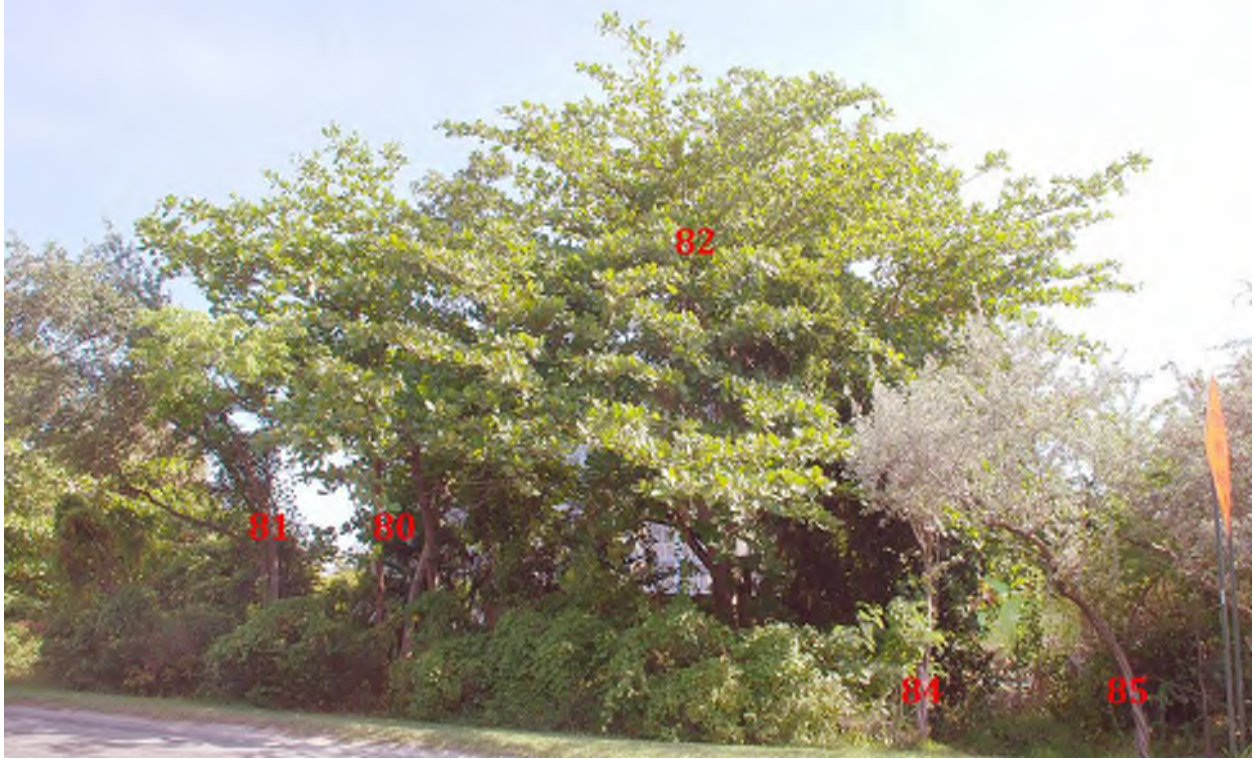
Photo 49 above is trees 80, 81, 82, 84 & 85 viewed from the south.