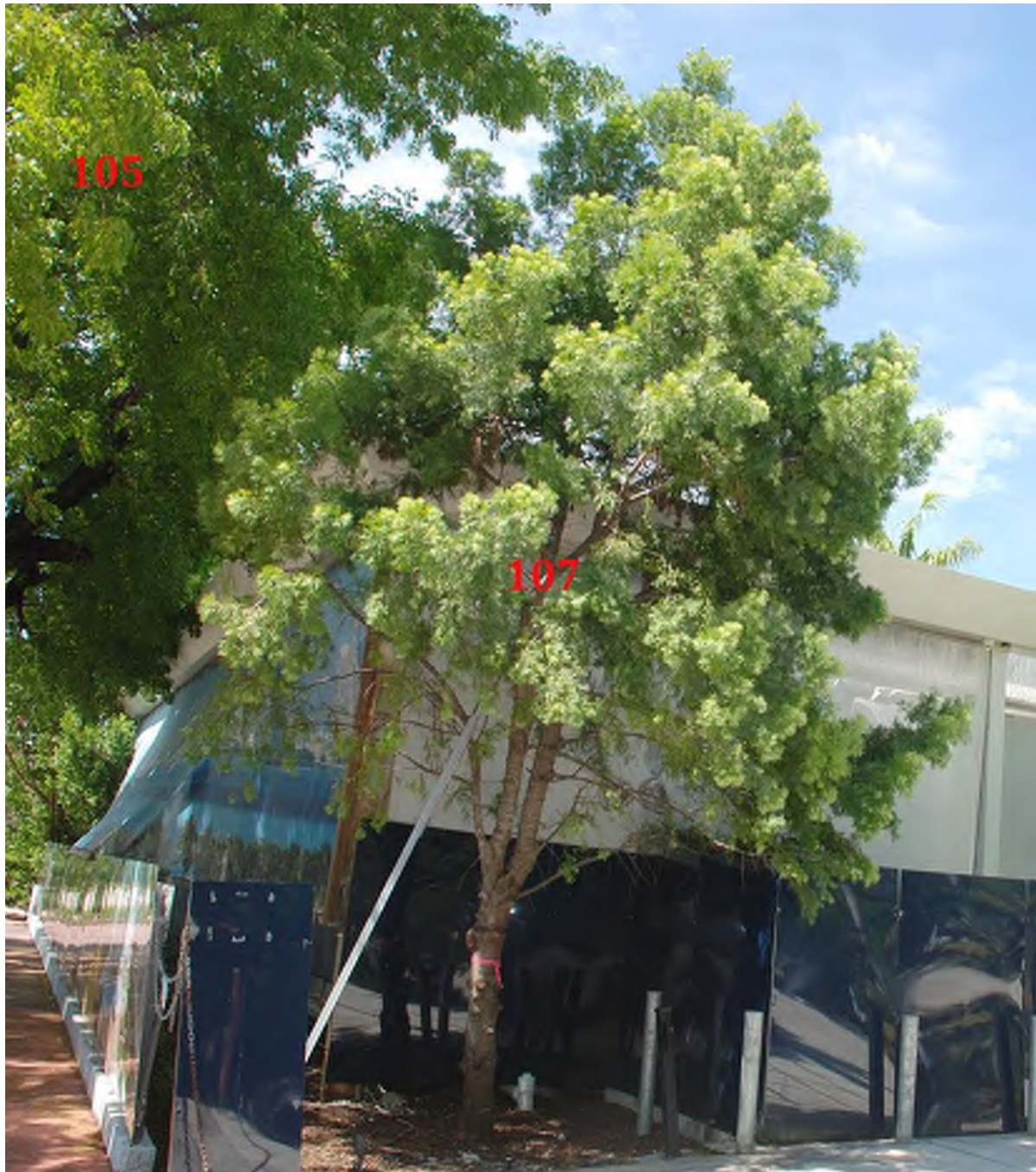
Photo 66 above is tree 107.