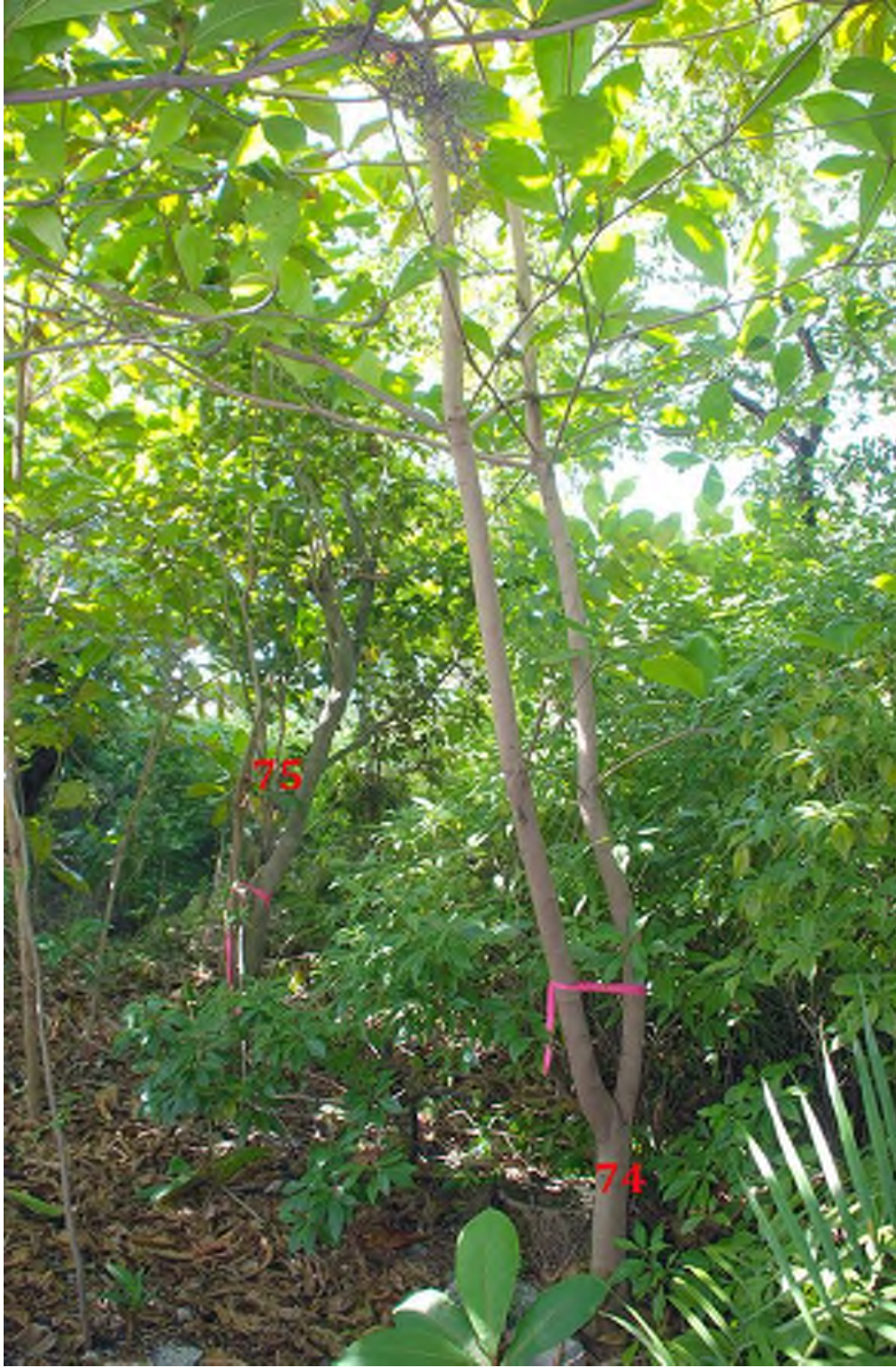
Photo 44 above is trees 74 & 75.