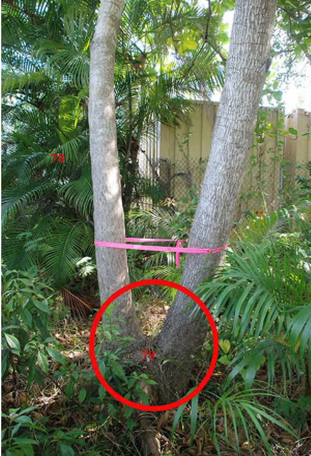
Photo 47 above is tree 79 with a weak codominant branch/trunk connection.