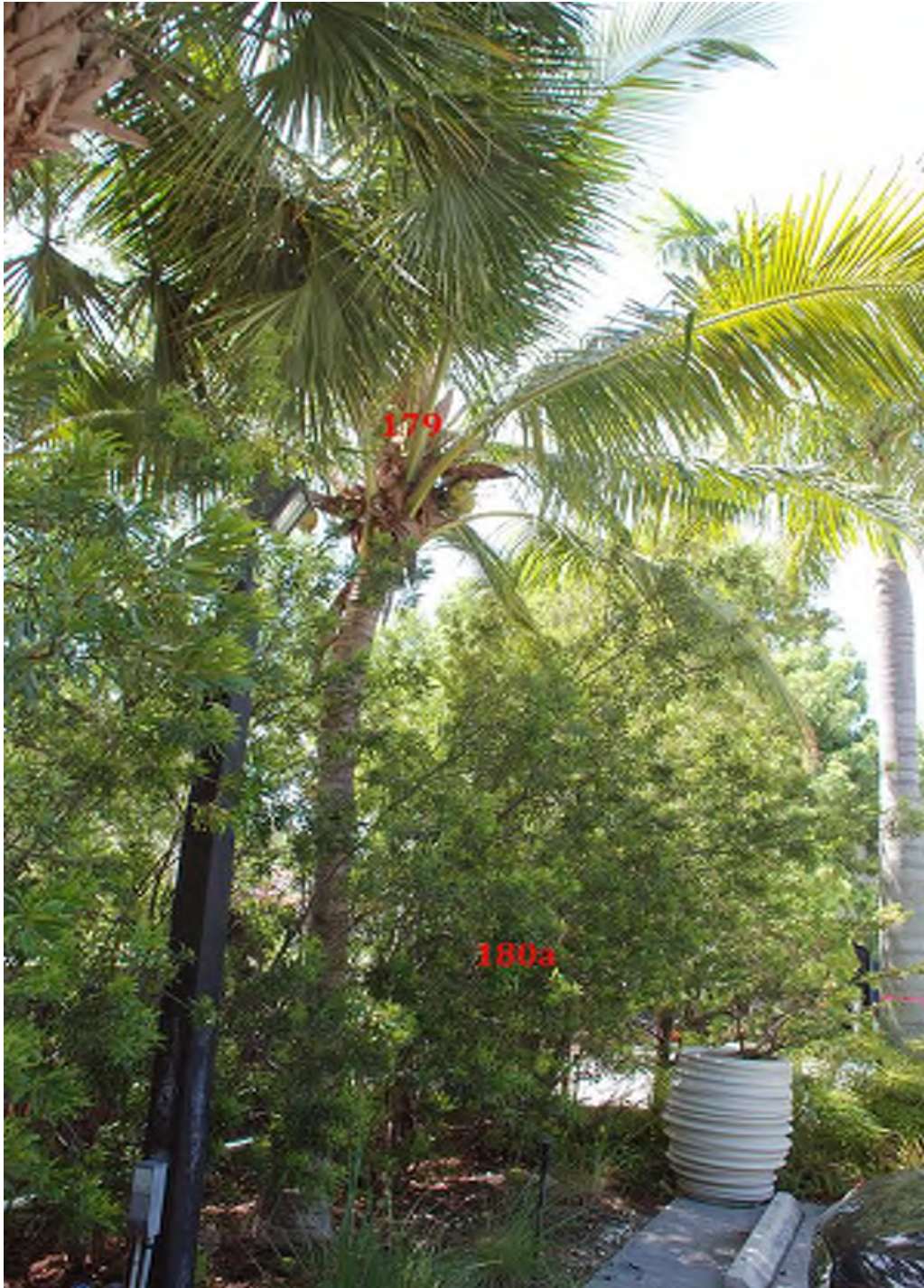
Photo 87 above is palm 179 and tree 180a.