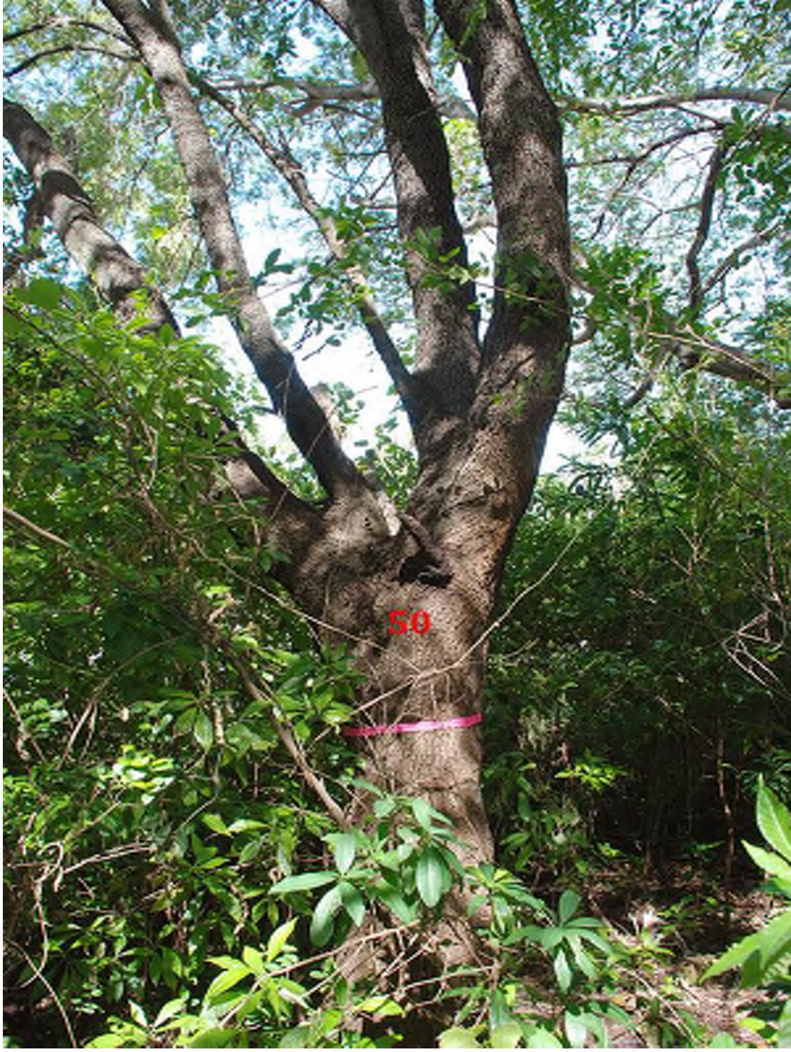
Photo 23 above is tree 50.