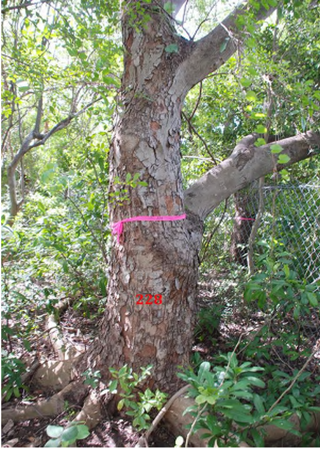
Photo 125 above is tree 228 viewed from the west. I noted no signs of active decay or cavities on the trunk or root collar of this tree.