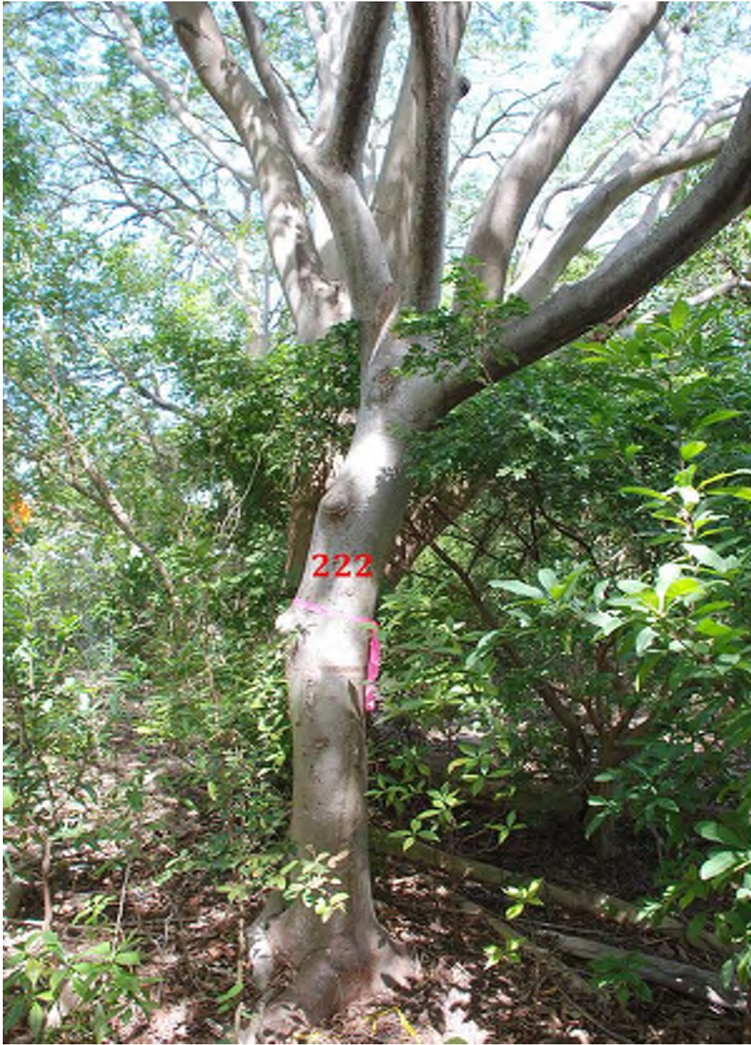
Photo 116 above is tree 222.