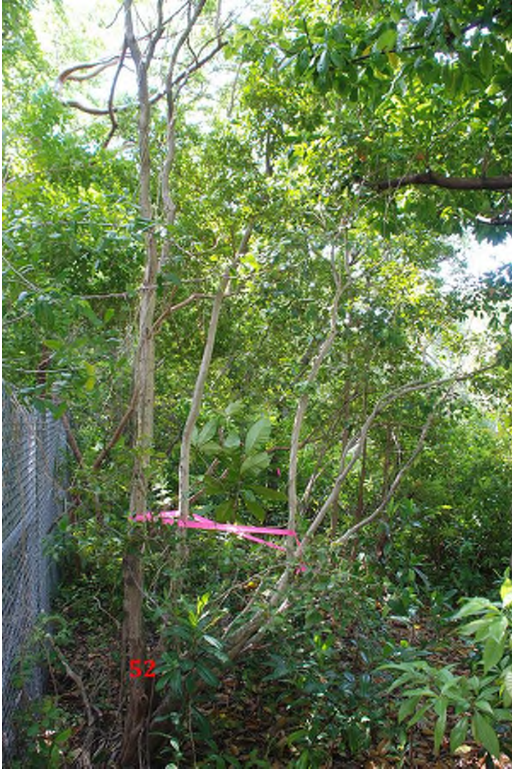
Photo 26 above is tree 52.