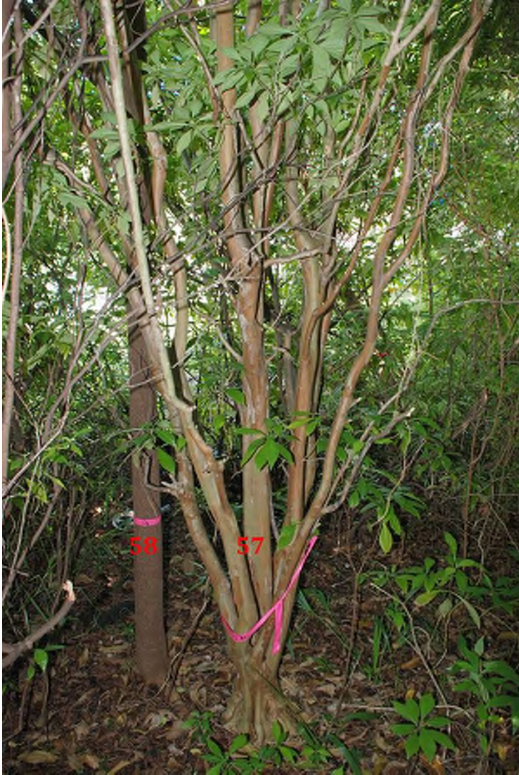
Photo 30 above is trees 57 & 58.