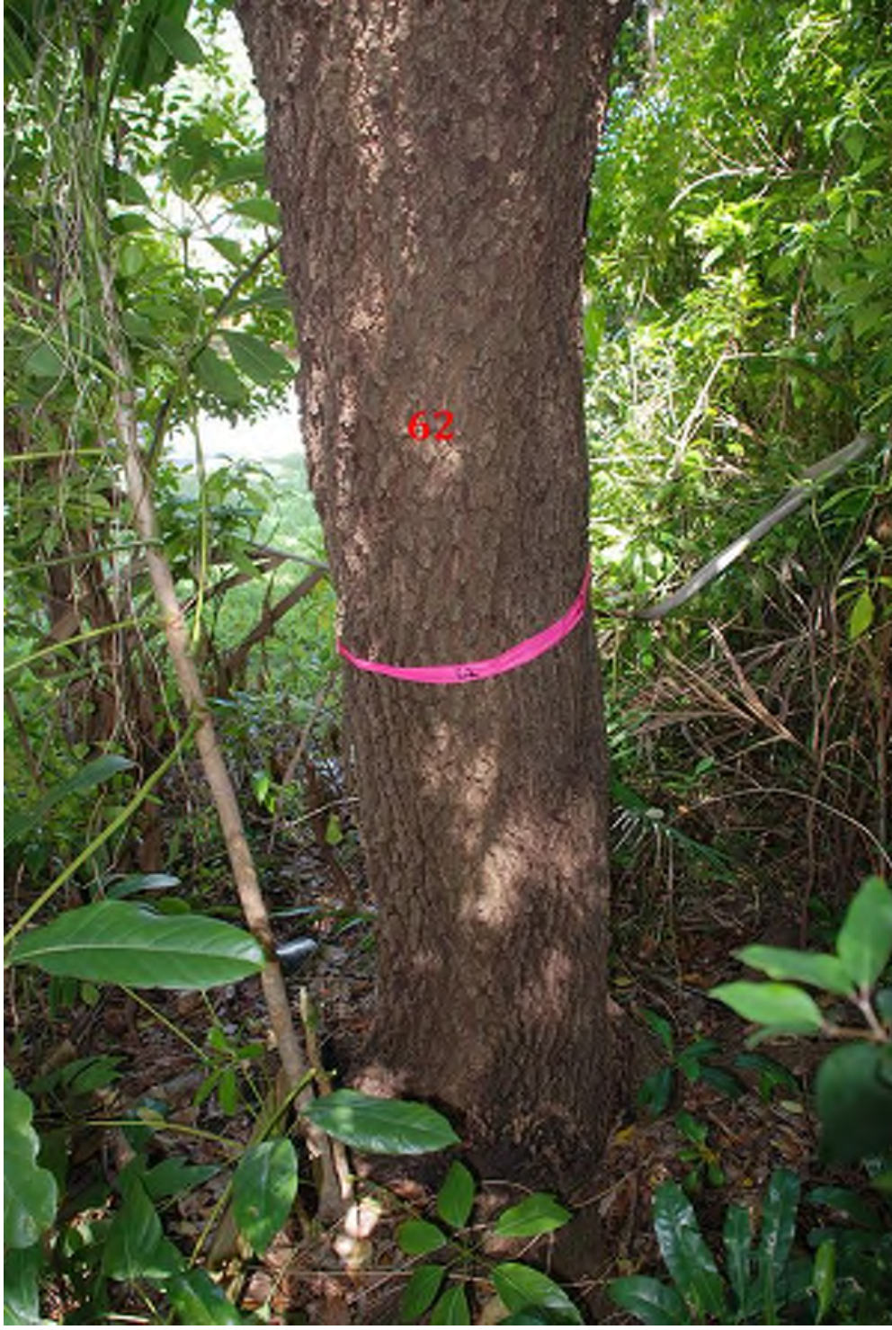
Photo 32 above is tree 62 with no signs of decay or cavities on the trunk or root collar.