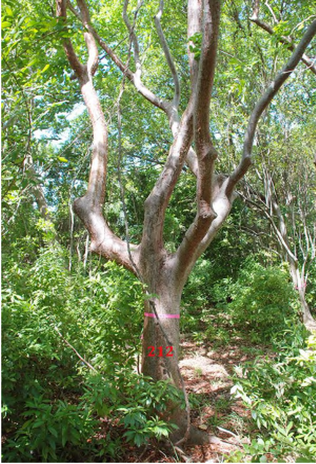
Photo 108 above is tree 212.