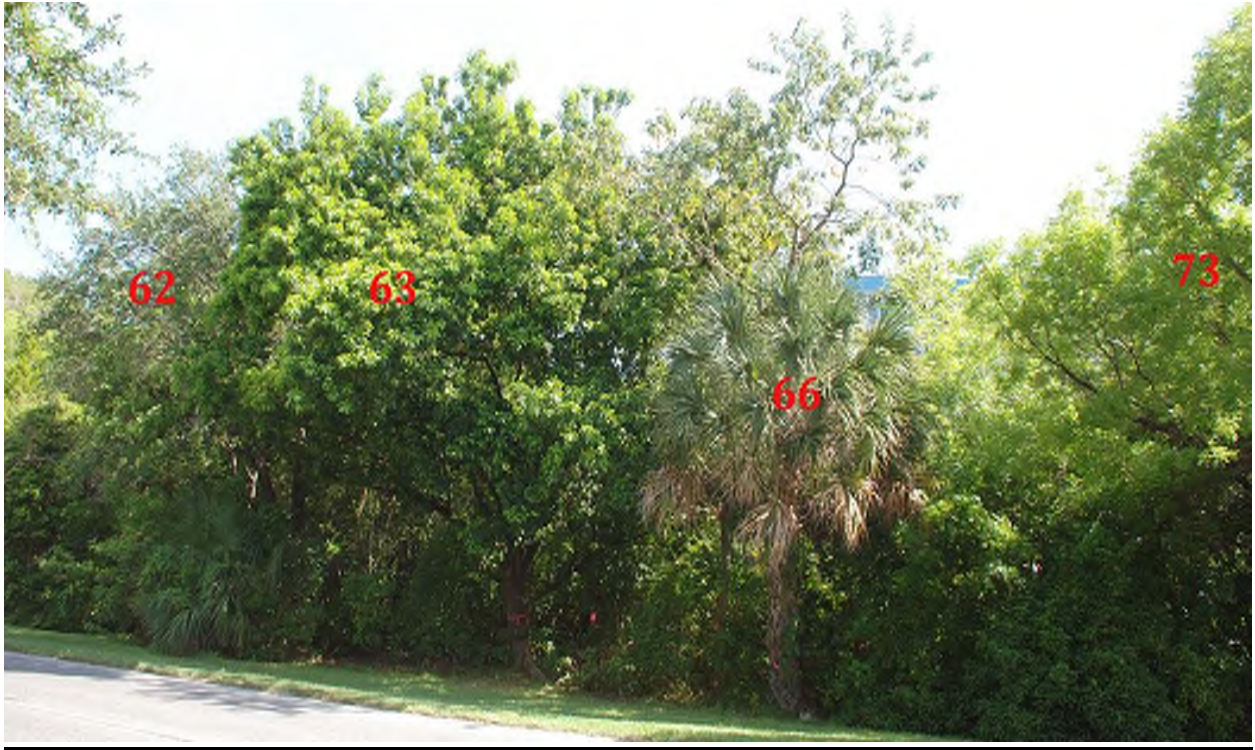
Photo 34 above is trees 62, 63, 73, and palm 66.