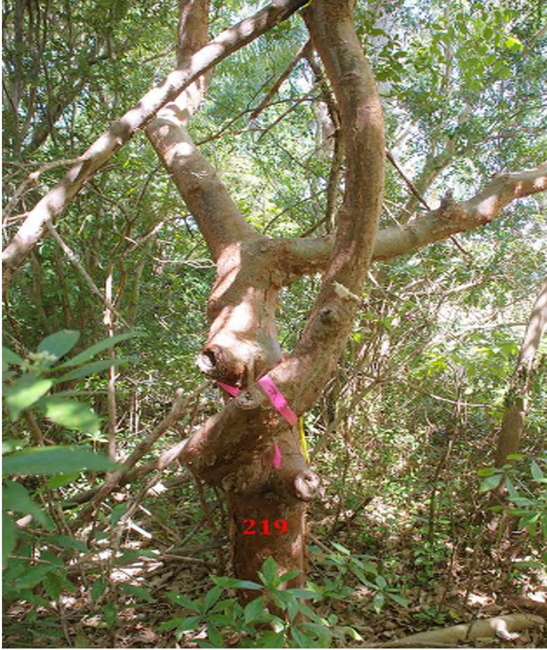
Photo 113 above is tree 219.