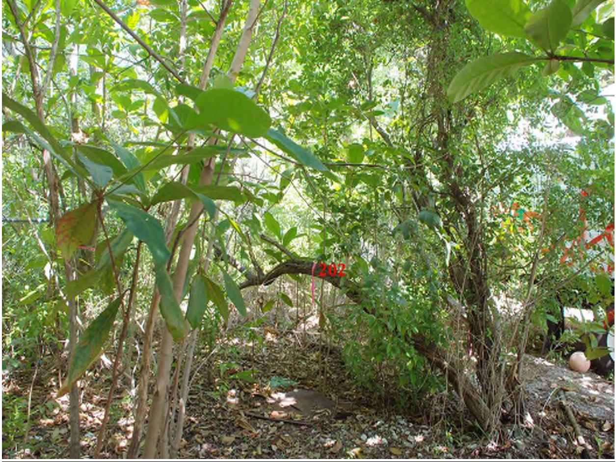
Photo 101 above is invasive species 202.