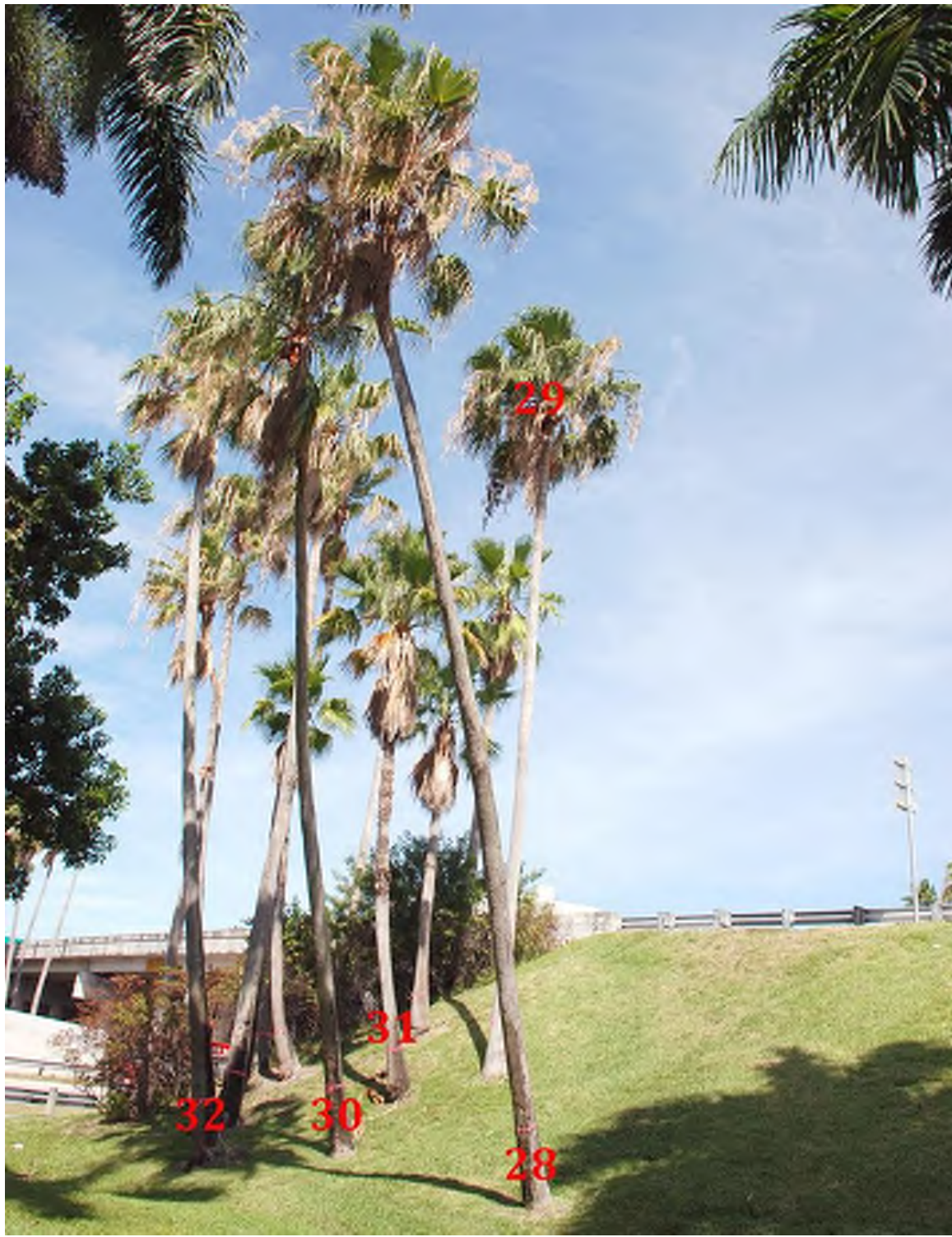
Photo 16 above is palms 28, 30, 31 & 32. Palms 28 & 30 are rated as moderate due the lean of the trunk.