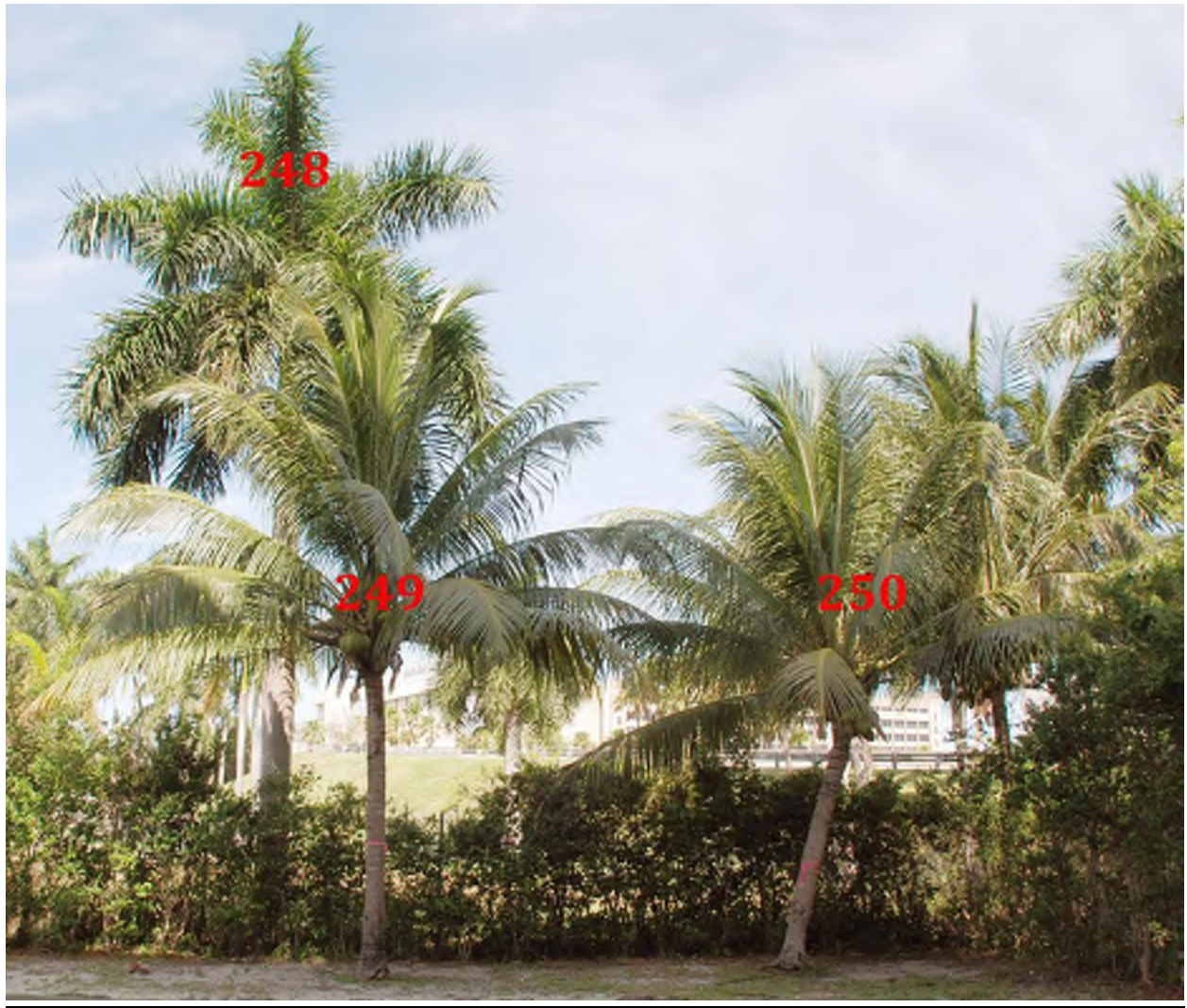
Photo 138 above is palms 248, 249 & 250.