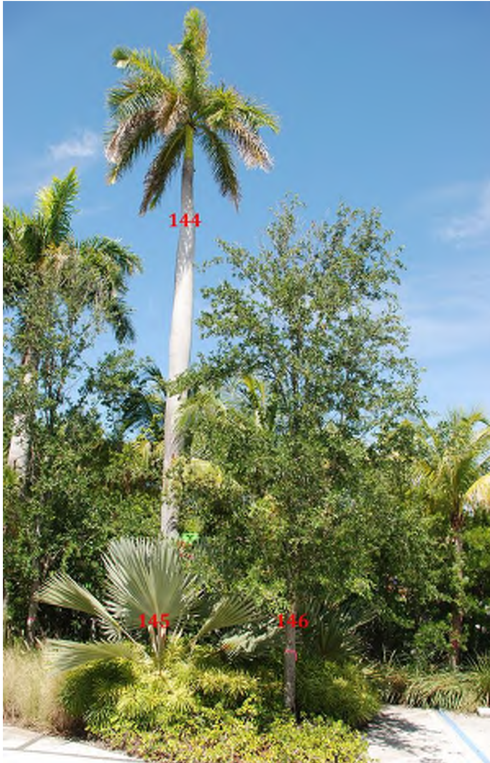
Photo 79 above is tree 146.