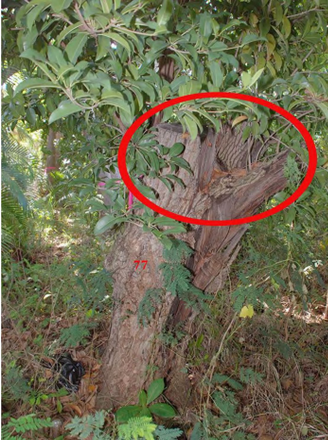
Photo 46 above is the topped trunk of tree 77 with extensive decay indicated.