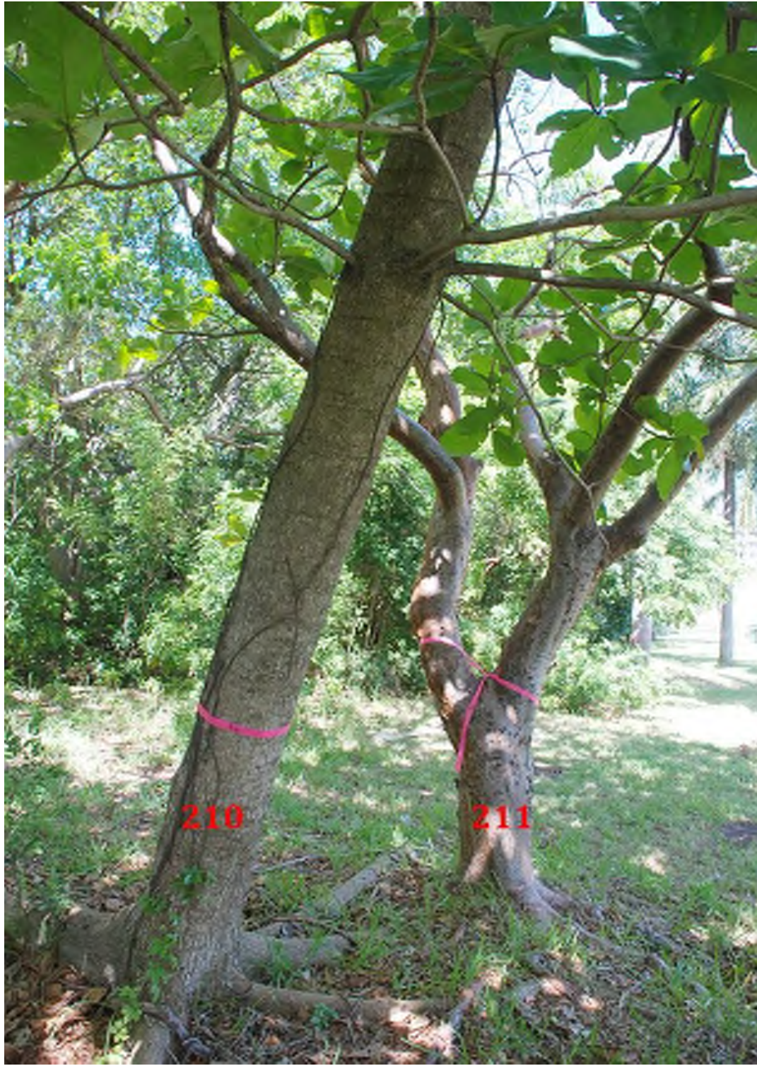
Photo 106 above is trees 210 & 211.