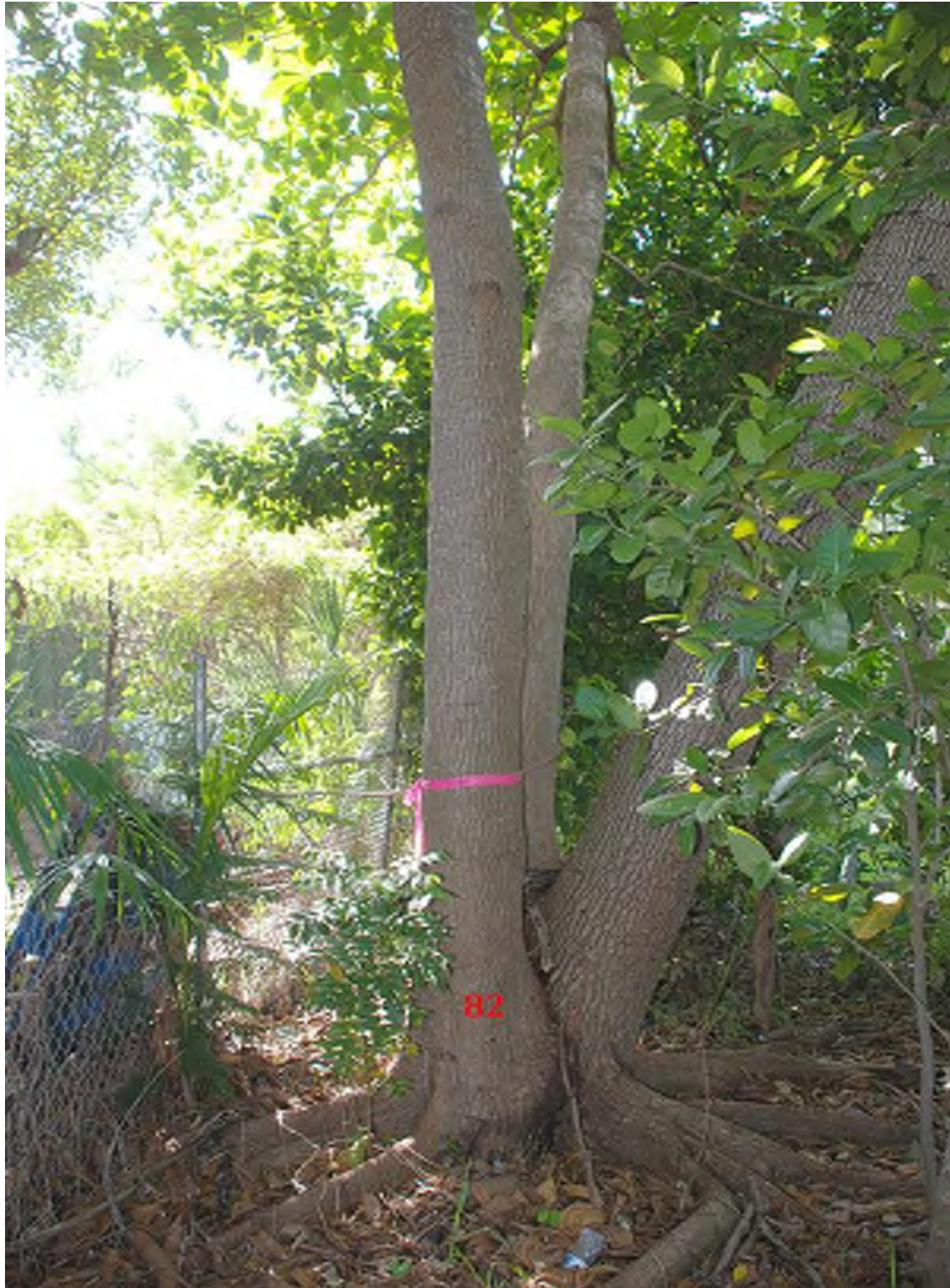
Photo 51 above is tree 82 with no signs of decay or cavities on the trunk(s).