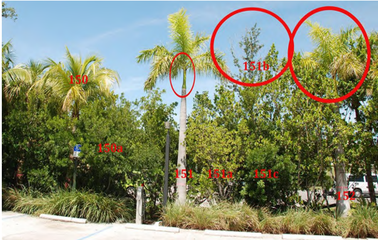
Photo 81 above is palms 151 & 152 with severe nutrient deficiencies and tree 151b with significant small branch die-back.