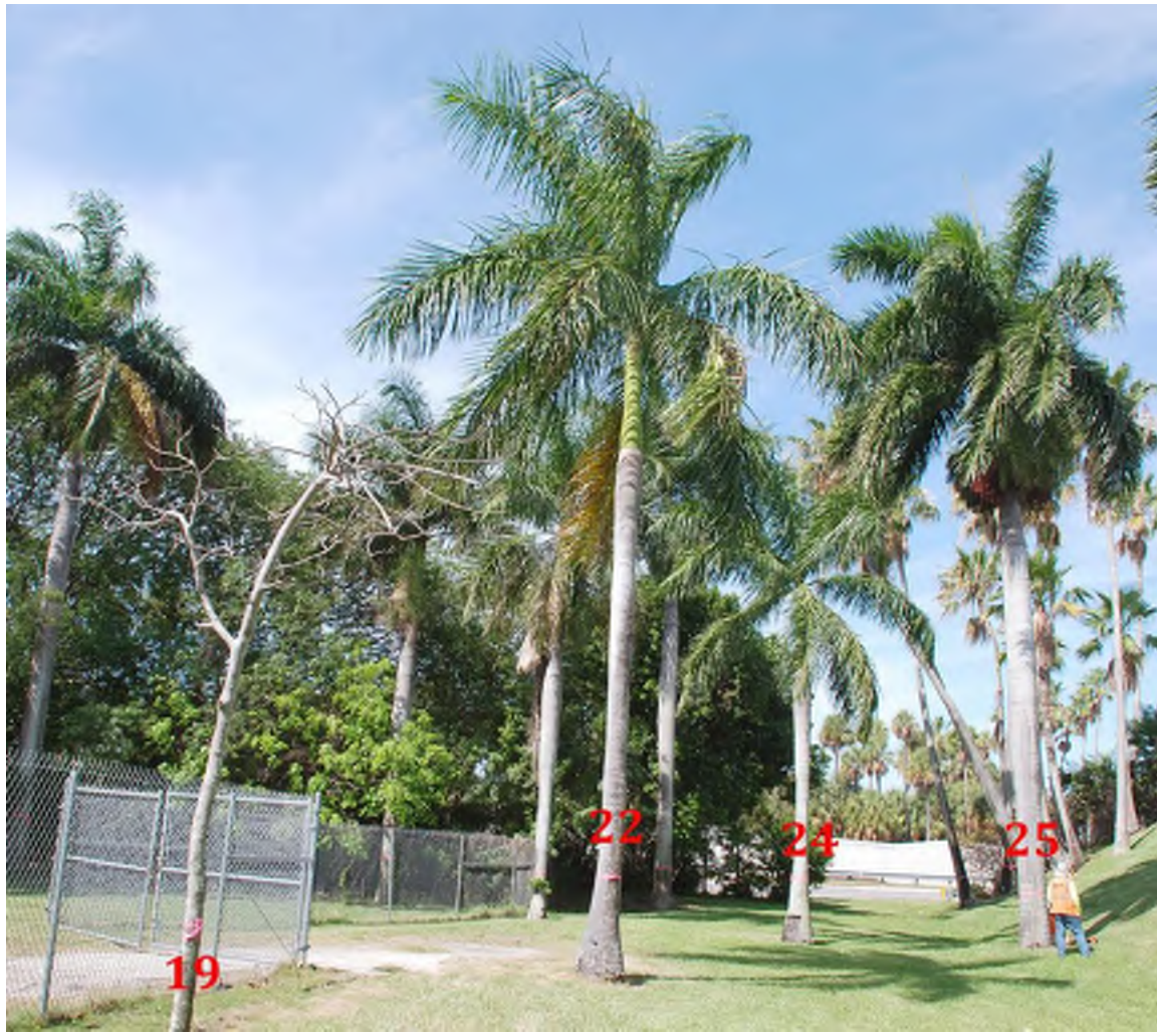
Photo 11 above is palms 22, 24 & 25.