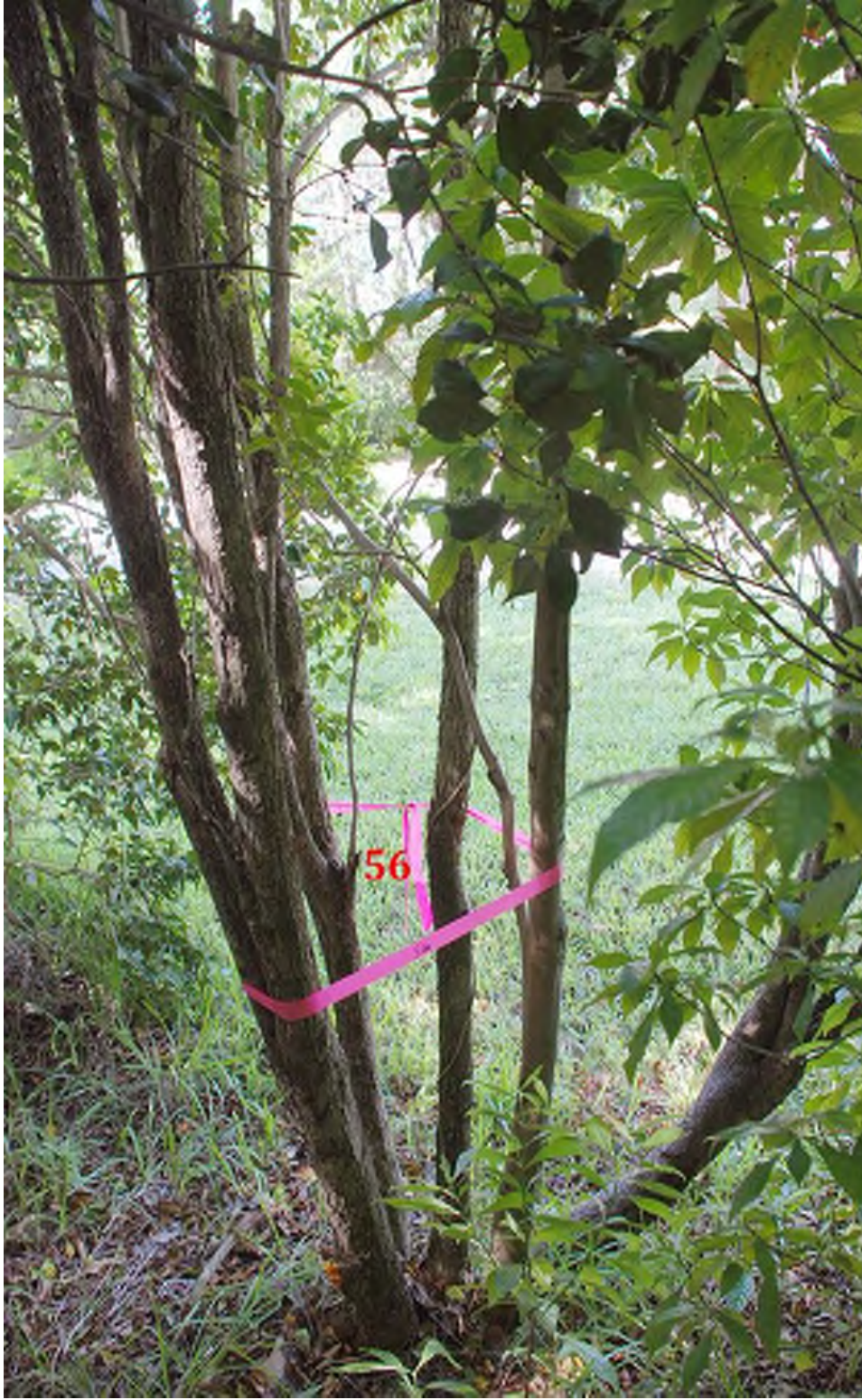
Photo 29 above is tree 56.