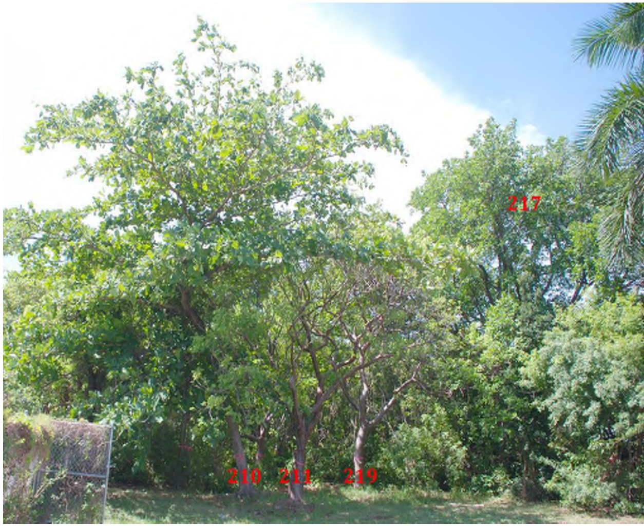
Photo 107 above is trees 210, 211, 219 & 217 viewed from the north.