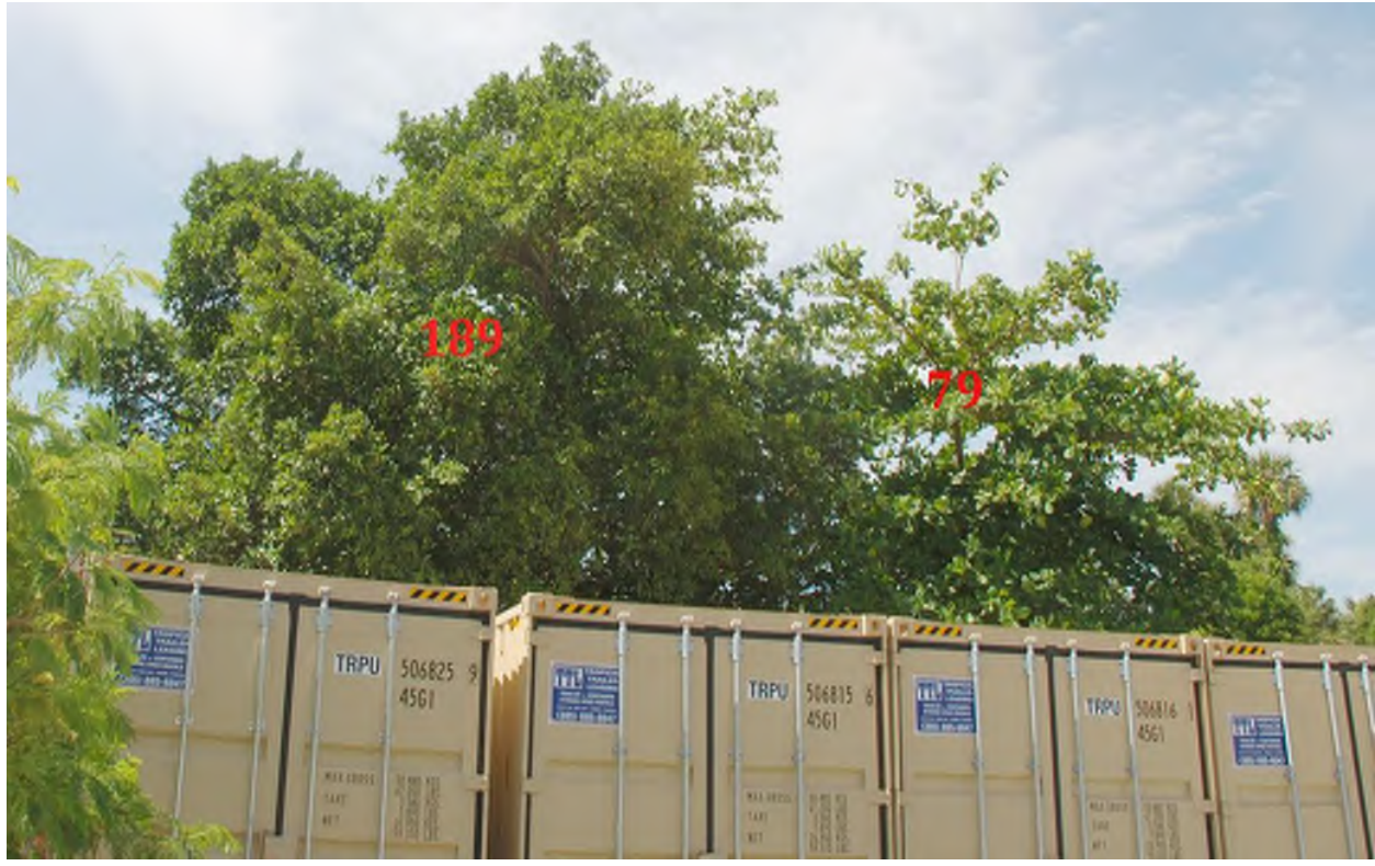
Photo 93 above is trees 79 & 189 viewed from the north.