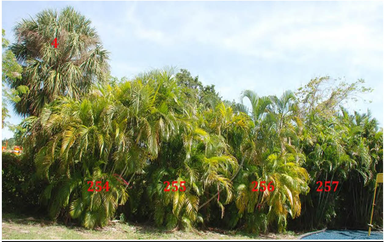
Photo 140 above is palms 254 through 257.