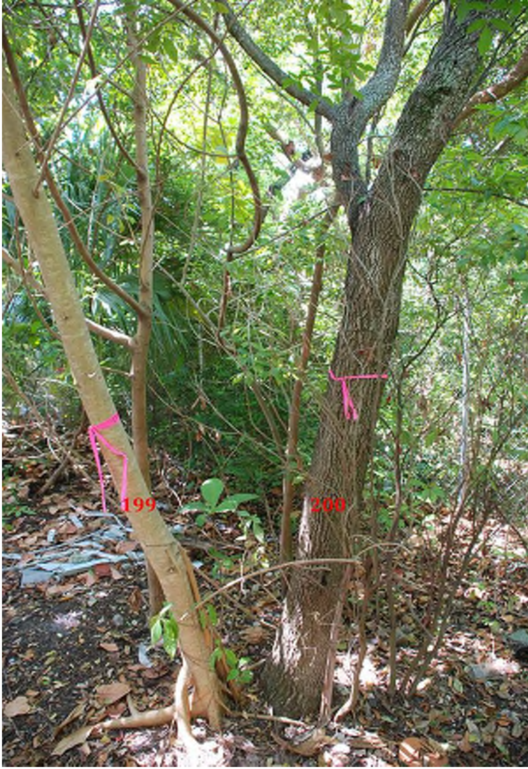
Photo 99 above is trees 199 & 200.