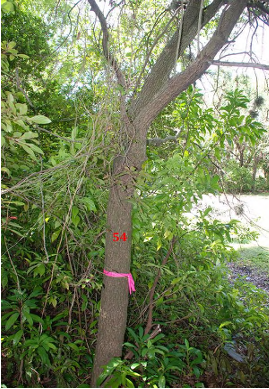
Photo 28 above is tree 54.