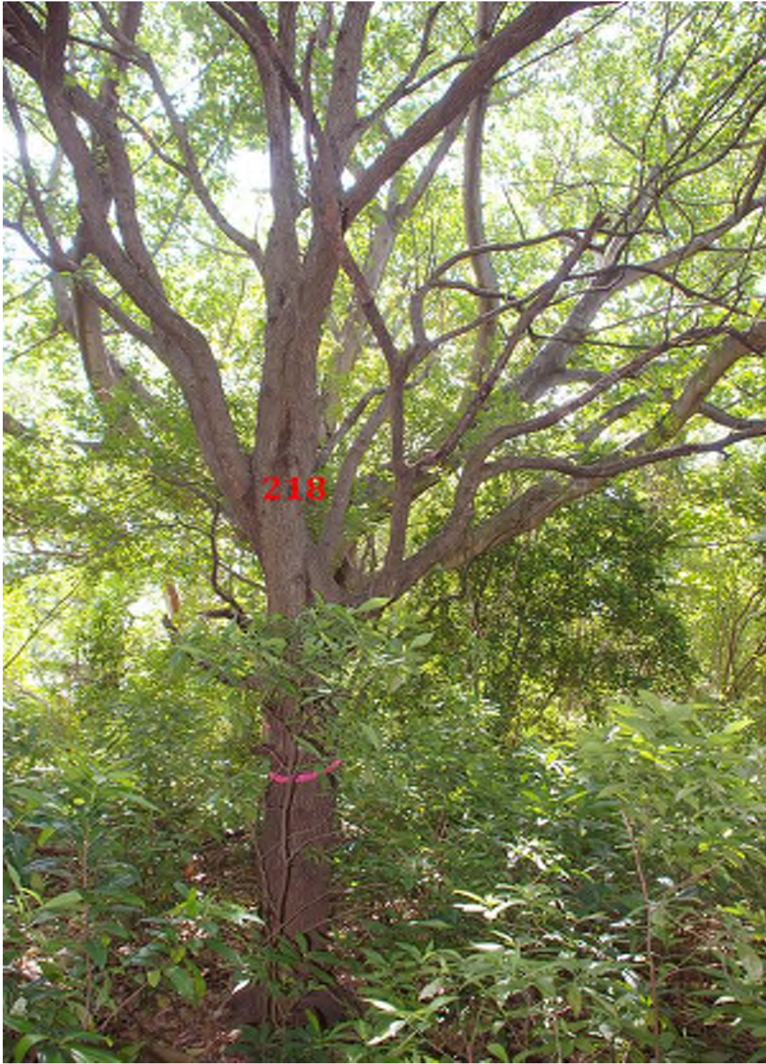
Photo 112 above is tree 218.