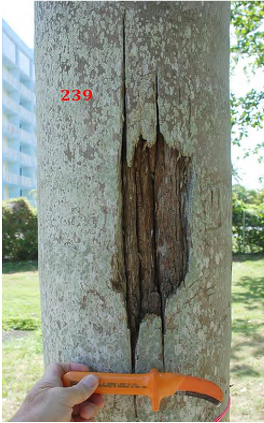
Photo 134 above is the cracked and damaged trunk of palm 239. This palm should be removed. The orange knife is 7 inches in length.