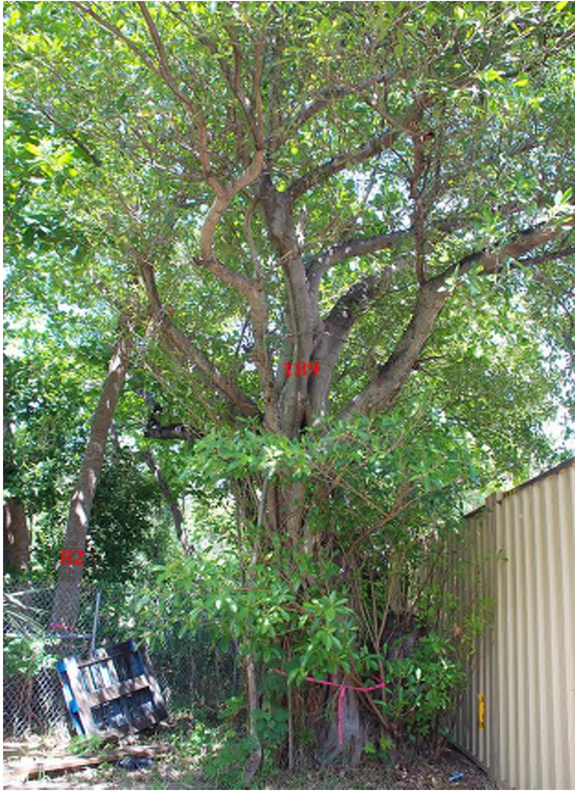
Photo 94 above is tree 189 viewed from the east.