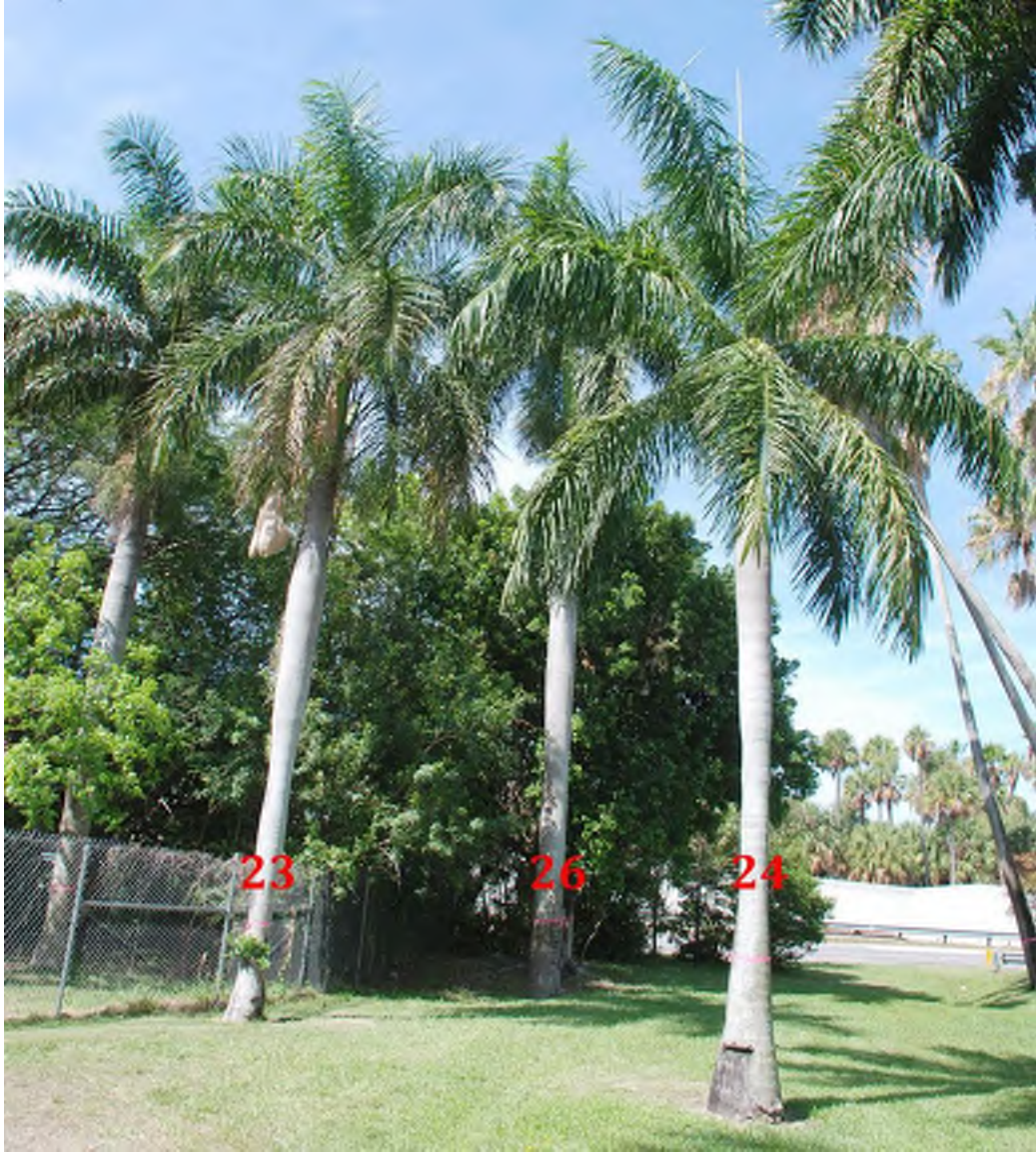
Photo 12 above is palms 23, 24 & 26.