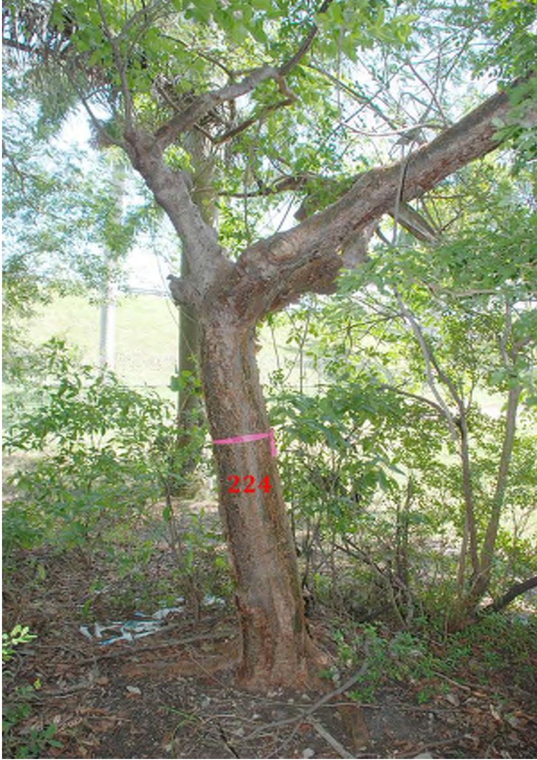
Photo 119 above is tree 224.