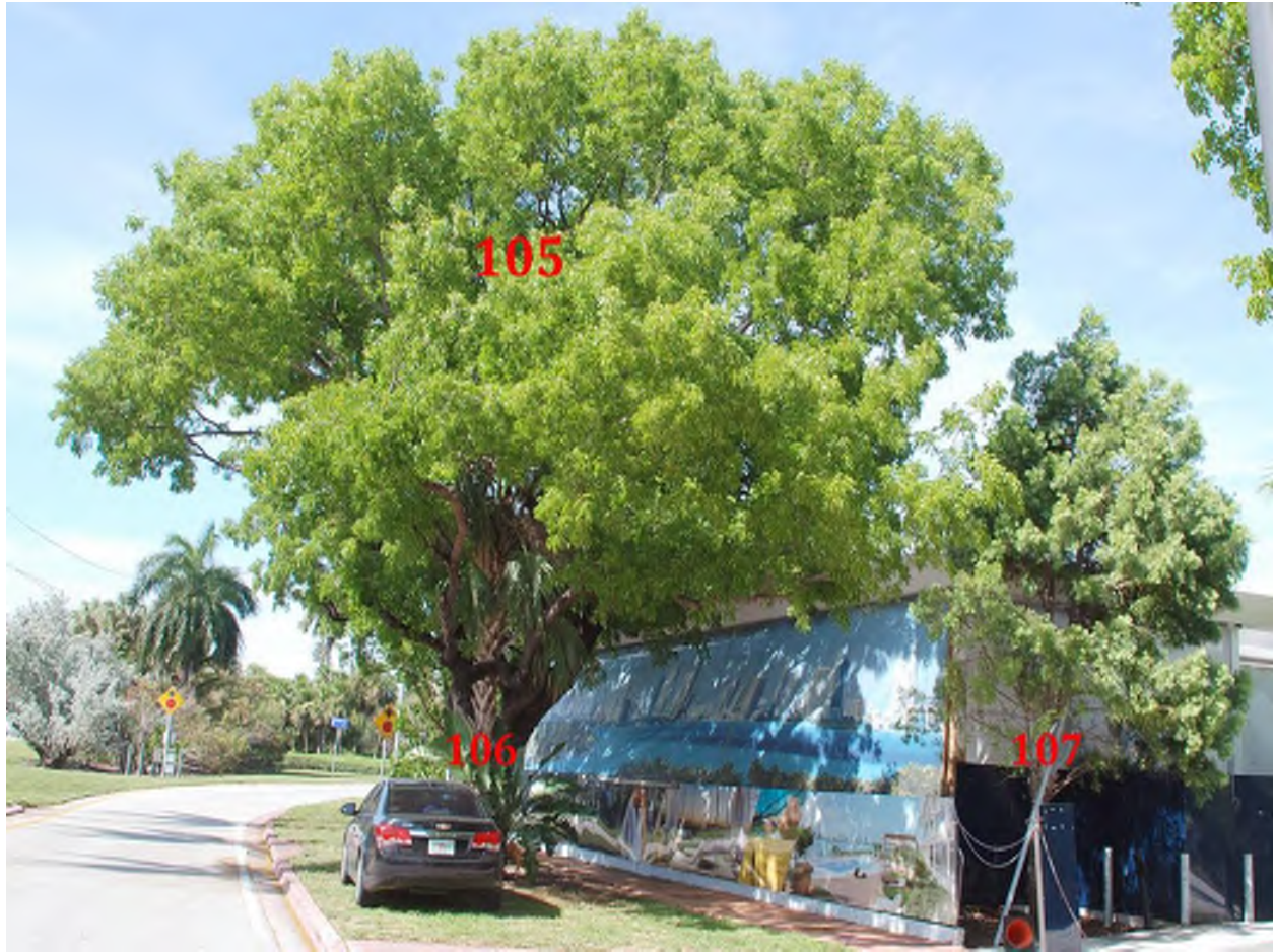
Photo 64 above is tree 105 viewed from the north.