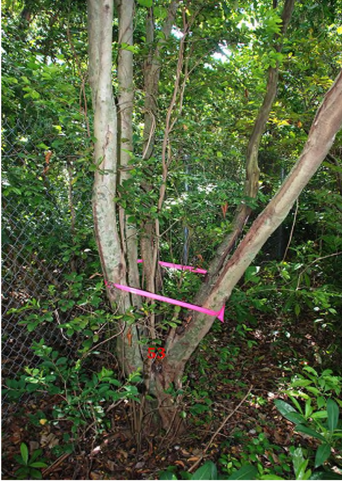
Photo 27 above is tree 53.