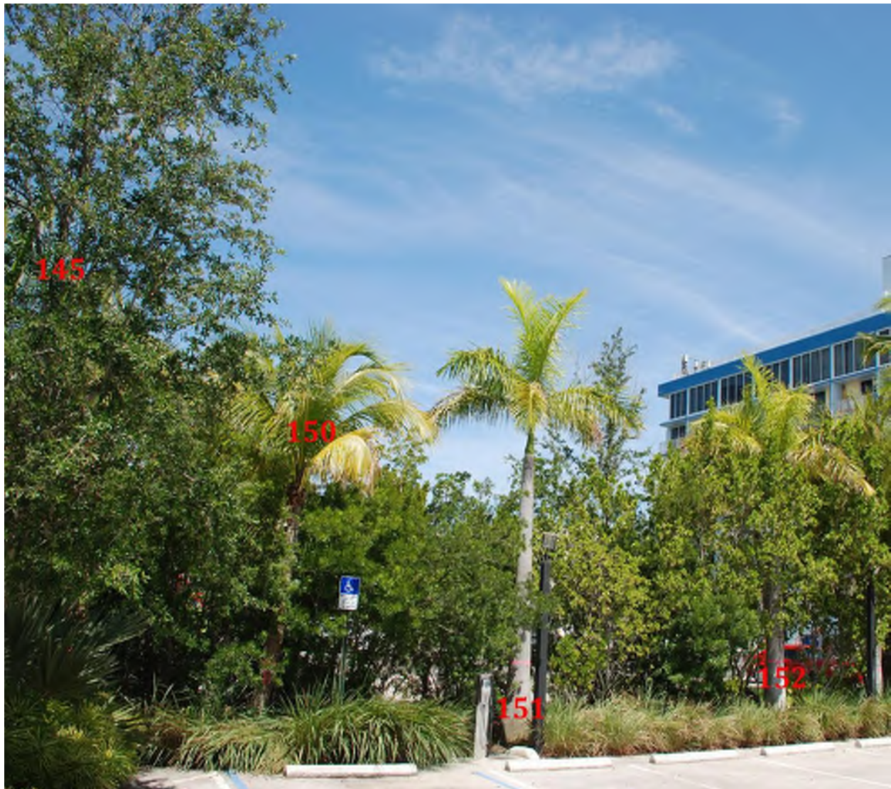
Photo 80 above is palms 150, 151 & 152 with signs of nutrient deficiencies.