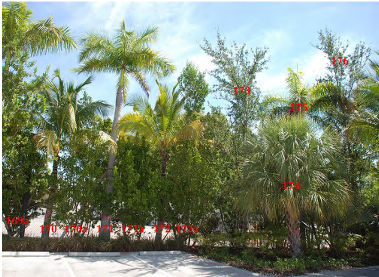
Photo 85 above is palms 171, 172 & 175 showing signs of severe nutrient deficiencies.