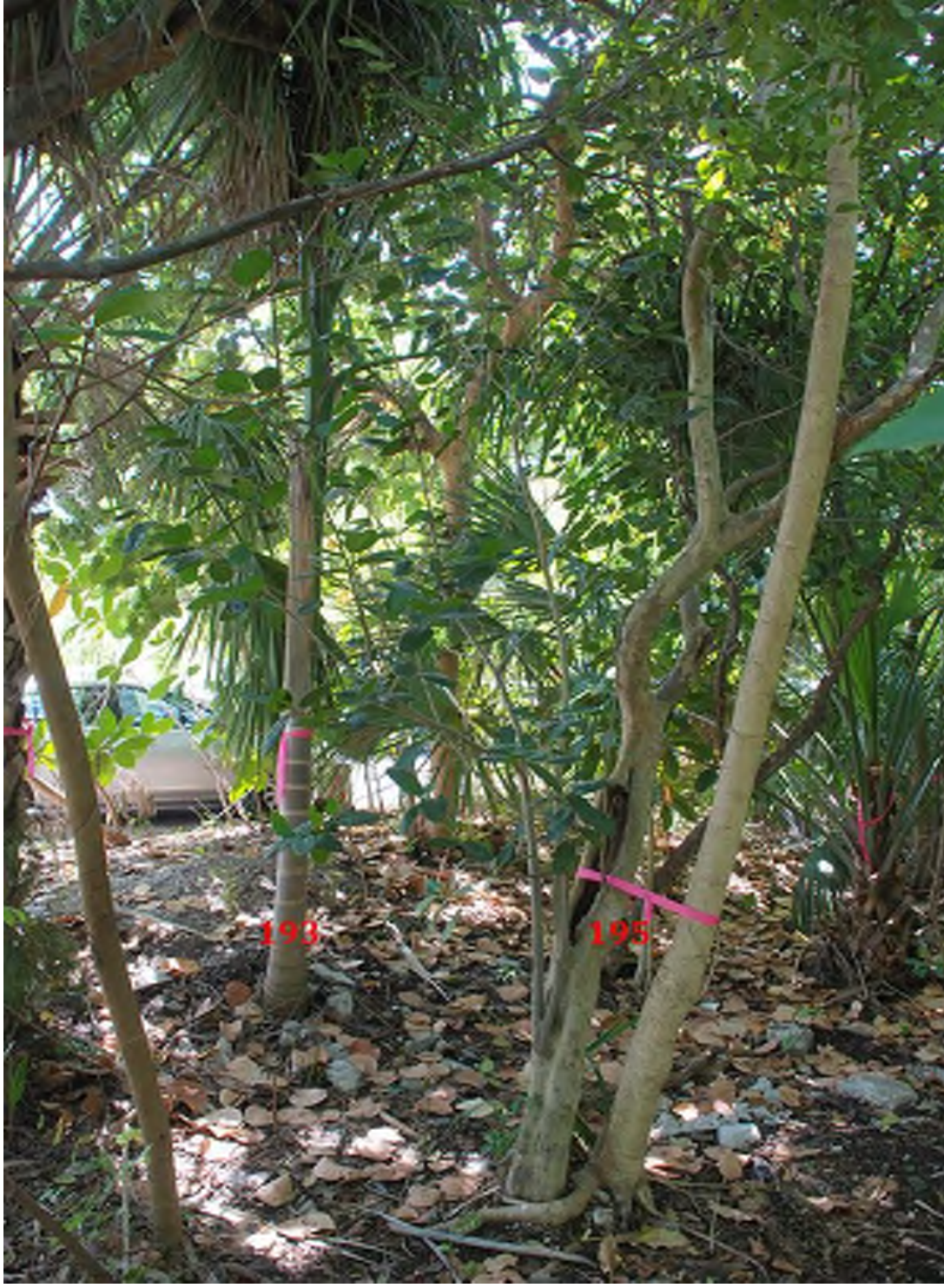
Photo 97 above is palm 193 & tree 195.