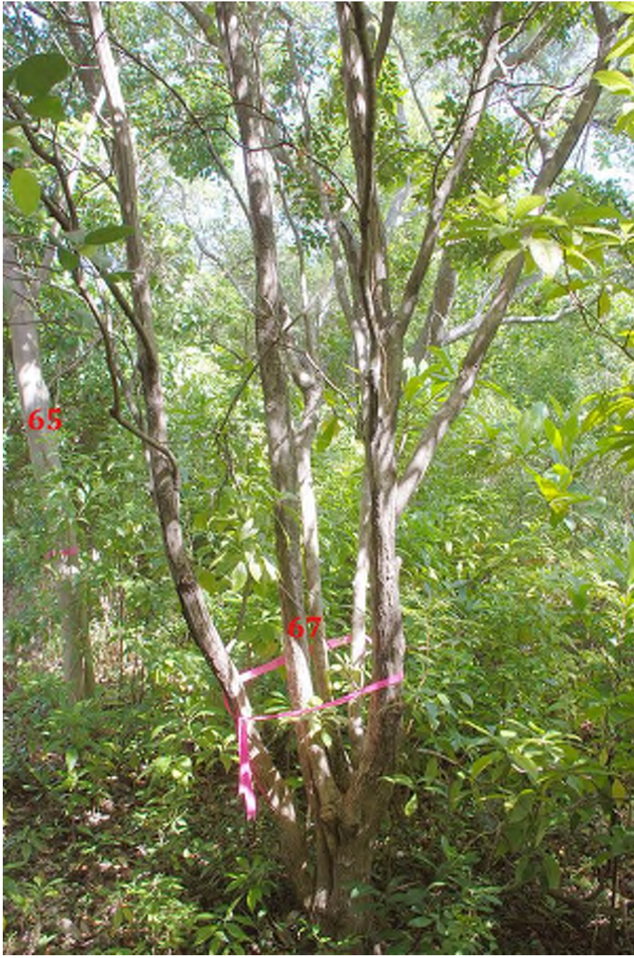
Photo 36 above is tree 67.