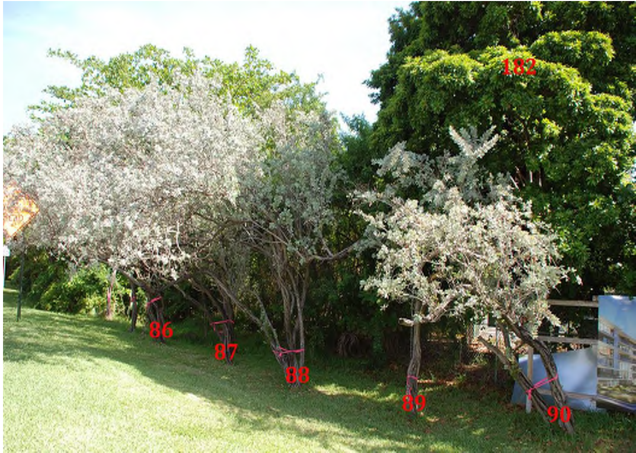
Photo 53 above is trees 86 through 90.