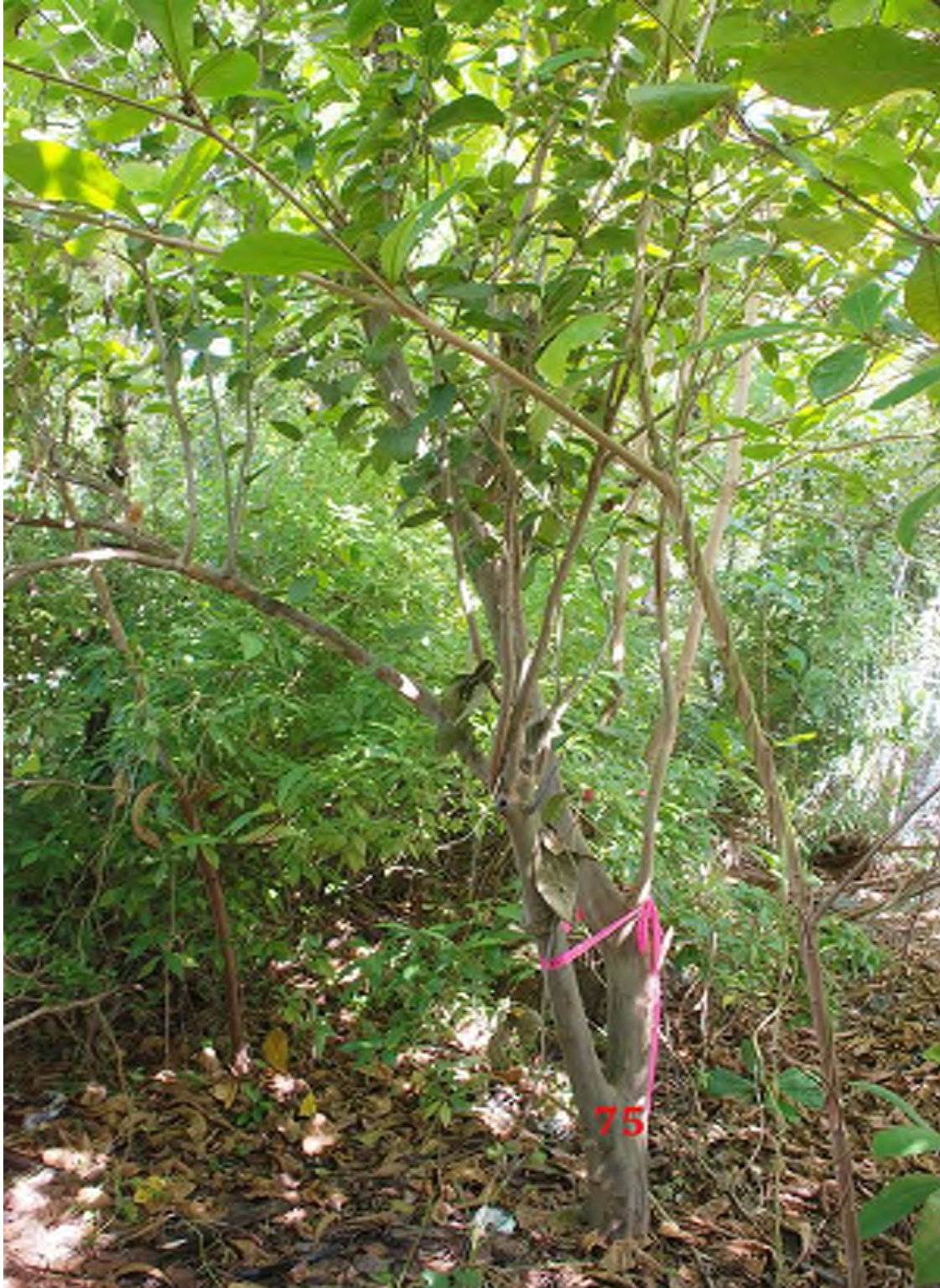
Photo 45 above is tree 75.