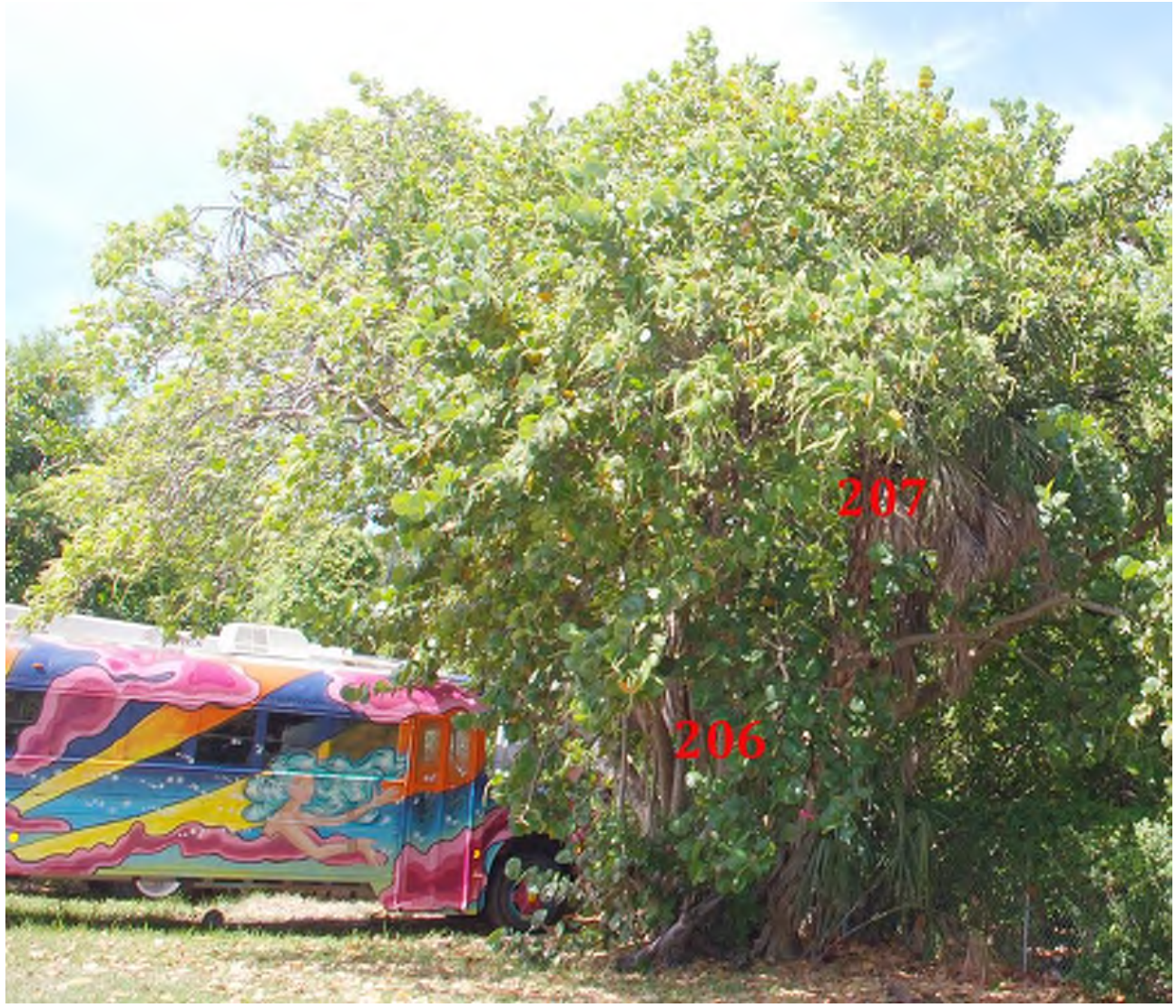
Photo 104 above is tree 206 & palm 207.