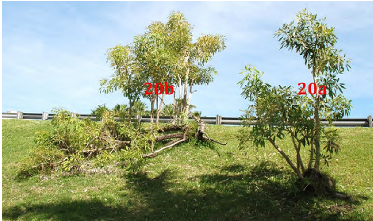
Photo 9 above is trees 20a & 20b. Both had trunks that previously failed and are now coppicing (producing new trunks).