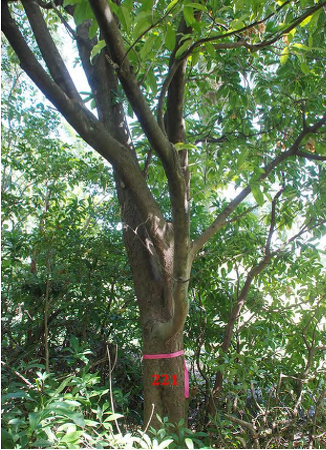
Photo 115 above is tree 221. I noted no signs of active decay or cavities on the trunk or root collar of this tree.