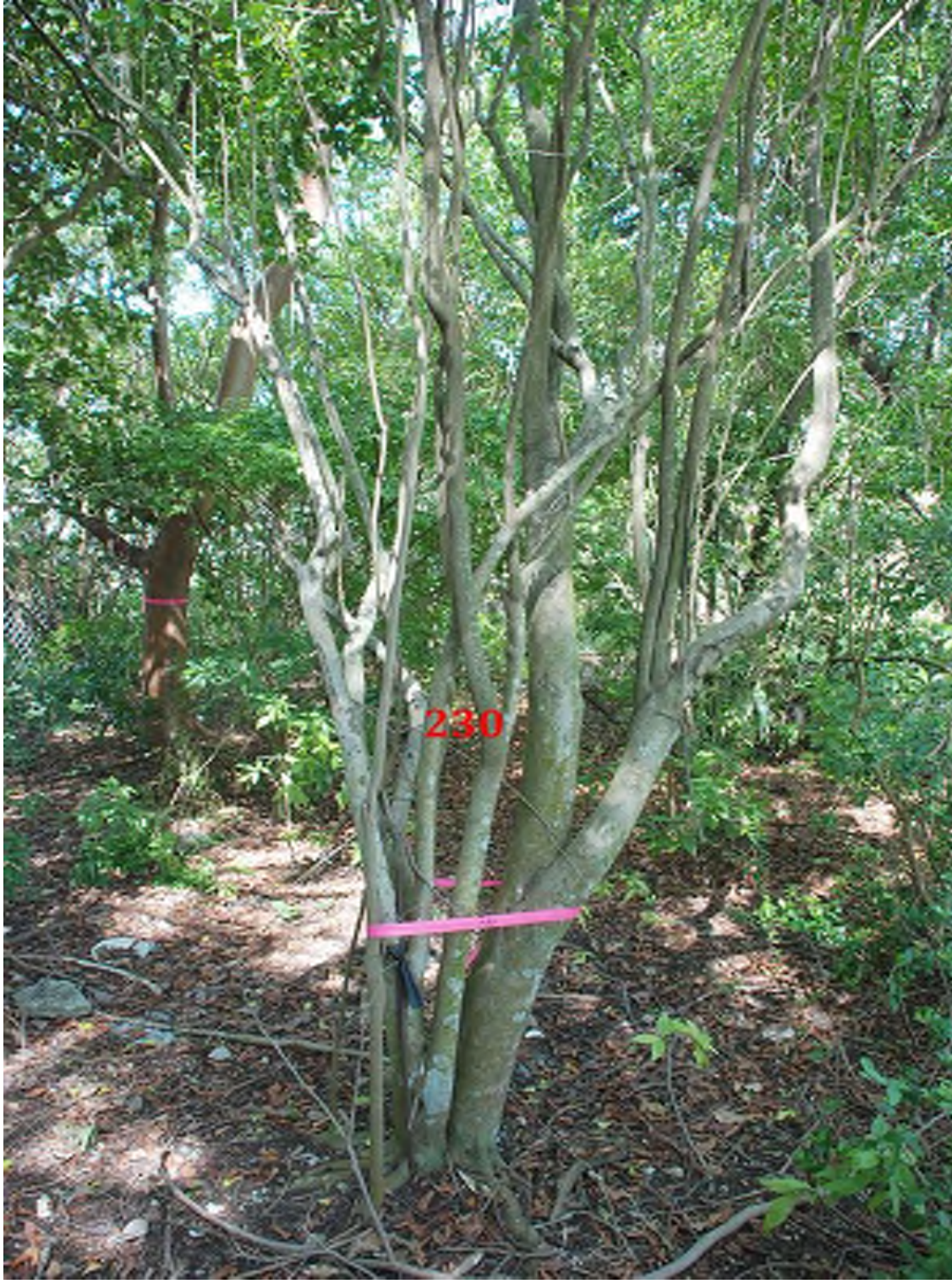
Photo 126 above is tree 230.