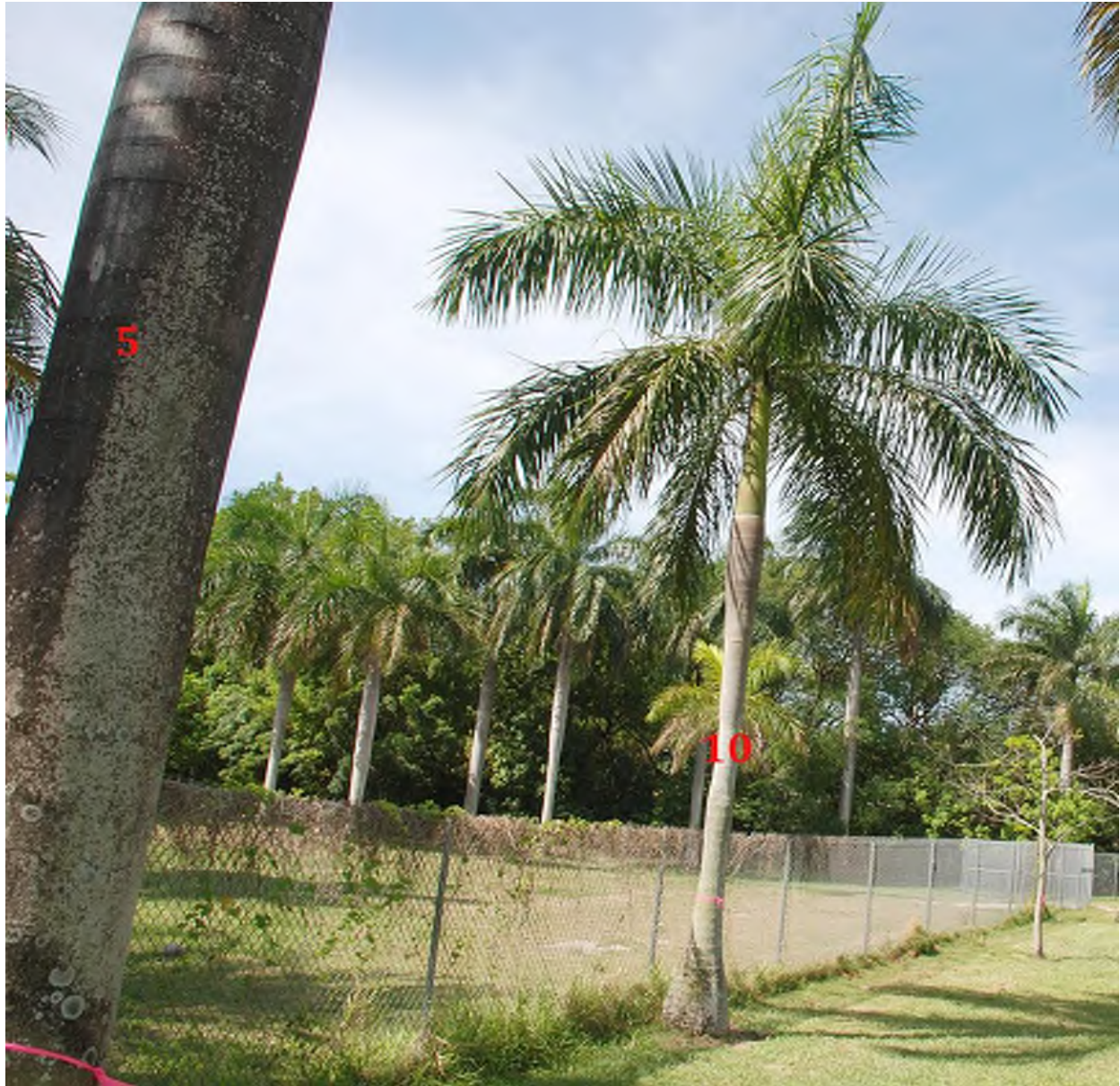
Photo 5 above is palm 10. See following photo.