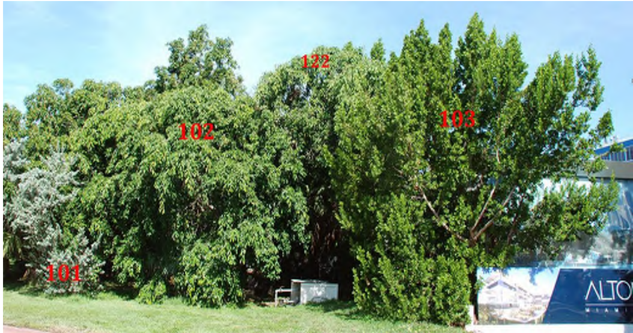
Photo 60 above is trees 101, 102, 103 & 122 viewed from the south.