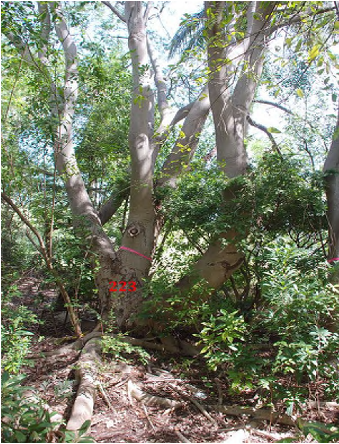
Photo 117 above is tree 223 viewed from the west.