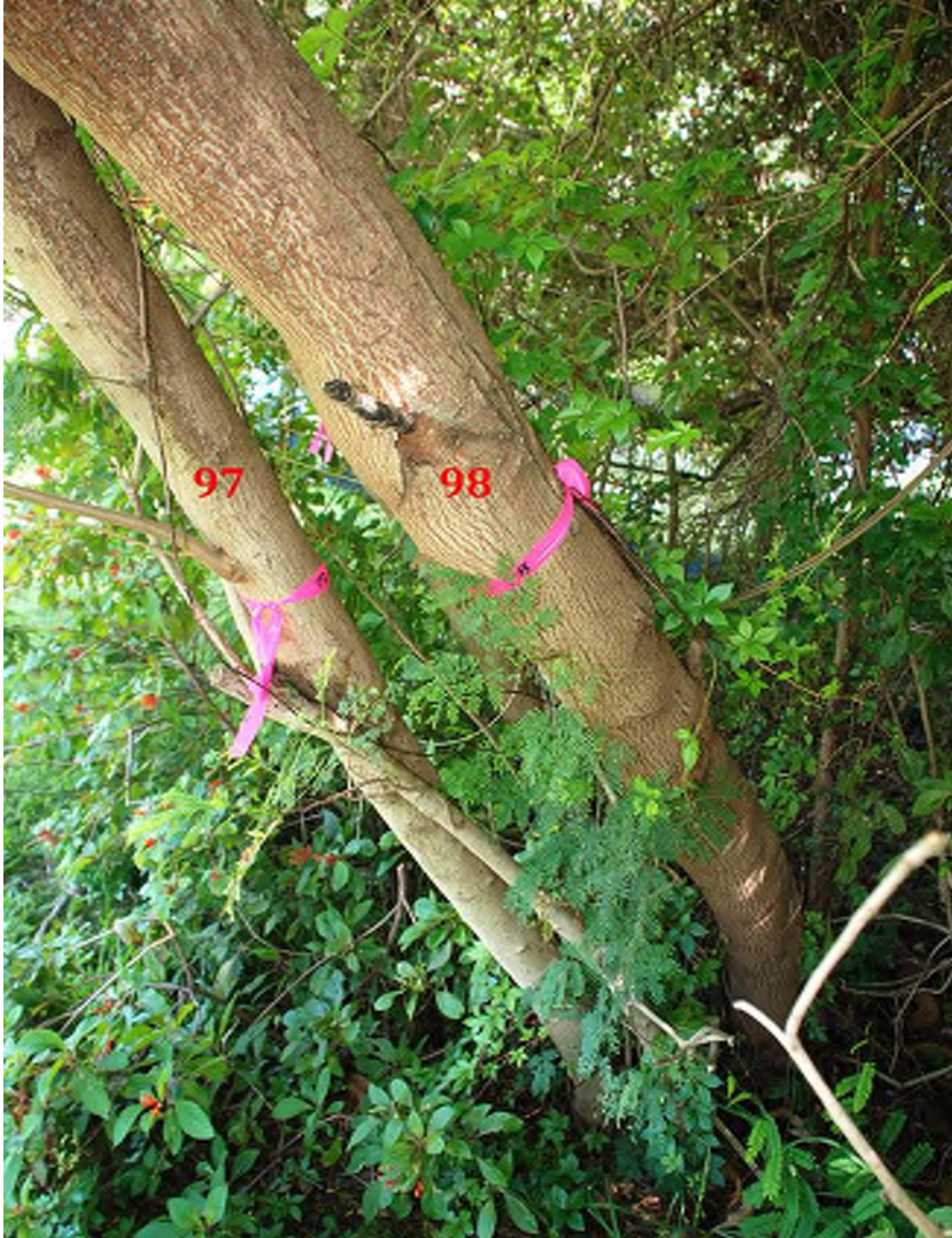
Photo 58 above is trees 97 & 98.