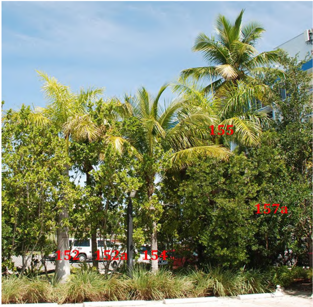
Photo 82 above is palms 152, 154 & 155.