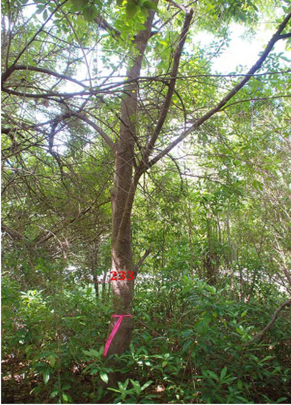
Photo 129 above is tree 233.