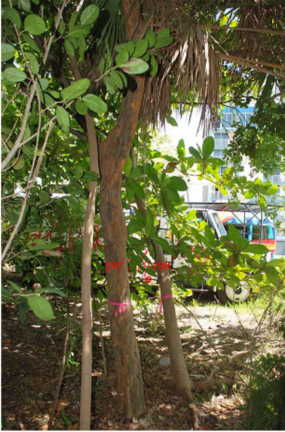
Photo 98 above is trees 197 & 198.