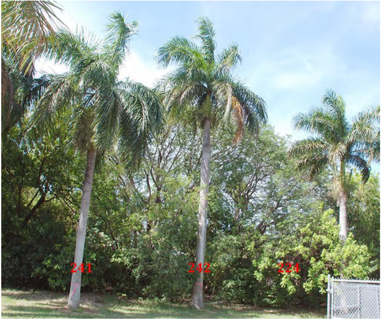
Photo 135 above is palms 241 & 242 and tree 224.