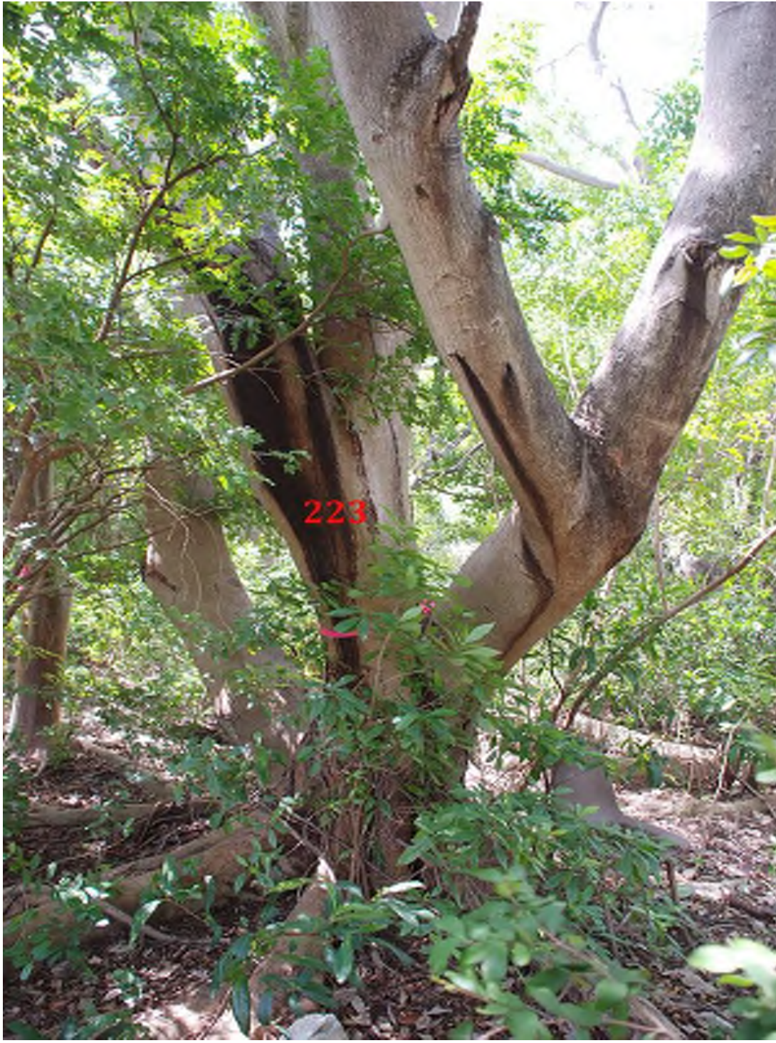
Photo 118 above is tree 223 viewed from the east. I noted no signs of active decay or cavities on the trunk or root collar of this tree.