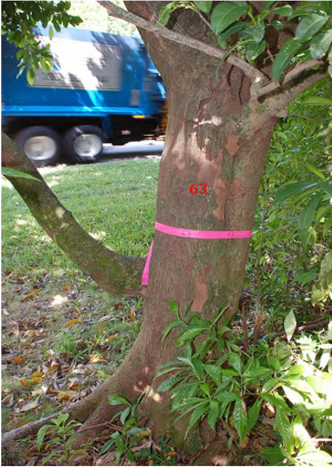
Photo 33 above is tree 63 with no signs of decay or cavities on the trunk or root collar.