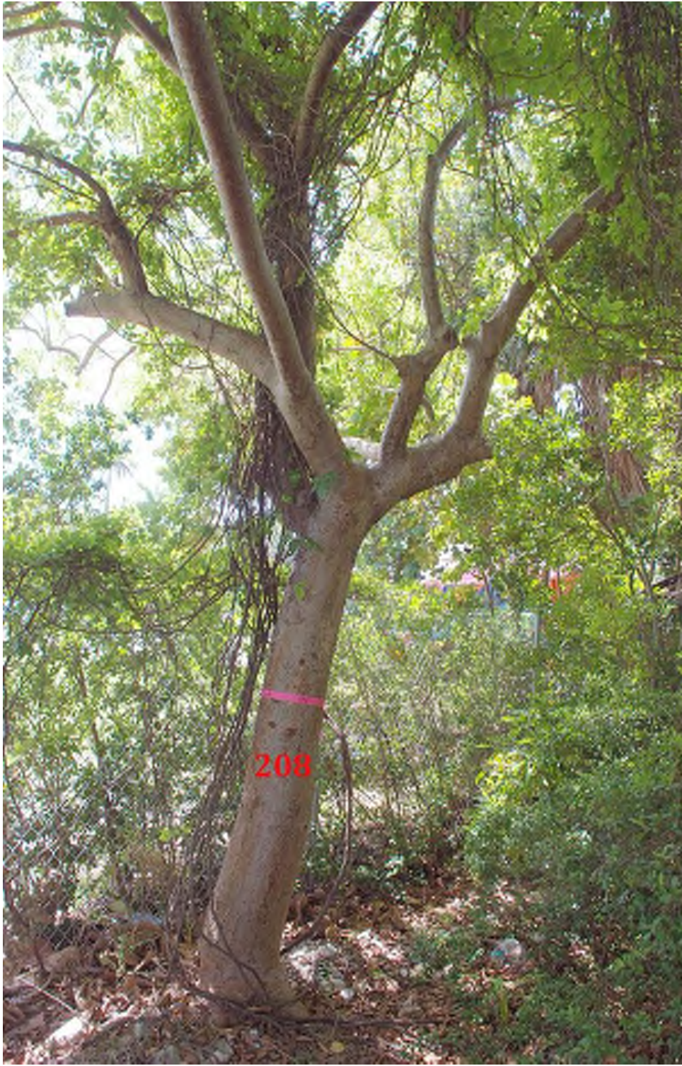
Photo 105 above is tree 208.