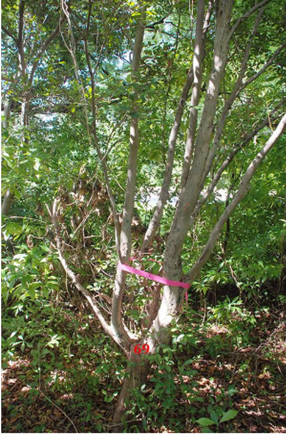
Photo 38 above is tree 69.