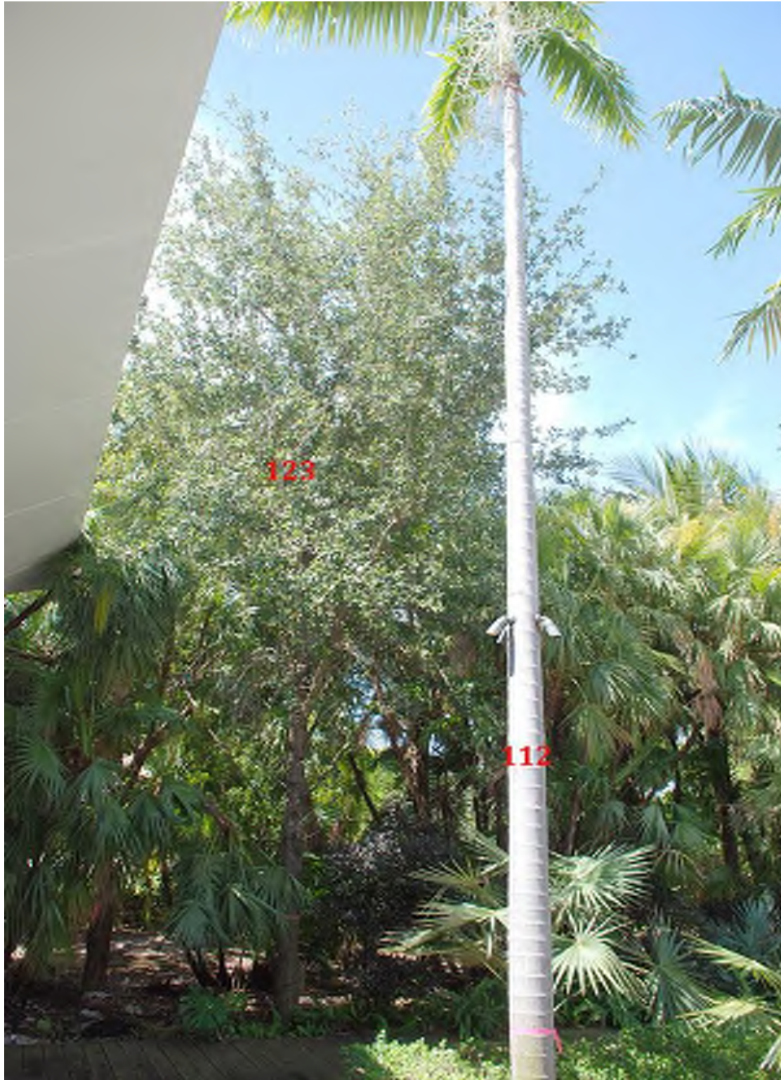
Photo 74 above is palm 112 & tree 123.