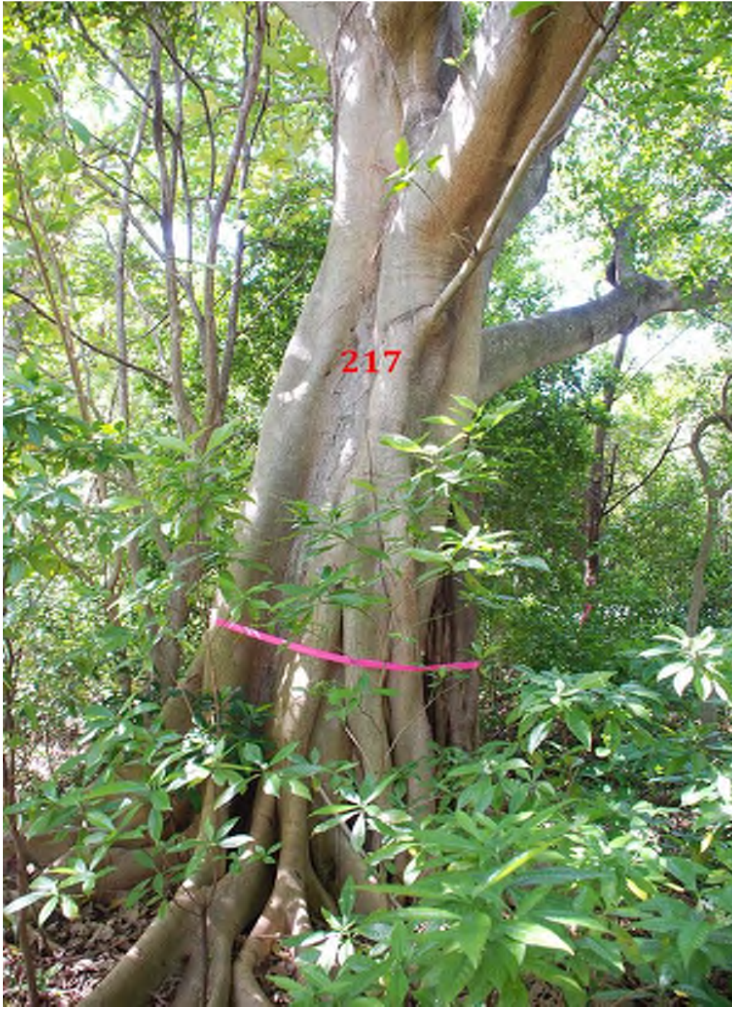
Photo 110 above is tree 217 viewed from the west. I noted no signs of active decay or cavities on the trunk or root collar of this tree.