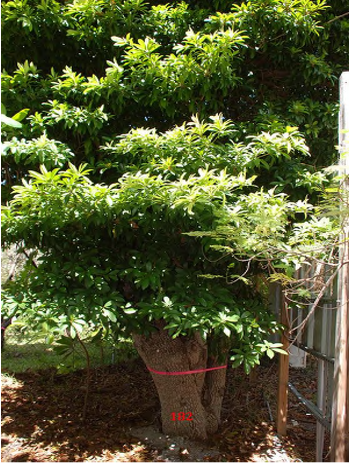
Photo 92 above is the trunk of tree 182 with no signs of cavities or active decay on the trunk or root collar.