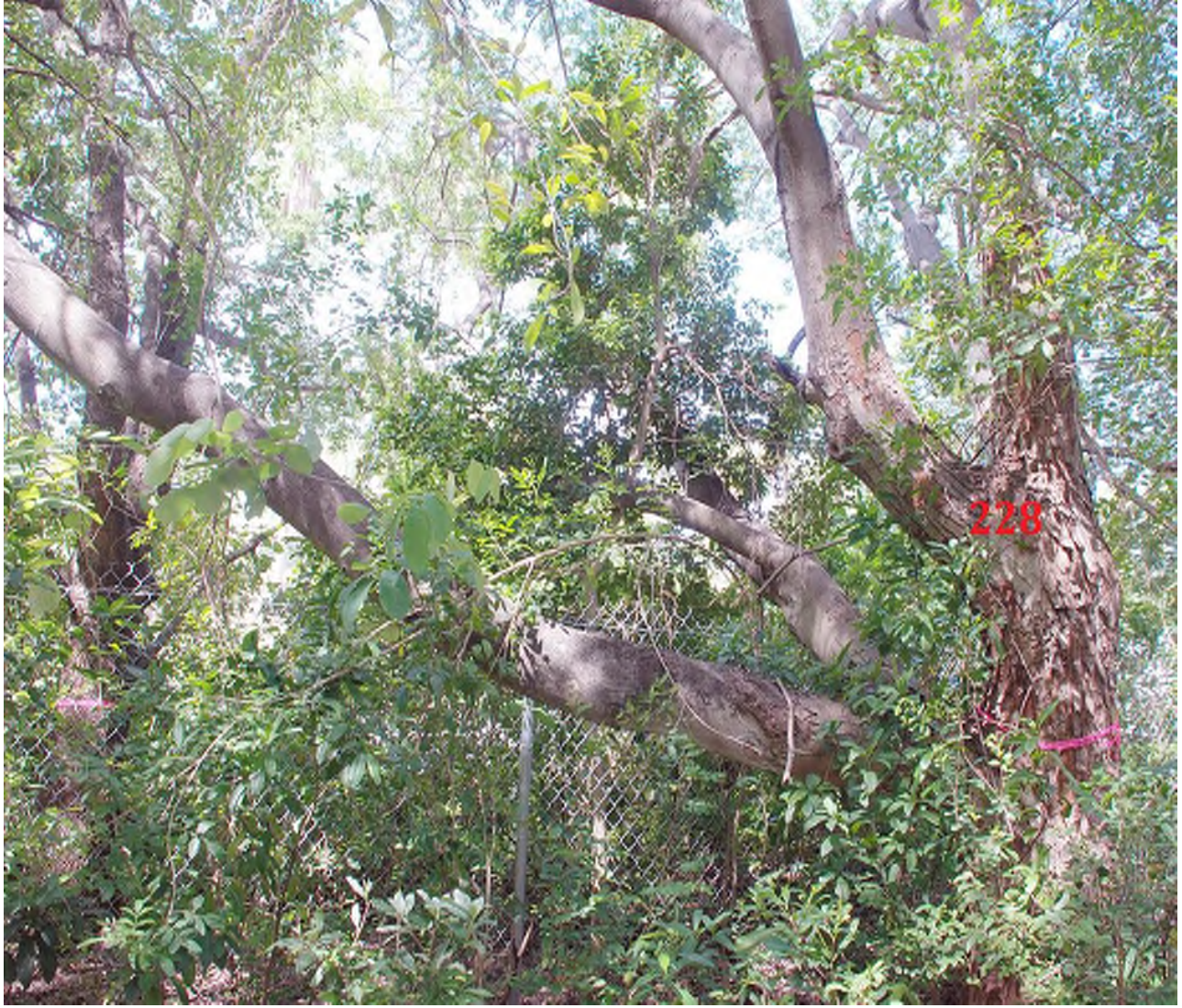
Photo 124 above is tree 228 viewed from the northeast.