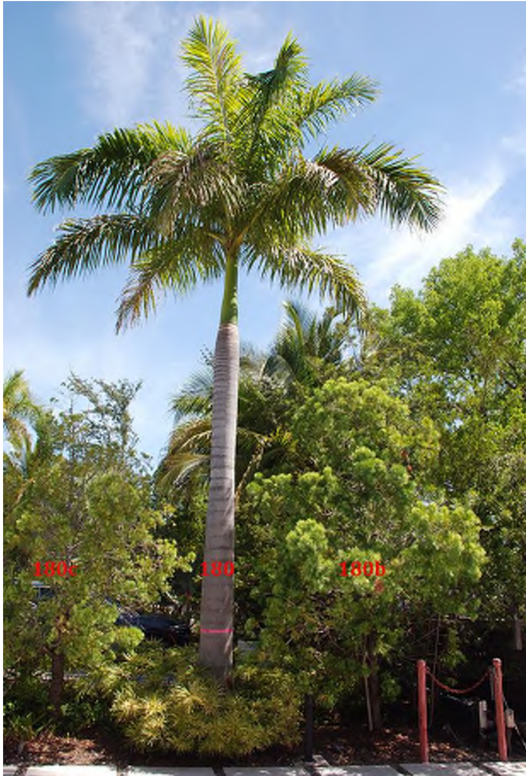
Photo 88 above is trees 180b & 180c and palm 180.