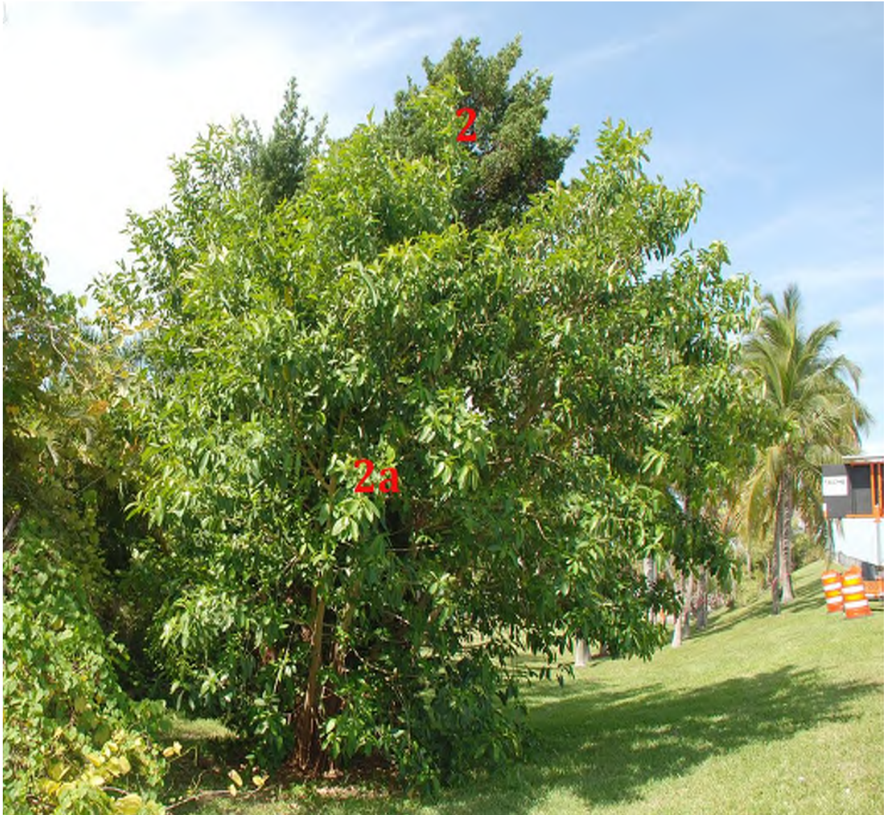
Photo 2 above is tree 2 that is becoming enveloped by a strangler fig, tree 2a. The “trunks” for tree 2a are not yet self-supporting. If tree 2 was removed, tree 2a would fail.