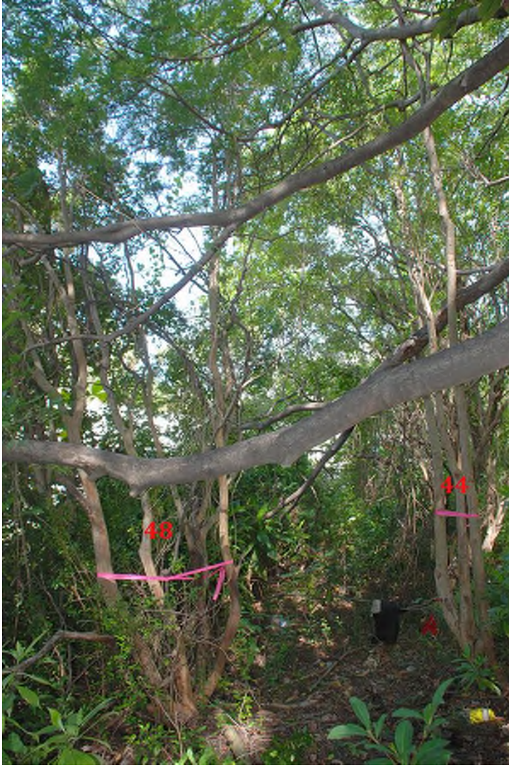
Photo 21 above is trees 44 & 48.