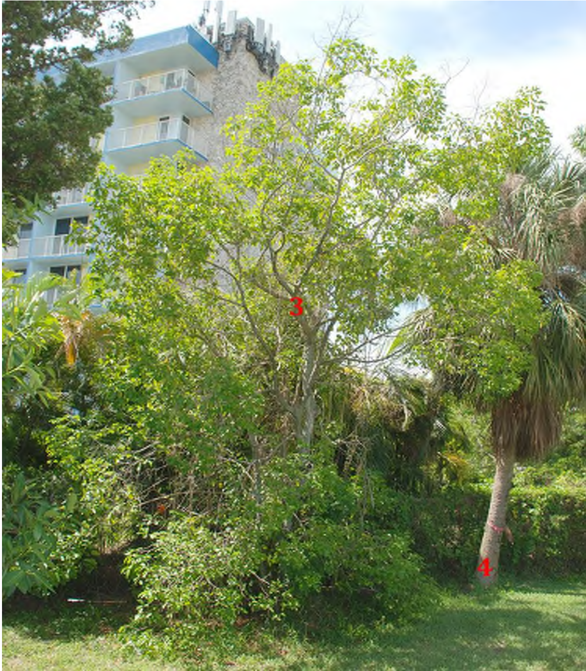
Photo 3 above is tree 3.