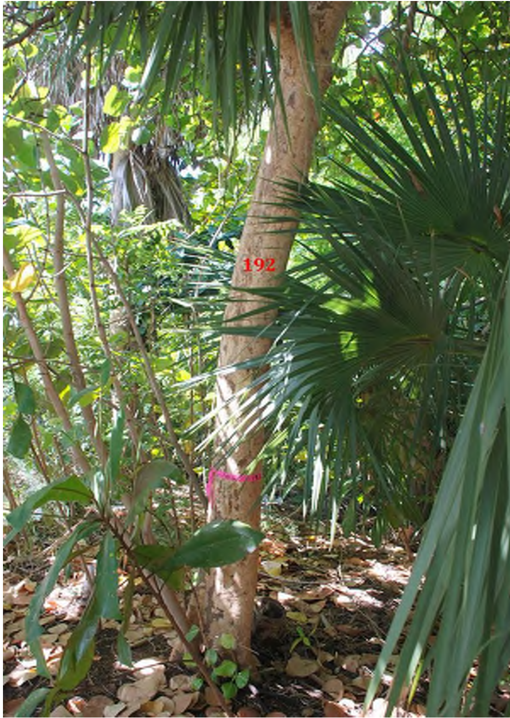
Photo 95 above is tree 192.