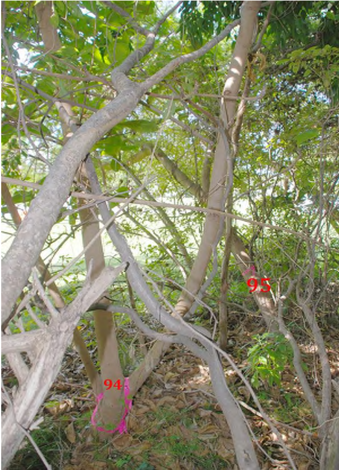
Photo 56 above is trees 94 & 95.