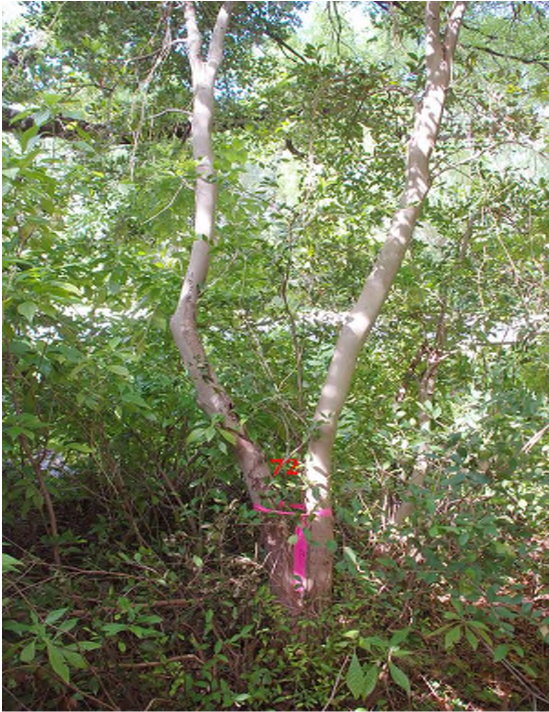
Photo 41 above is tree 72.