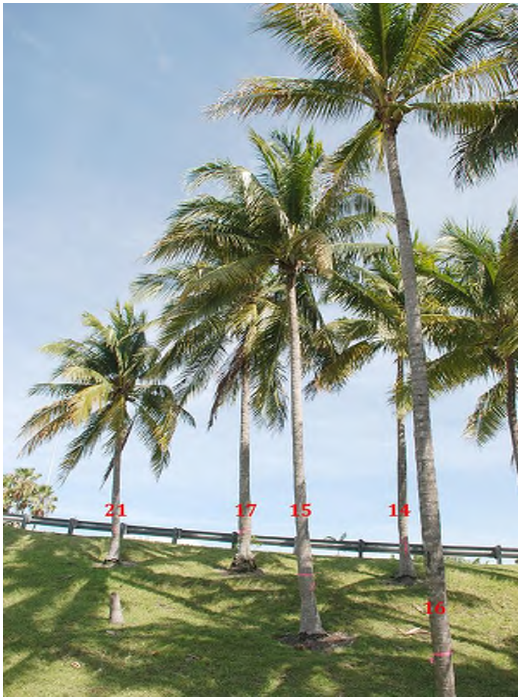
Photo 10 above is palms 14, 15, 16, 17 & 21.