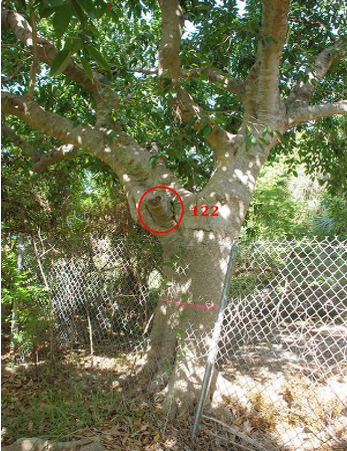
Photo 73 above is the trunk of tree 122 with an old pruning cut indicated that does not appear to be actively decaying.