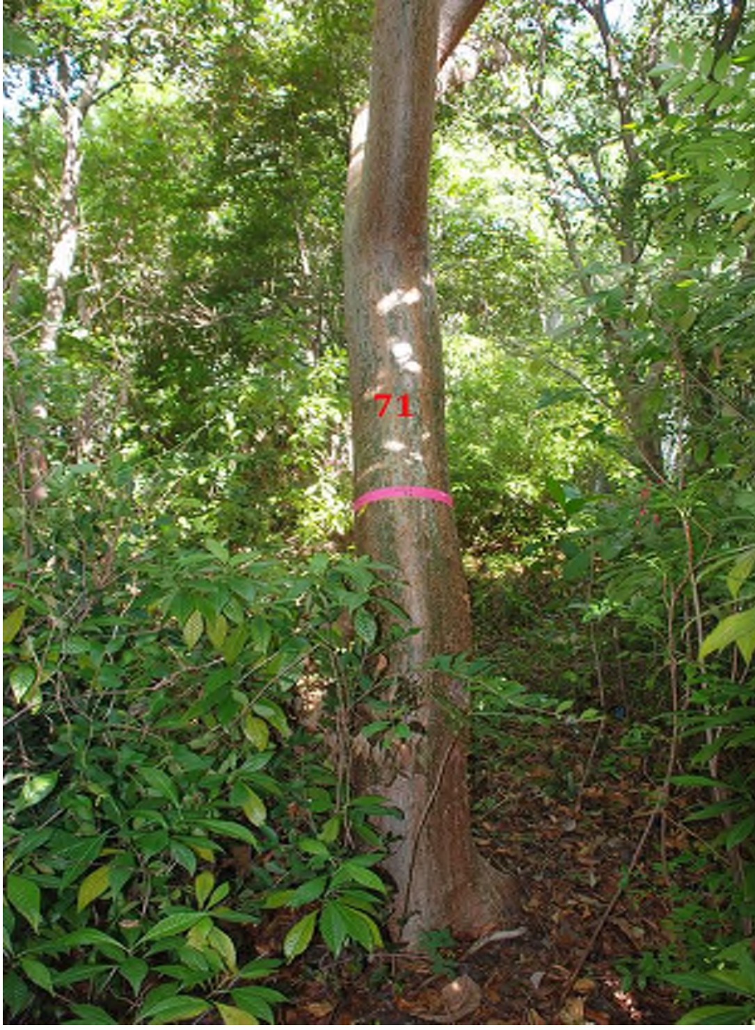
Photo 40 above is tree 71 with no signs of decay or cavities on the trunk or root collar.