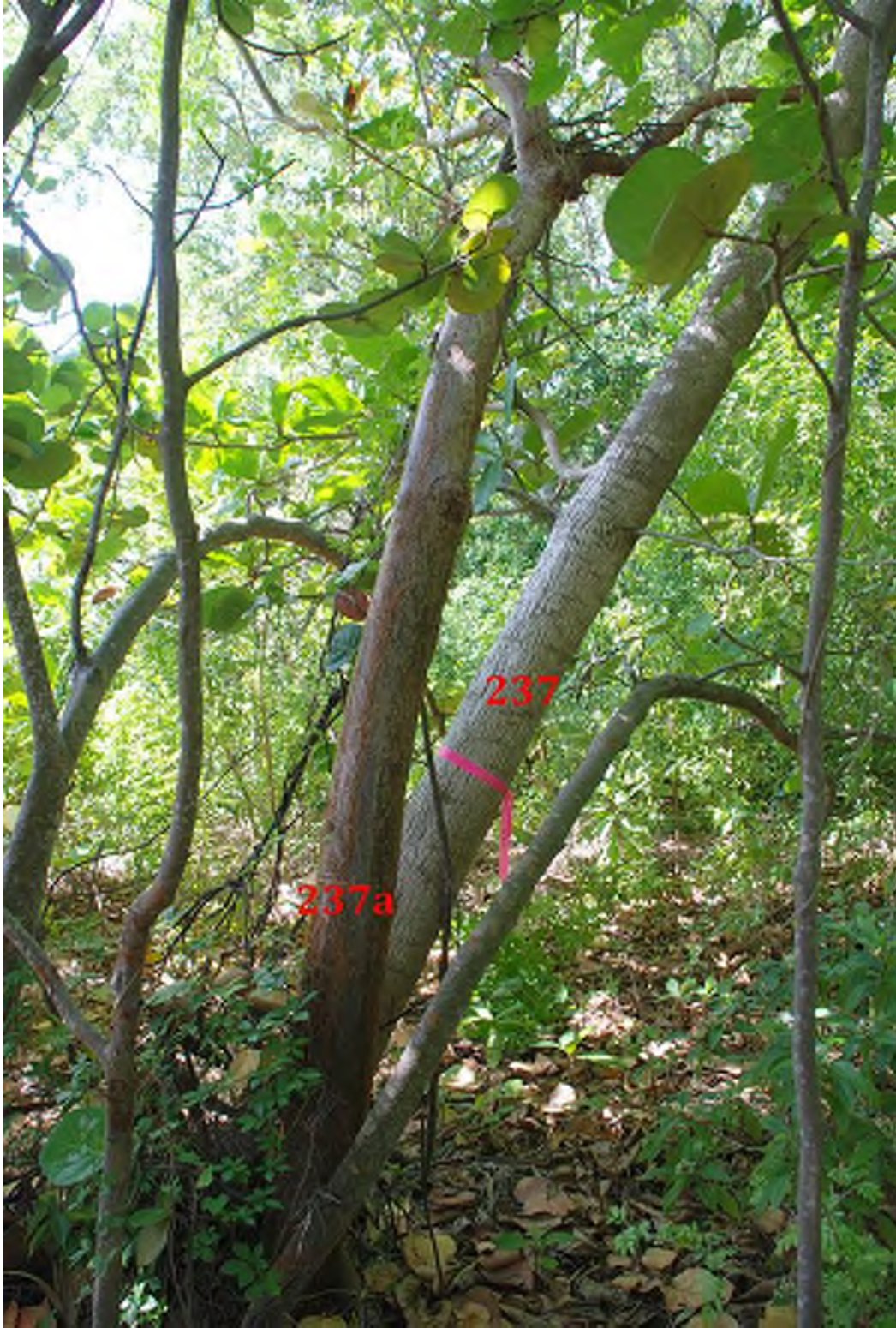
Photo 131 above is trees 237 & 237a.