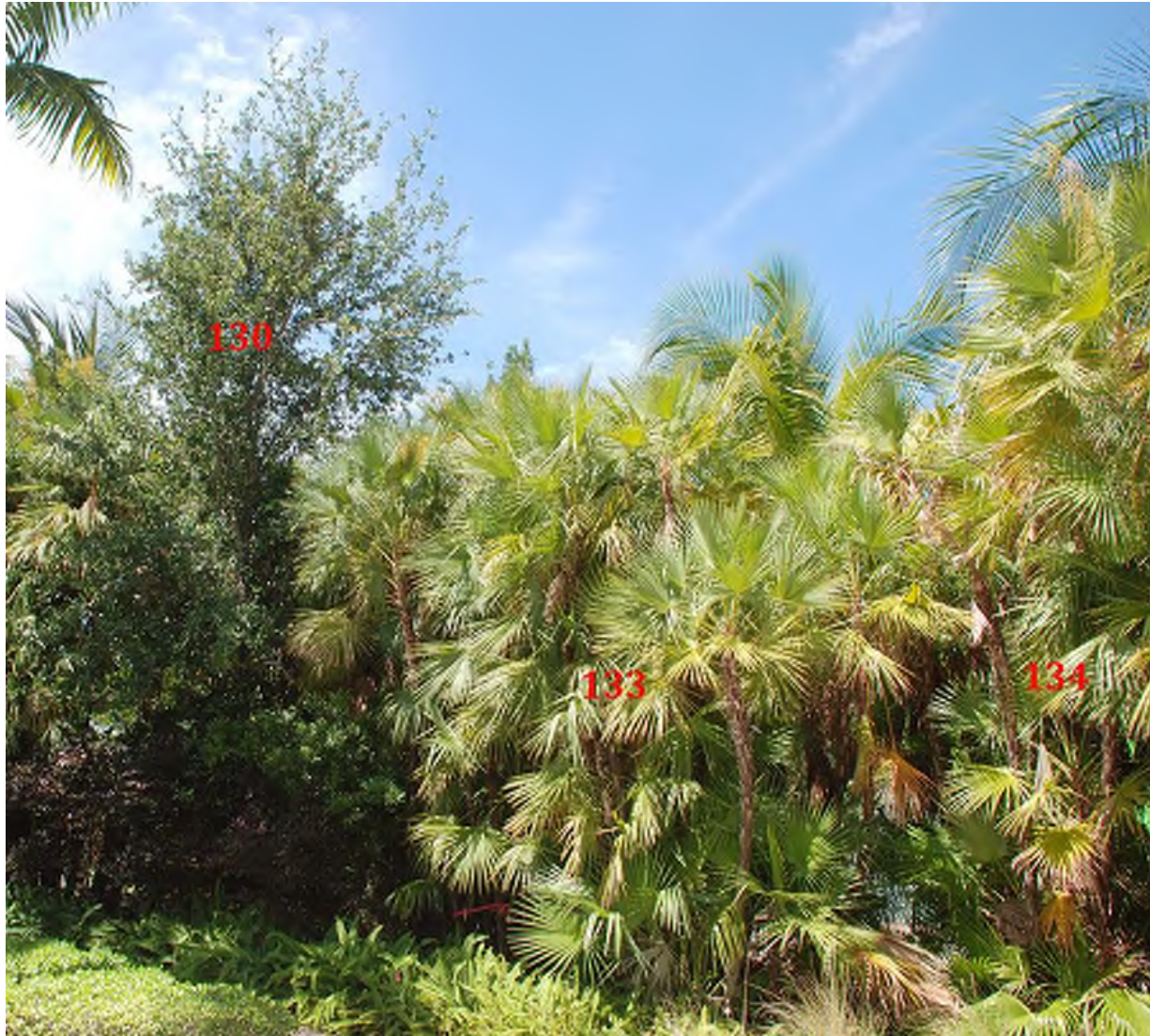
Photo 76 above is palms 133 & 134 and tree 130.