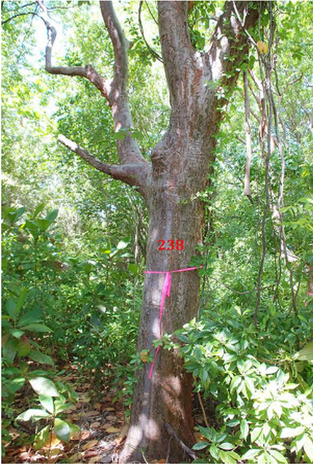
Photo 132 above is tree 238.