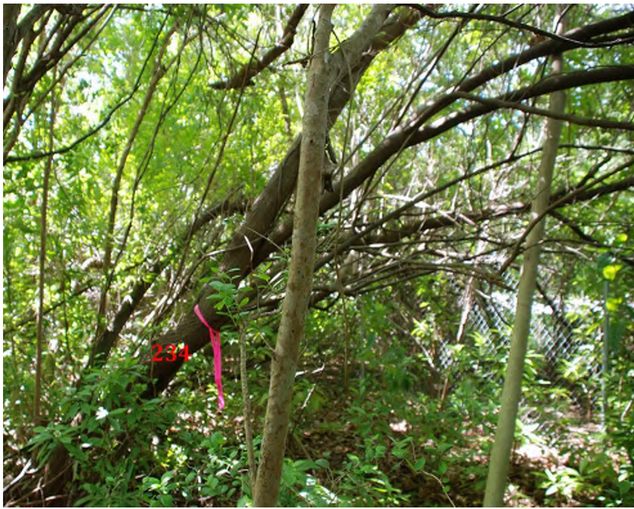
Photo 130 above is invasive species 234.