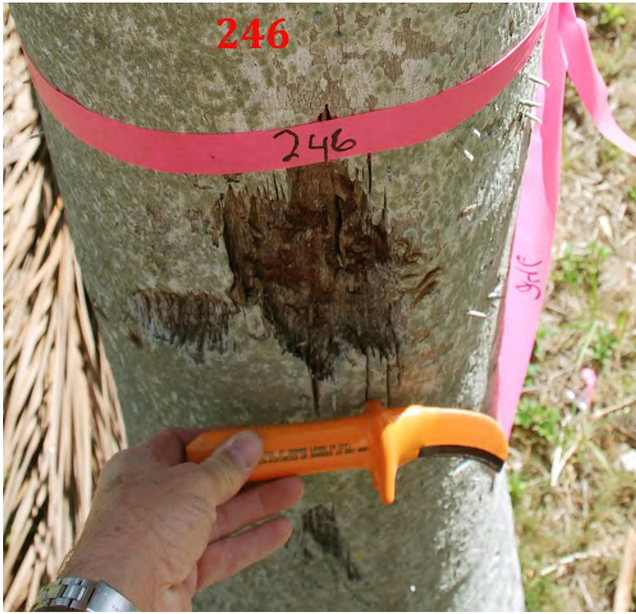
Photo 137 above is tree 246 with some superficial damage to the pseudobark of the trunks.