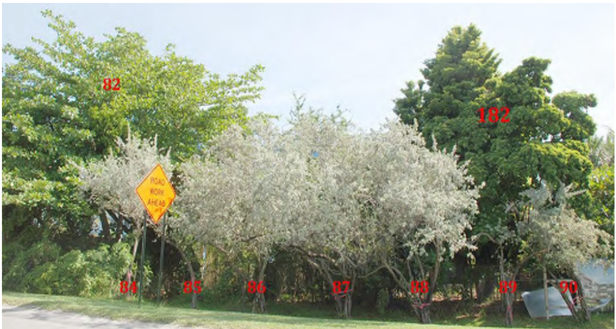
Photo 50 above is trees 84 through 90, and trees 82 & 182 viewed from the south.