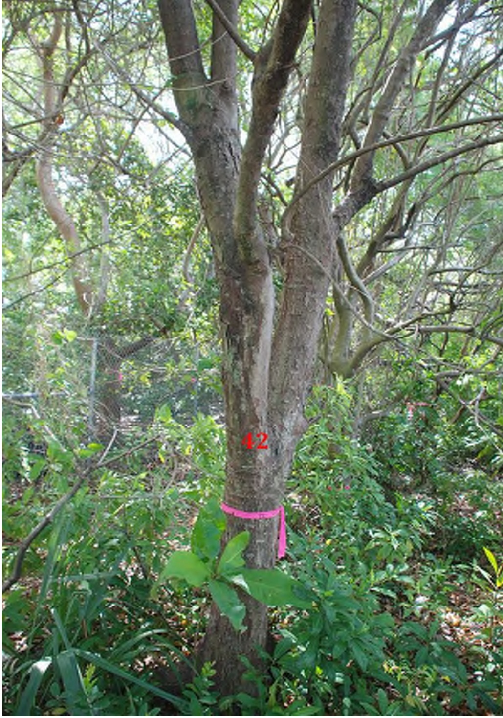
Photo 18 above is the trunk of tree 42.