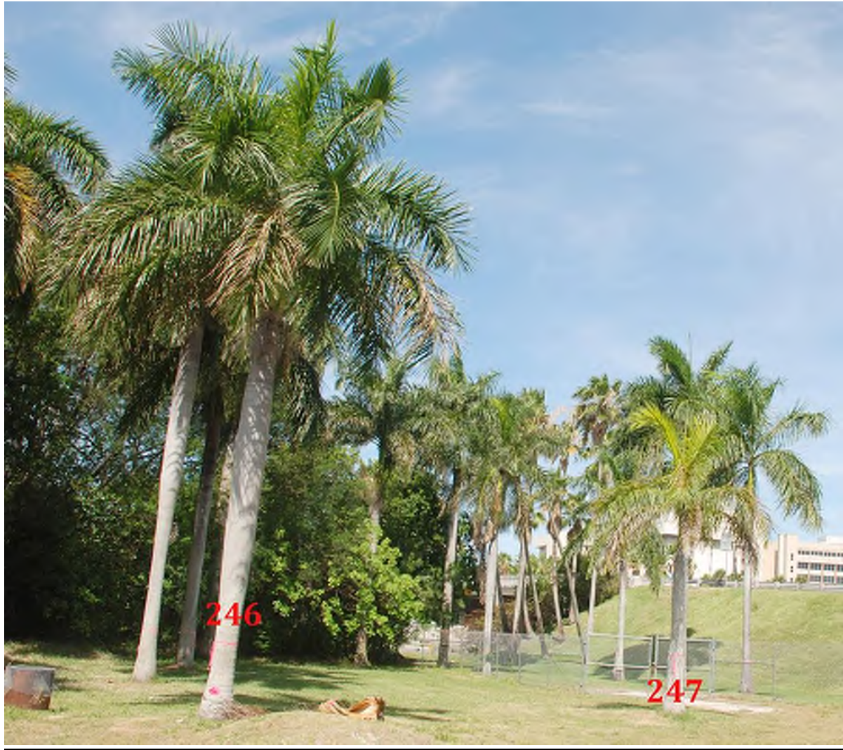
Photo 136 above is palms 246 & 247.