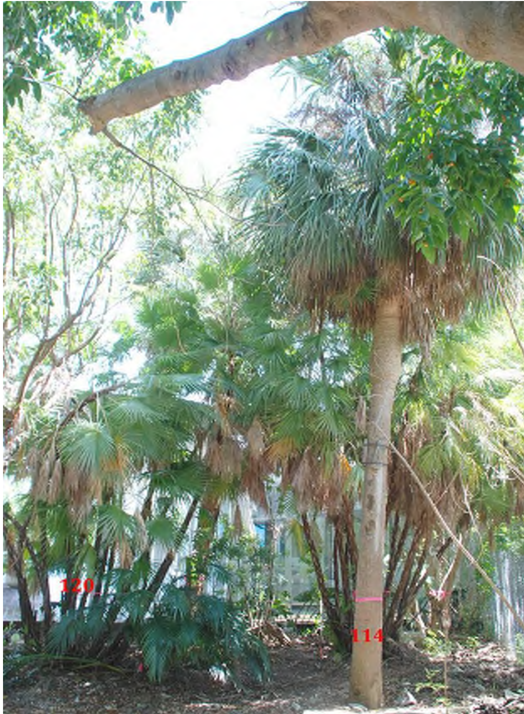
Photo 69 above is palms 114 & 120.