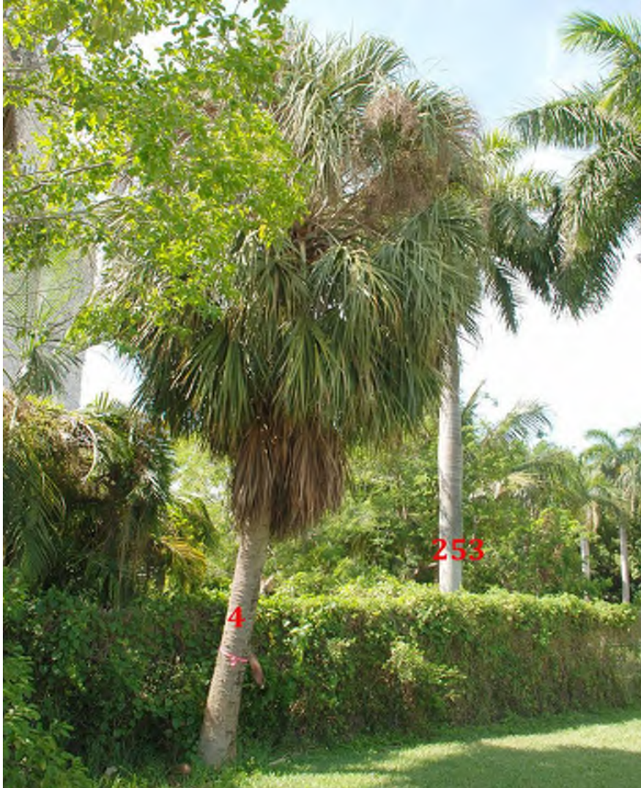
Photo 3 above is palms 4 & 253.