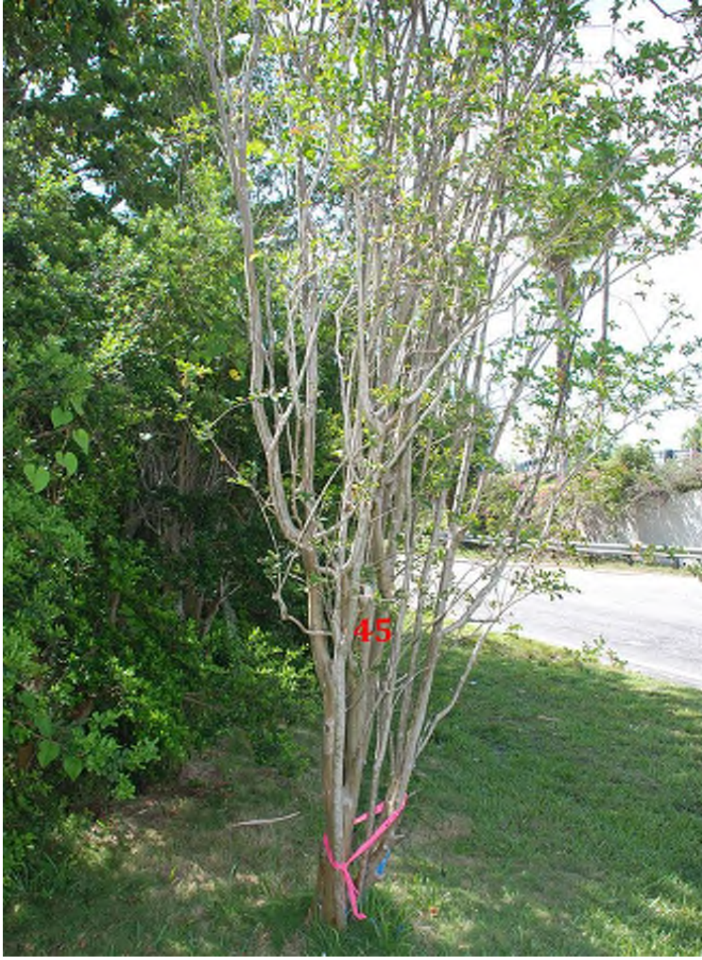
Photo 20 above is tree 45.