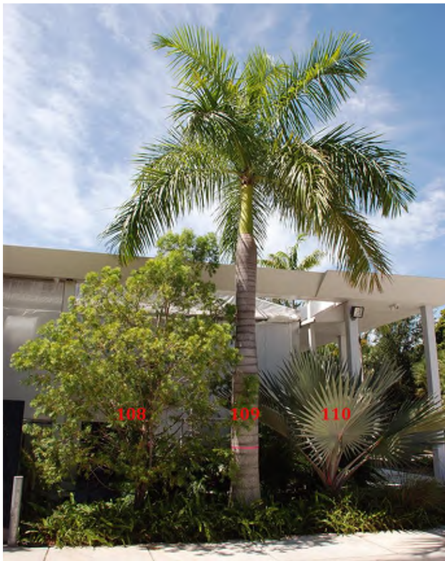
Phot0 67 above is tree 108 and palms 109 & 110.