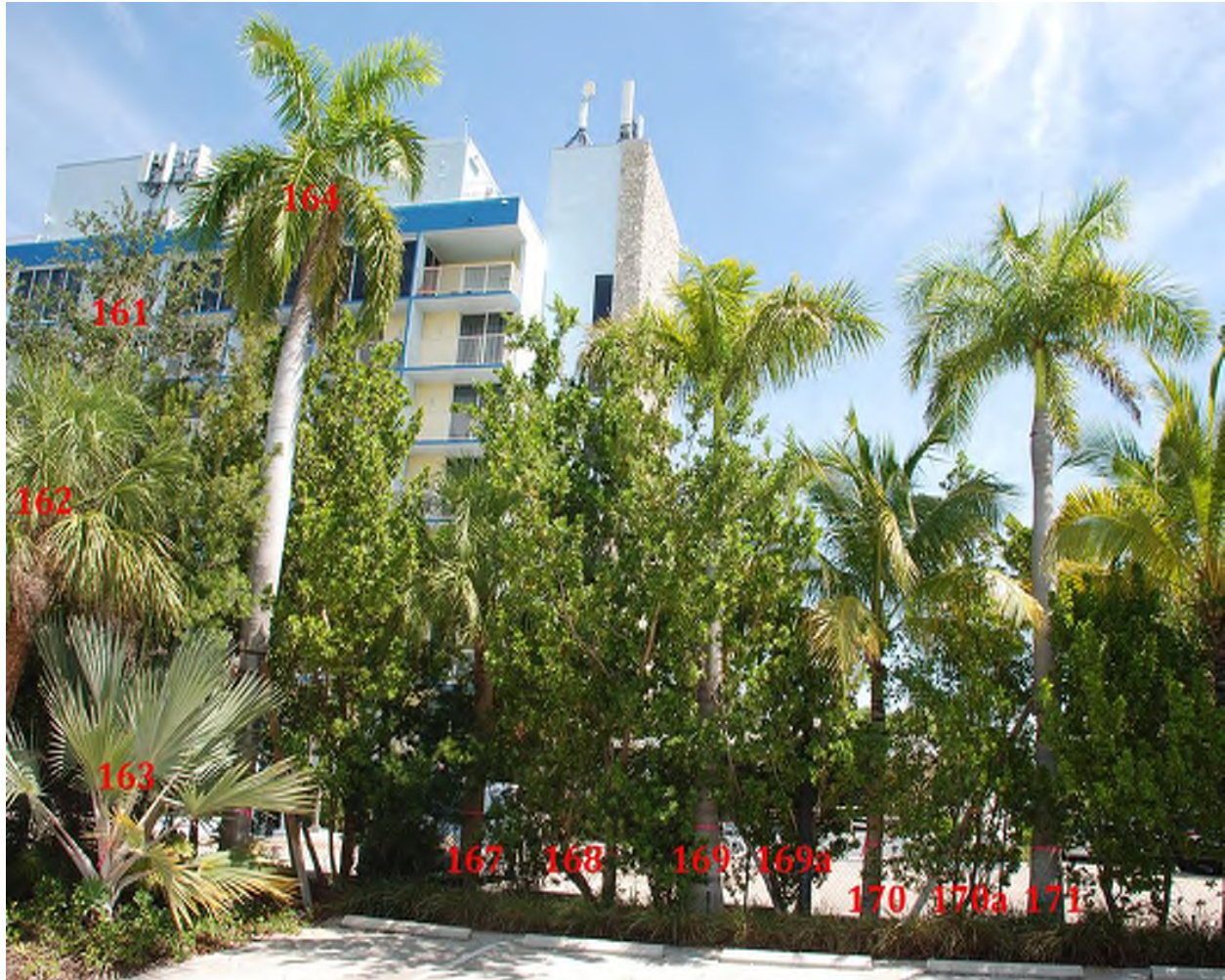
Photo 84 above is palms 164, 167, 169, 170 & 170 showing signs of nutrient deficiencies.