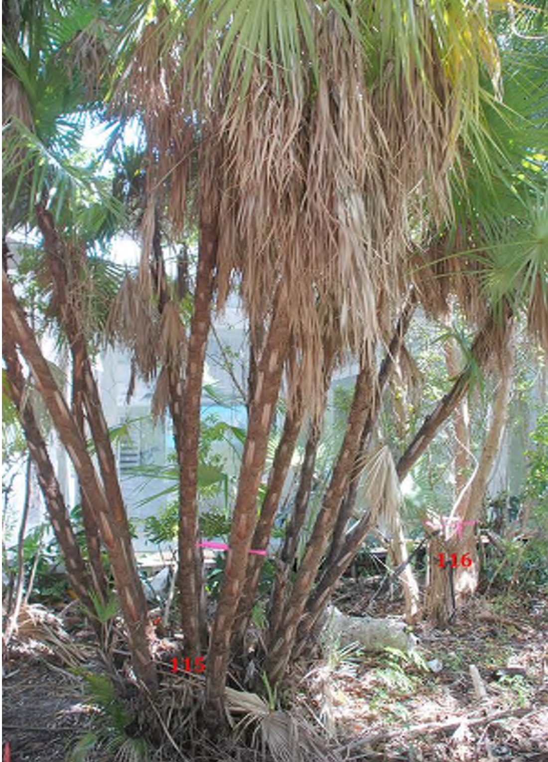
Photo 70 above is palm 115 & tree 116.