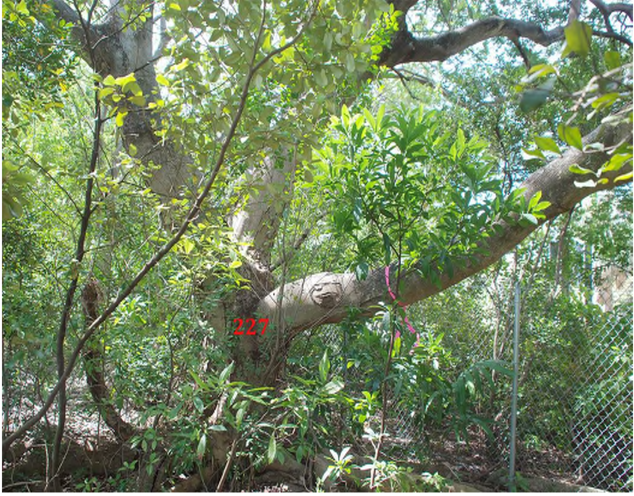
Photo 123 above is tree 227 viewed from the west. I noted no signs of active decay or cavities on the trunk or root collar of this tree.