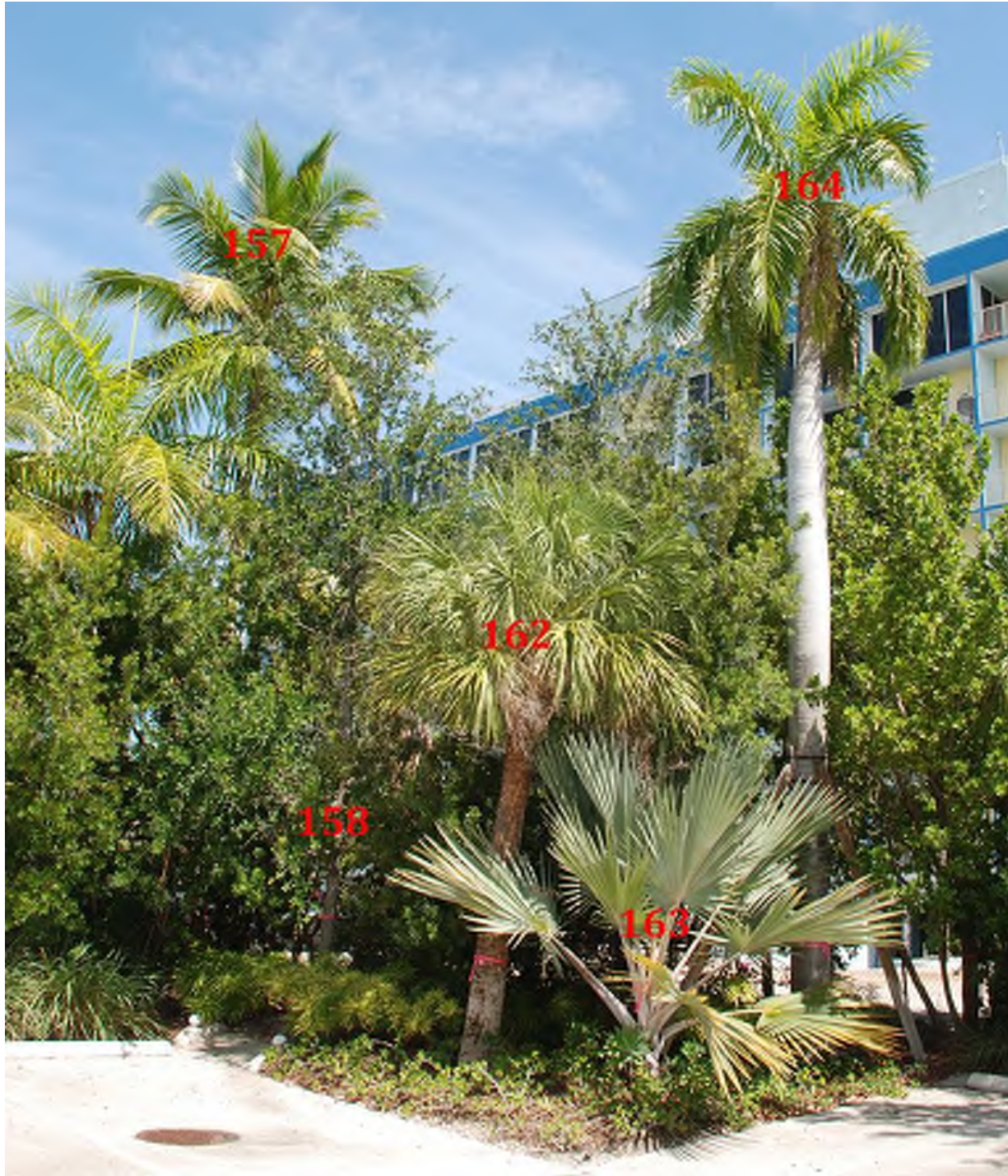
Photo 83 above is palms 157, 162, 163 & 164 and tree 158.