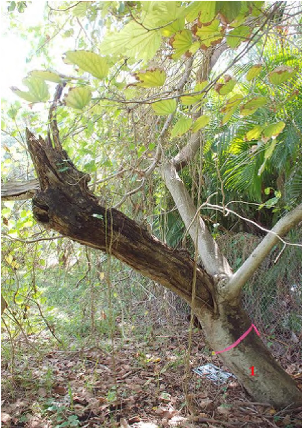
Photo 1 above is tree 1 with extensive decay.