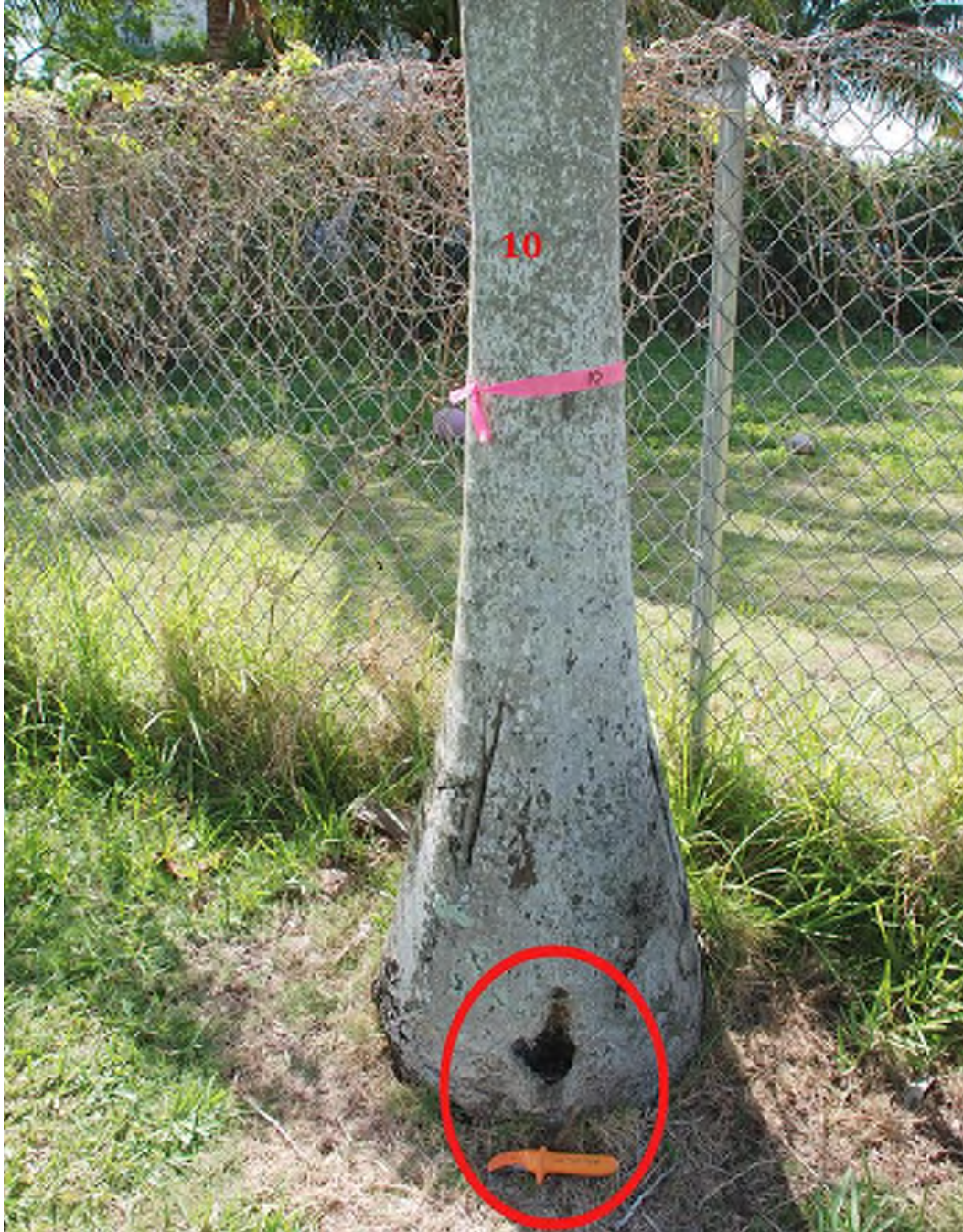
Photo 6 above the trunk of palm 10 with a small cavity indicated. This is not affecting the palm's vascular system or structural integrity. The orange knife is 7 inches in length.