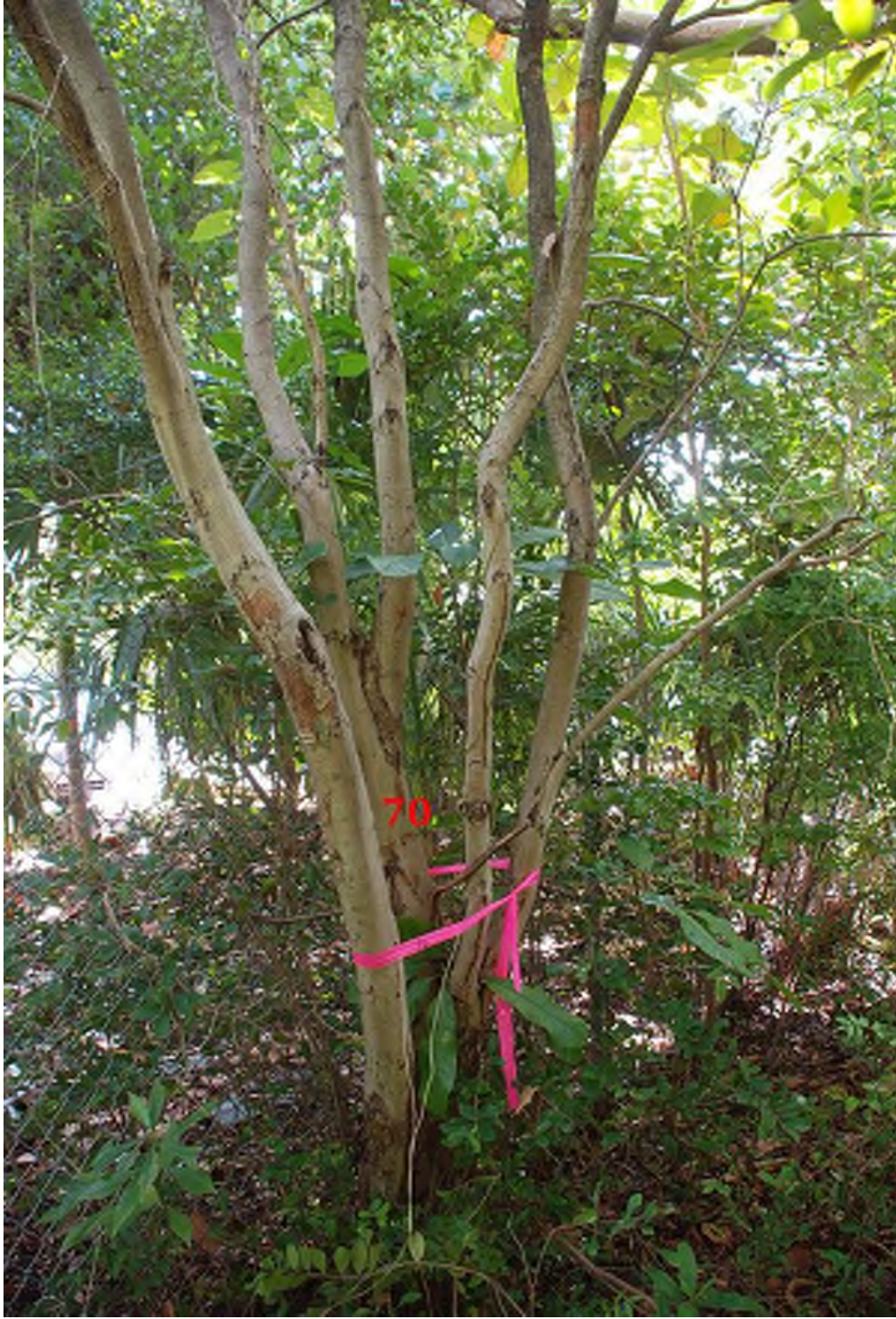
Photo 39 above is tree 70.