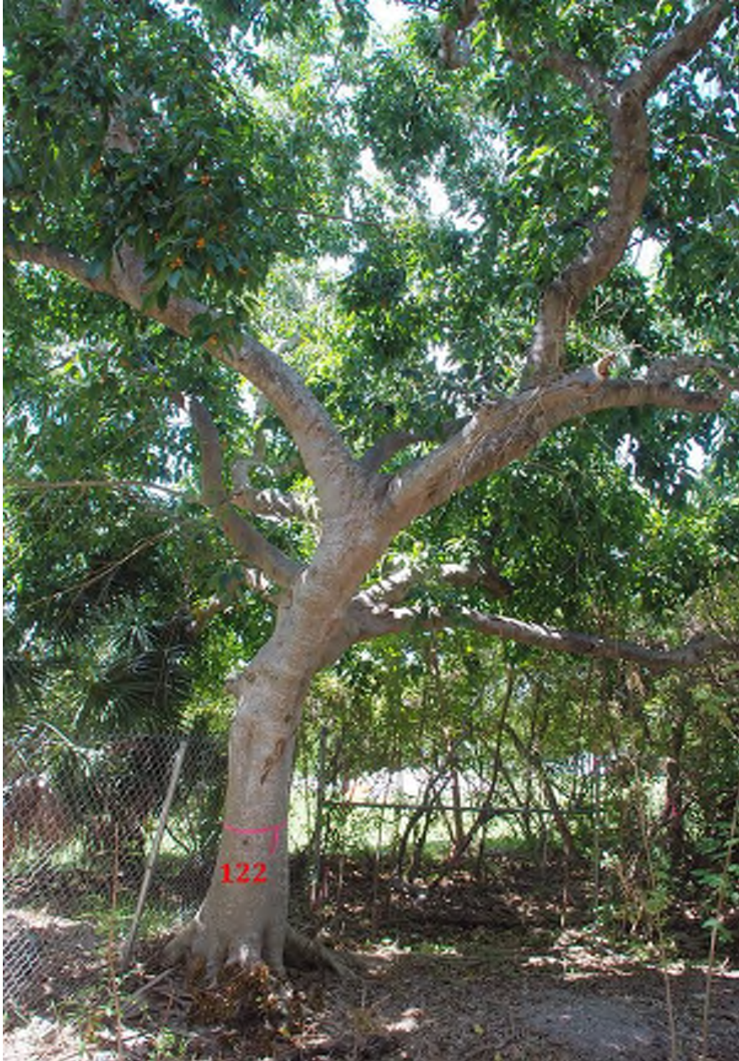
Photo 72 above is tree 122 with no signs of cavities or active decay on the trunk or root collar.