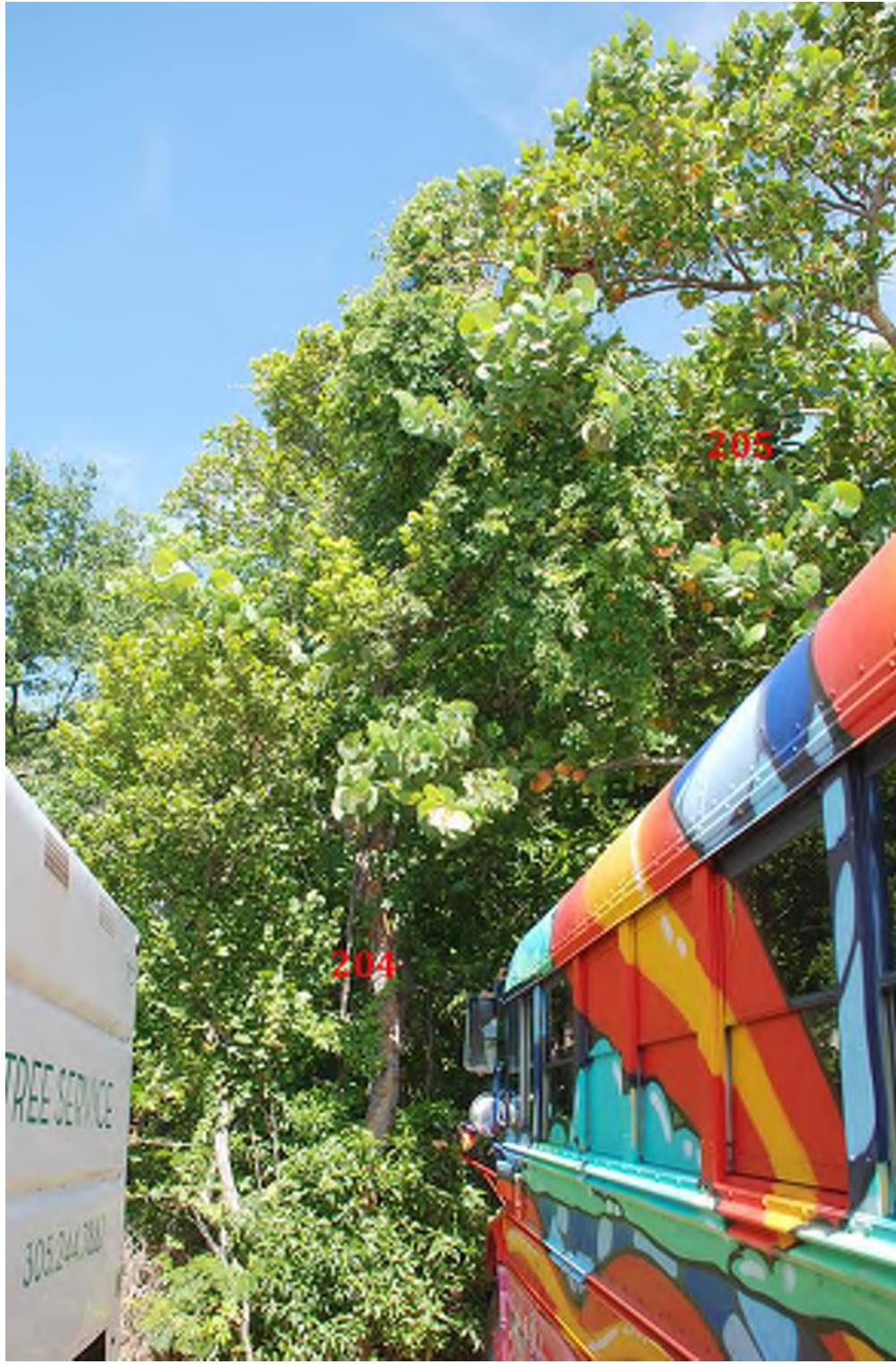
Photo 102 above is tree 204.