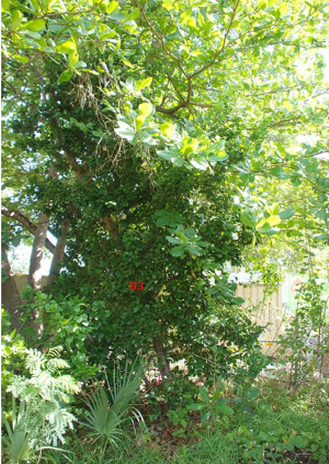
Photo 52 above is tree 83.