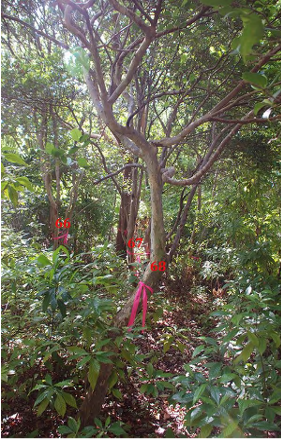
Photo 37 above is trees 66, 67 & 68.