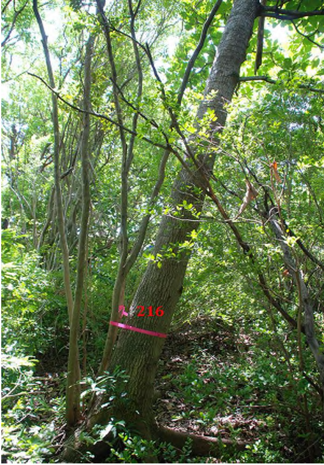
Photo 109 above is tree 216.