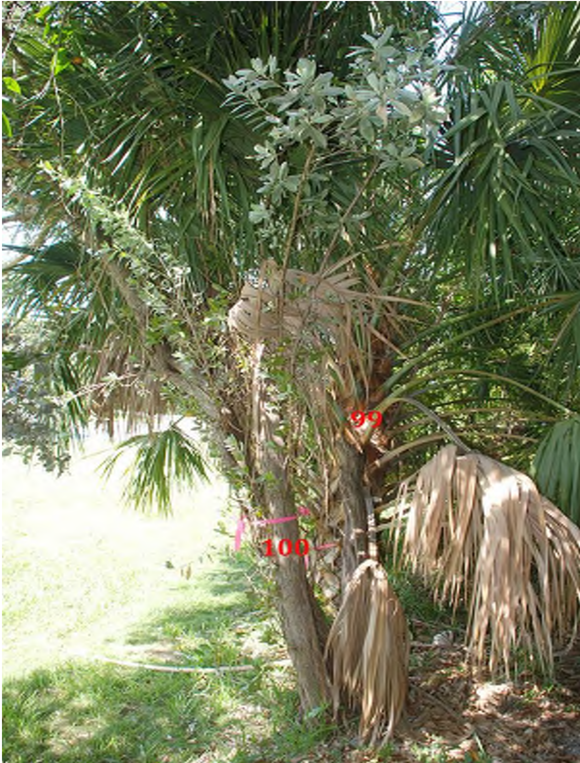
Photo 59 above is palm 99 & tree 100.