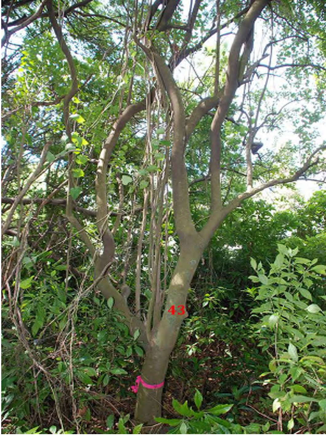
Photo 19 above is the trunk of tree 43.