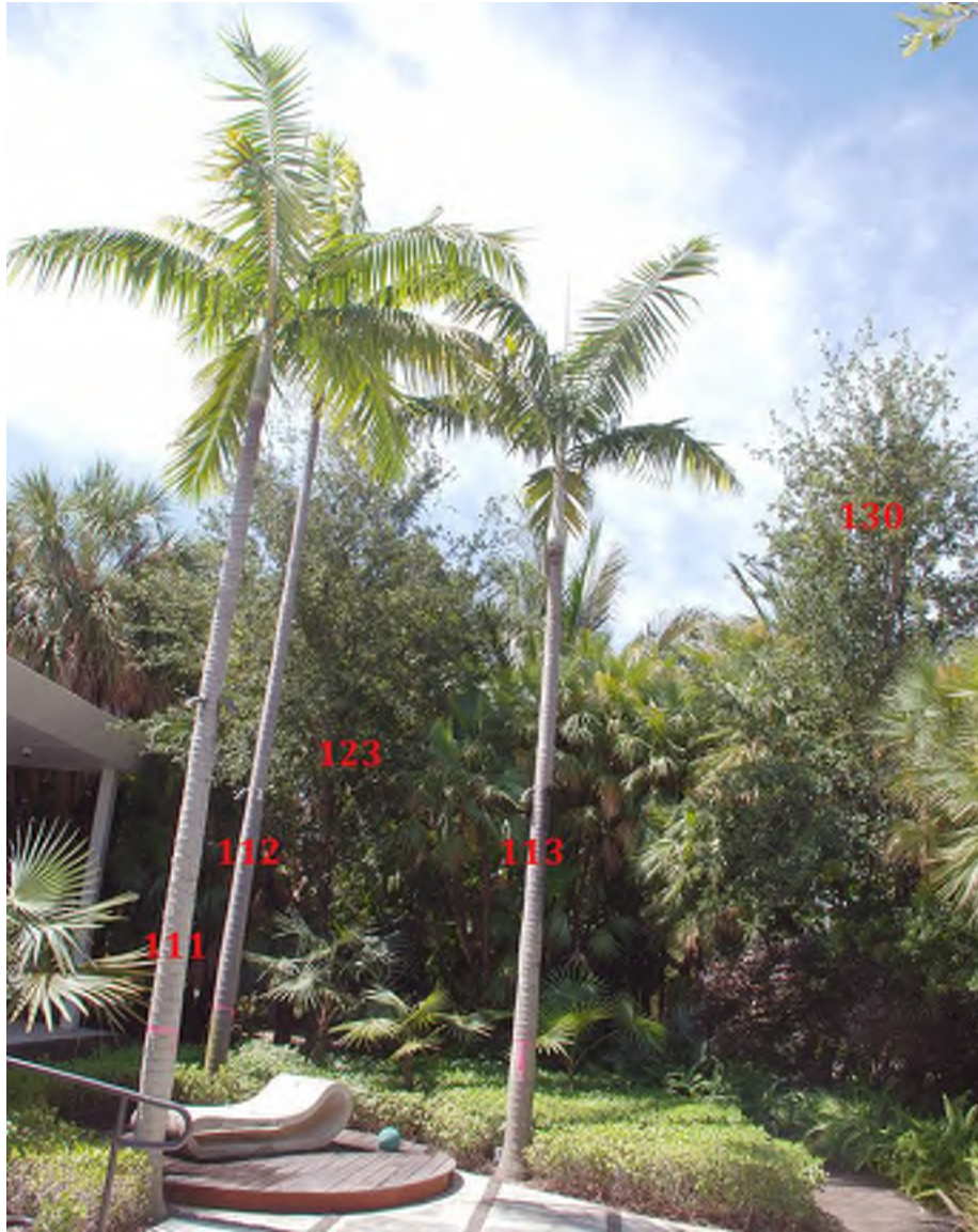
Photo 68 above is palms 111, 112 & 113 and tree 130.