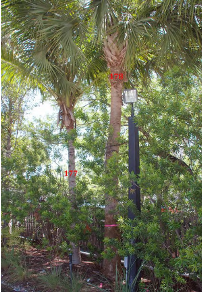
Photo 86 above is palms 177 & 178.