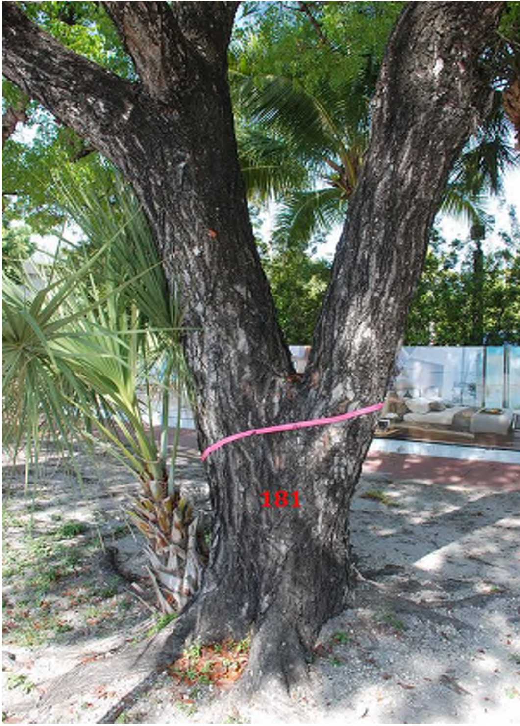
Photo 90 above is the trunk of tree 181 with no signs of decay or cavities on the trunk or root collar.