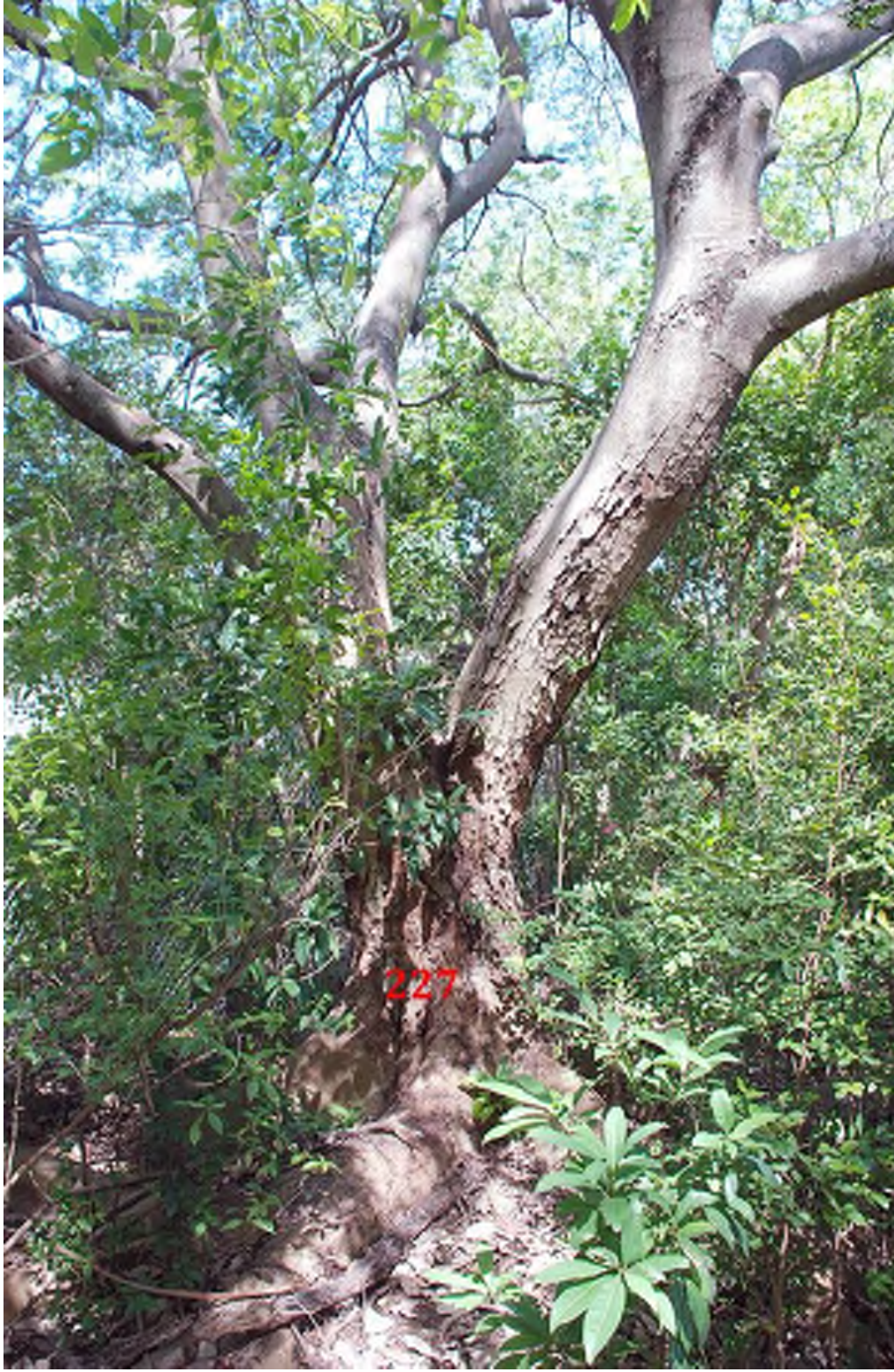
Photo 122 above is tree 227 viewed from the east.