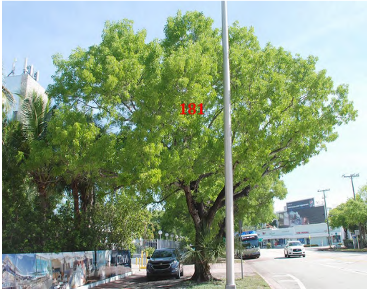
Photo 89 above is tree 181 viewed from the south.