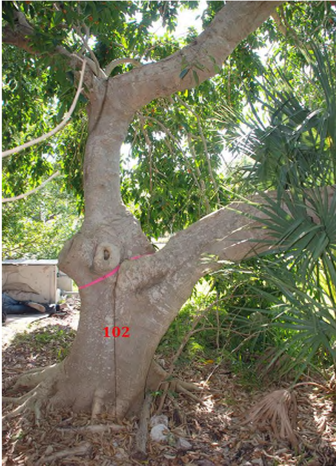
Photo 61 above is the trunk of tree 102 viewed from the west.