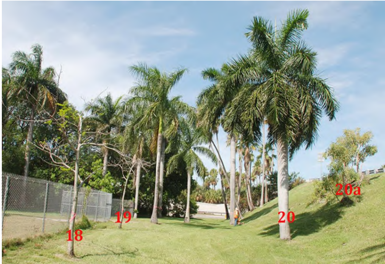
Photo 7 above is tree 18 with a canopy that appears to be dying-back. This tree should be considered for removal.