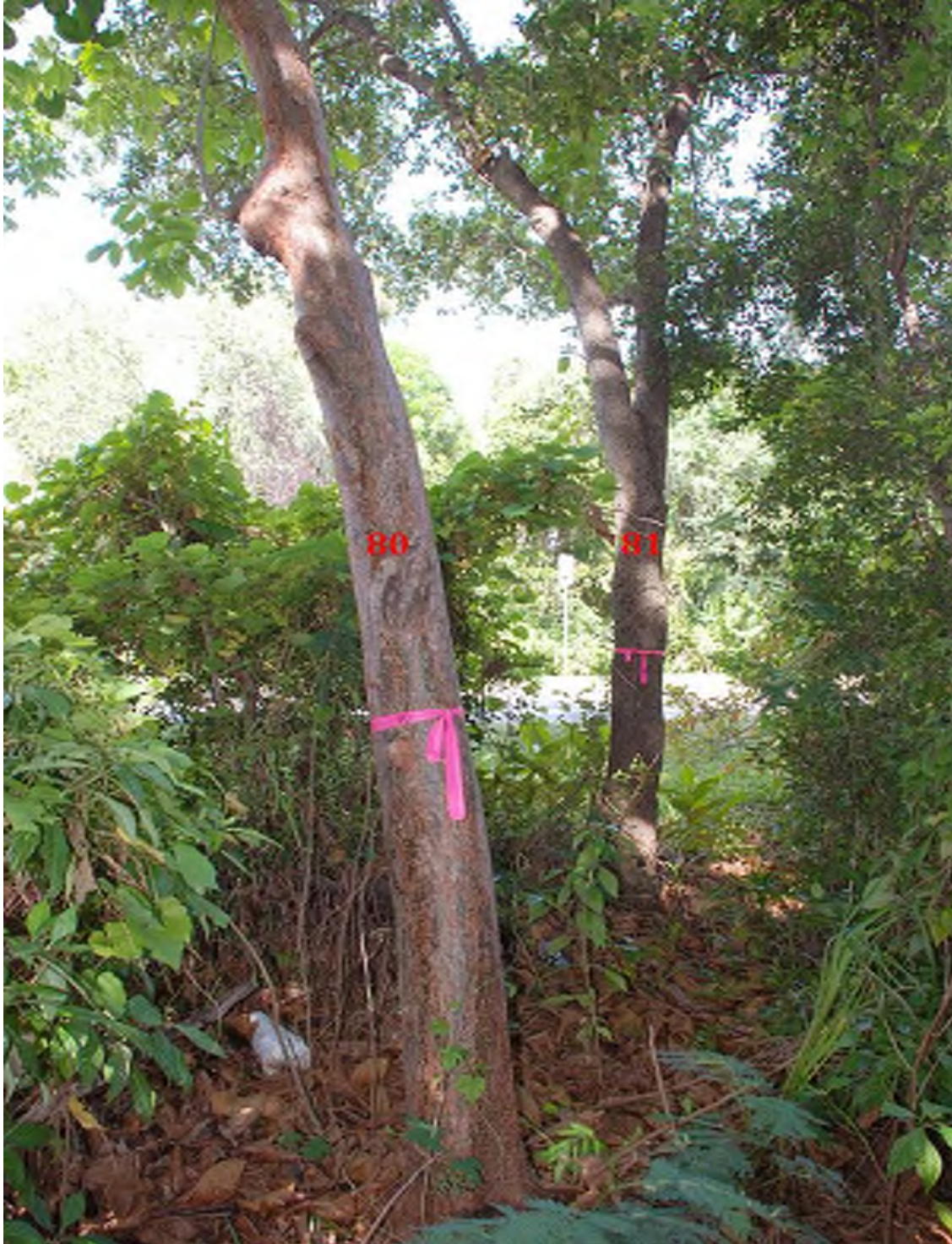
Photo 48 above is trees 80 & 81 with no signs of decay or cavities on the trunk.