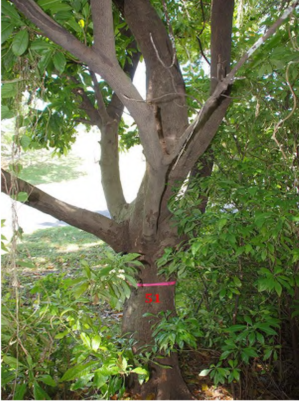
Photo 25 above is the trunk of tree 51 with no signs of decay or cavities on the trunk or root collar.