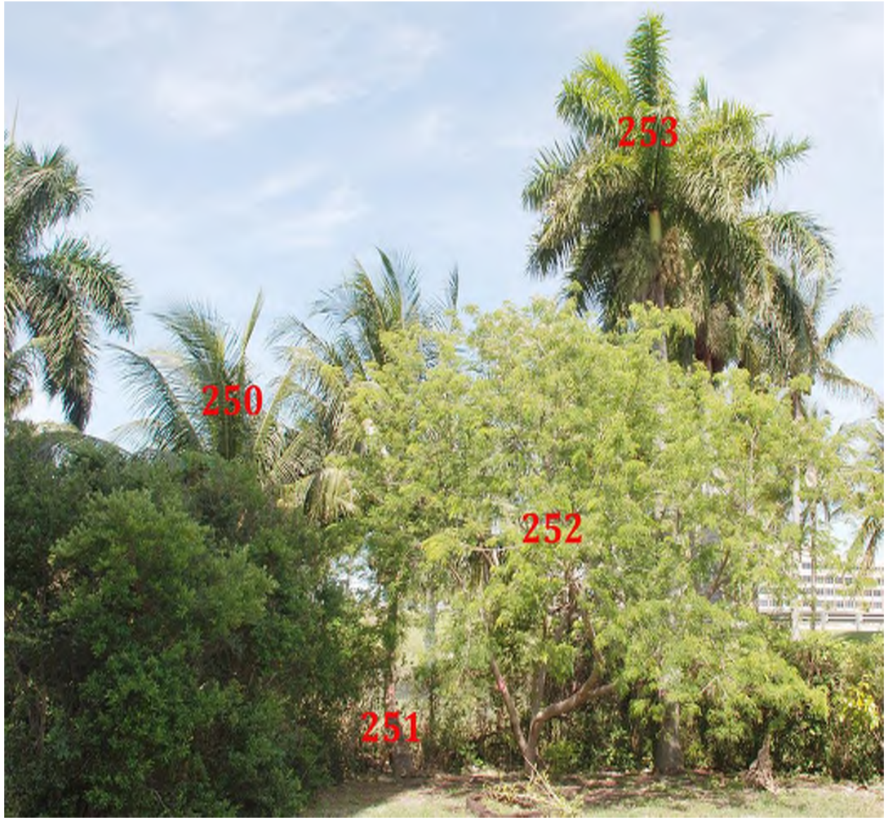
Photo 139 above is palms 250, 251 & 253 and tree 252.