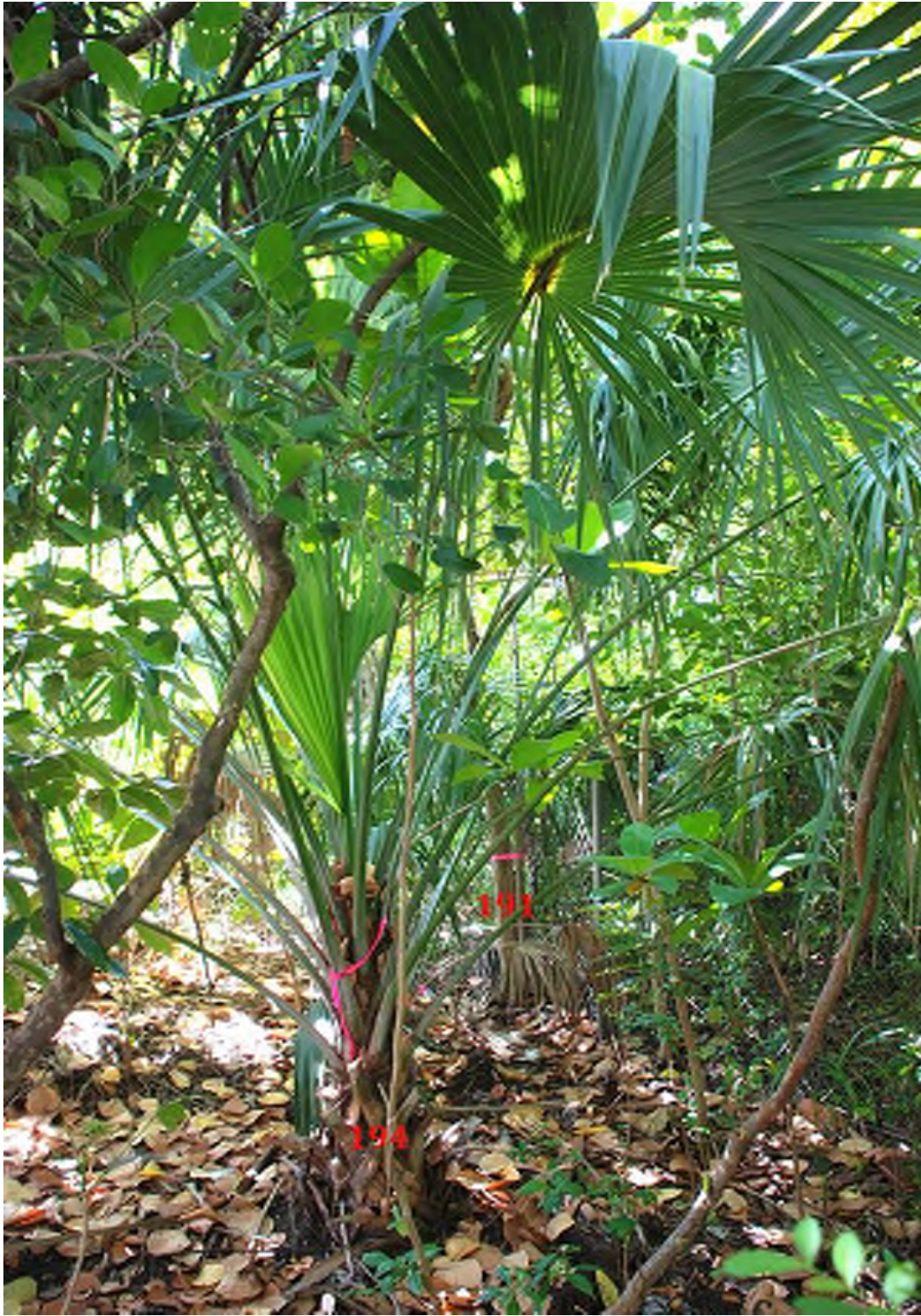
Photo 96 above is palm 194 & tree 191.