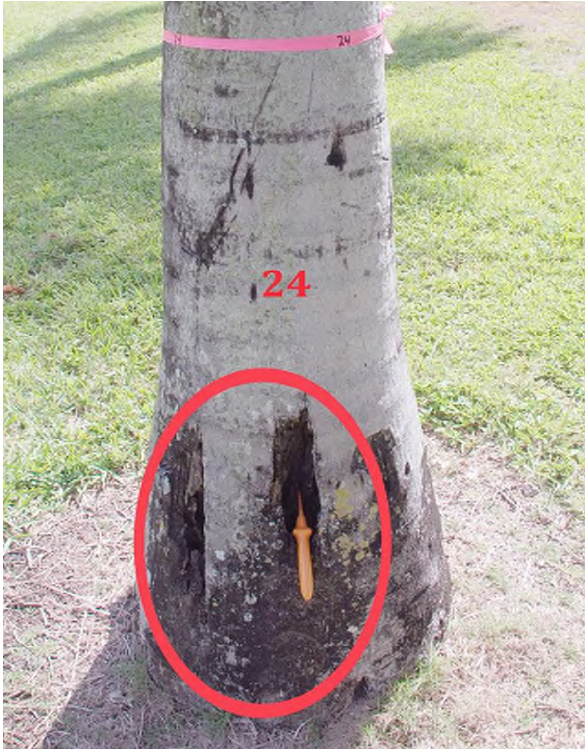
Photo 13 above is the trunk of palm 25 with several large cavities. I recommend the removal of this palm. The orange knife is 7 inches in length.