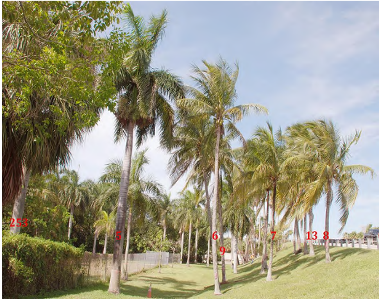
Photo 4 above is palms 5, 6, 7, 8, 9 & 13.