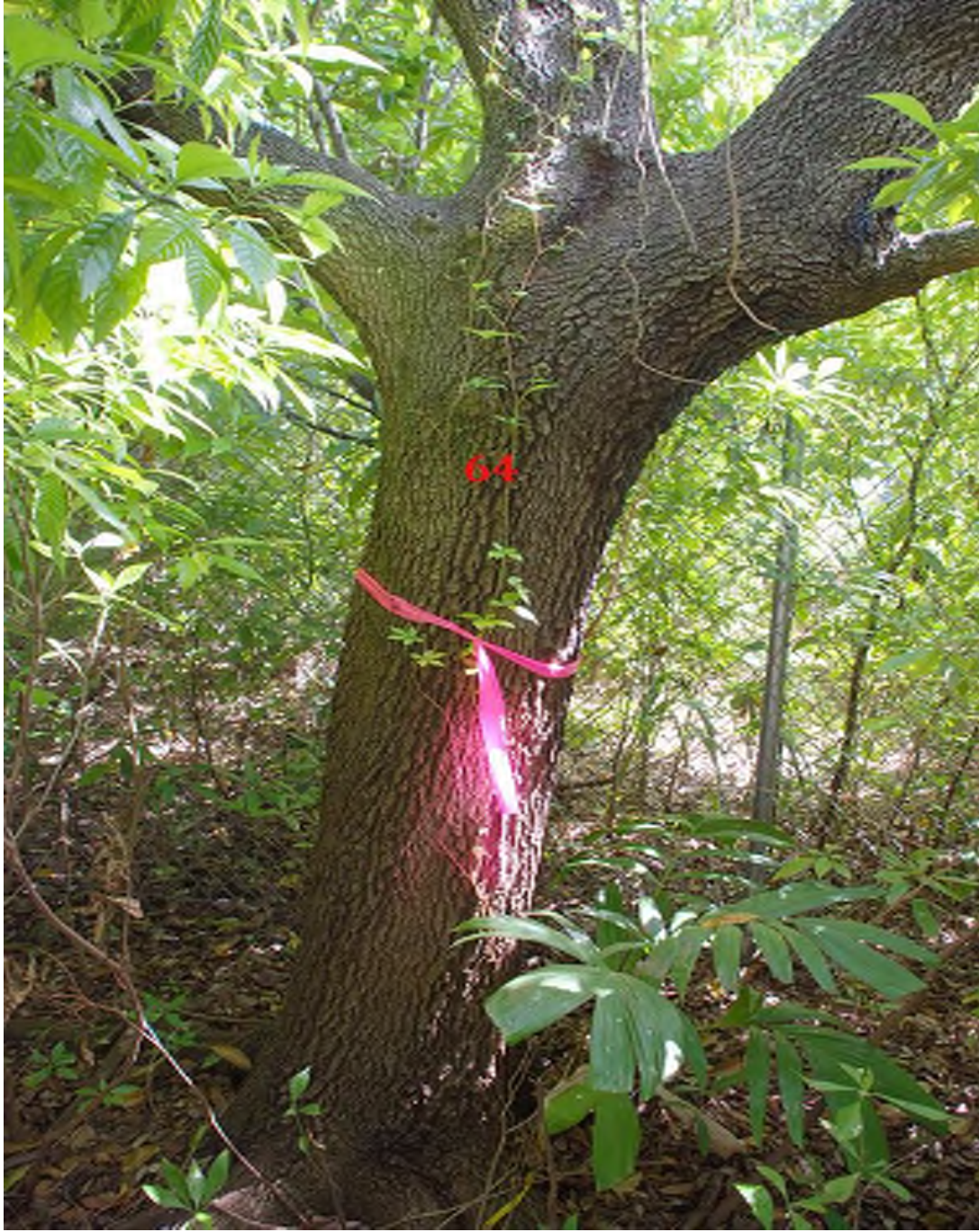
Photo 35 is tree 64 with no signs of decay or cavities on the trunk or root collar.