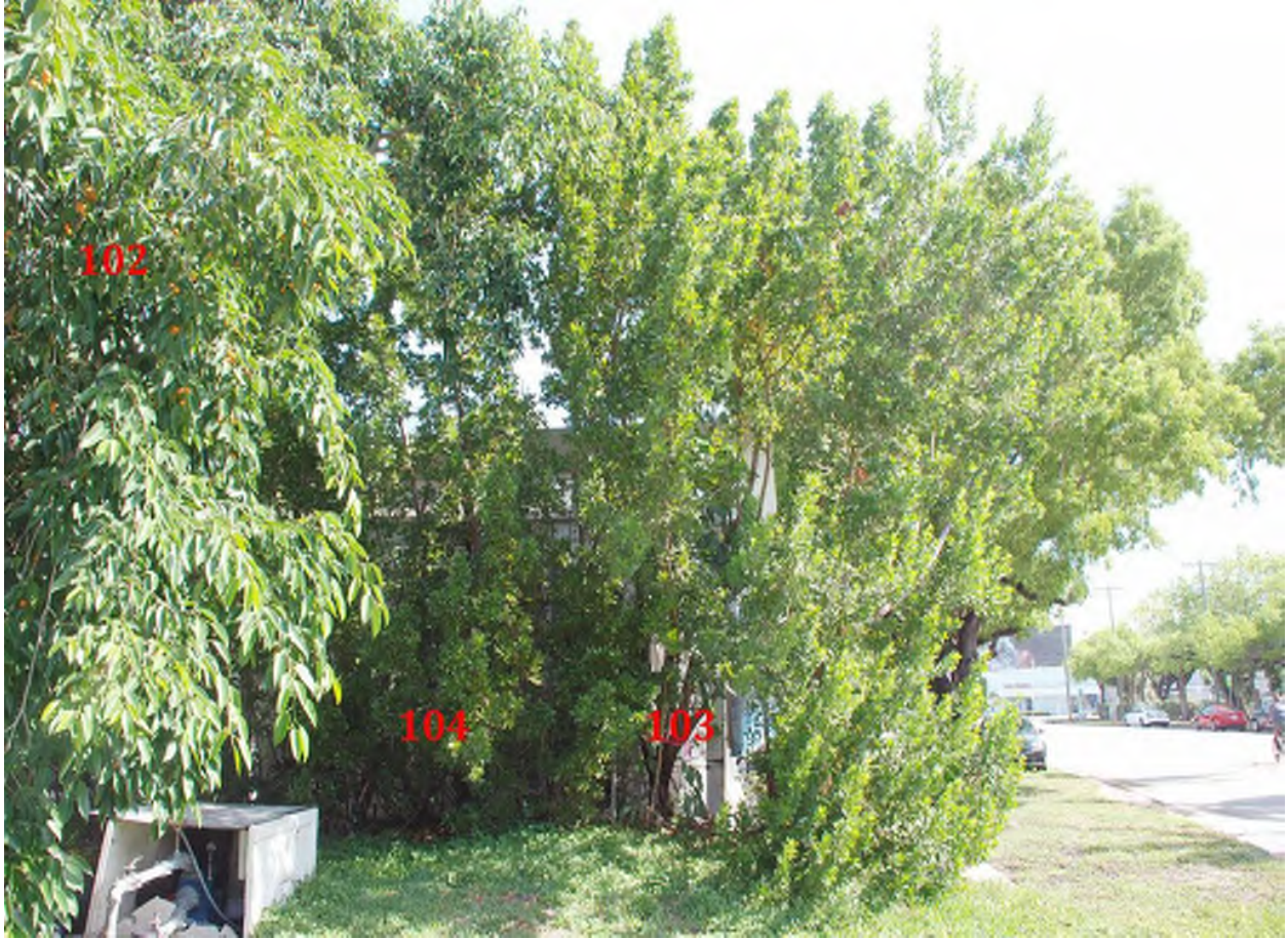
Photo 63 above is trees 103 & 104.