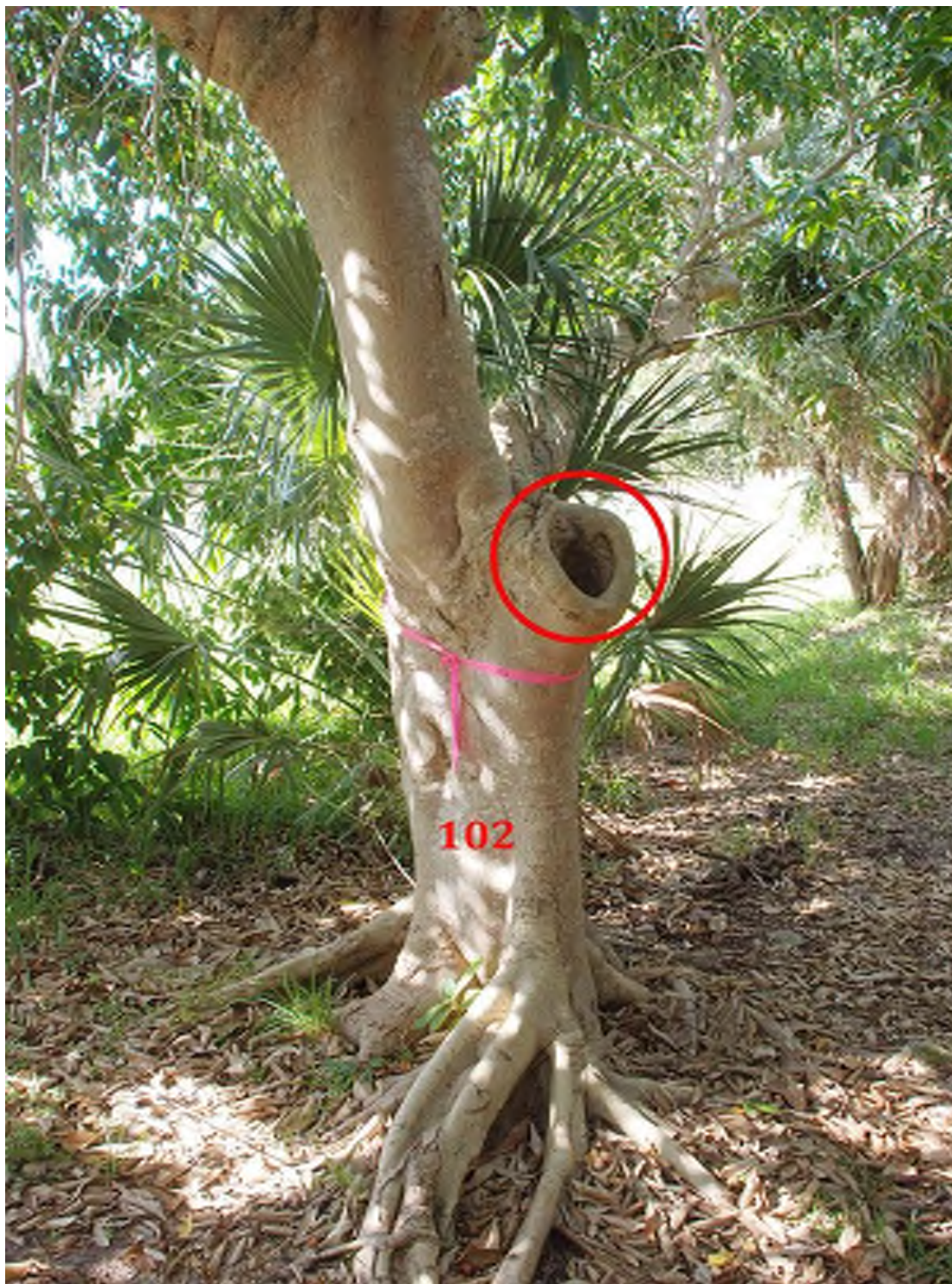
Photo 62 above is the trunk of tree 102 viewed from the north. There is a cavity indicated however there appears to be no active decay.