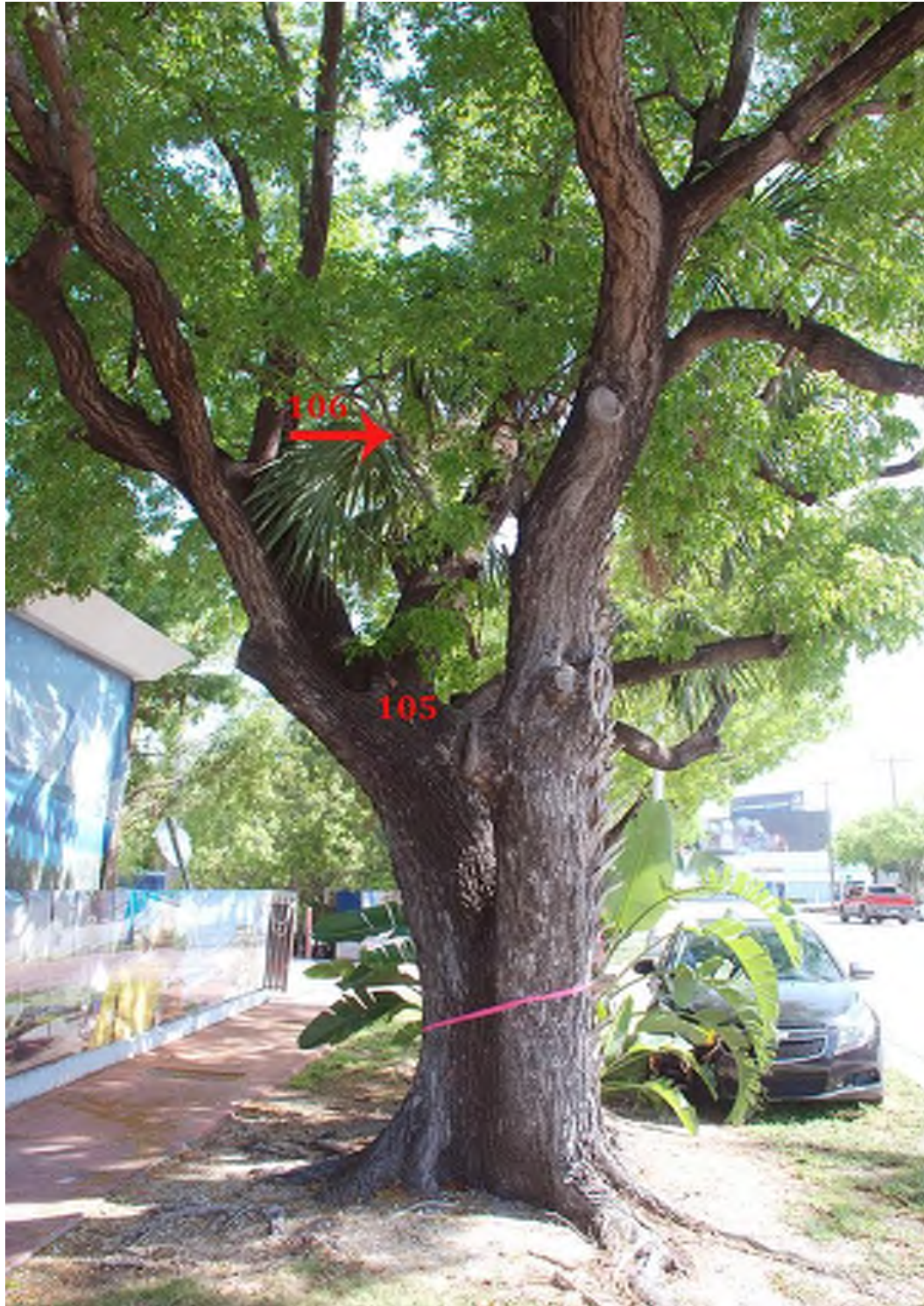
Photo 65 above is the trunk of tree 105 with no decay or cavities noted on the trunk or root collar.