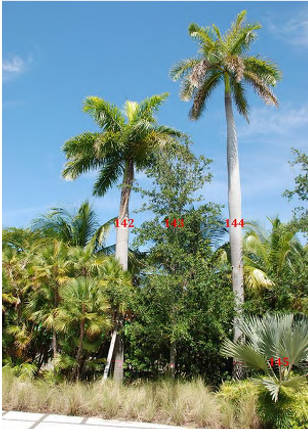
Photo 78 above is palms 142, 144 & 145 and tree 143. Palm 144 is developing a severe nutrient deficiency.