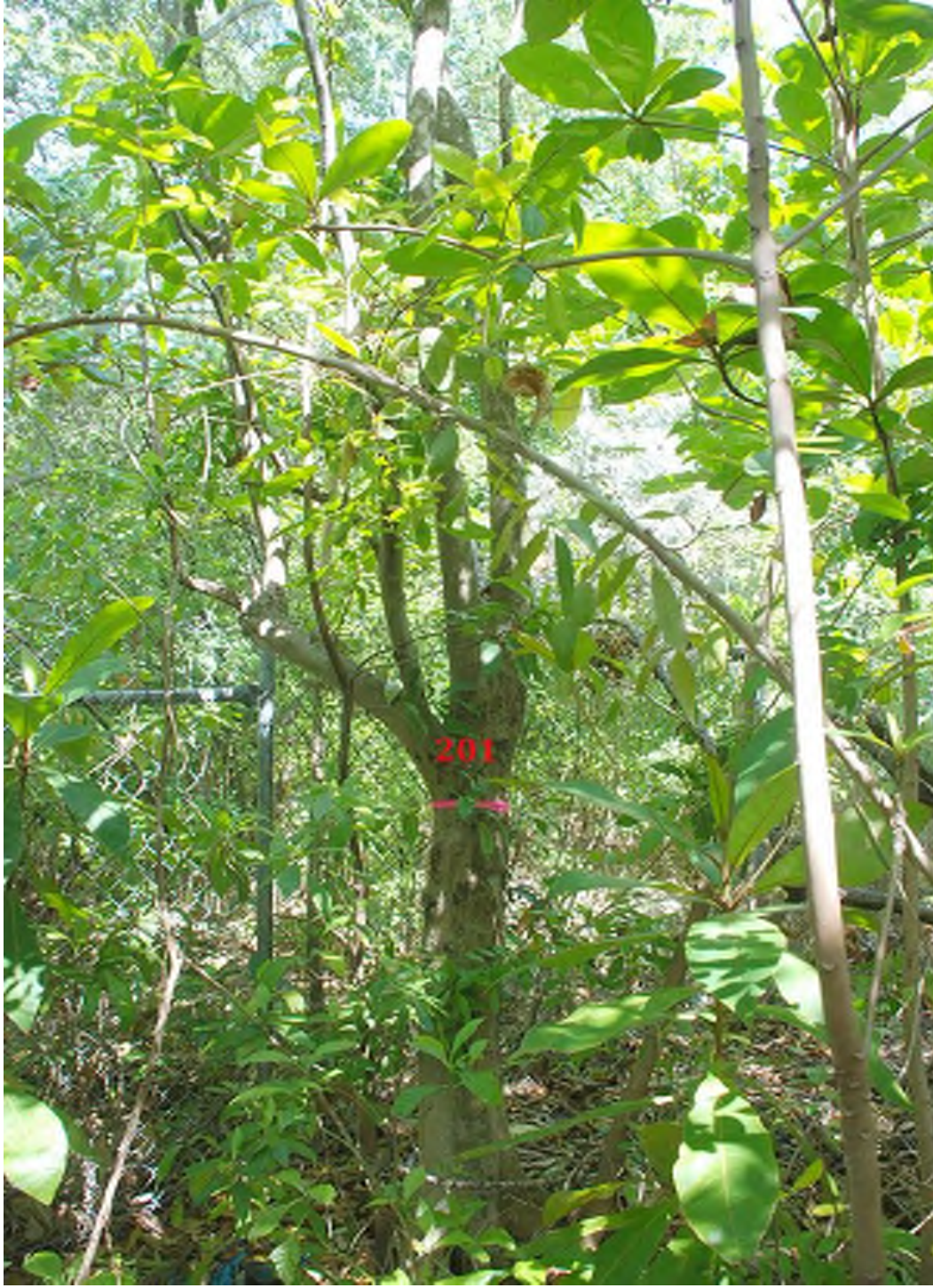
Photo 100 above is tree 201.