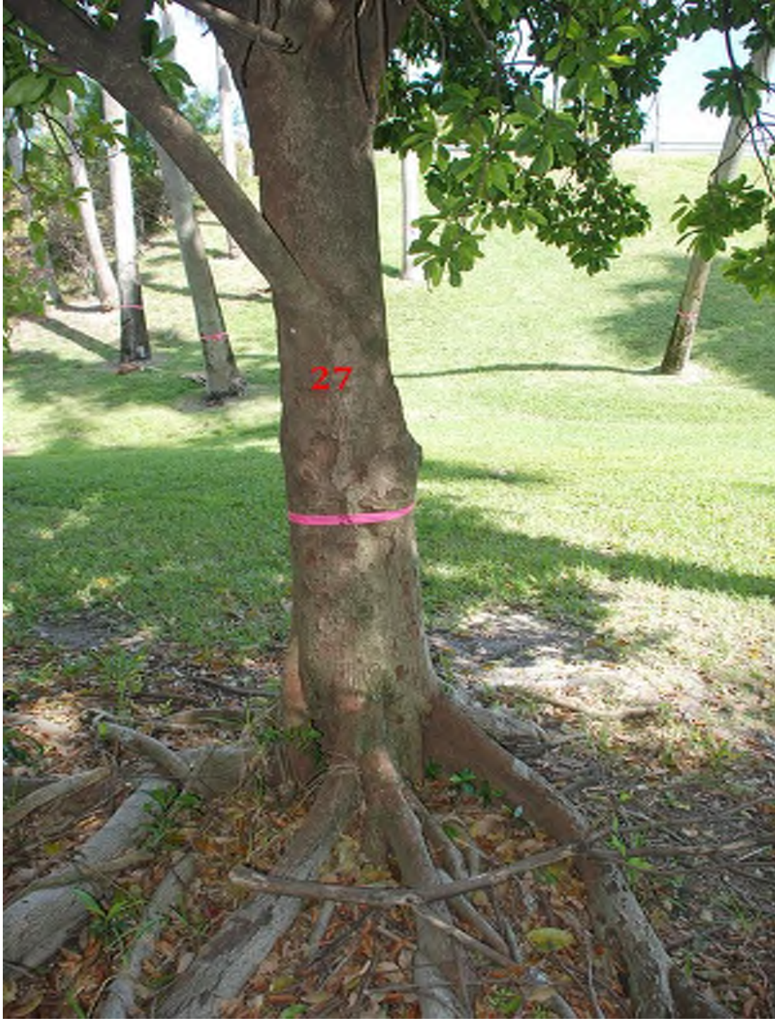
Photo 15 above is the trunk of tree 27 showing no signs of cavities or decay.