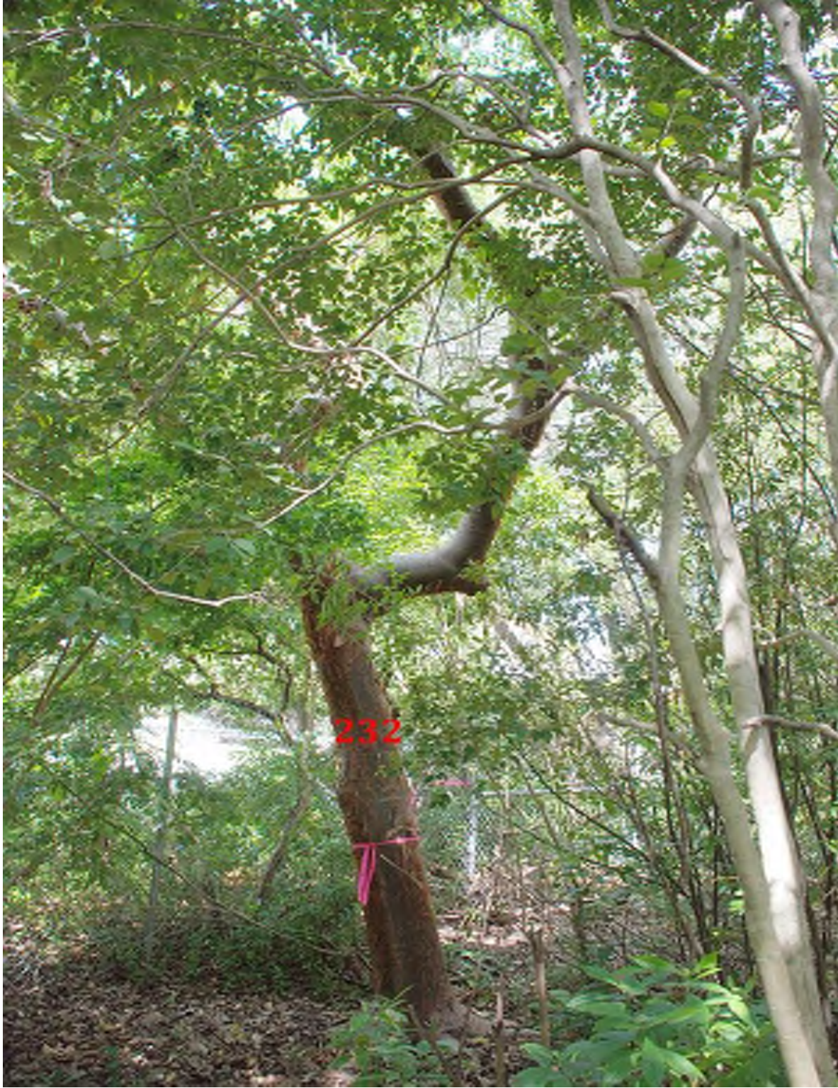
Photo 128 above is tree 232.