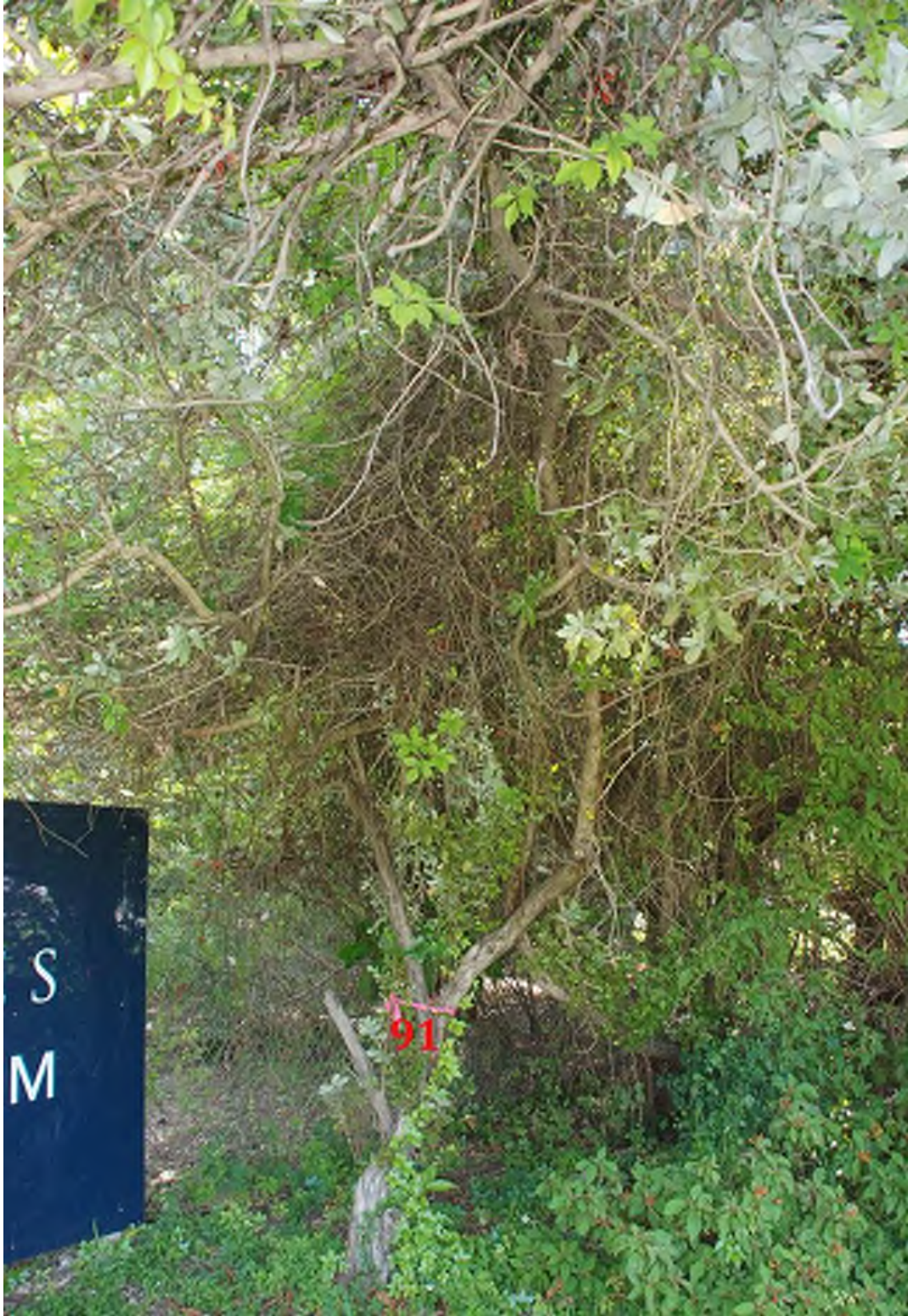
Photo 54 above is tree 91.