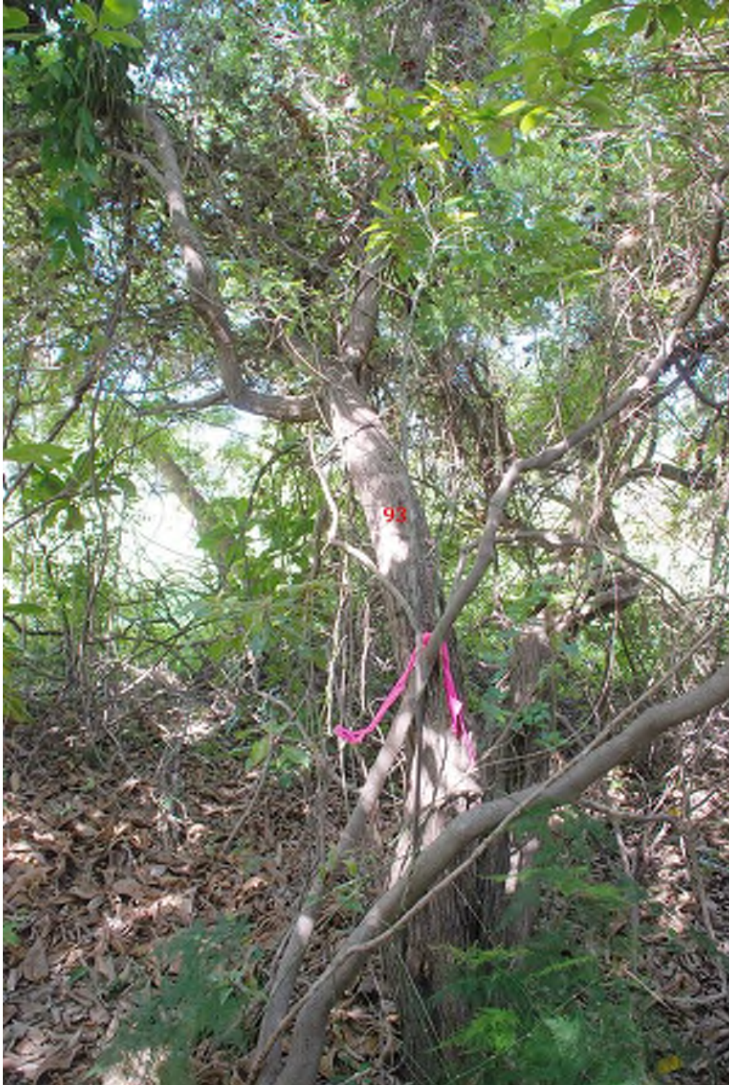
Photo 55 above is tree 93.