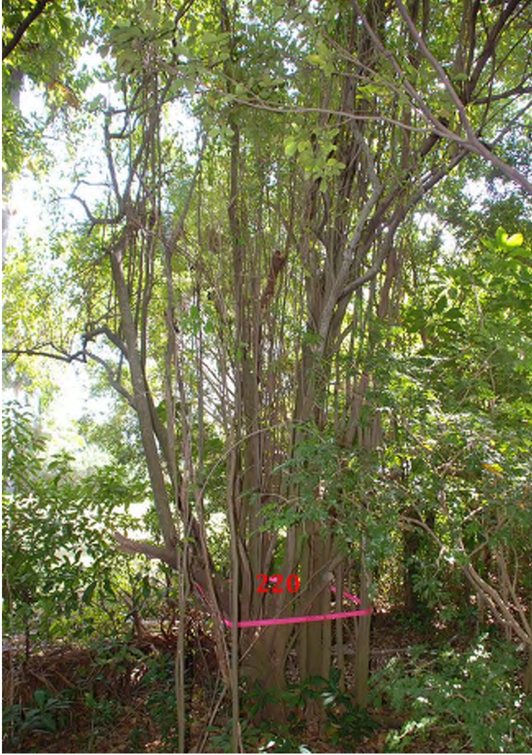
Photo 114 above is tree 220.