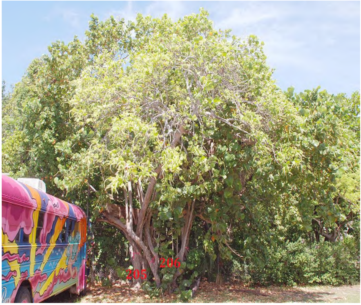
Photo 103 above is trees 205 & 206 both with multiple trunks. I noted no signs of cavities or active decay on the trunks or root collar of these trees.