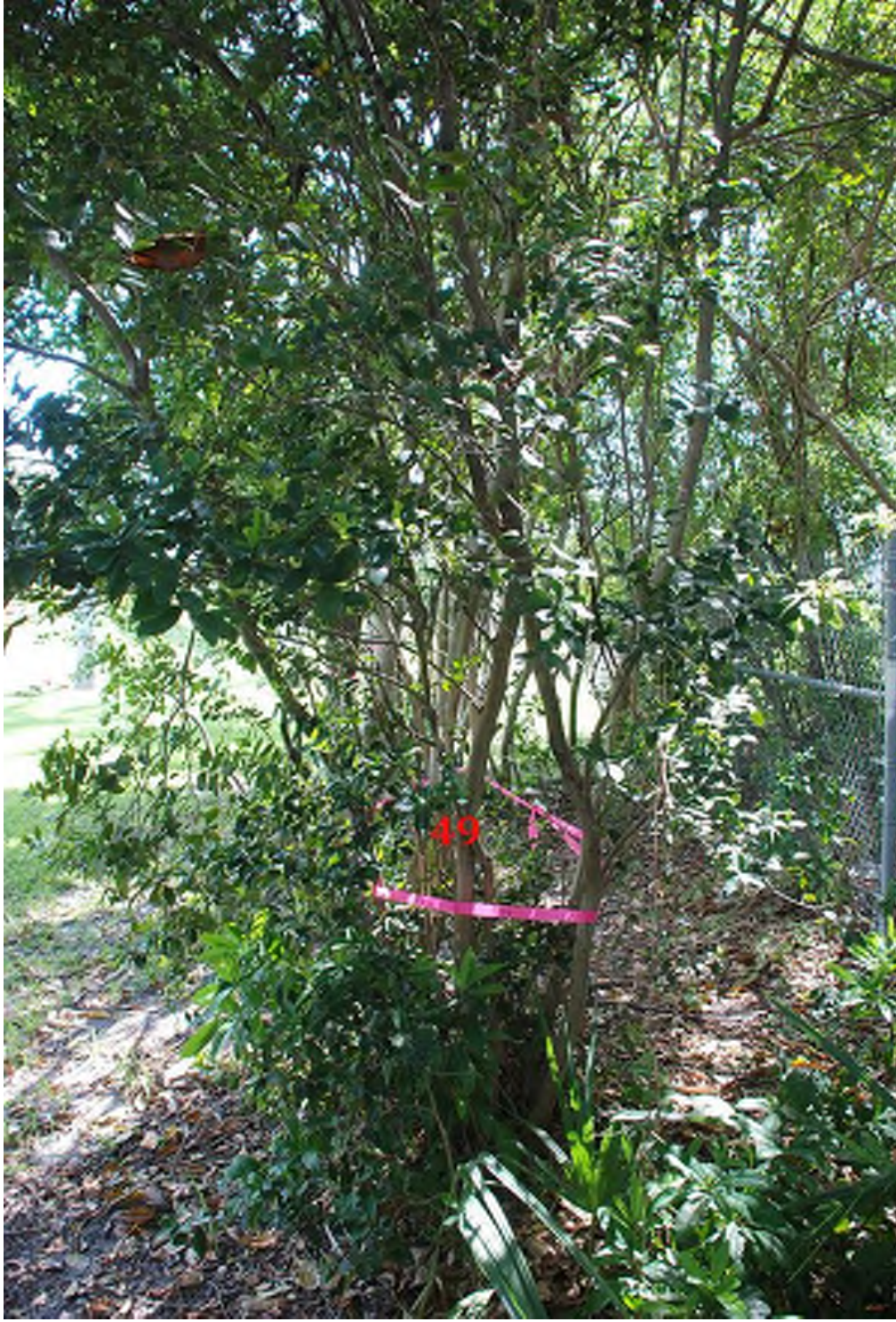
Photo 22 above is tree 49.