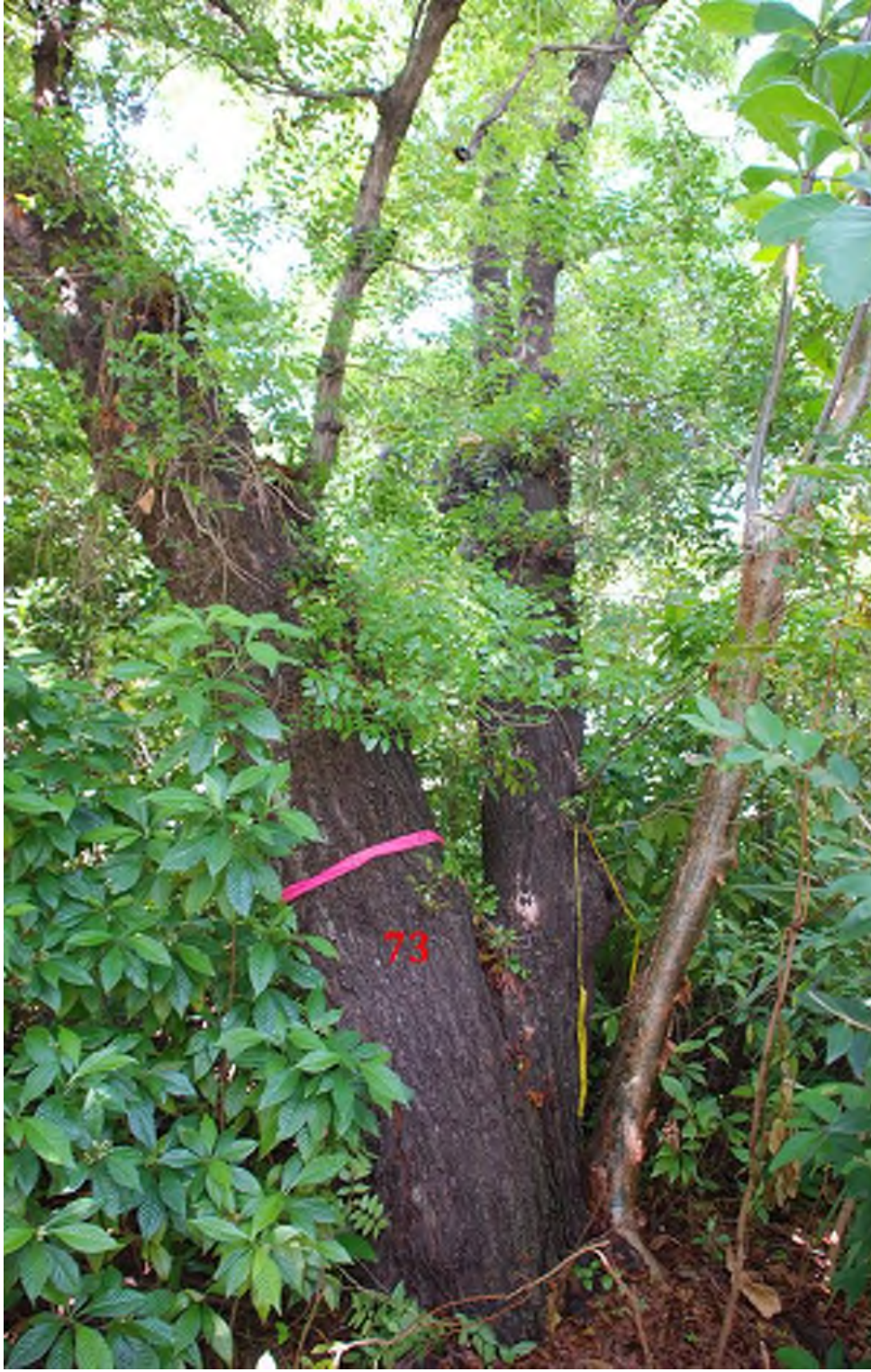
Photo 43 above is the trunk of tree 73.