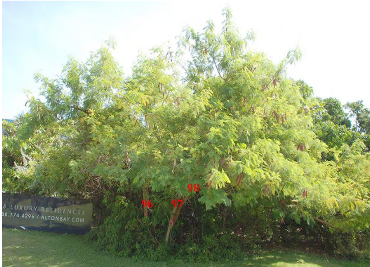
Photo 57 above is invasive species 96, 97 & 98.