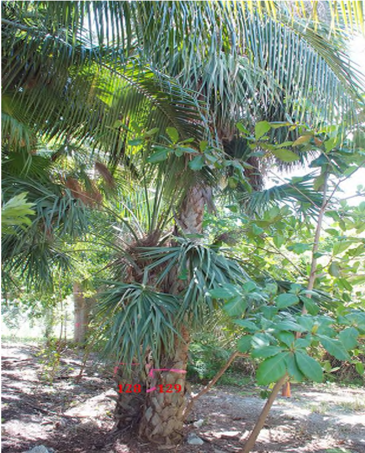
Photo 75 above is palms 128 & 129.