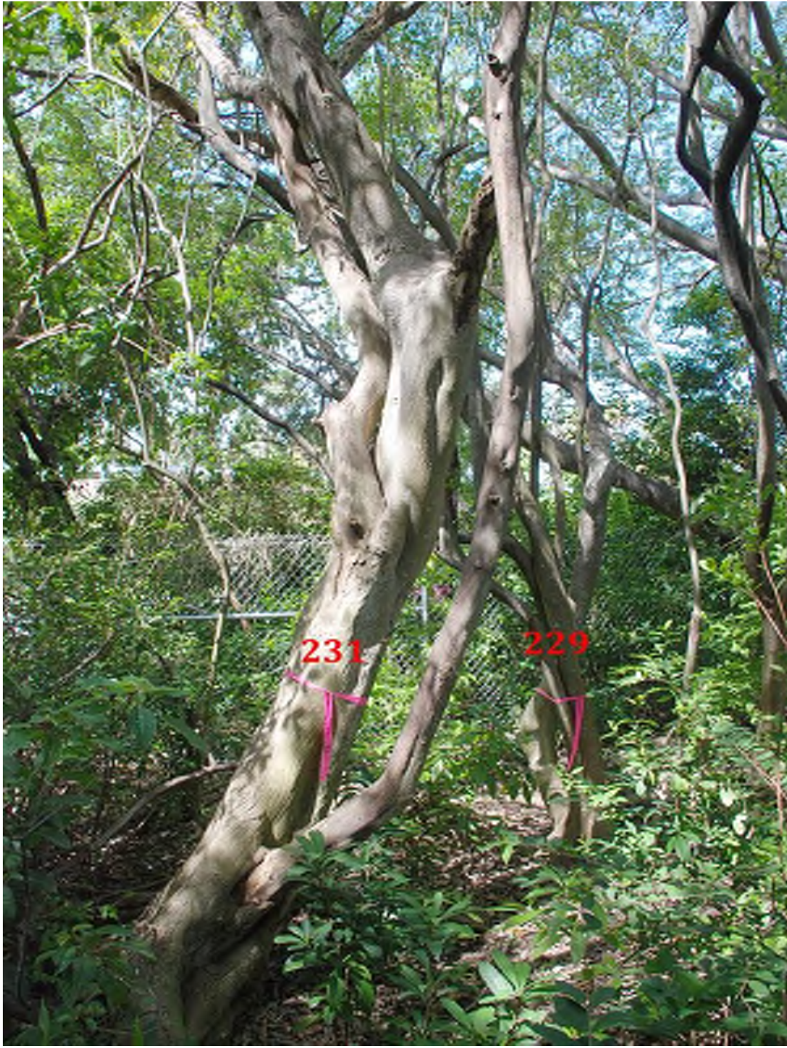
Photo 127 above is trees 229 & 231.