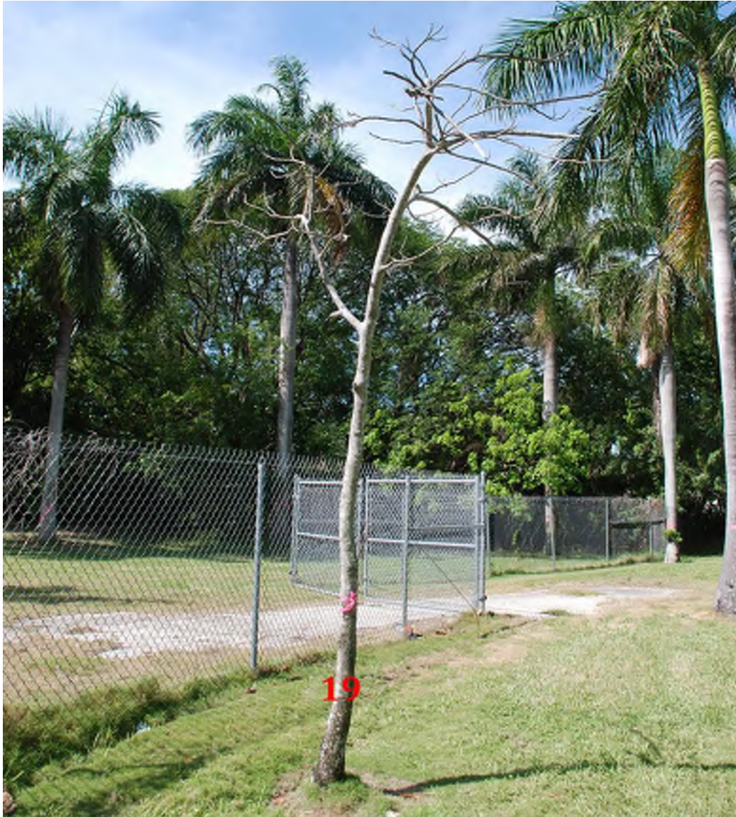
Photo 8 above is tree 19 that is dead.