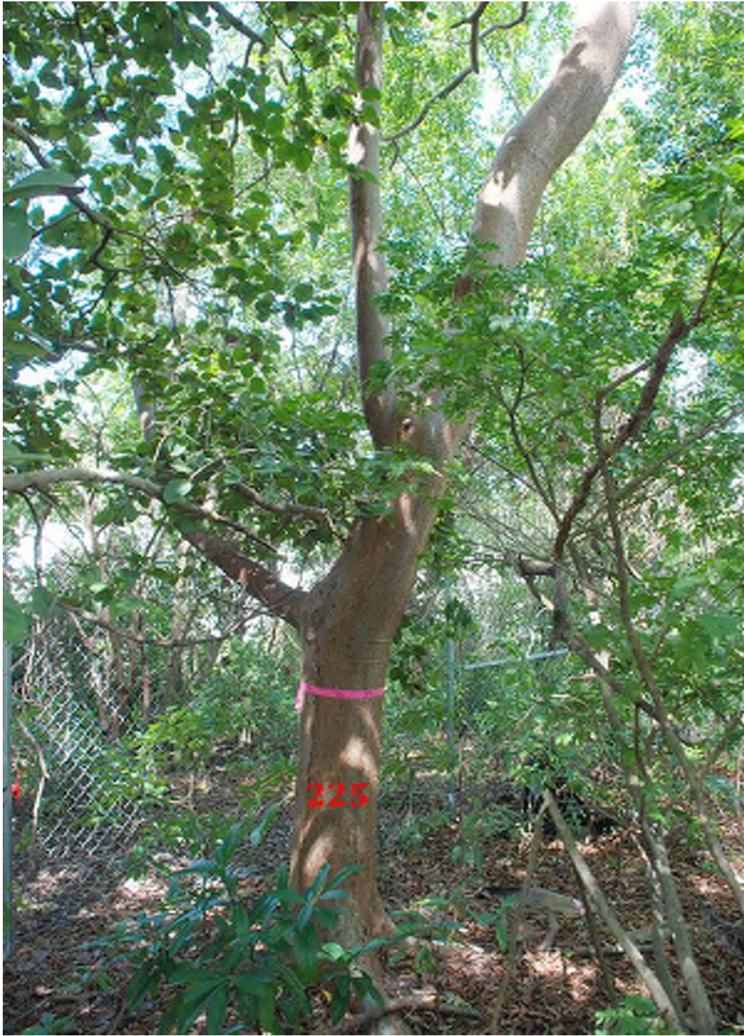
Photo 120 above is tree 225.