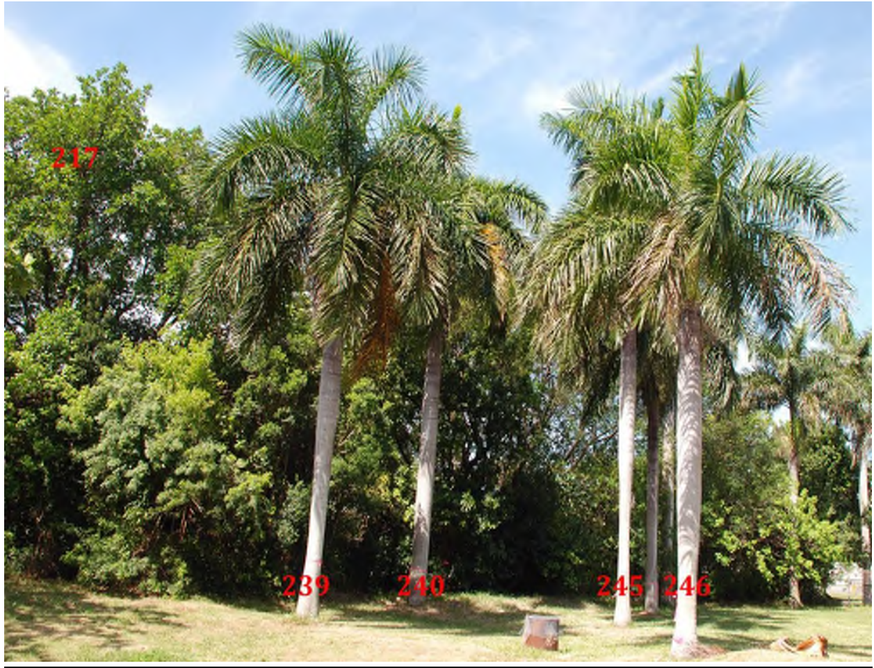
Photo 133 above is the canopy of tree 217 and palms 239, 240, 245 & 246.