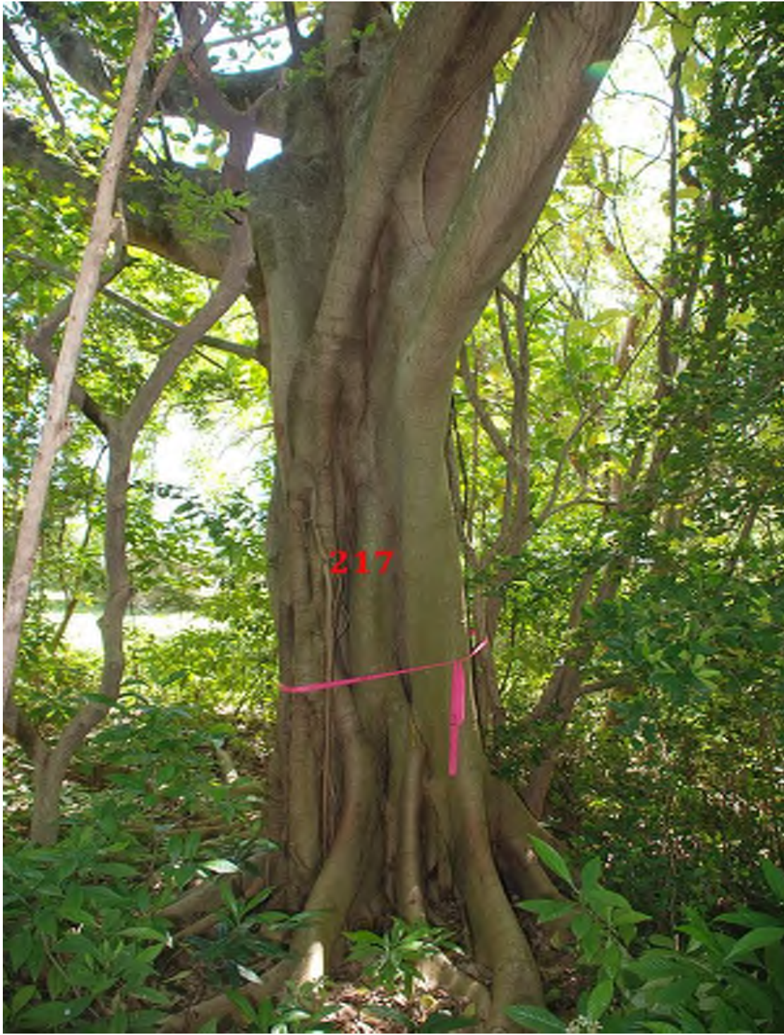
Photo 111 above is tree 217 viewed from the east. I noted no signs of active decay or cavities on the trunk or root collar of this tree.