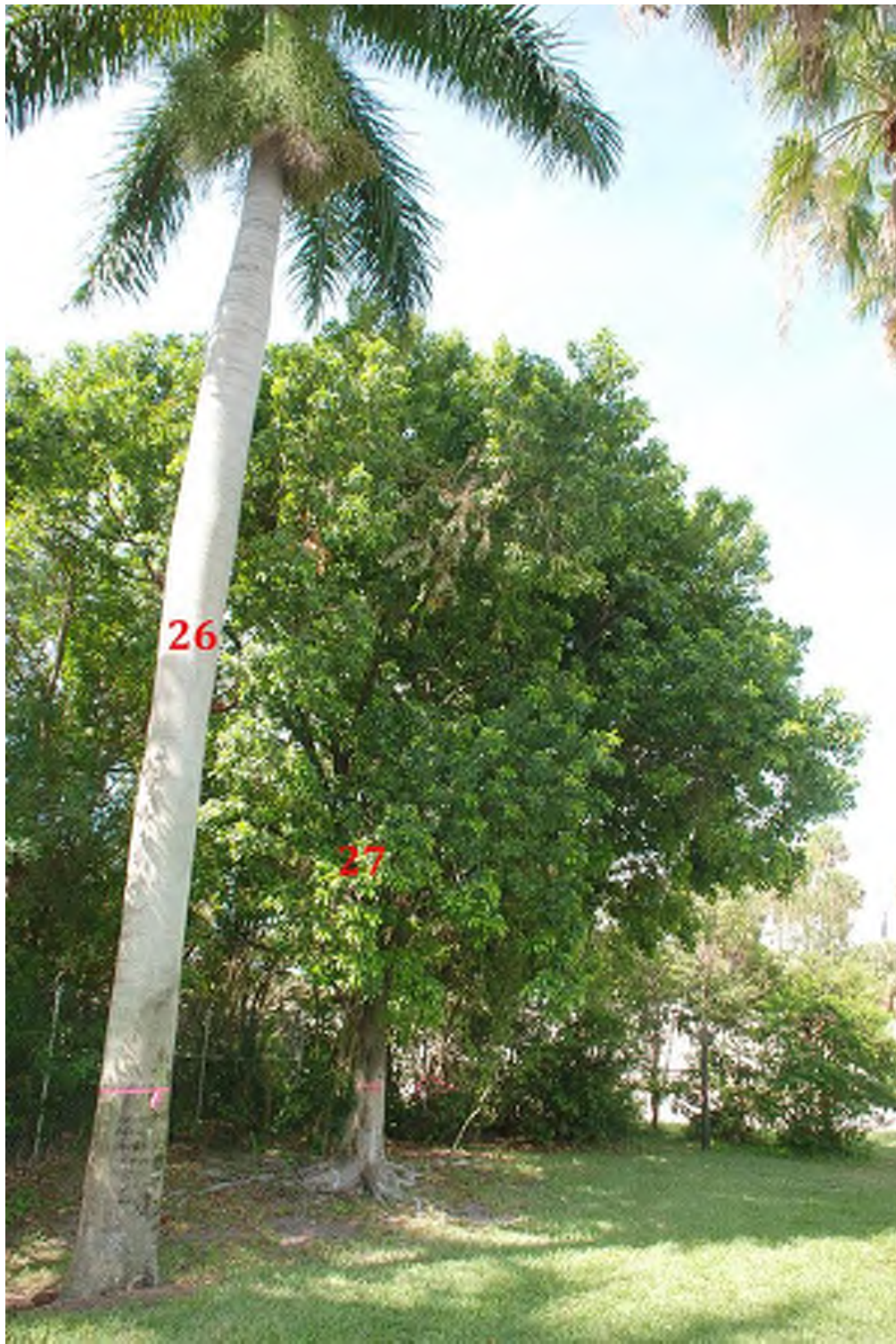
Photo 14 above is palm 26 & tree 27.