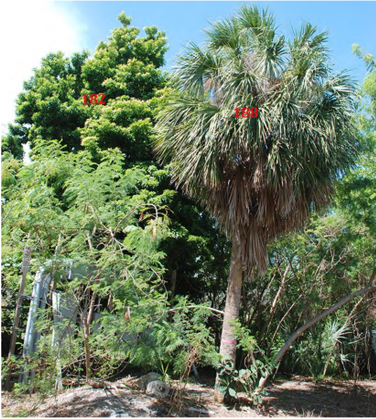
Photo 91 above is tree 182 & palm 188.