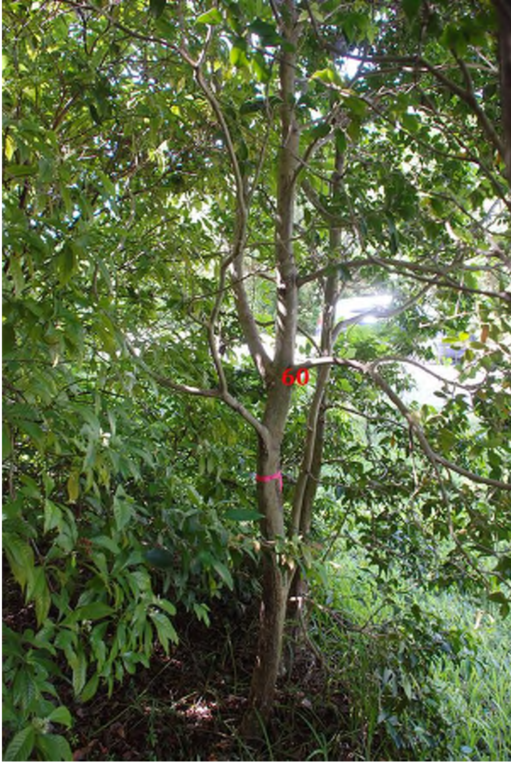
Photo 31 above is tree 60.