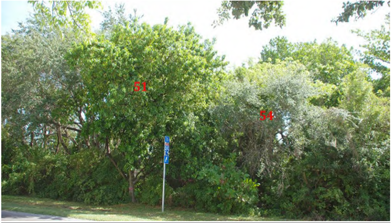
Photo 24 above is trees 51 & 54 viewed from the south.