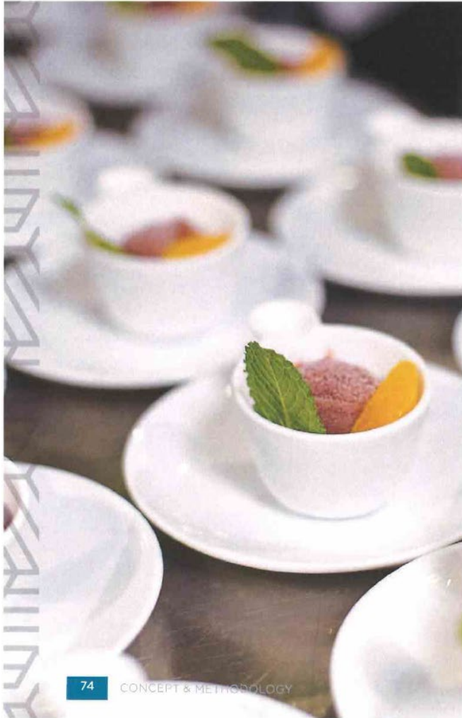
74 CONCEPT & METHODOLOGY