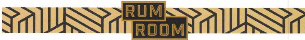
EXHIBIT “3-1” CLUBHOUSE ANNEX MENU