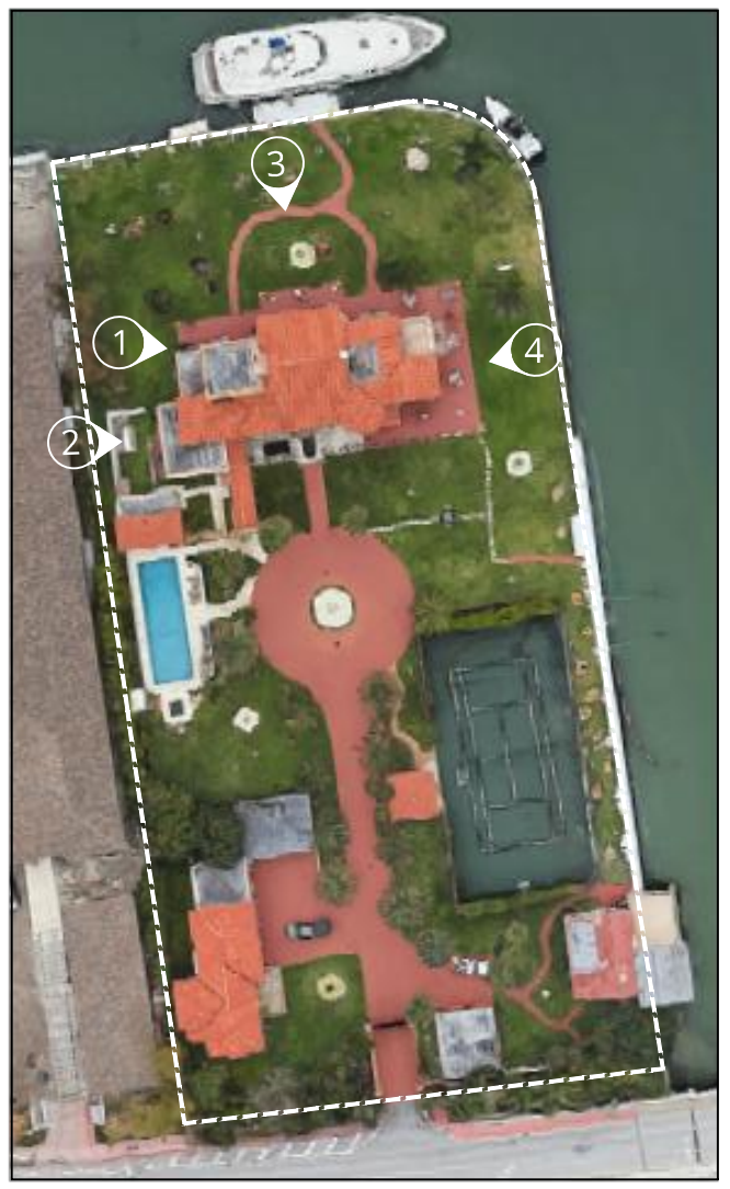
PINE TREE DRIVE PROPERTIES (TOP VIEW)