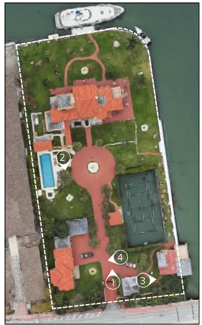
PINE TREE DRIVE PROPERTIES (TOP VIEW)

Copyright © 2020 Luce Architects. All rights reserved.