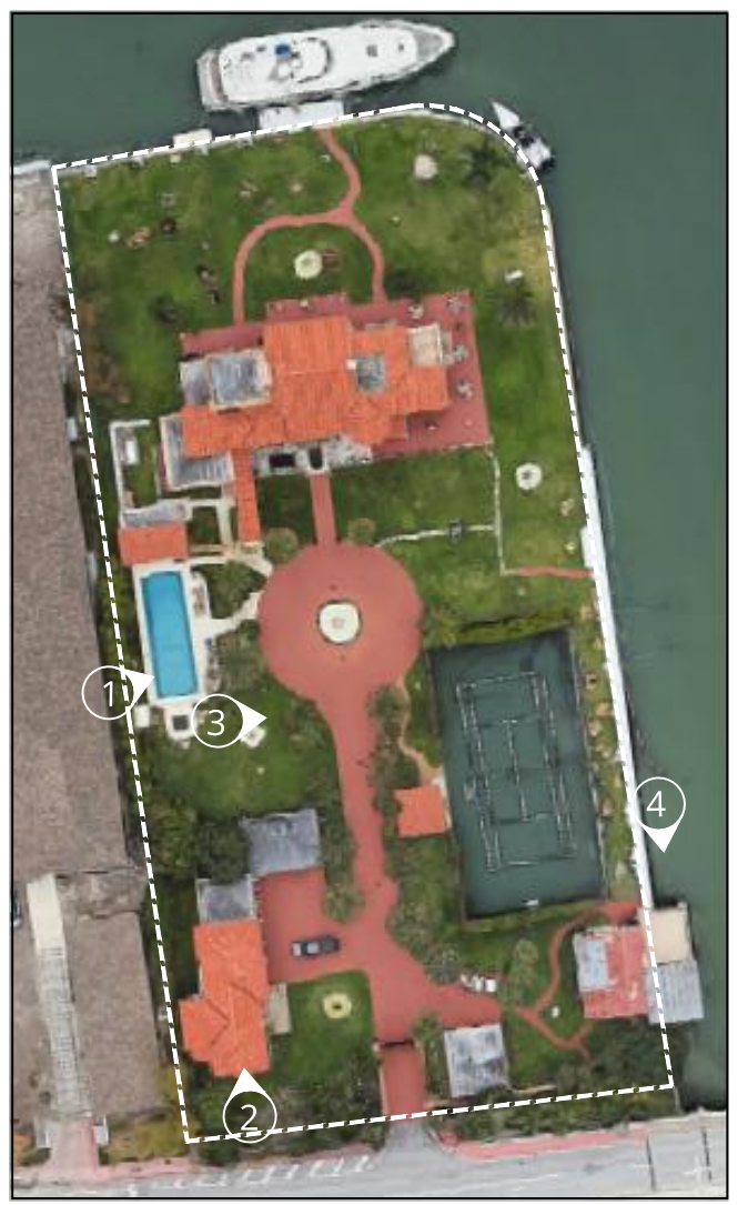
PINE TREE DRIVE PROPERTIES (TOP VIEW)