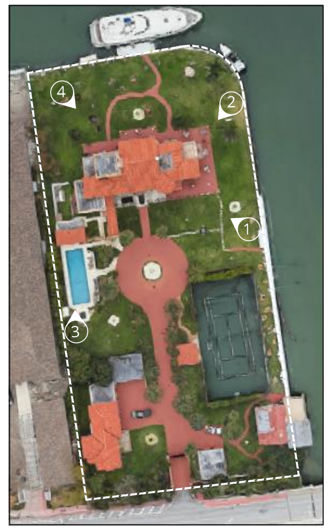
PINE TREE DRIVE PROPERTIES (TOP VIEW)