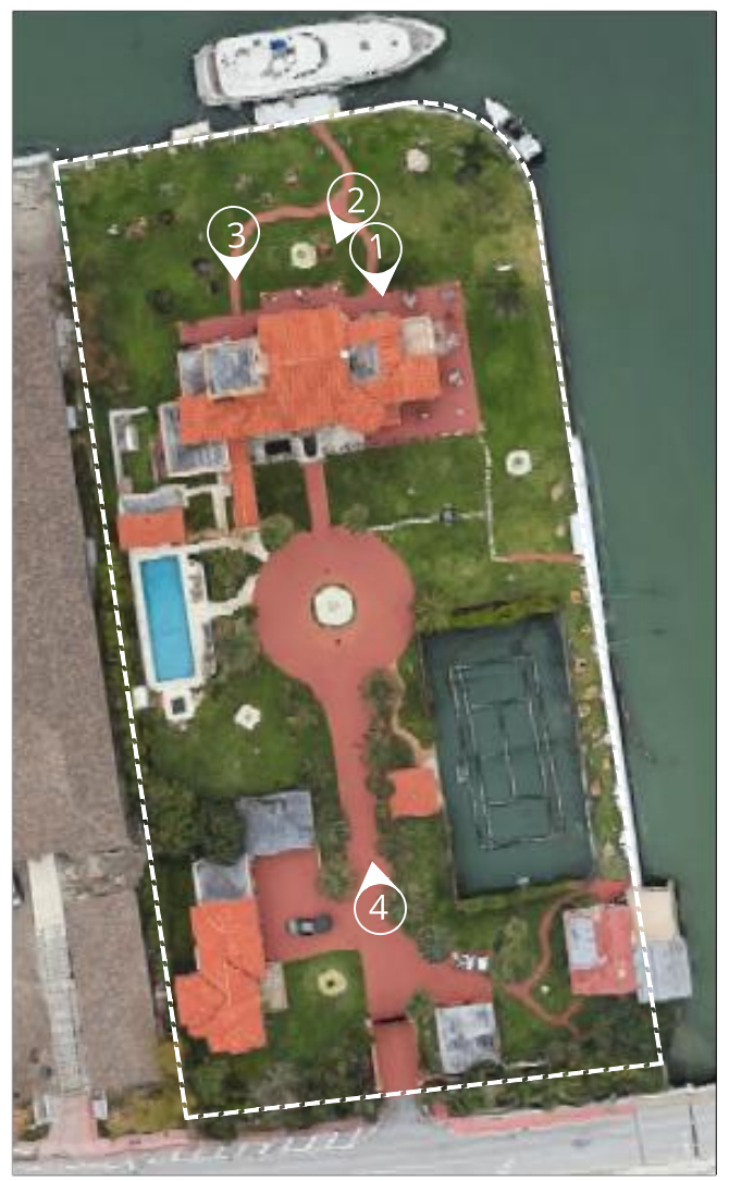
PINE TREE DRIVE PROPERTIES (TOP VIEW)