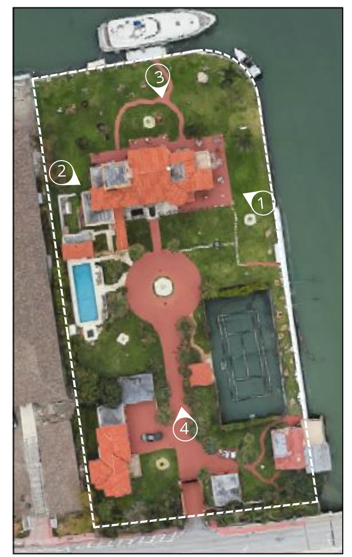
PINE TREE DRIVE PROPERTIES (TOP VIEW)