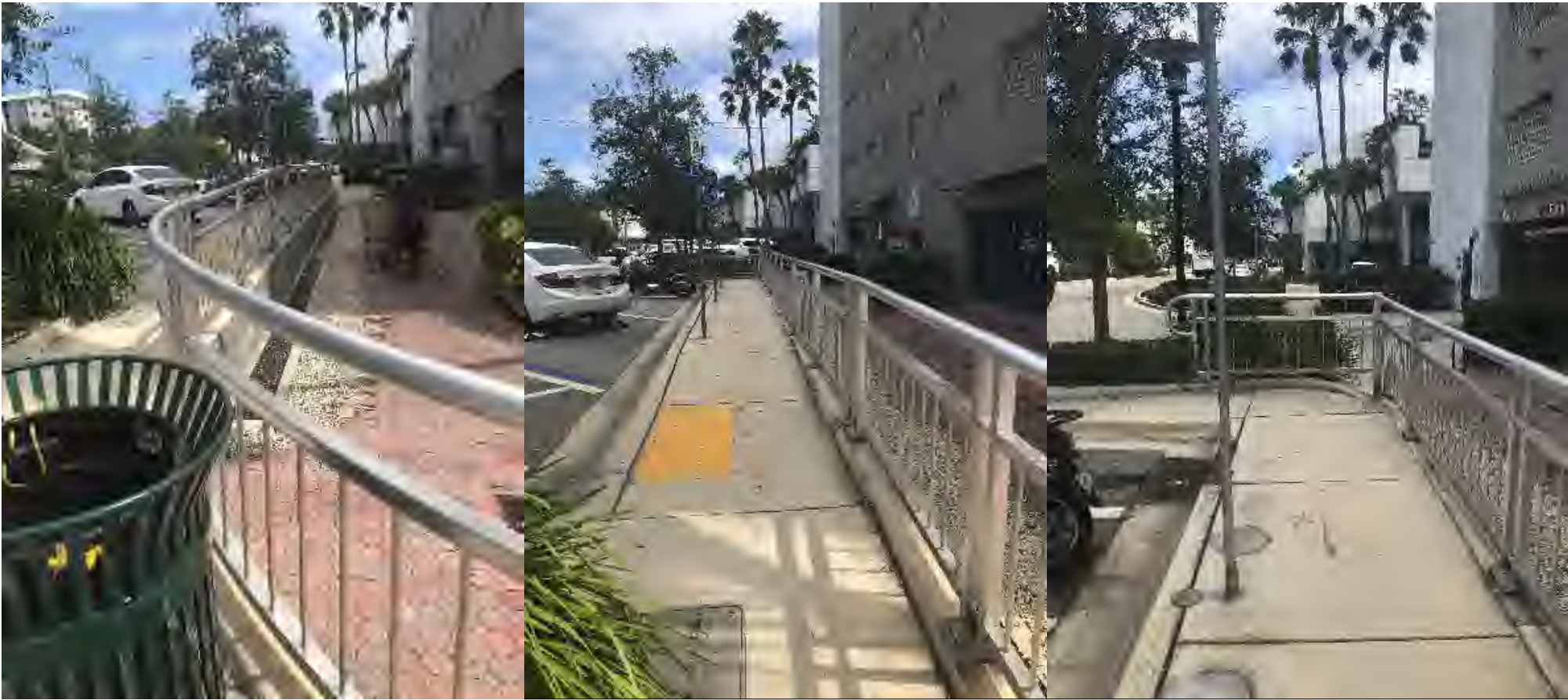
5. 10TH STREET. PHOTOGRAPHS TAKEN ON OCTOBER 1ST, 2019