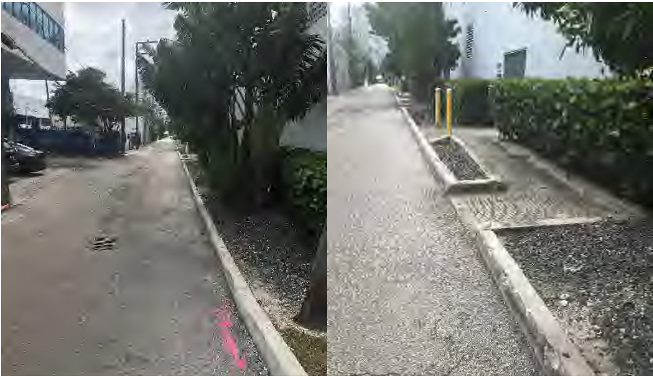
6. ALTON CT. PHOTOGRAPHS TAKEN ON OCTOBER 1ST, 2019