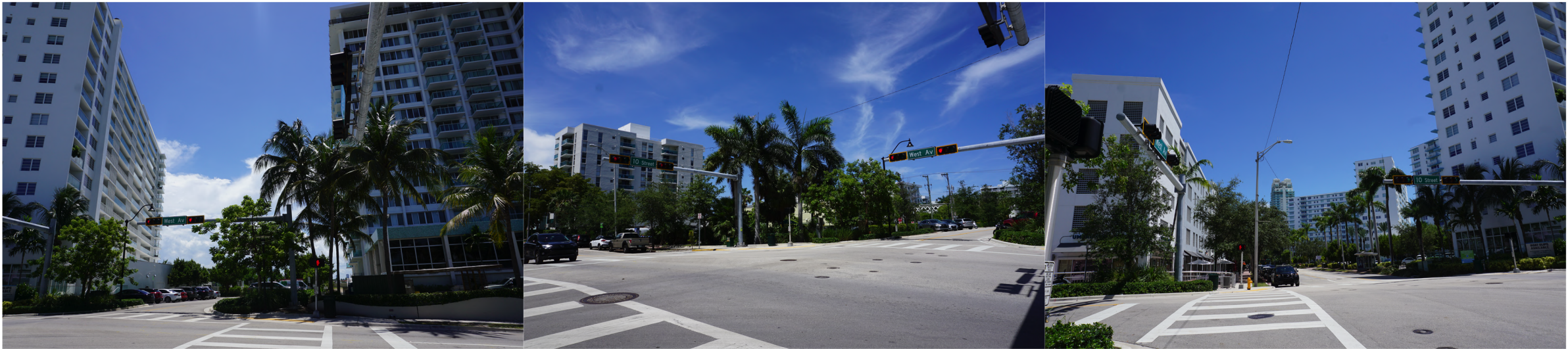
1. WEST AVE AND 10TH ST INTERSECTION. PHOTOGRAPHS TAKEN ON JULY 8TH, 2020