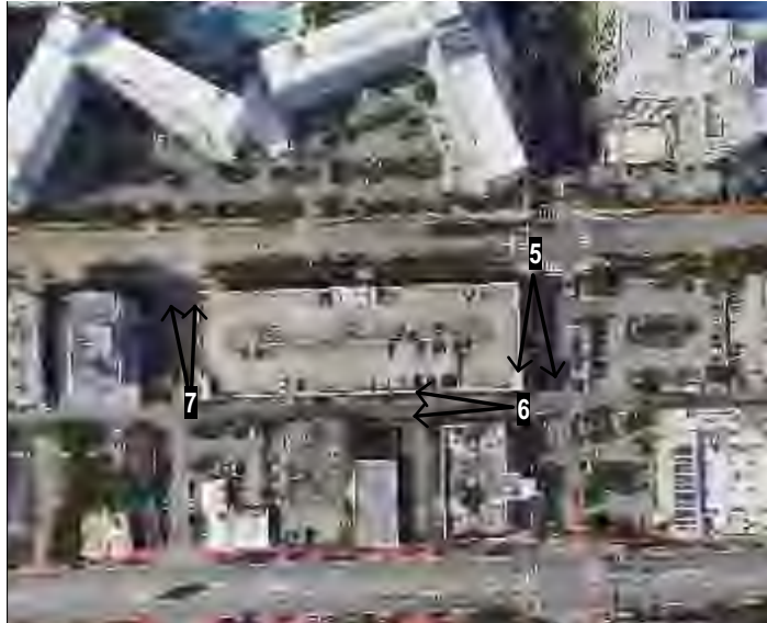
KEY PLAN 1:200