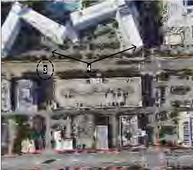
KEY PLAN 1:200