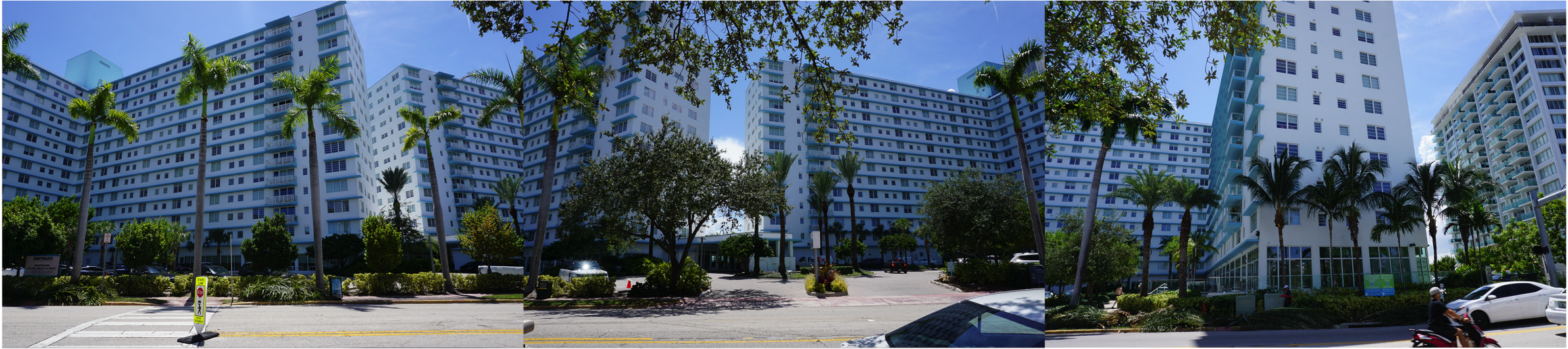
4. EAST FACADE ALONG WEST AVENUE. PHOTOGRAPH TAKEN ON JULY 8TH, 2020