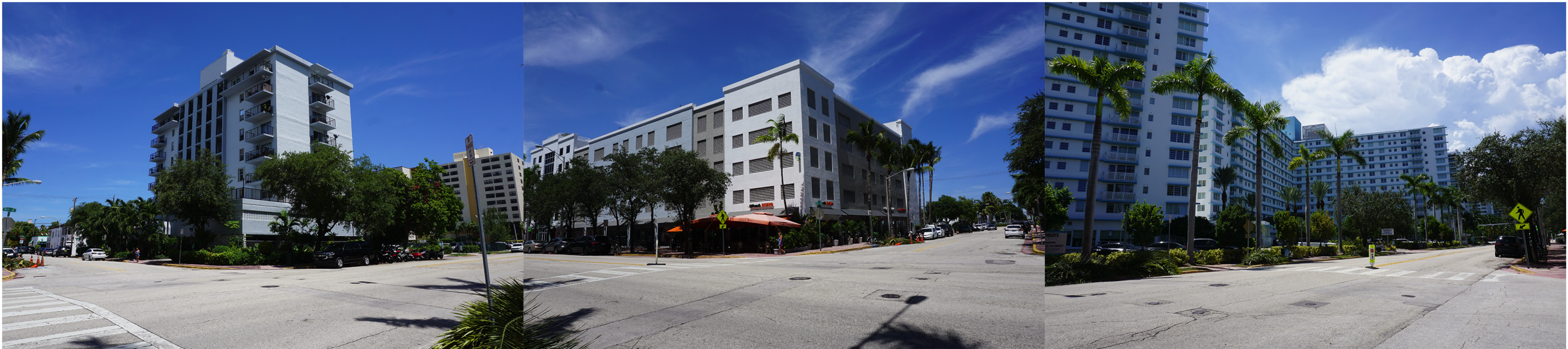
3. WEST AVE AND 9TH ST INTERSECTION. PHOTOGRAPHS TAKEN ON JULY 8TH, 2020 JULY 8TH, 2020