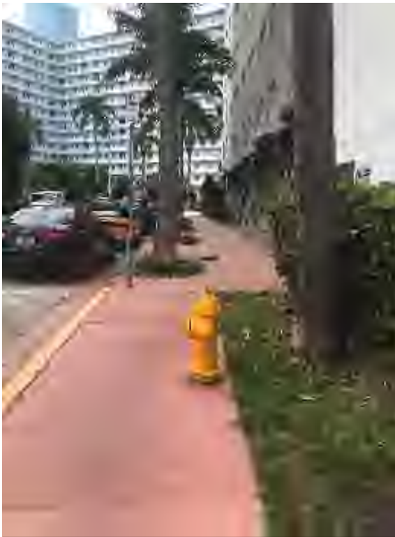
7.9TH STREET. PHOTOGRAPHS TAKEN ON OCTOBER 1ST, 2019