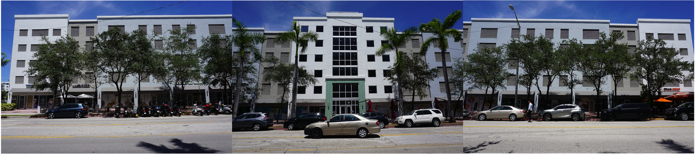
2. WEST AVENUE. PHOTOGRAPH TAKEN ON JULY 8TH, 2020