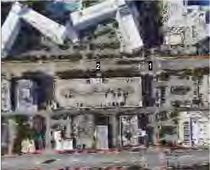
KEY PLAN 1:200