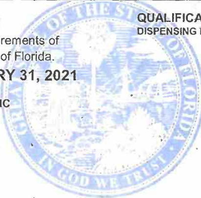
Rick Scott GOVERNOR

QUALIFICATION(S): DISPENSING PRACTITIONER