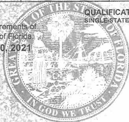
Ron DeSantis GOVERNOR