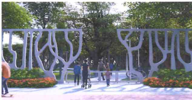
Major Gateway entrance—Collins Avenue elevation

The major gateway entrances are proposed along Collins Avenue and coordinate at 81 st Street, 83 rd