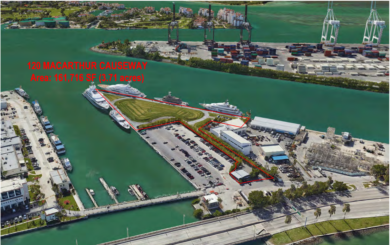
VIEW TOWARD SOUTH