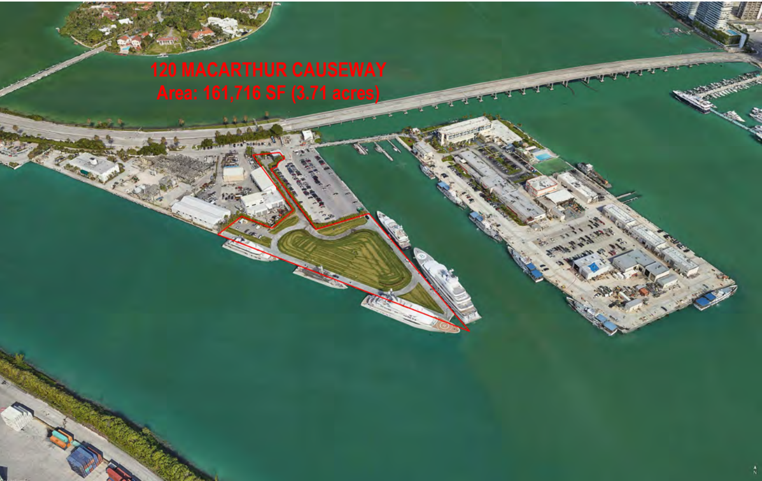
VIEW TOWARD NORTH