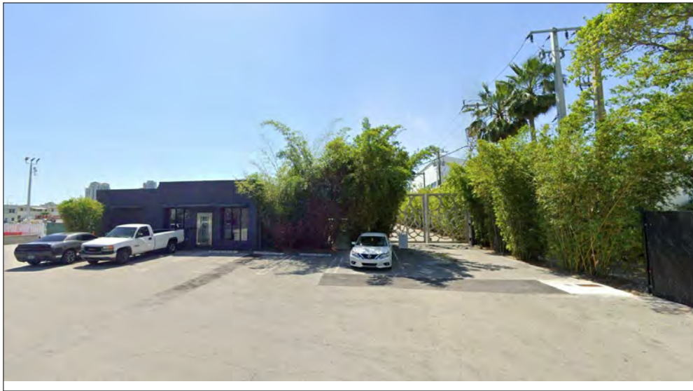
A. Entrance view