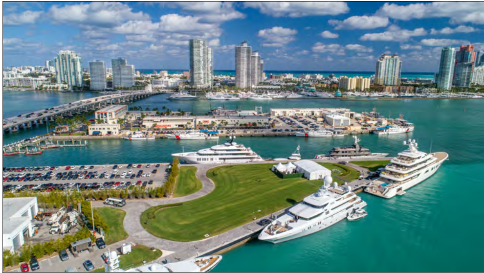
C. Aerial view of the marina