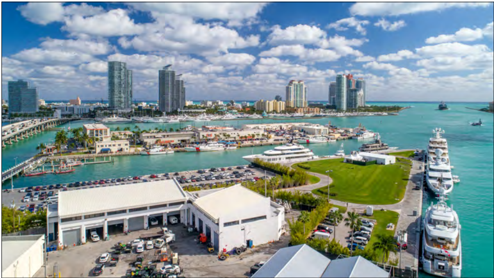
B. Aerial view of the marina