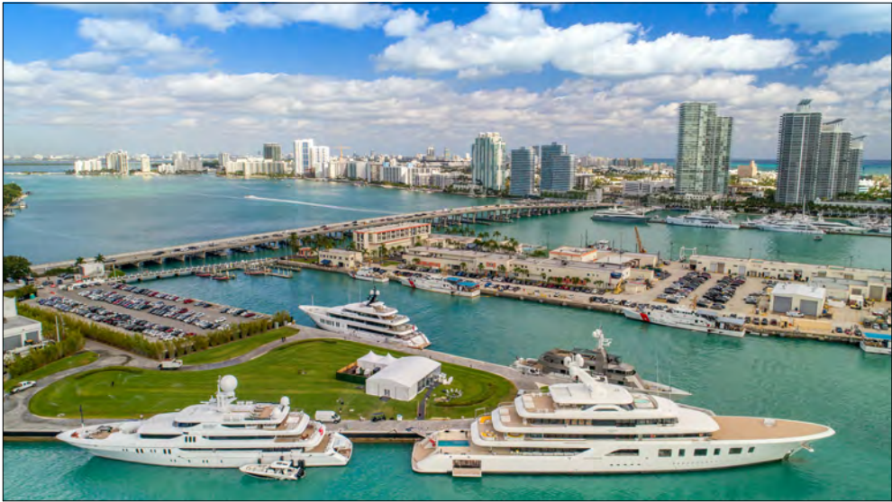
D. Aerial view of the marina