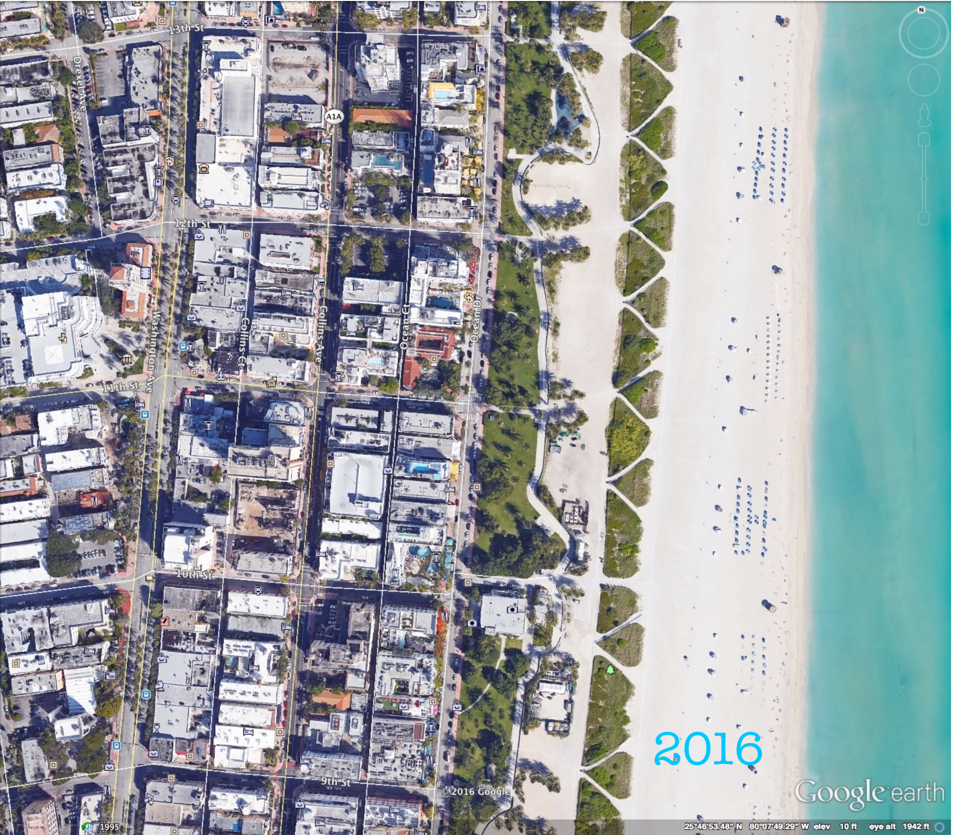
ABOVE: 2016 GOOGLE EARTH AERIAL PHOTOGRAPH