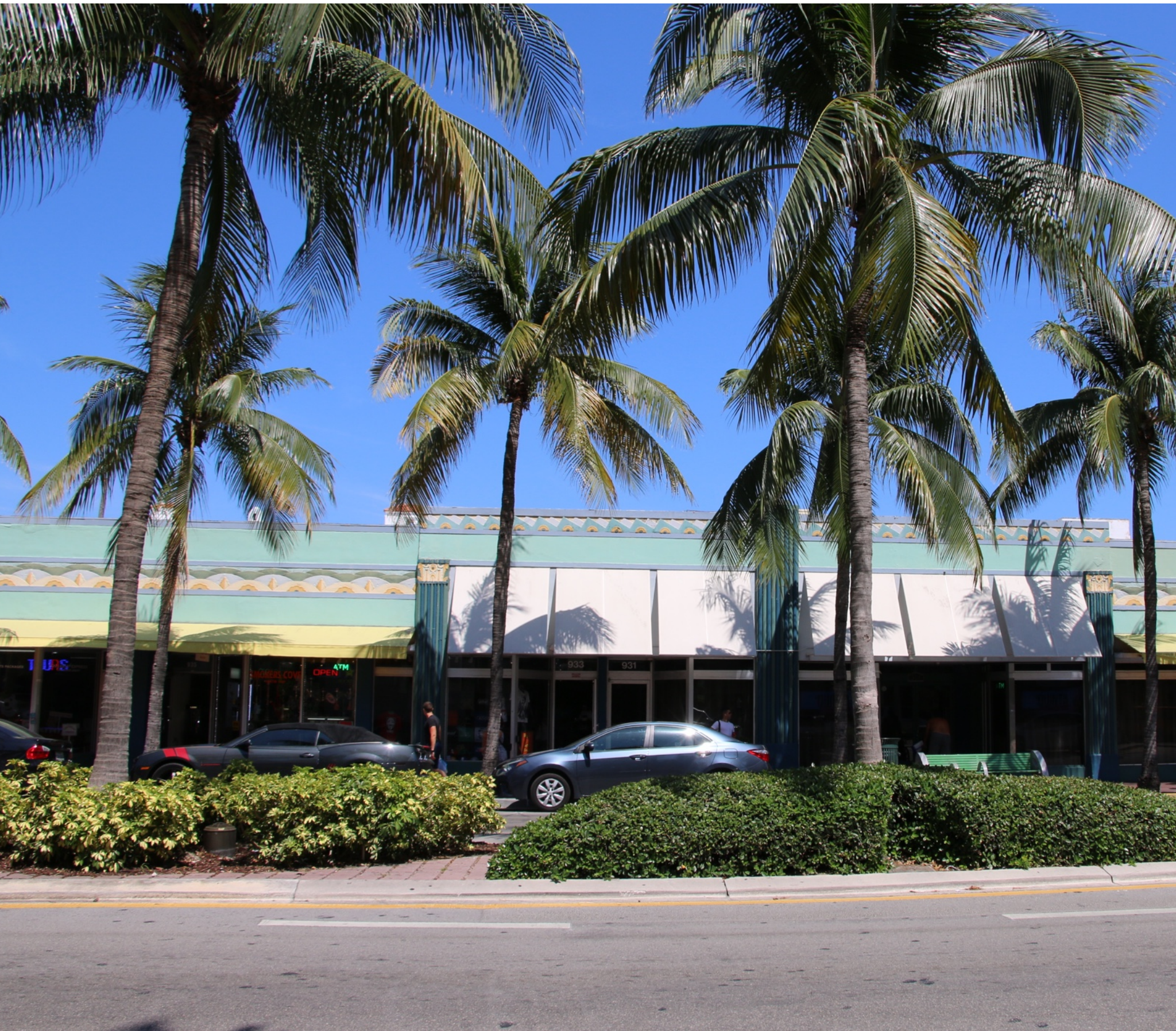
2016 PHOTOGRAPH 913 - 943 WASHINGTON AVENUE (3)