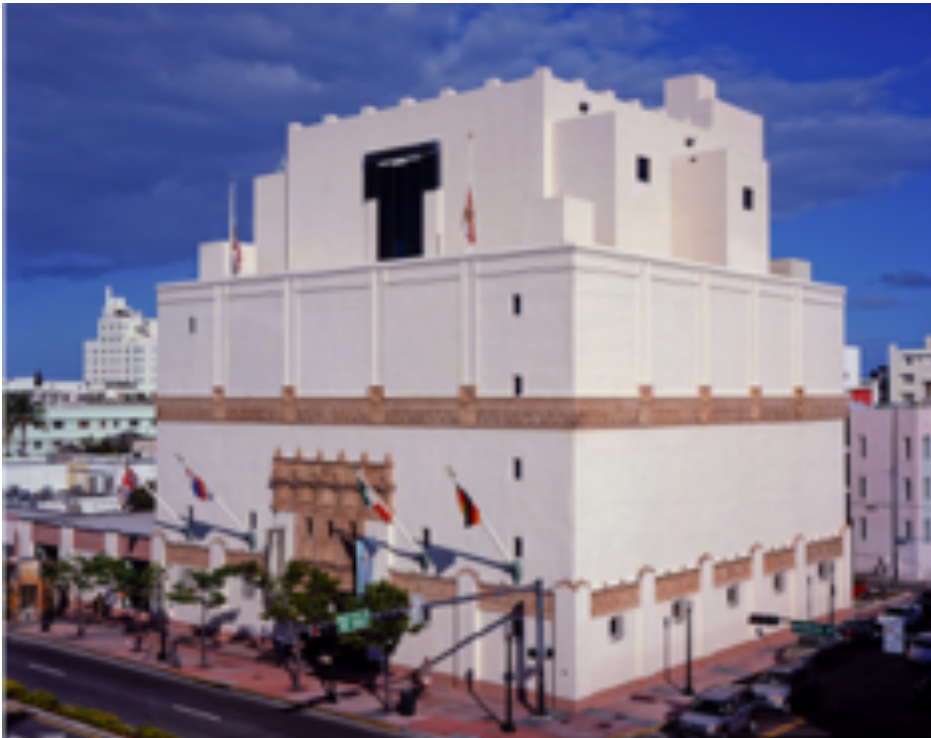
LOWER PHOTO: PARK CENTRAL HOTEL, MIAMI BEACH (3) HENRY HOHAUSER ARCHITECT