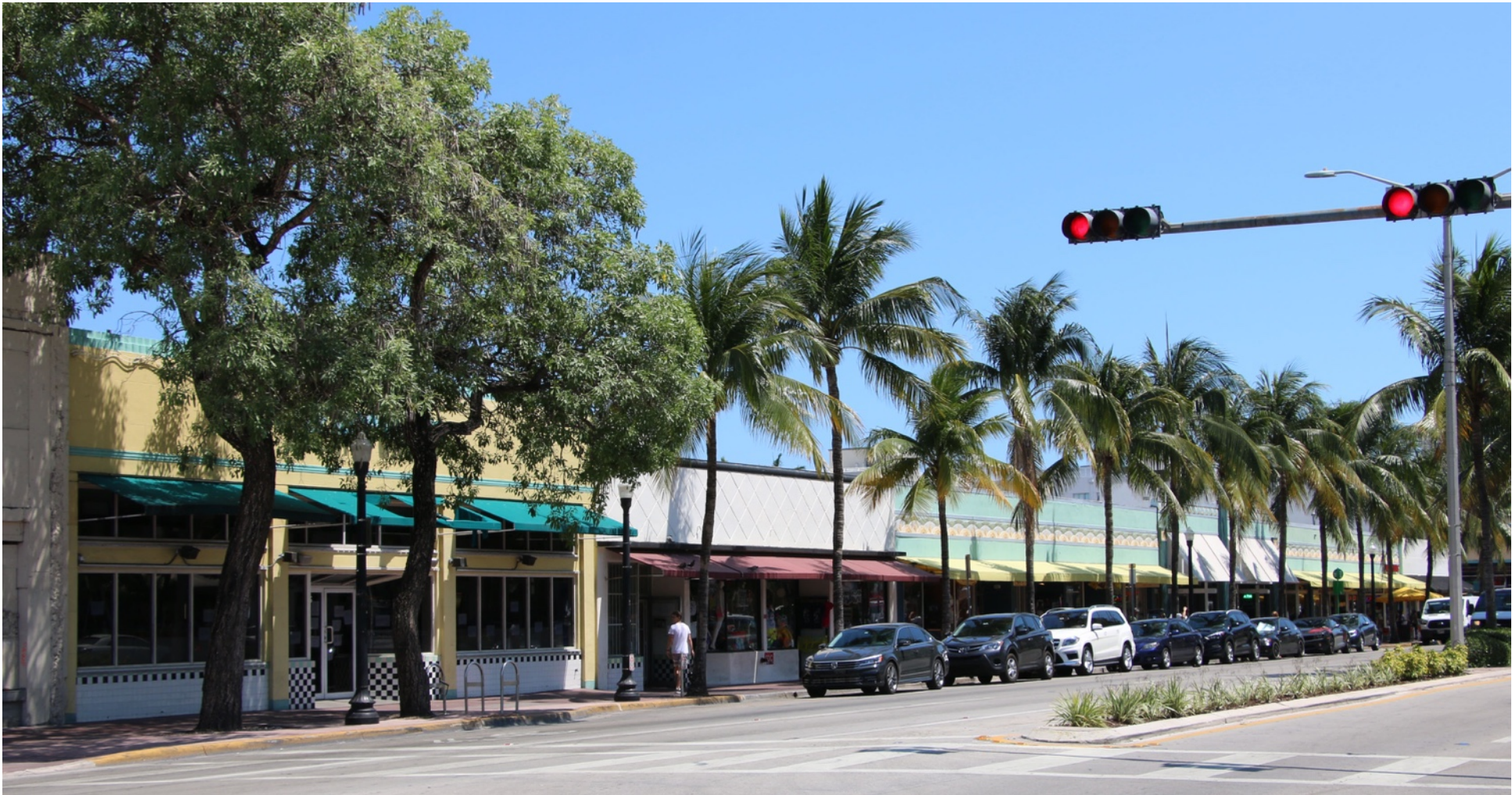
2016 PANORAMIC PHOTOGRAPH OF 755 + 747 + 713 - 743 WASHINGTON AVENUE (3)