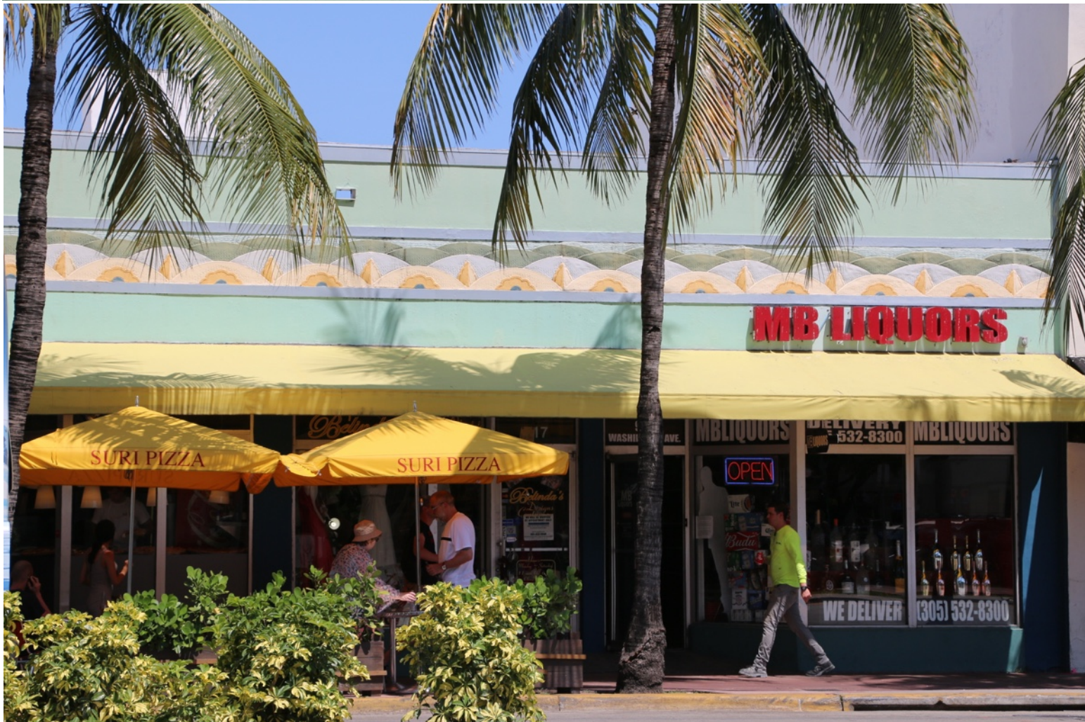
2016 PHOTOGRAPHS 913 - 943 WASHINGTON AVENUE (3)