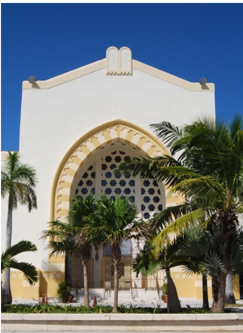
TOP PHOTO: TEMPLE ISRAEL, MIAMI (3)