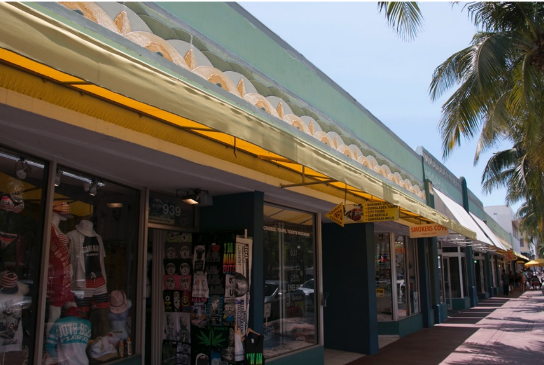
LEFT: 2016 PHOTOGRAPH 913-943 WASHINGTON AVE.