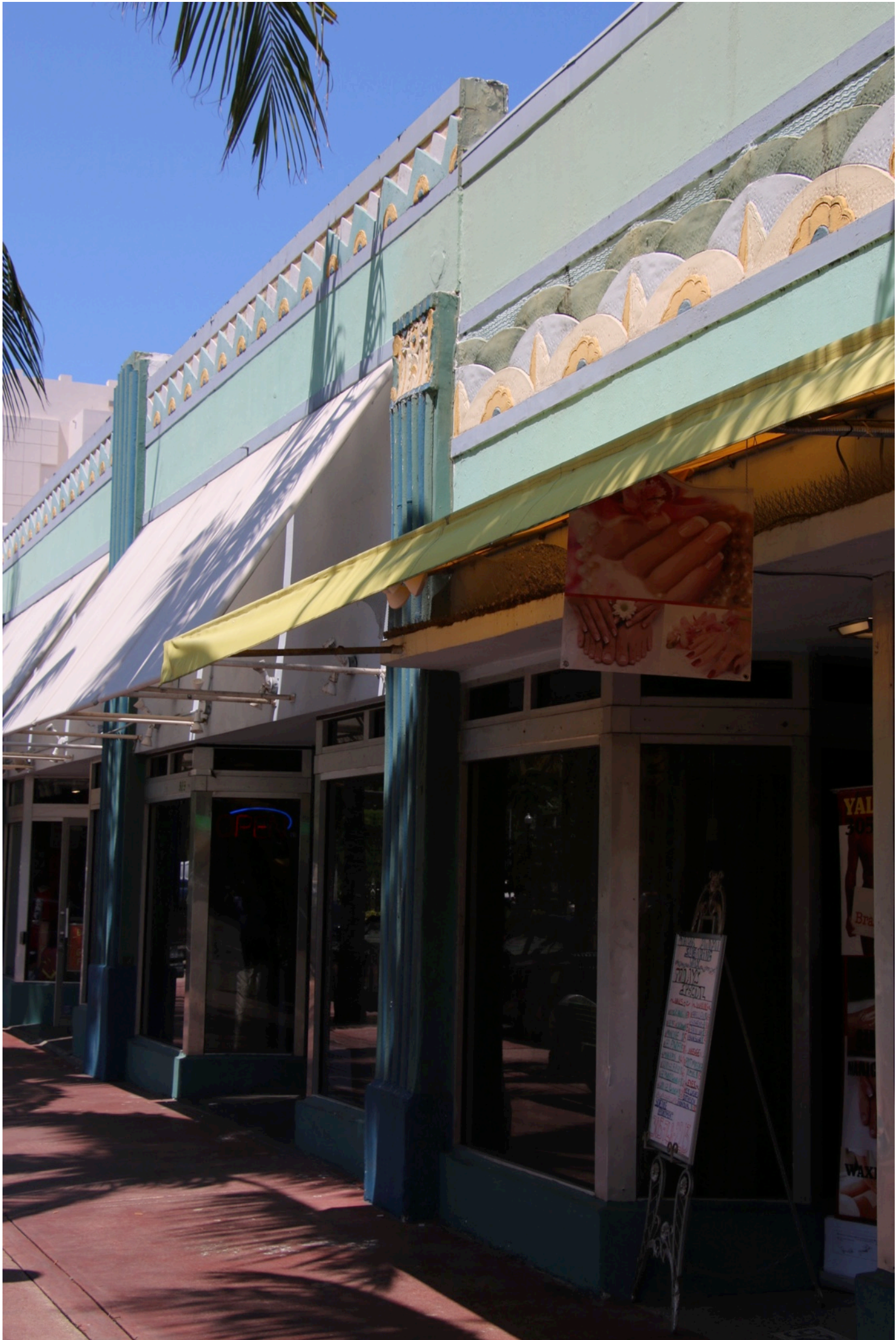
2016 PHOTOGRAPH 913 - 943 WASHINGTON AVENUE (3) FROM THE SIDEWALK