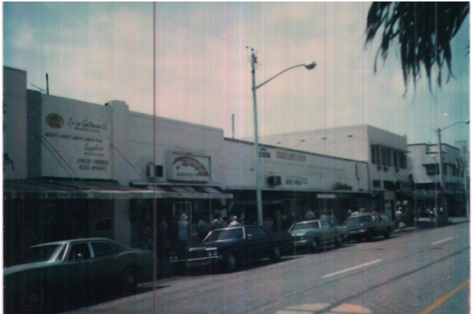
BELOW: LOOKING SOUTH @ 913-943 WASHINGTON AVENUE CIRCA 1973 (4)