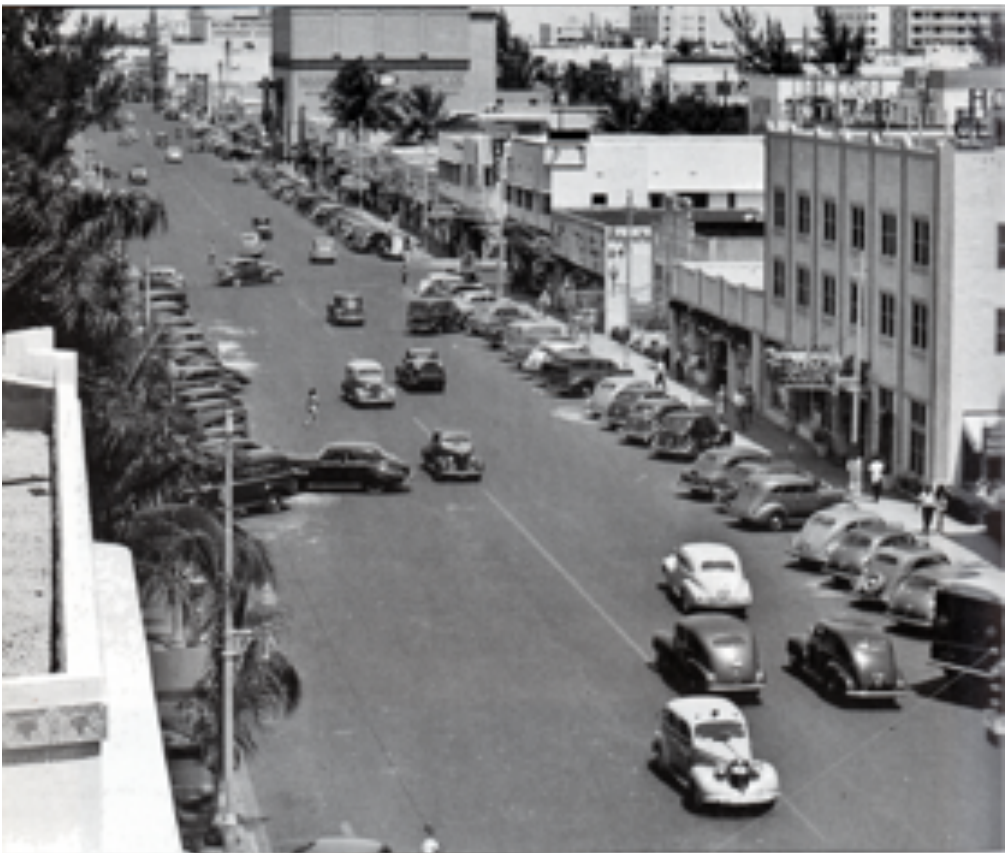
LOWER PHOTO: DECEMBER, 1940 VIEW LOOKING NORTH ON WASHINGTON AVENUE FROM 8th STREET. WASHINGTON STORAGE COMPANY IS AT TOP MIDDLE.