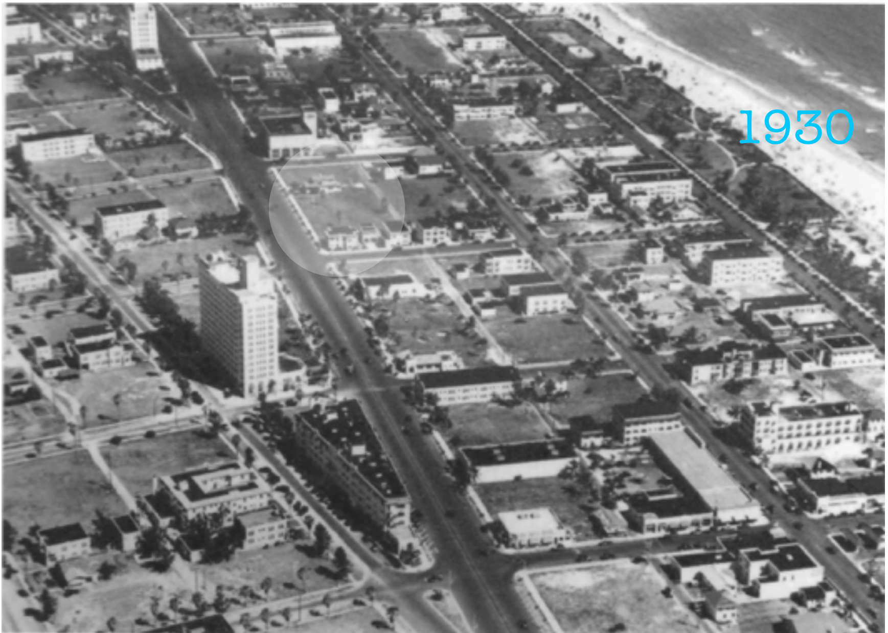
AERIAL VIEW OF SOUTH BEACH CIRCA 1930...THE ONLY EXISTING BUILDINGS ON THE EAST SIDE OF THE 900 BLOCK WASHINGTON AVENUE ARE RESIDENCES ALONG 9th STREET AND A MID-BLOCK RESIDENCE, BOTH OF WHICH HAVE LONG BEEN DEMOLISHED. (1)