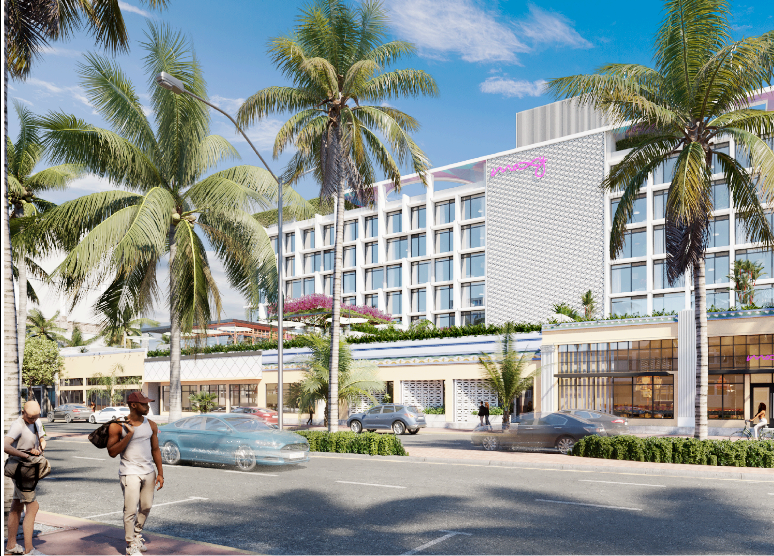
2 SOUTHWEST SIDE STREET VIEW OF ROOF TERRACE SCALE: N.T.S.

E D C B A THE DESIGNS INDICATED IN THESE DRAWINGS ARE PROPERTY OF SALADINO DESIGN STUDIOS INC.