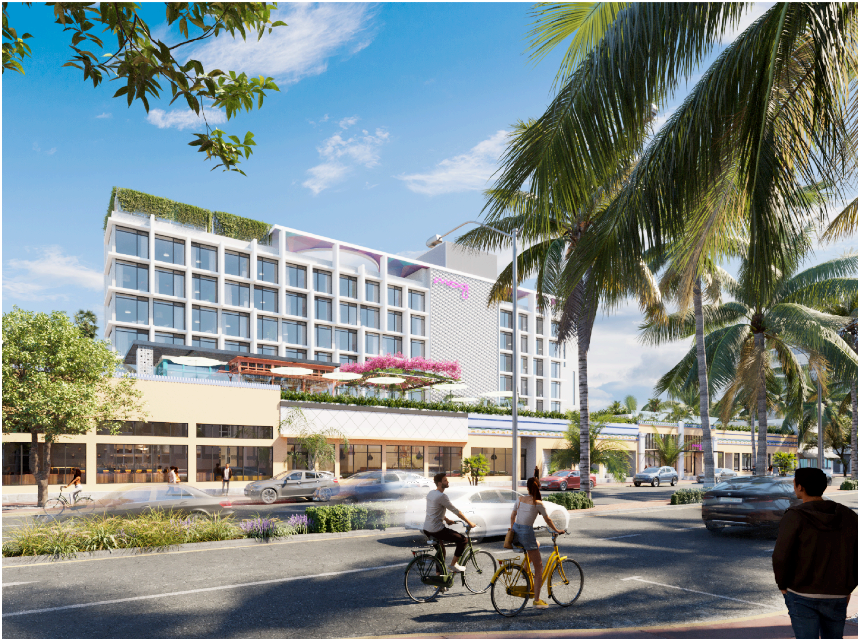
1 NORTHWEST SIDE STREET VIEW OF ROOF TERRACE SCALE: N.T.S.

ALL CONTRACTORS ARE RESPONSIBLE FOR FIELD VERIFICATION OF DIMENSIONS