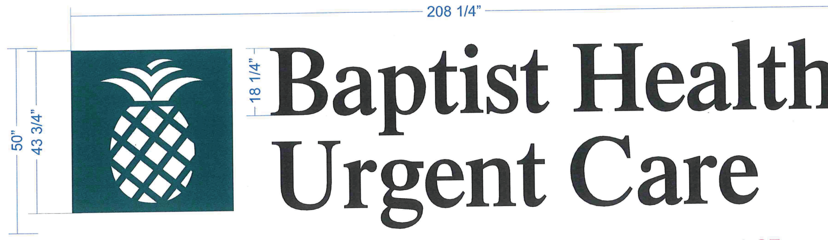
B2 Proposed Illuminated Wall Sign Scale: 1/2" = 1'-0"

Reverse Channel Illuminated letters/logo