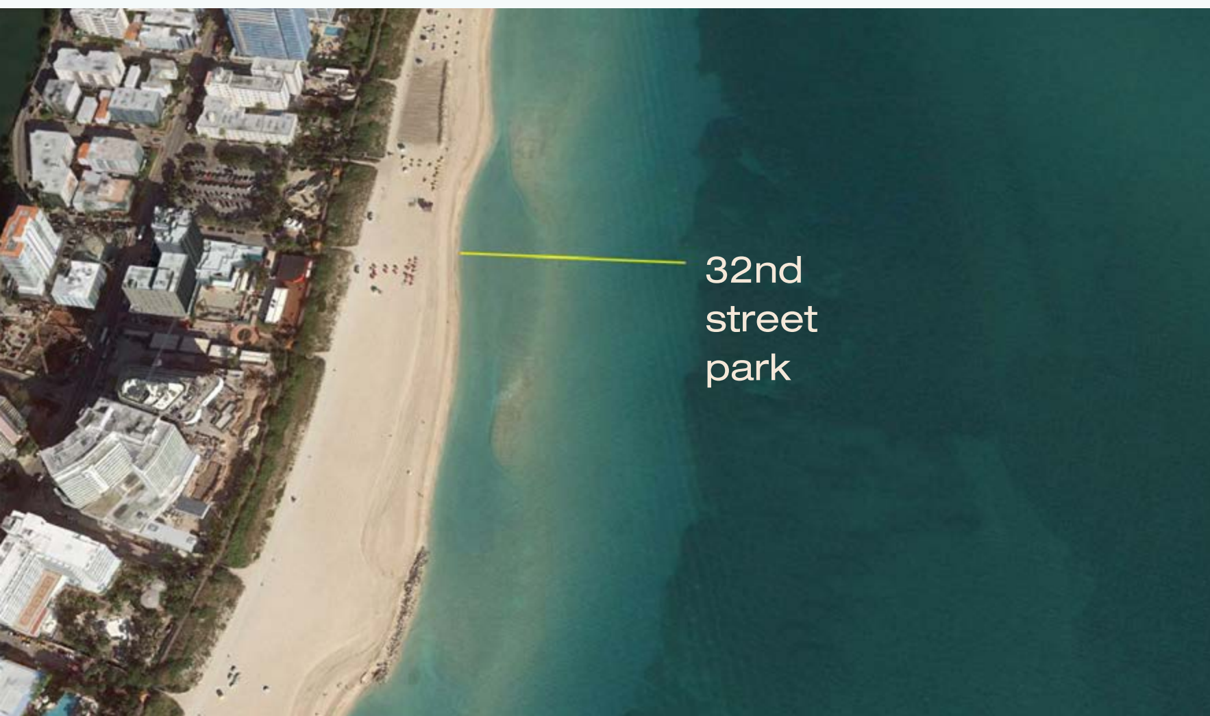
32nd street park