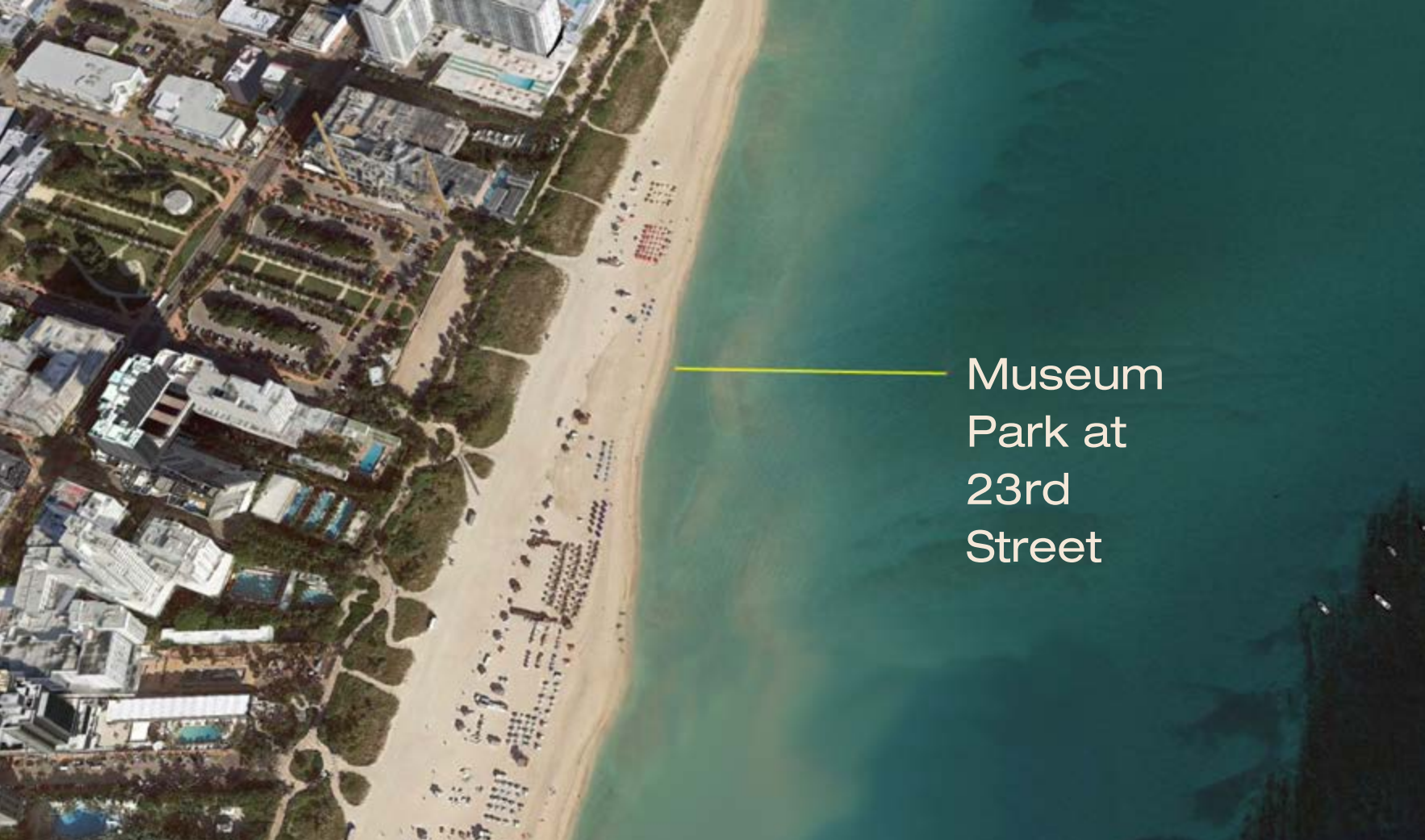
Museum Park at 23rd Street