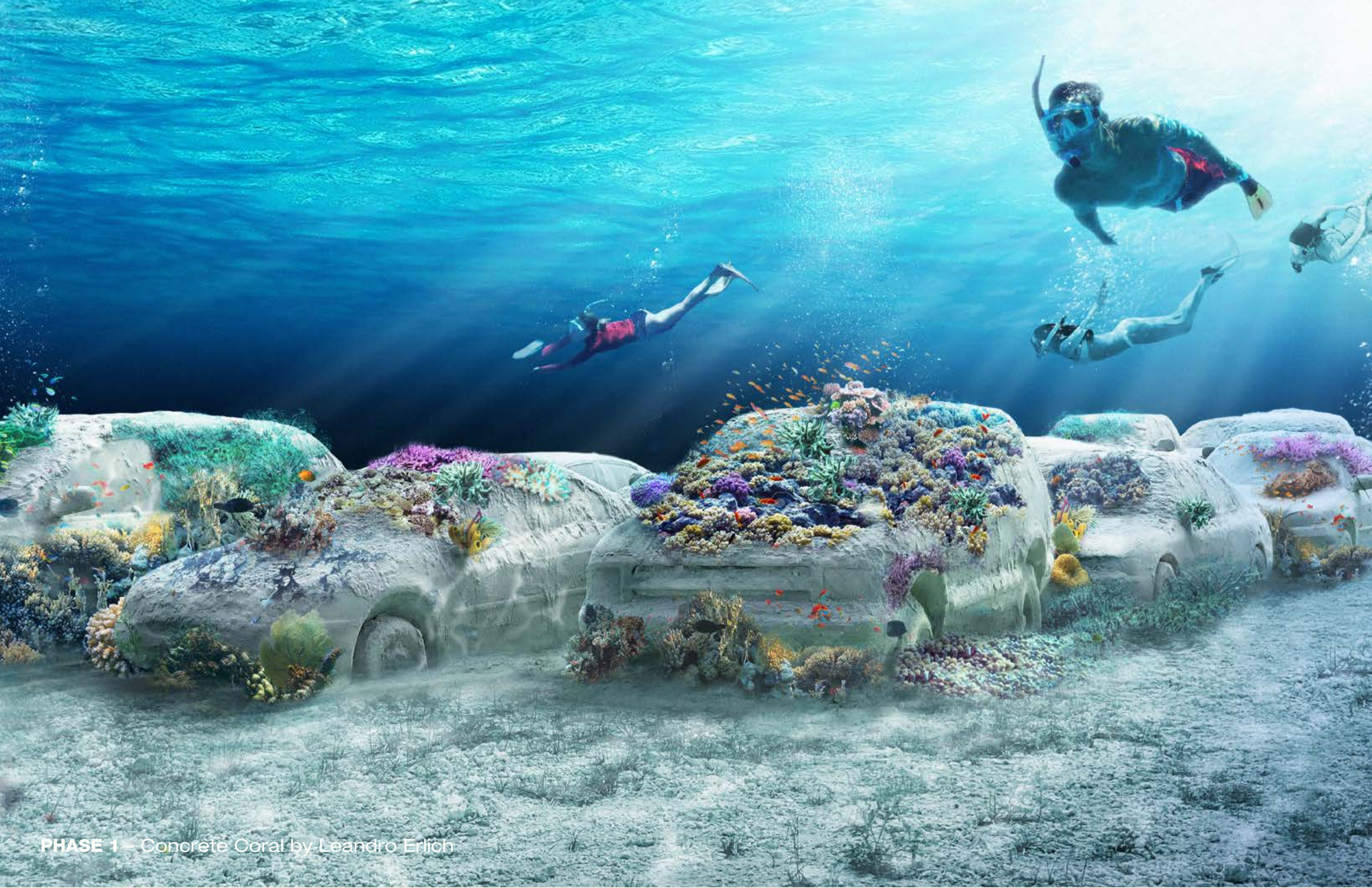
PHASE 1 – Concrete Coral by Leandro Erlich