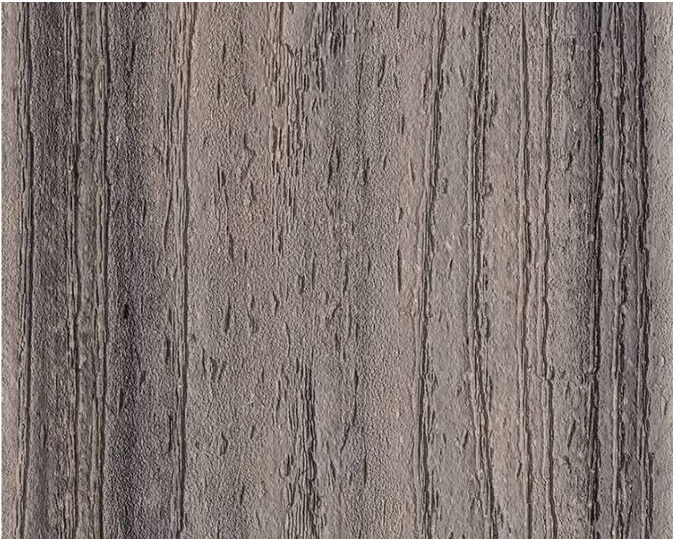
Transcend® Tropicals Color: ISLAND MIST