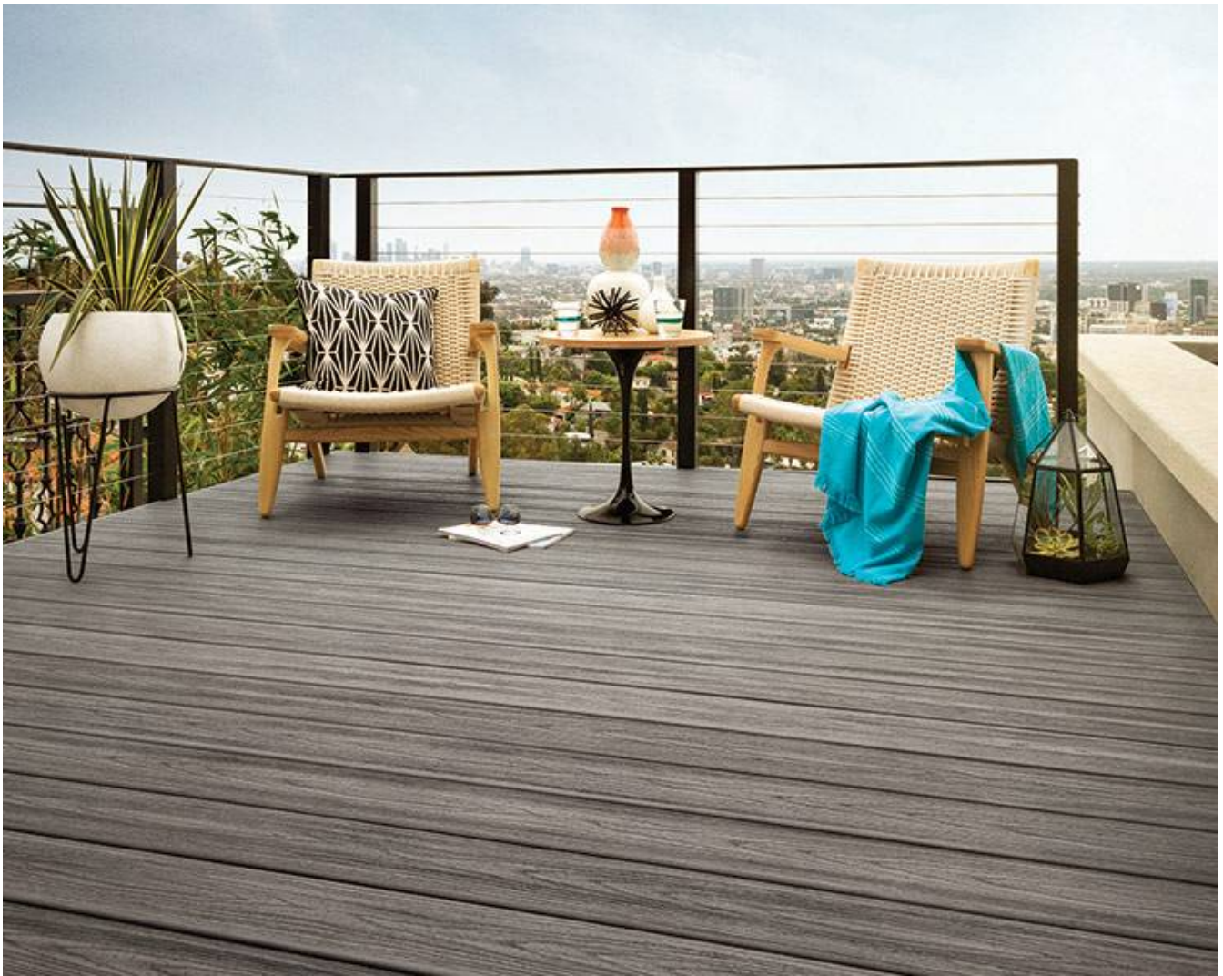
Sample of deck only