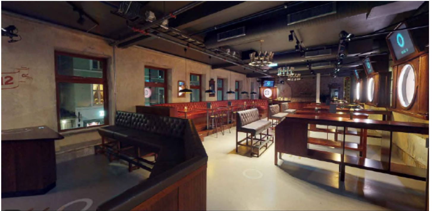
Oche: Oslo, Norway location

Oche is giving darts a new soul, with a brand new and innovative gaming concept. Share 85 minutes of action-packed and unique games with friends and colleagues in your very own Oche-booth. During the games, you can enjoy sharing menus and snacks, delivered to the booth by a dedicated and helpful waiter. Before or after battling it out, we have a great selection of cocktails, beer and wine to compliment the menu and keep you happy all night long. We want you to leave feeling as a winner, even if you lost the game.