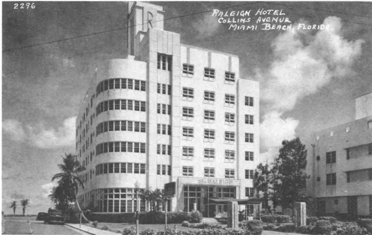
Raleigh Hotel, Ca. 1940's Postcard

The Raleigh Hotel constructed in 1940 and designed by L. Murray Dixon is an excellent example of the Streamline Moderne style in a larger scale hotel. Notable design features include, a broad rounded corner with ribbon windows, pink keystone clad entry portal, vertical accents and porthole windows. Additionally, the multi-foliated swimming pool is one of the most celebrated pool designs in America.