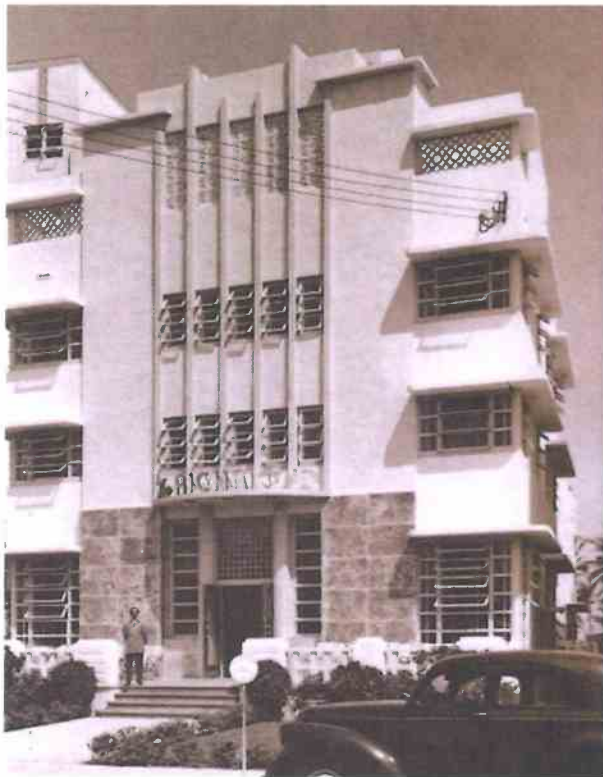
Richmond Hotel, Photograph, Ca. 1940's 1941 Dixon façade design