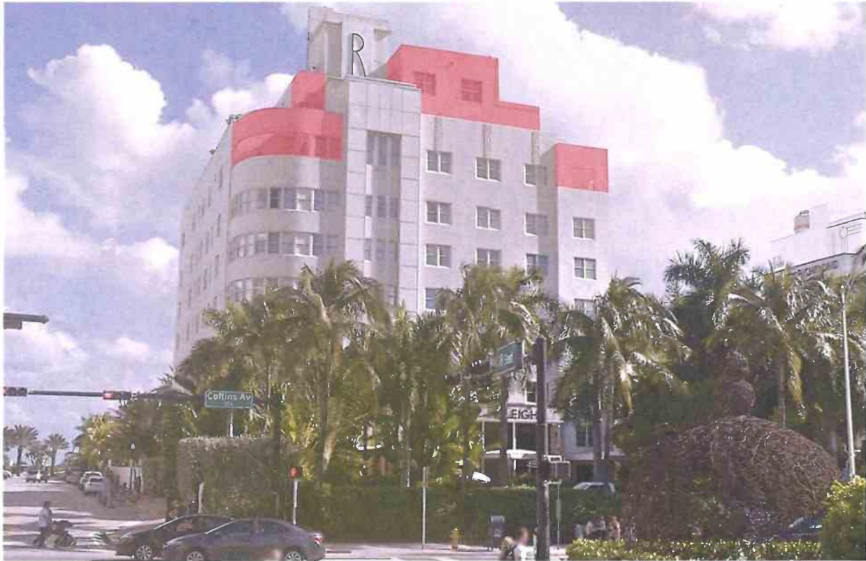
Raleigh Hotel, 2016 Photograph (rooftop additions highlighted in red proposed to be removed)

Staff is extremely supportive and enthusiastic of the expanded scope of restorative work. This additional scope in conjunction with the previously approved restoration will reposition the Raleigh Hotel as one of the most meticulously restored Streamline style hotels in the world.