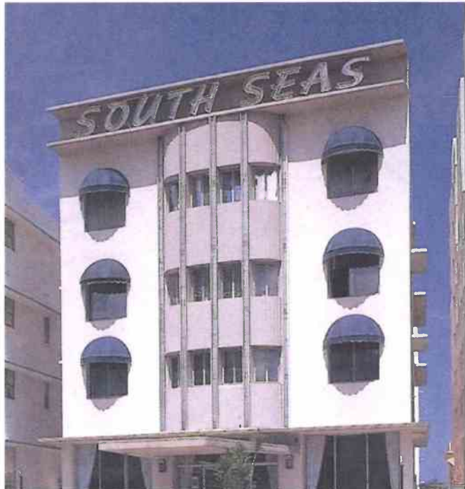
South Seas Hotel, 1988 Photograph 1954 Grossman façade design

Within the original public lobby, the applicant is proposing to retain and restore significant architectural features including the patterned terrazzo flooring and reception desk in its original location. In combination with the restoration, the applicant is proposing to reconfigure the remaining portion of the ground level, to be used as a lobby for the new residential tower.