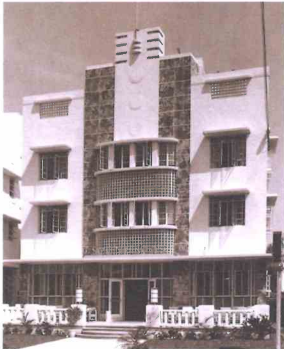
South Seas Hotel, Ca. 1940's Photograph 1941 Dixon façade design

of all significant architectural elements and materials that have been completely obscured by 1954 renovation. The restoration of the primary façade of this significant Art Deco hotel will serve to enhance the historic and architectural character of the district and is more consistent with the period of significance established for the Miami Beach Architectural District listed on the National Register of Historic Places.