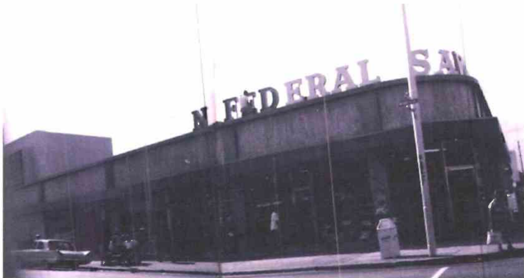
1260 Washington Avenue, 1963 photograph

The applicant is proposing the total demolition of this building in order to construct a new 6-story