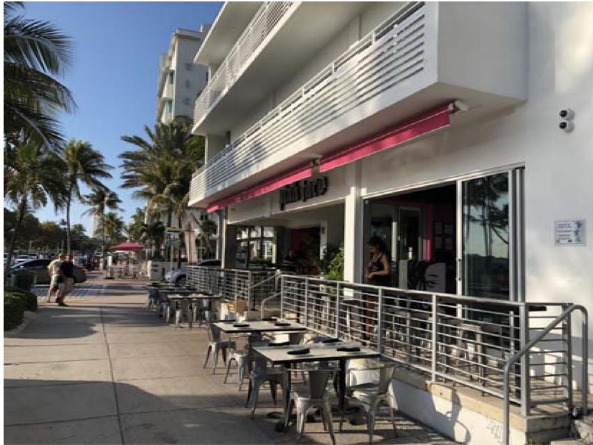
EXTERIOR - MAIN ENTRANCE, SIDEWALK AND PATIO DINING ALONG OCEAN DRIVE