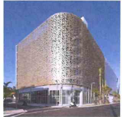
Images from parking garages/façade screening of newly completed garages in the Design District