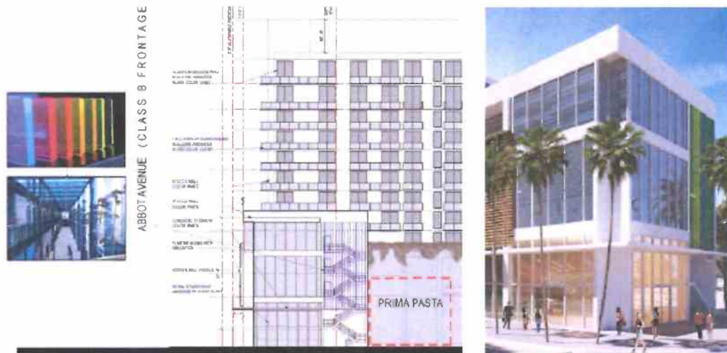
X1.4 and X1.5 Feature stair along 71 st Street.

The applicant has indicated some exterior modifications to the proposed stair along 71 st Street. As directed by the Board, the stair now appears to feature an open air design with colored vertical slats or fins. The unenclosed nature of the ground floor of the stair may encounter some challenges as it pertains to trash and refuse collection, safety concerns, potential housing of vagrants, and general maintenance goals. Although the architect has begun to improve the stair, further refinement and details are necessary.