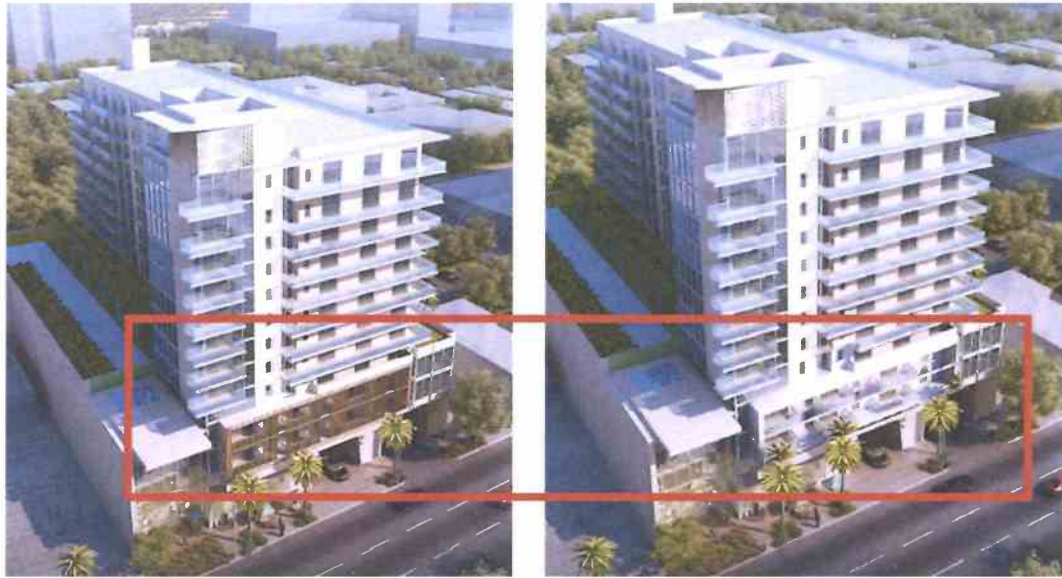
Comparison of residential liner along Byron Avenue (04-07-20 submittal on left, 07-07-20 submittal on right)