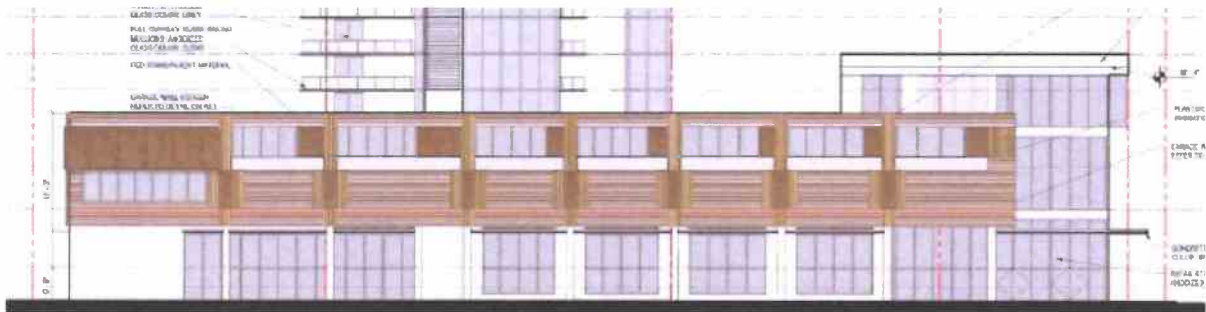
X1.1 Revised parking screening along Abbott Avenue.

The applicant has presented a revised sheet depicting further refinement of the parking screening. The treatment continues to reinforce a “residential feel” with the use of warm metal panels, planters, and windows despite the lack of residential units within the levels of this portion of the building. Staff does not recommend that this modification move forward, as it does not improve an already unsuccessful architectural treatment.