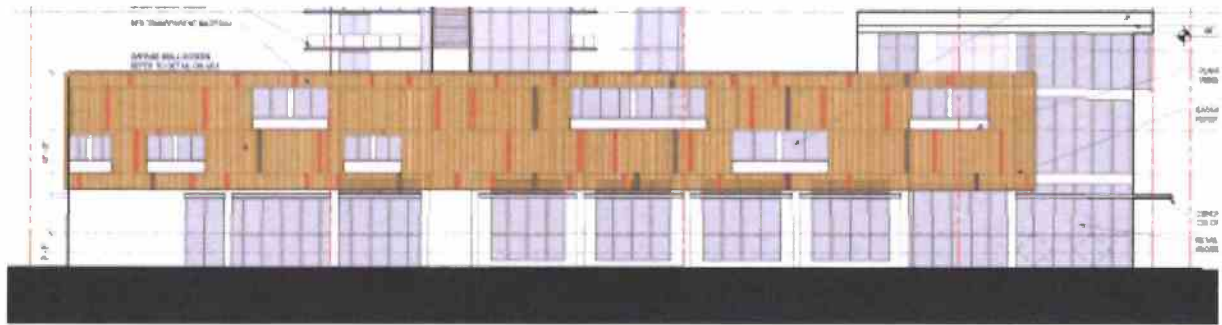
A4.3 Proposed elevation along Abbott Avenue.