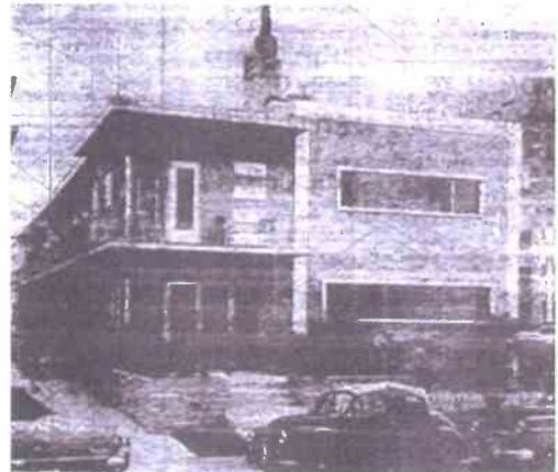
1735 James Av, 1953 photograph