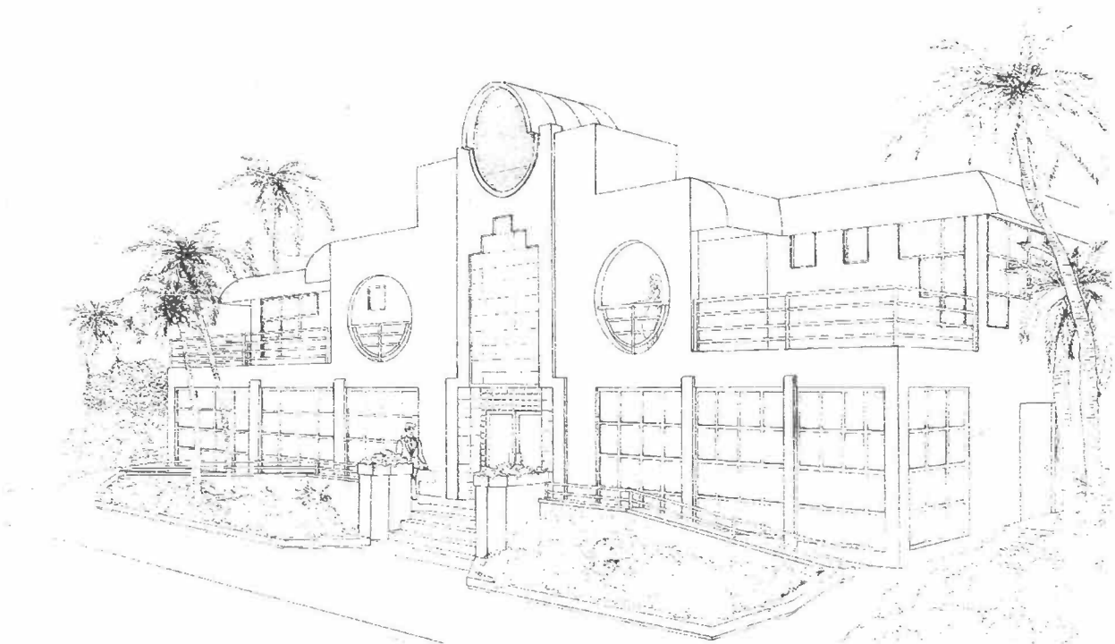
1735 & 1745 James Avenue rendering from 1984 renovation

In 1990, this property was designated as part of the Museum Local Historic District. At that time, the unified structure was classified as one Non-Historic/Conforming building. The Historic Properties Database card for this building notes “new façade is modern adaptation of deco style conforming in scale and setting”. Prior to 1994, the Historic Preservation Ordinance allowed for four Historic Properties Database classifications. On May 4, 1994, the Ordinance (94-2926) was amended requiring all properties to be classified as either Contributing or Non-Contributing, and all properties that were previously classified Non-Historic/Conforming were automatically and without review, reclassified to Contributing. As recently discussed, the Historic Properties Database has not been fully reevaluated with regard to current building classifications and erroneous classifications are likely to exist especially within historic districts designed prior to 2000.