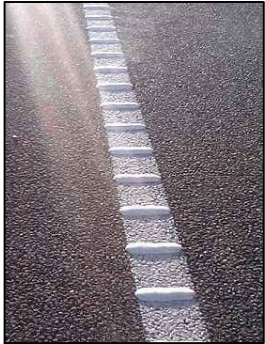
VIBRATORY PAVEMENT MARKING SAMPLE