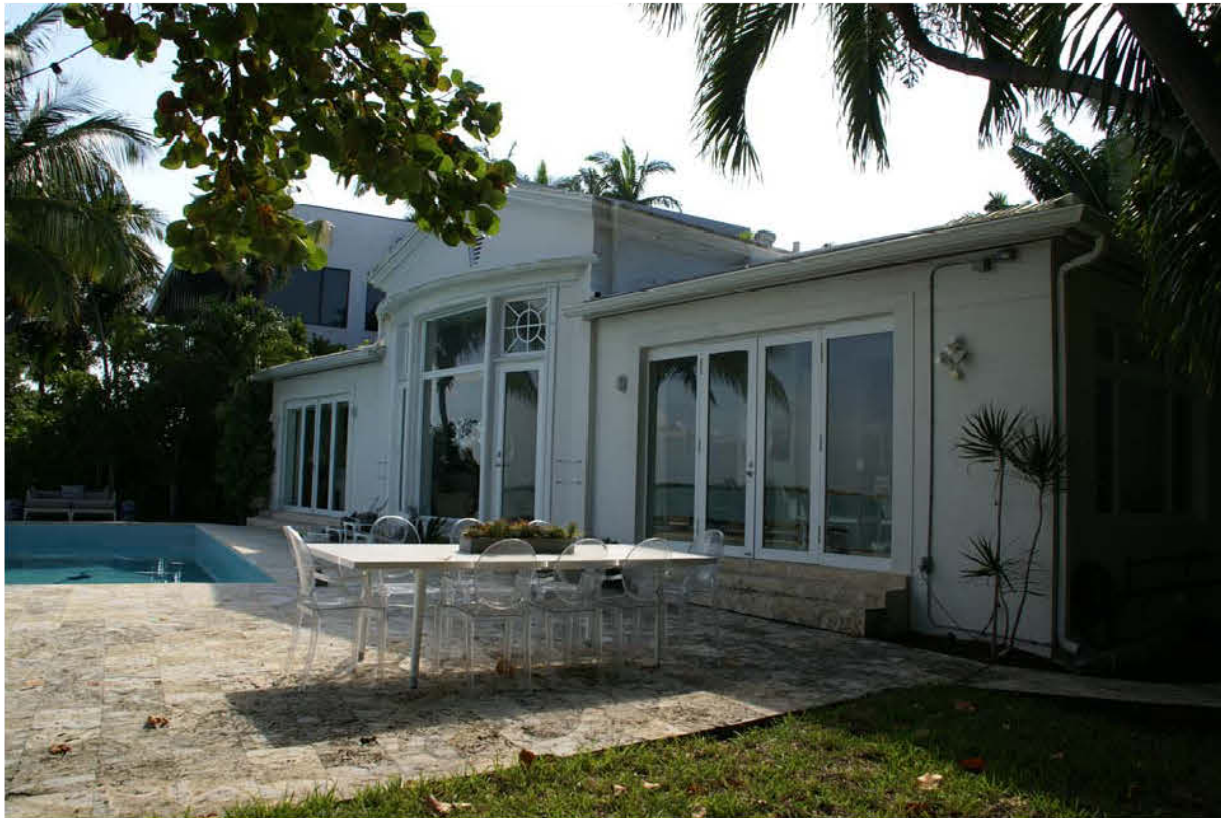
EXISTING RESIDENCE - MAIN BUILDING REAR