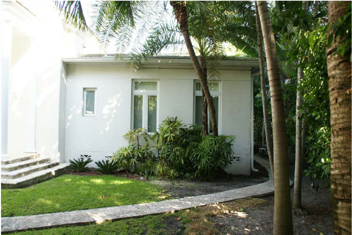
EXISTING RESIDENCE - MAIN BUILDING FRONT