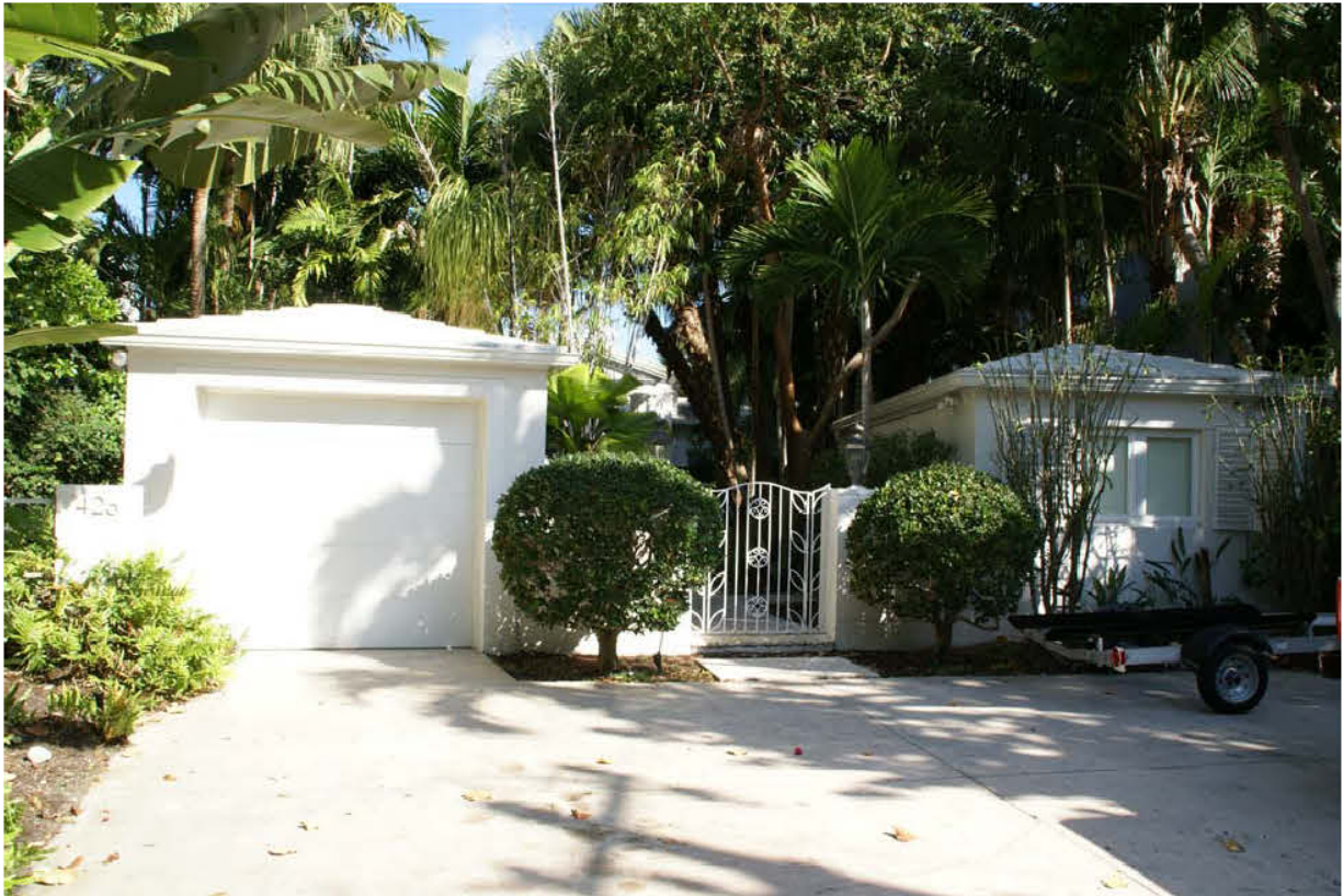
EXISTING RESIDENCE - FRONT OF GARAGE & GUESTHOUSE