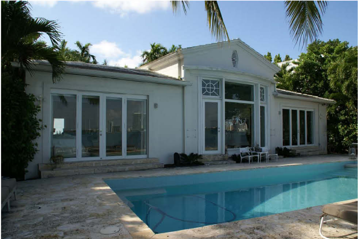
EXISTING RESIDENCE - MAIN BUILDING REAR