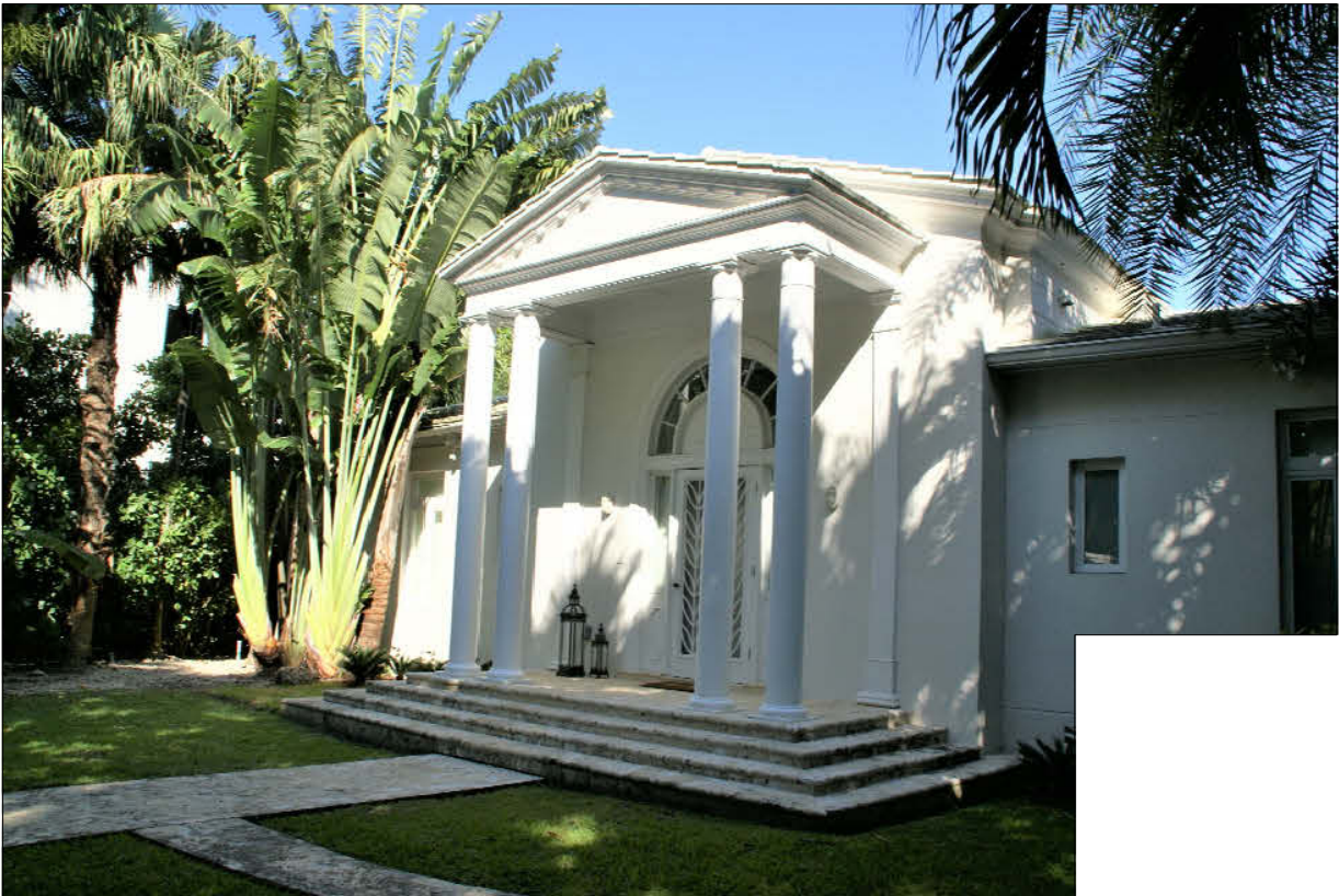
EXISTING RESIDENCE - MAIN BUILDING FRONT