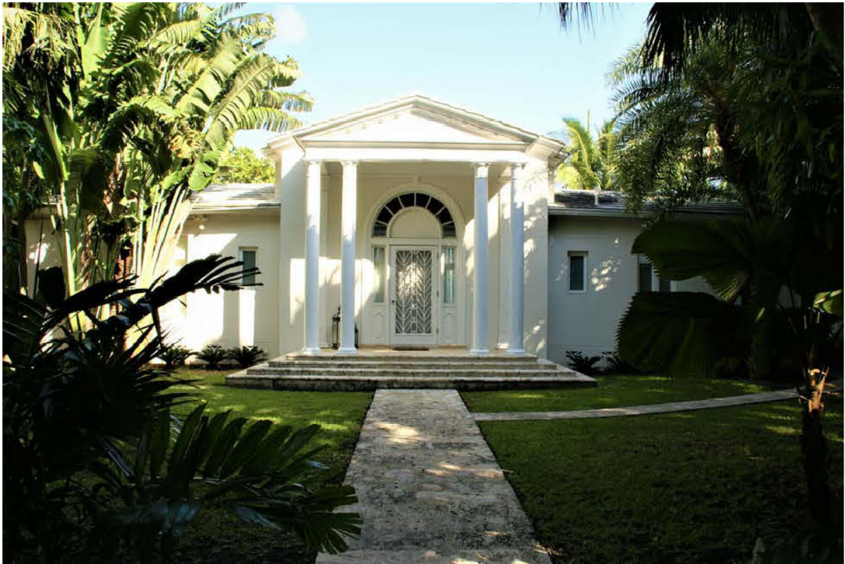
EXISTING RESIDENCE - MAIN BUILDING FRONT