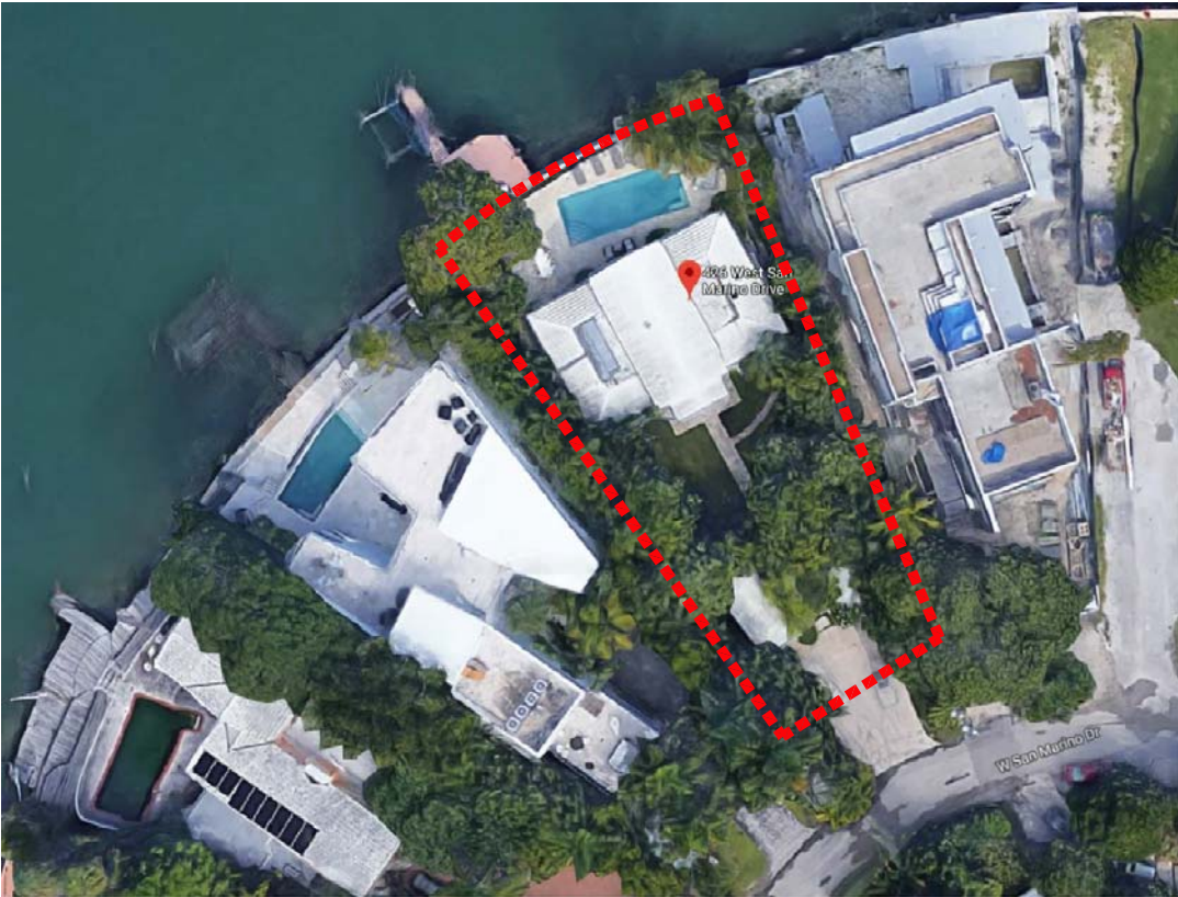
AERIAL VIEW - EXISTING RESIDENCE