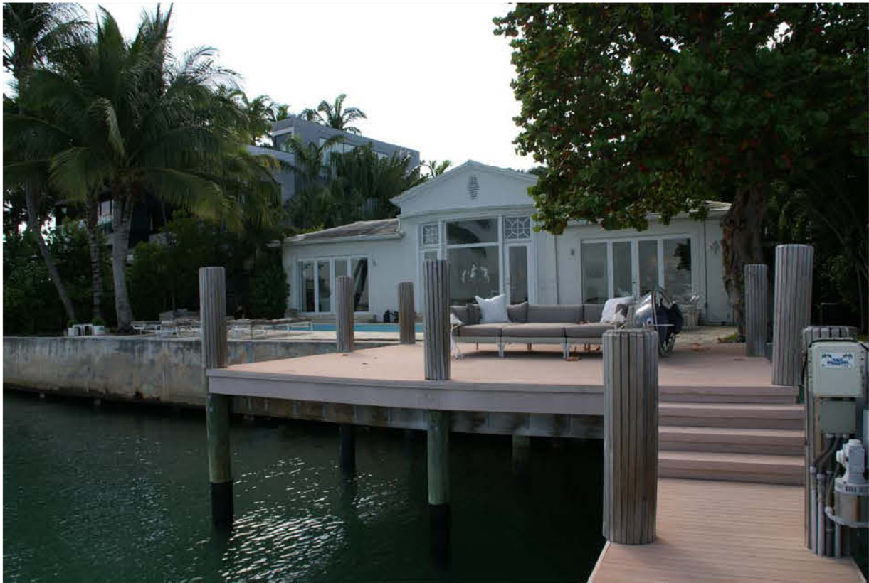
EXISTING RESIDENCE - MAIN BUILDING REAR FROM EXISTING DOCK