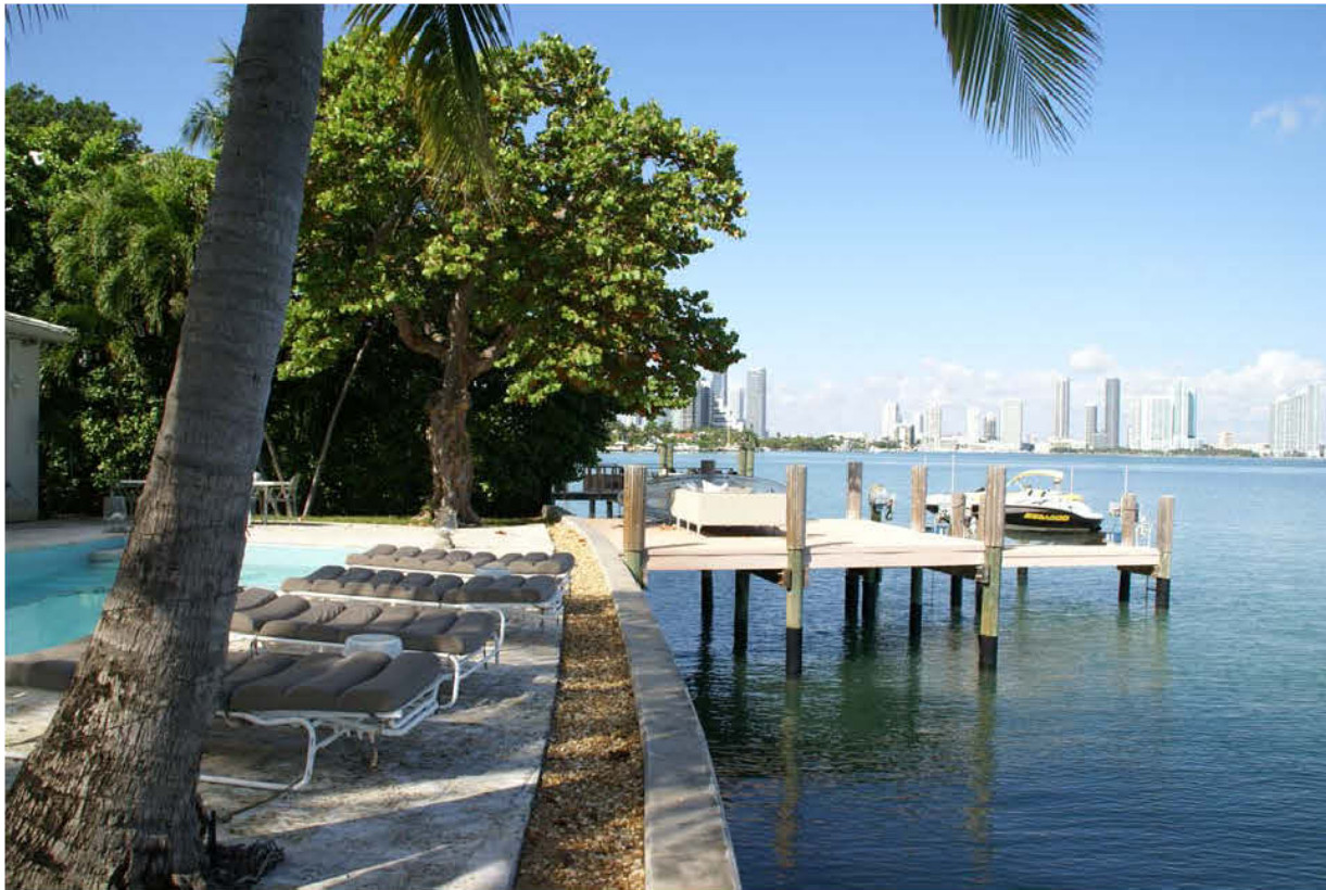
EXISTING DOCK AT WATERFRONT