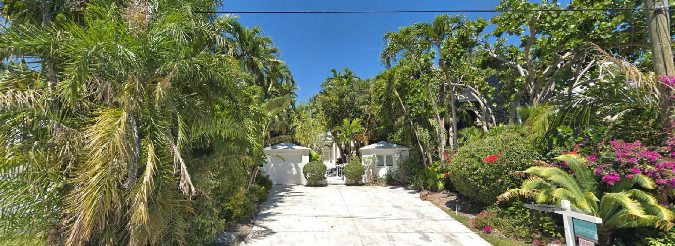
FRONT VIEW - EXISTING RESIDENCE