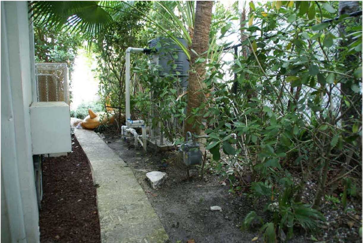
EXISTING RESIDENCE - EAST INTERIOR SIDE YARD