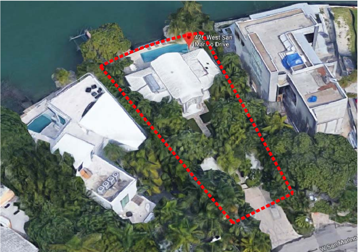
AERIAL VIEW - EXISTING RESIDENCE