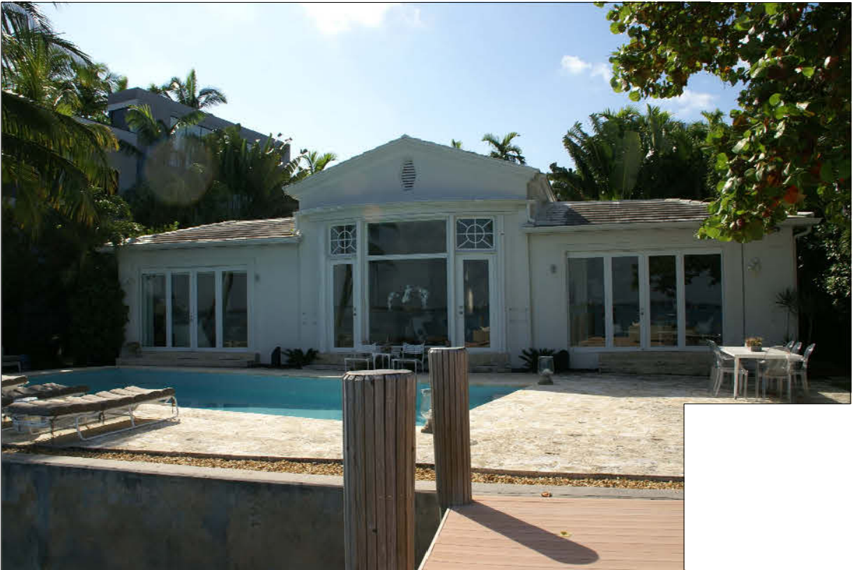
EXISTING RESIDENCE - MAIN BUILDING REAR