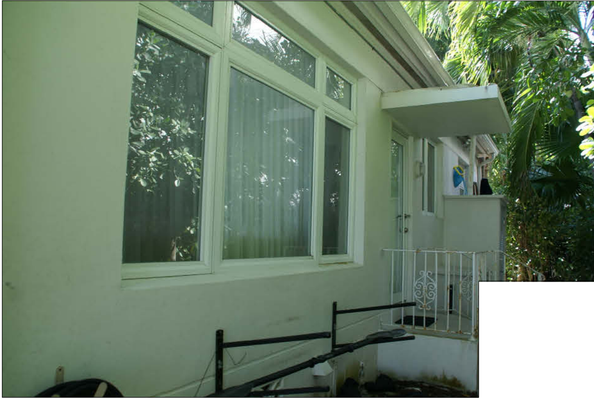
EXISTING RESIDENCE - WEST INTERIOR SIDE YARD