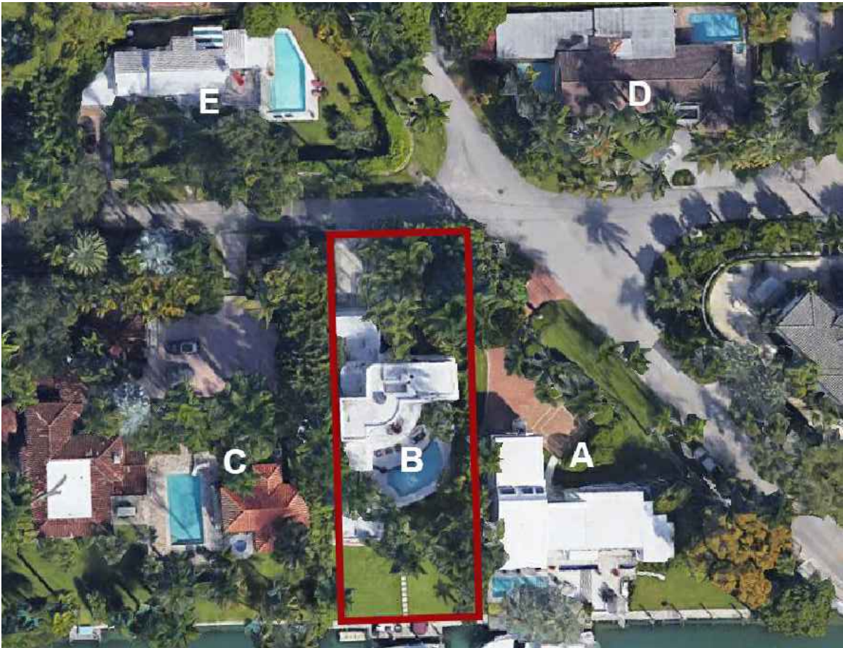
CONTEXT PHOTOS KEY