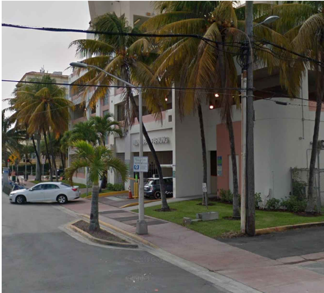
EXISTING SIDE VIEW SCALE: NOT TO SCALE 1