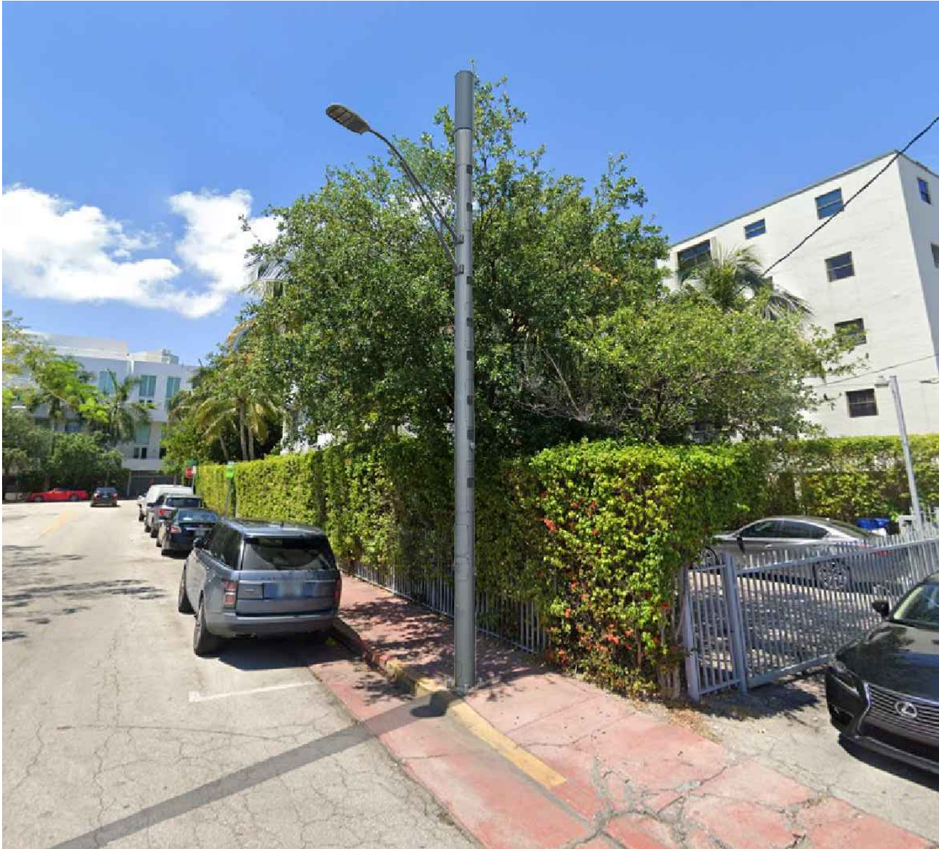
PROPOSED SIDE VIEW 2 SCALE: NOT TO SCALE