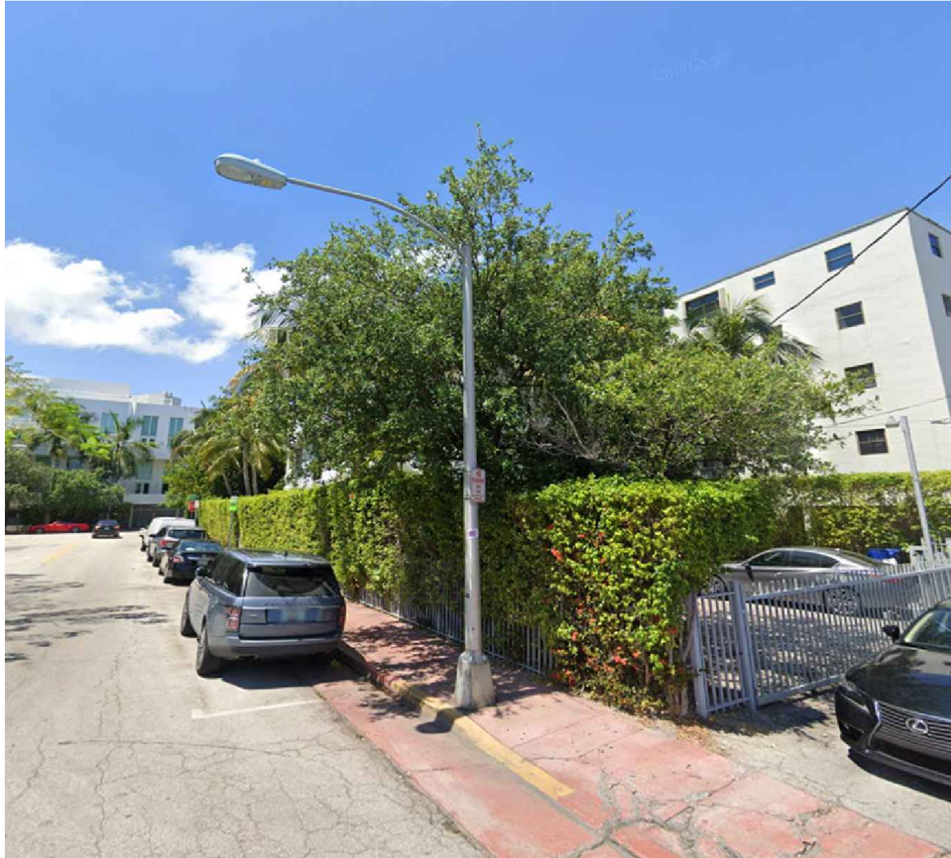
EXISTING SIDE VIEW 1 SCALE: NOT TO SCALE