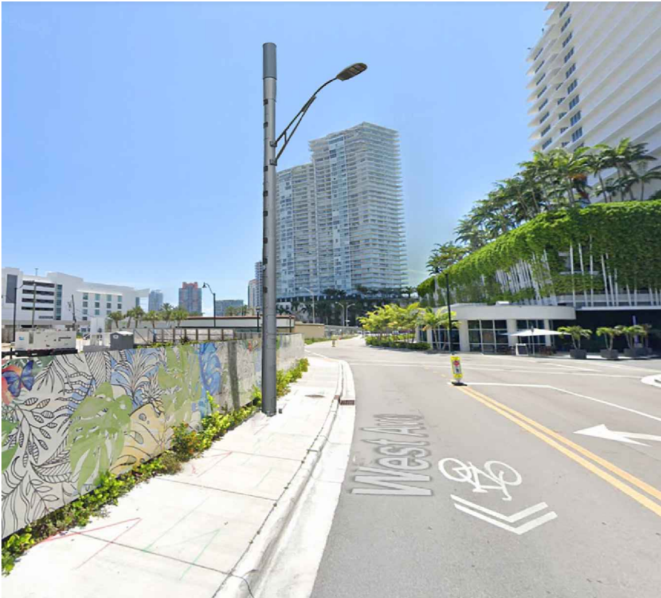
PROPOSED SIDE VIEW SCALE: NOT TO SCALE