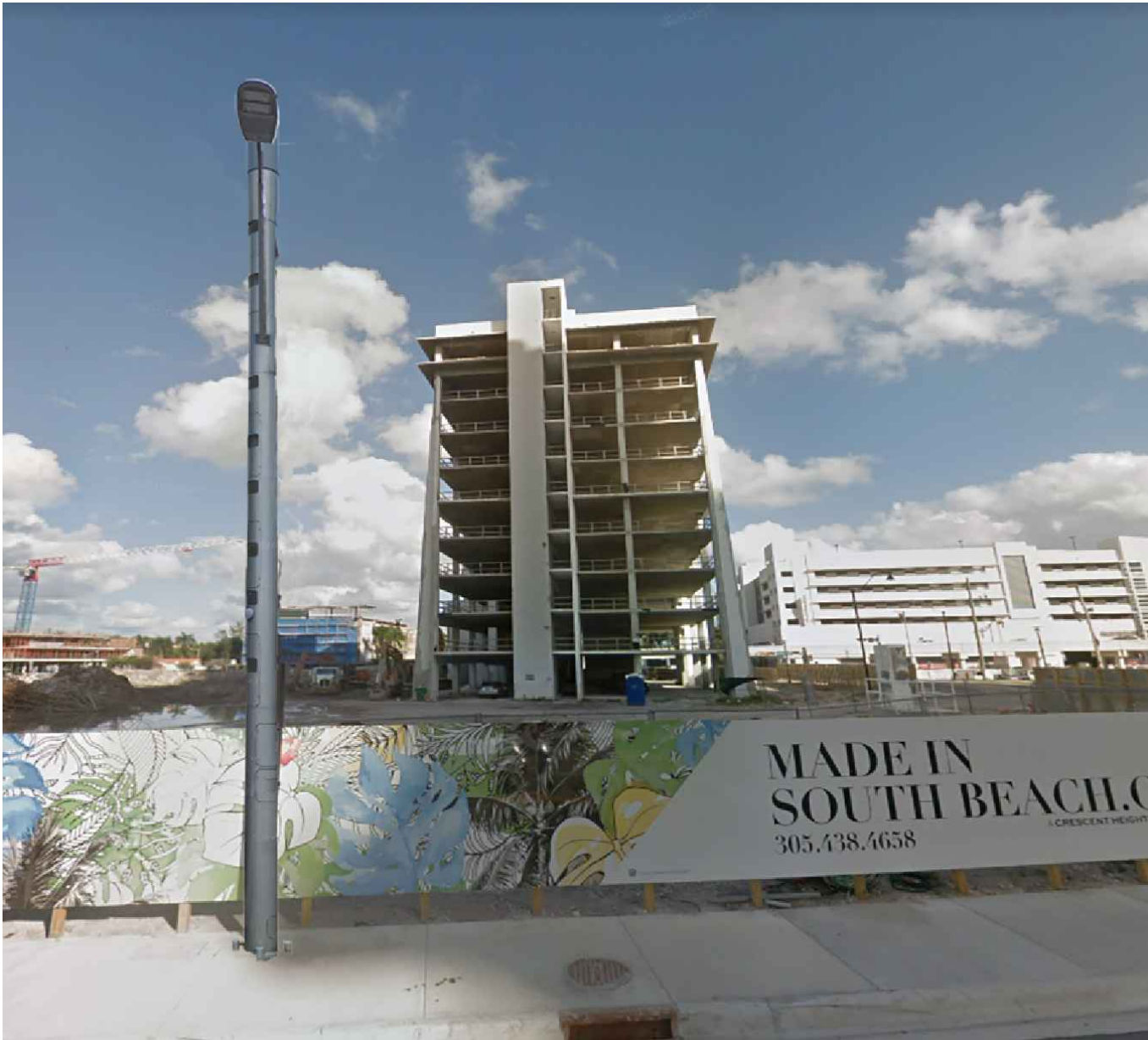
PROPOSED FRONT VIEW SCALE: NOT TO SCALE