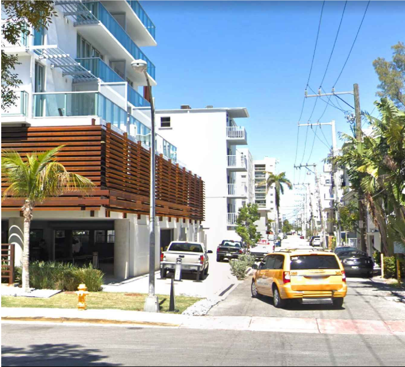
EXISTING FRONT VIEW SCALE: NOT TO SCALE