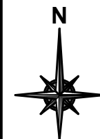
SCALE: 1" = 5'-0" (1" = 2'-6" ON 24"x36" SHEET)