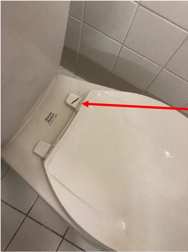
Broken toilet seat