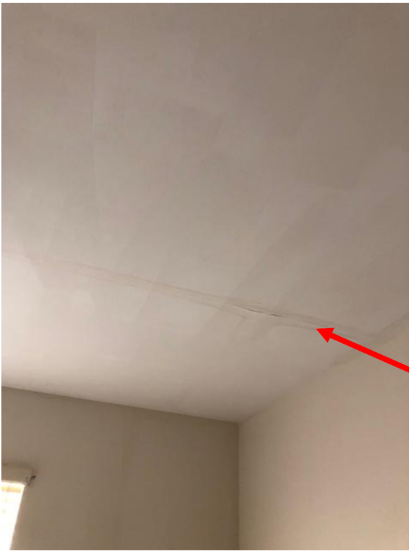
Water damage; stains; dry wall seams exposed