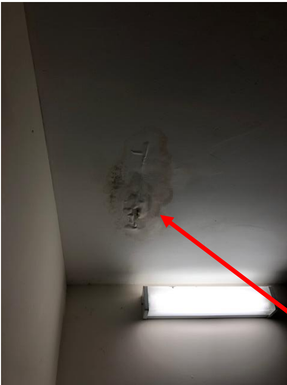
Water damage; stains; possible mold