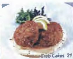
Crab Cakes 21