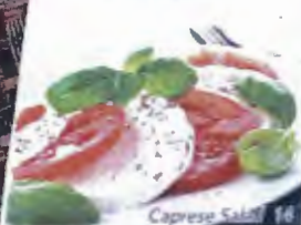
Caprese Salad 16