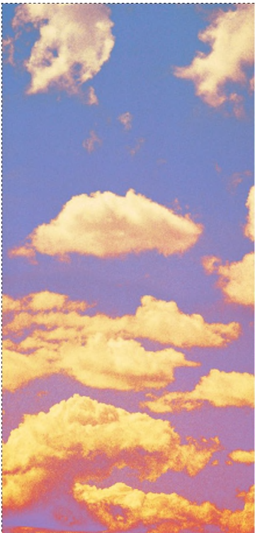
image for north and east facades