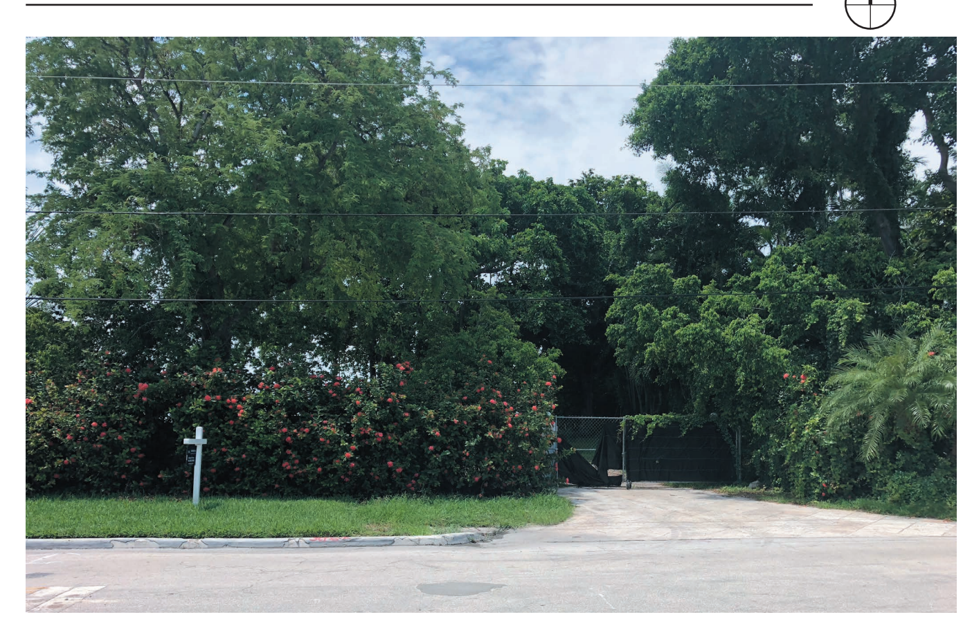
STREET VIEW - 5860 N BAY RD