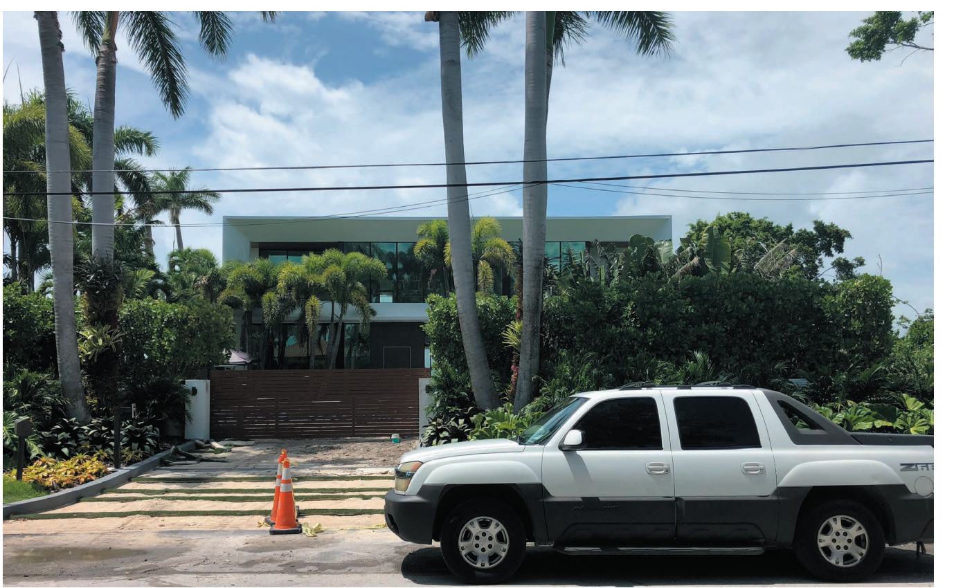
6 STREET VIEW - ADJACENT PROPERTY