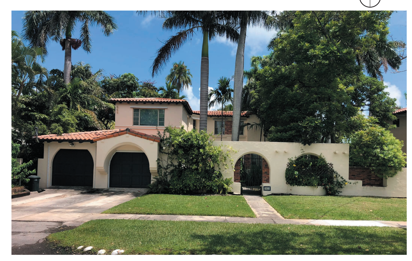
STREET VIEW - ADJACENT PROPERTY