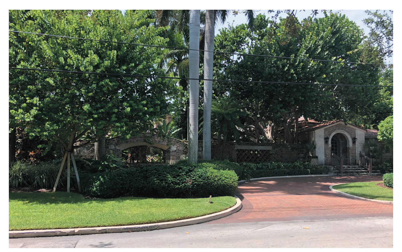
STREET VIEW - ADJACENT PROPERTY