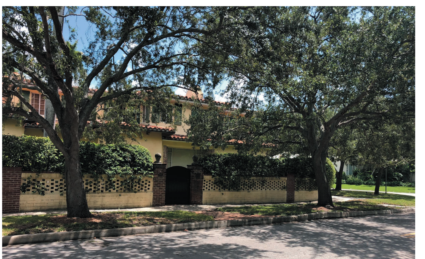
STREET VIEW - ADJACENT PROPERTY