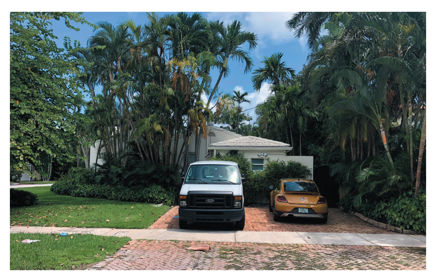
STREET VIEW - ADJACENT PROPERTY